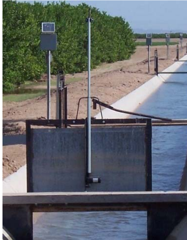
Figure 3. Actuator on Ditch Check Gate with Field Turnouts in Background

selected due to the small difference in cost. These actuators operate at a speed of 1.0 cm/s at 5 amps at full load, and 1.3 cm/s at no load.