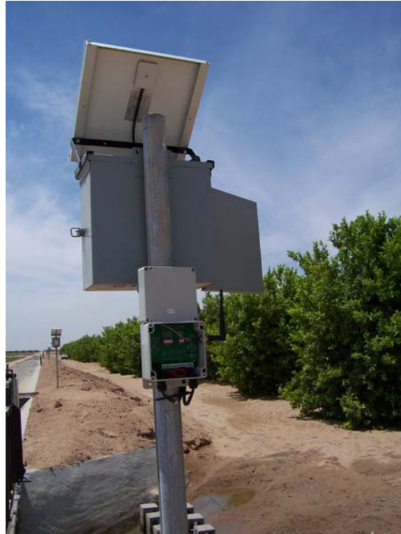
Figure 2. Cut-off distance radio transmitter in field and transceiver at turnout

is a perforated section that encloses a magnetic float switch. The transmitter pole is held upright by a steel brace that can be placed by stepping on the brace with foot pressure. In this way, the transmitters can be easily moved or moved out of the way to perform tillage operations. Each transmitter is programmed with a specific frequency. There are 128 selectable digital addresses and 8 selectable frequencies with this model of radio. The range is 366 m, but the range can be doubled with some modification. When the advancing front of water reaches the float switch, the radio transmits a signal to the transceiver at the turnout gate to switch a relay and shut the gate. At the same time a signal is transmitted to the next gate in line to open.