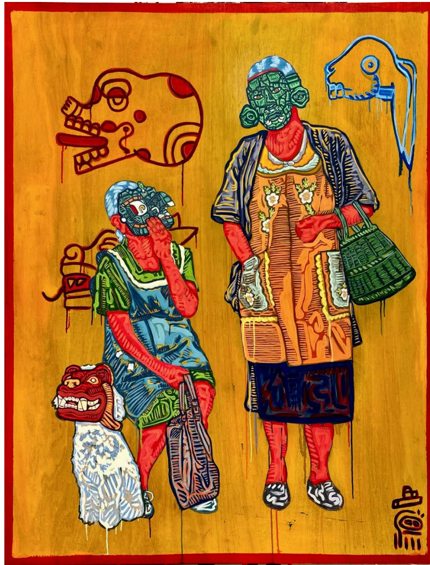
Figure 1: La Dignidad de lo Simple