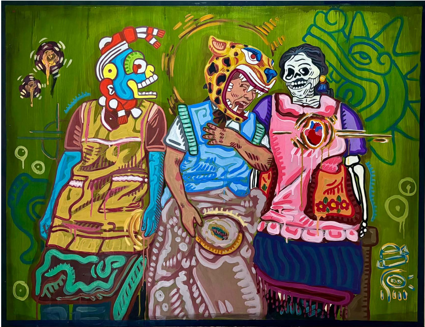
Figure 8: No Seas Metiche