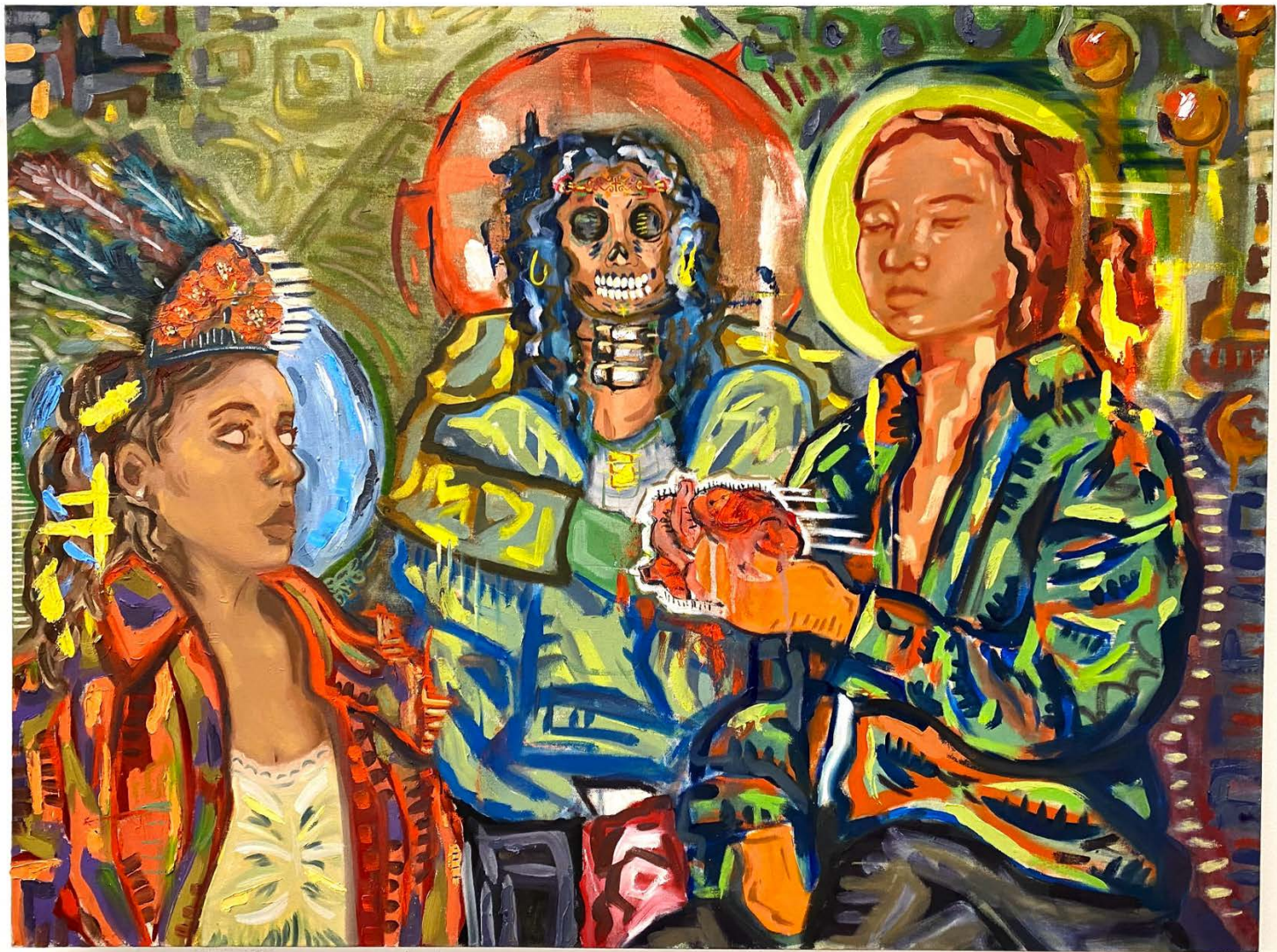
Figure 12: El Corazón Mío