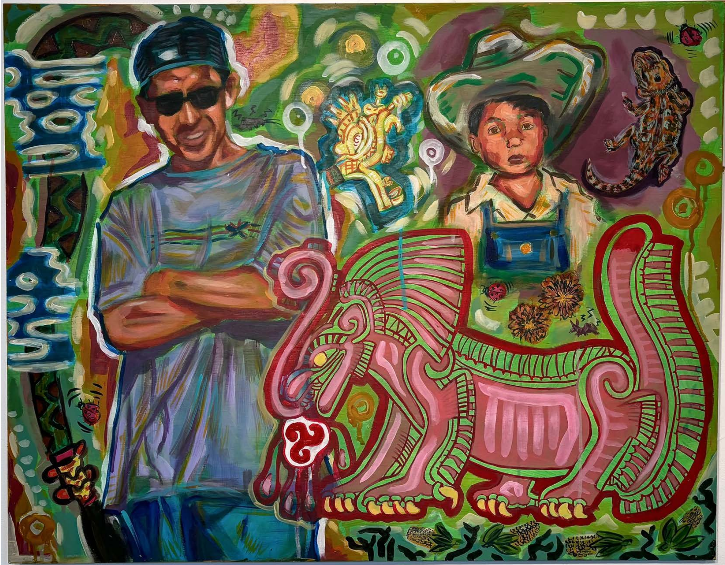
Figure 3: Mi Padre El Sol, El Corazon Del Jaguar