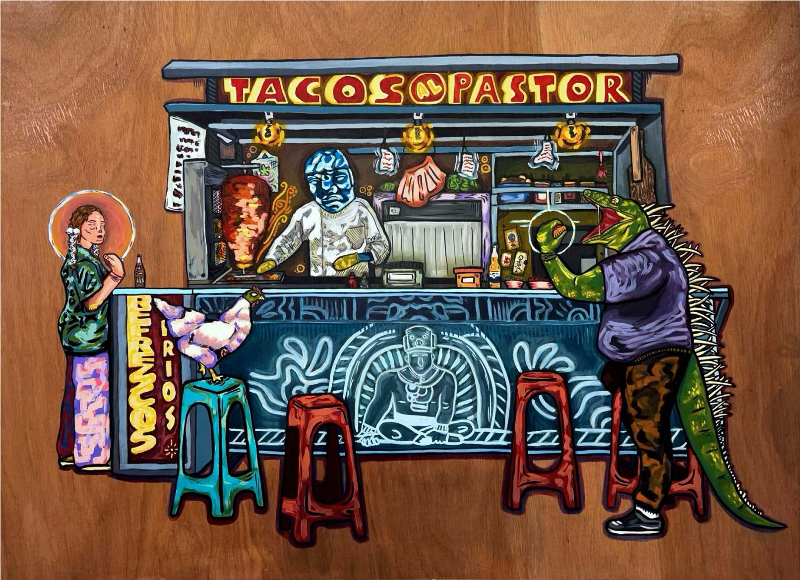
Figure 2: De Dónde Te Conozco?