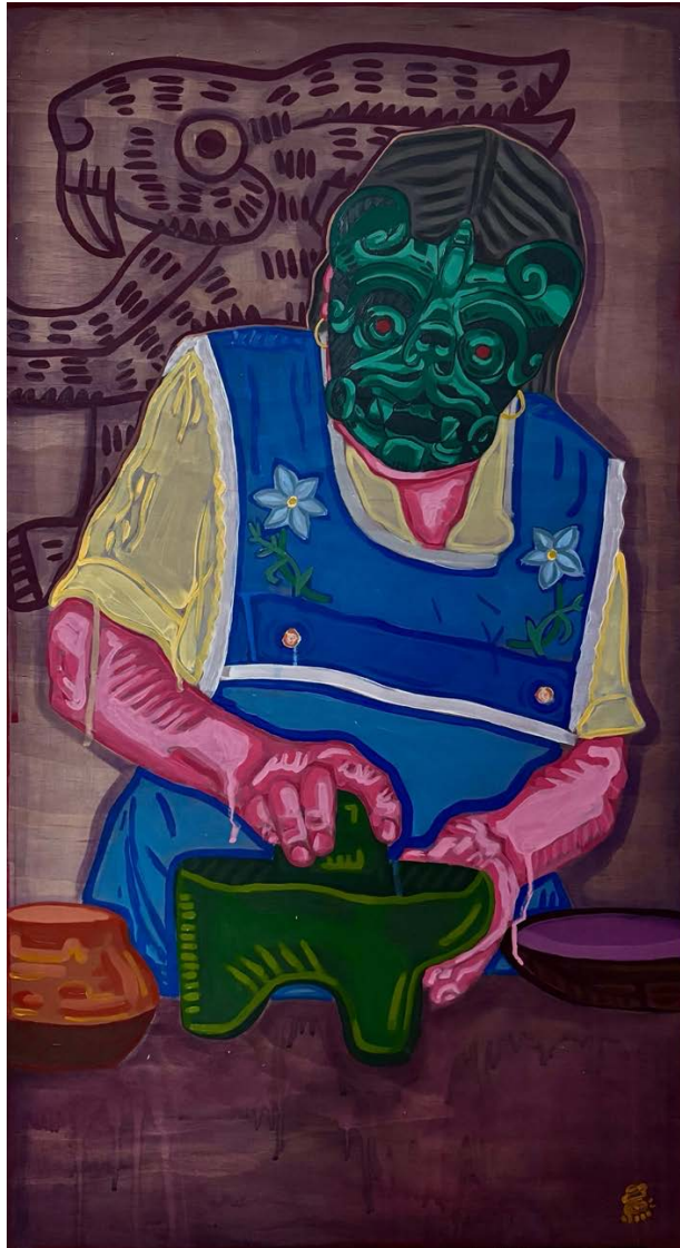
Figure 10: Doña Tzinacantli