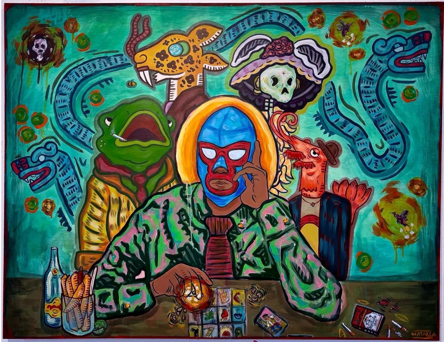
Figure 5: El Luchador