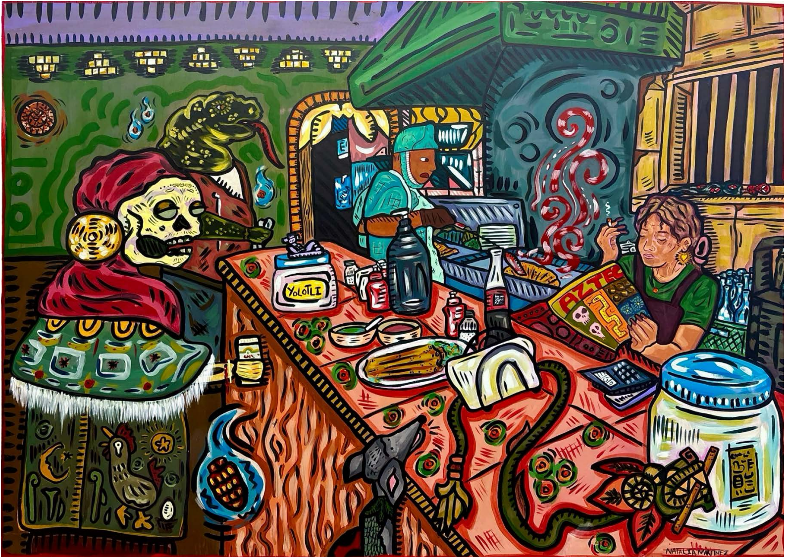
Figure 4: La Pila