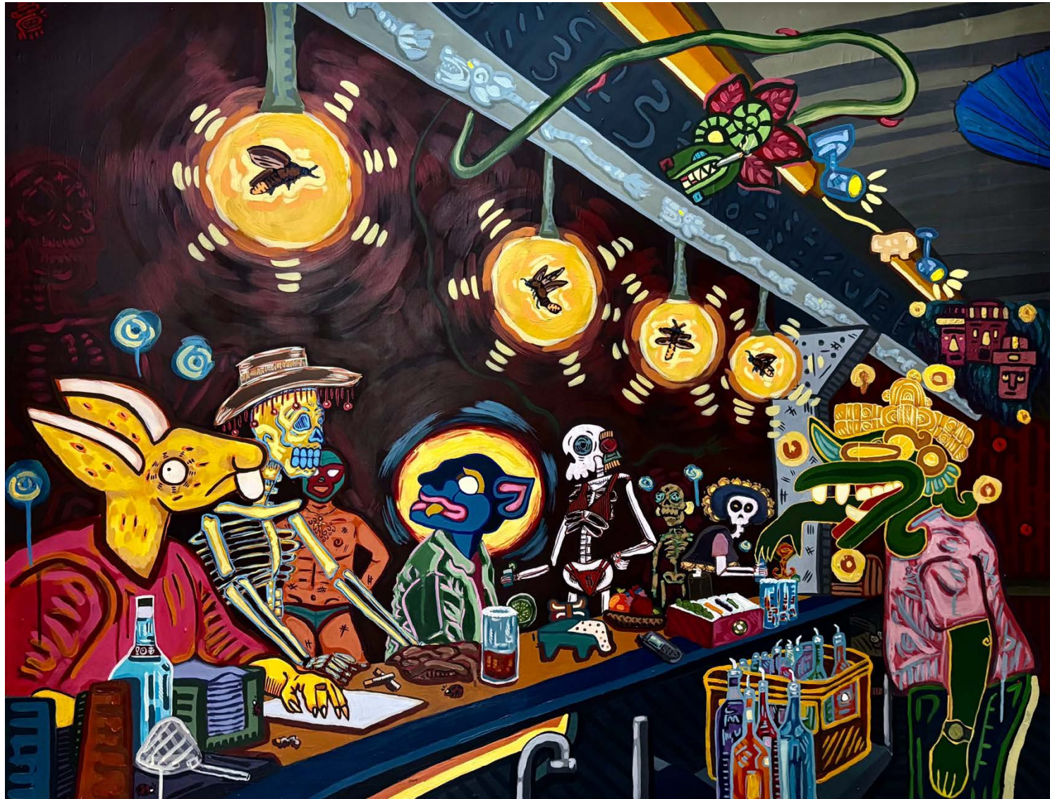
Figure 9: En Algún Lugar