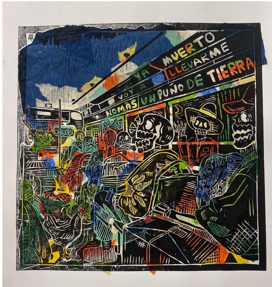
Figure 13: Un Puño De Tierra