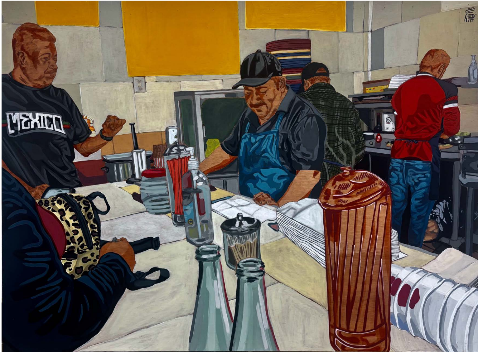
Figure 6: No Te Levantes Honey