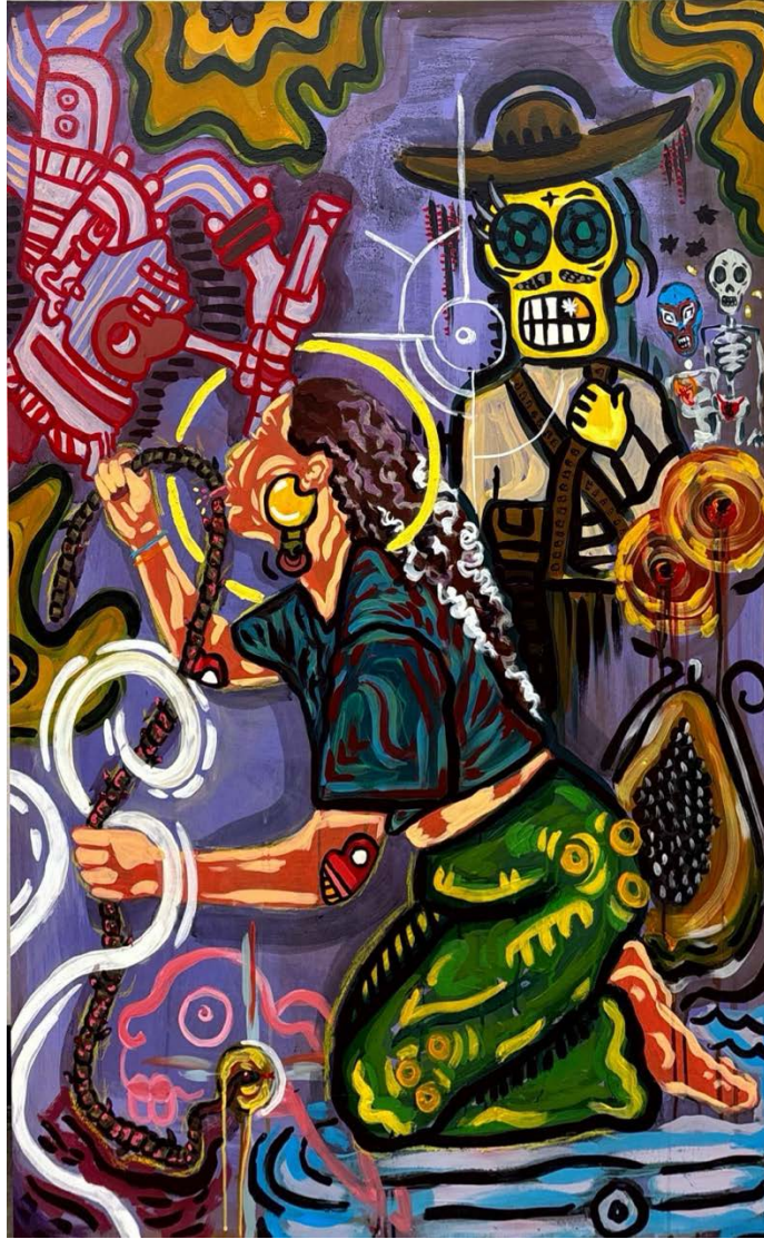
Figure 7: Intertwined