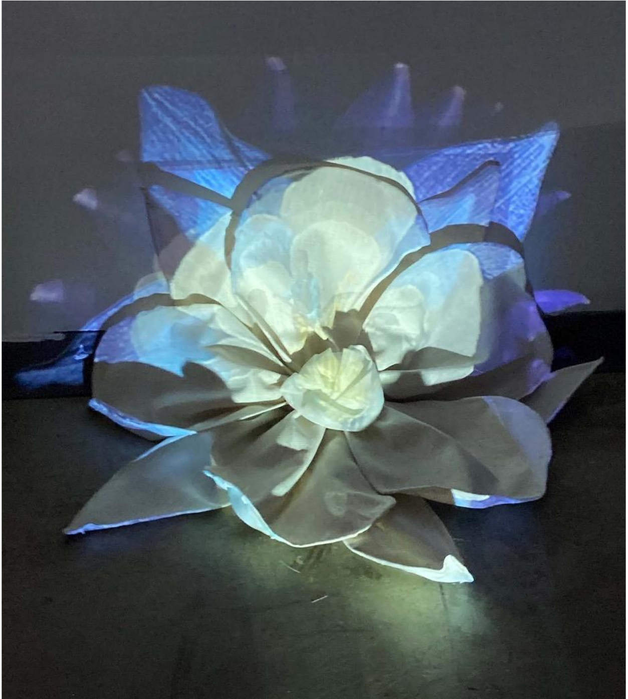
Figure 4: Detail #3