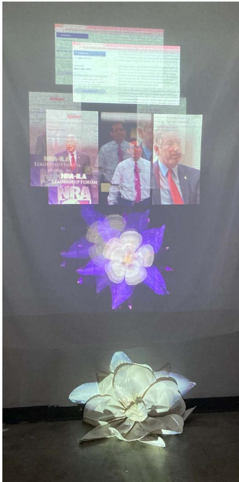
Figure 1: Contaminated