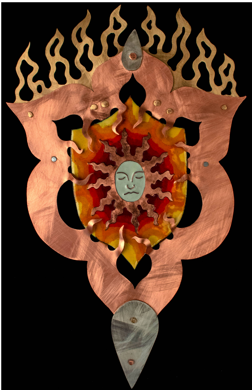
Figure 4: Warmest welcomes to manifestation station