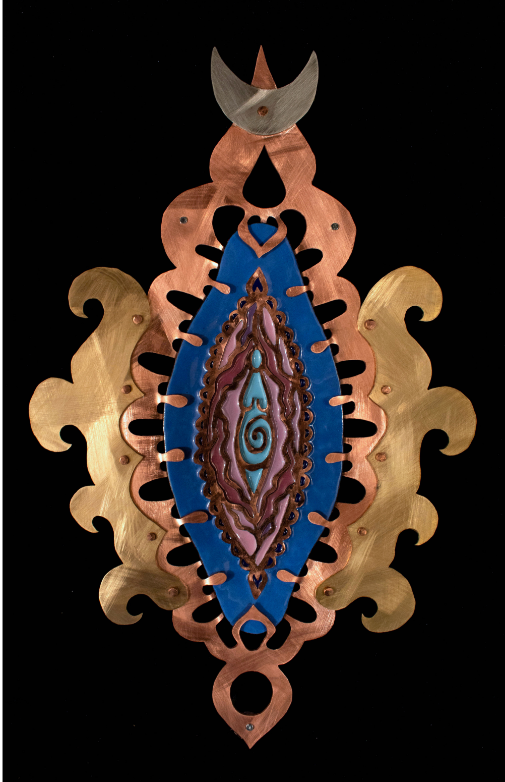
Figure 2: Waking up, among other things