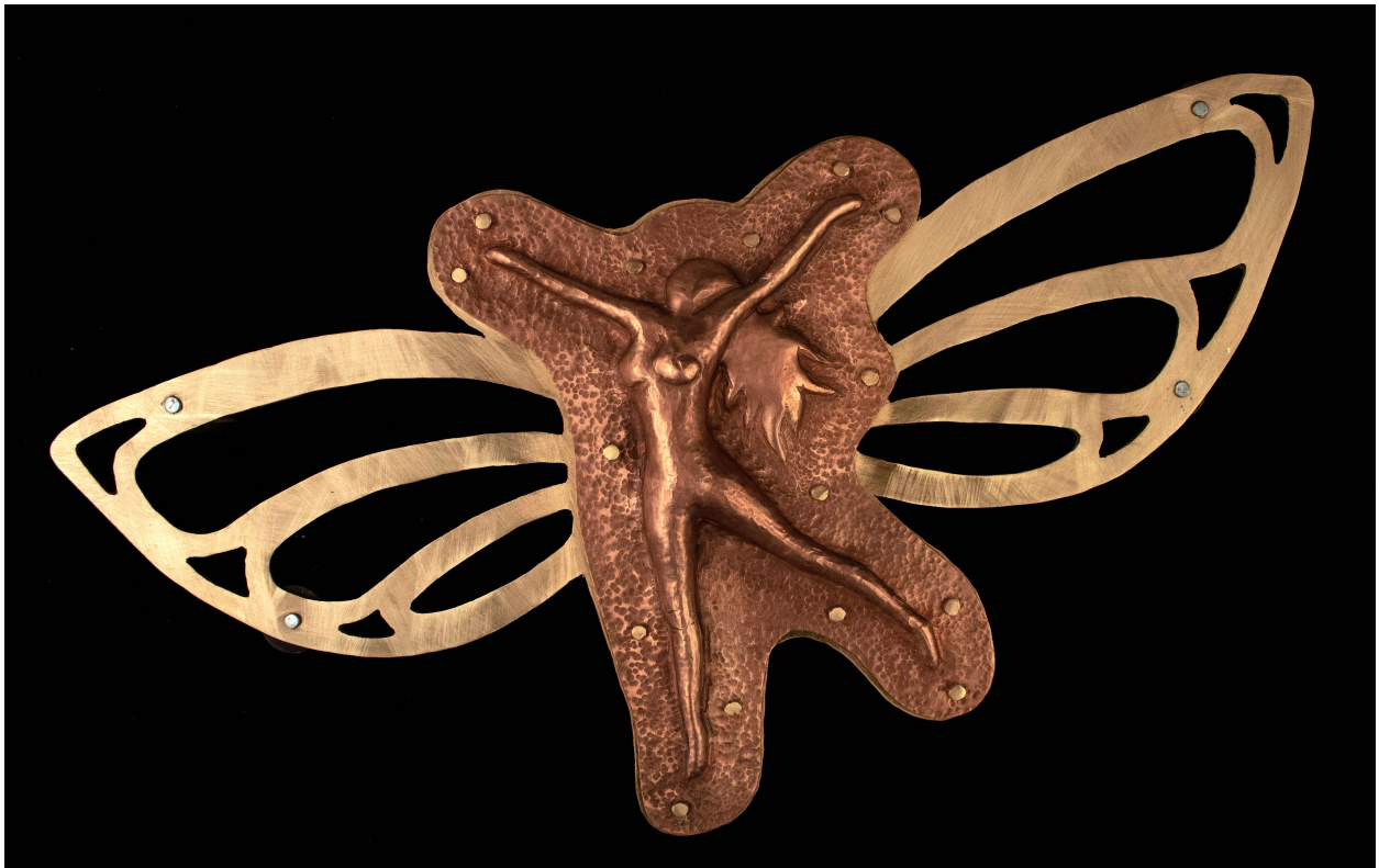
Figure 1: And just like that, she has emerged