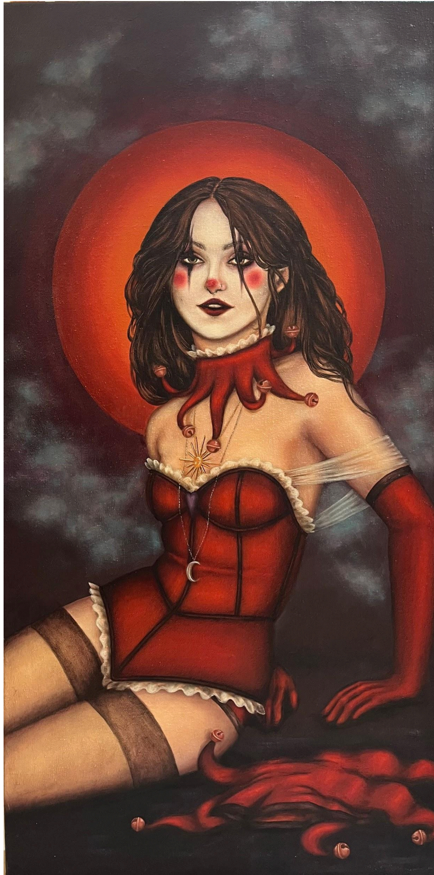
Figure 7: Self Esteem