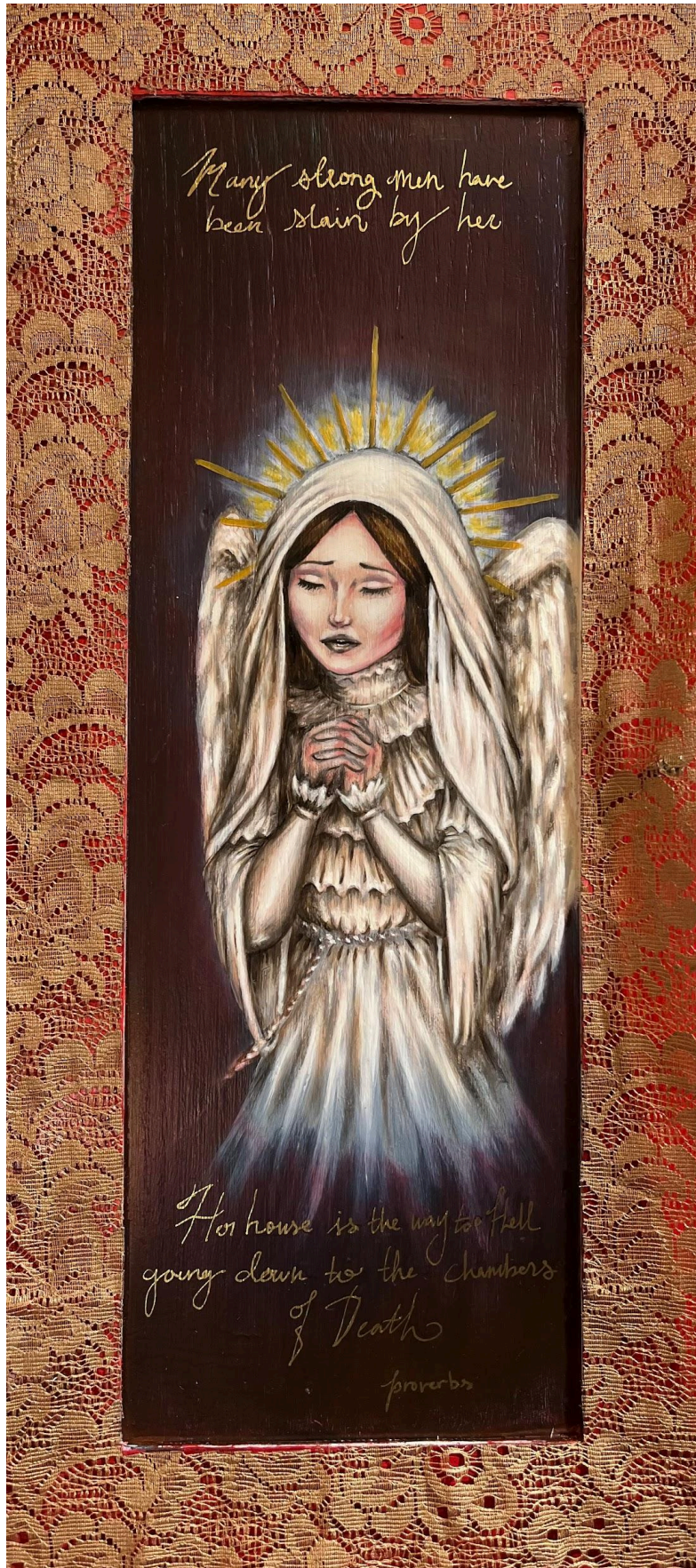
Figure 16: Book of Eve, Angel