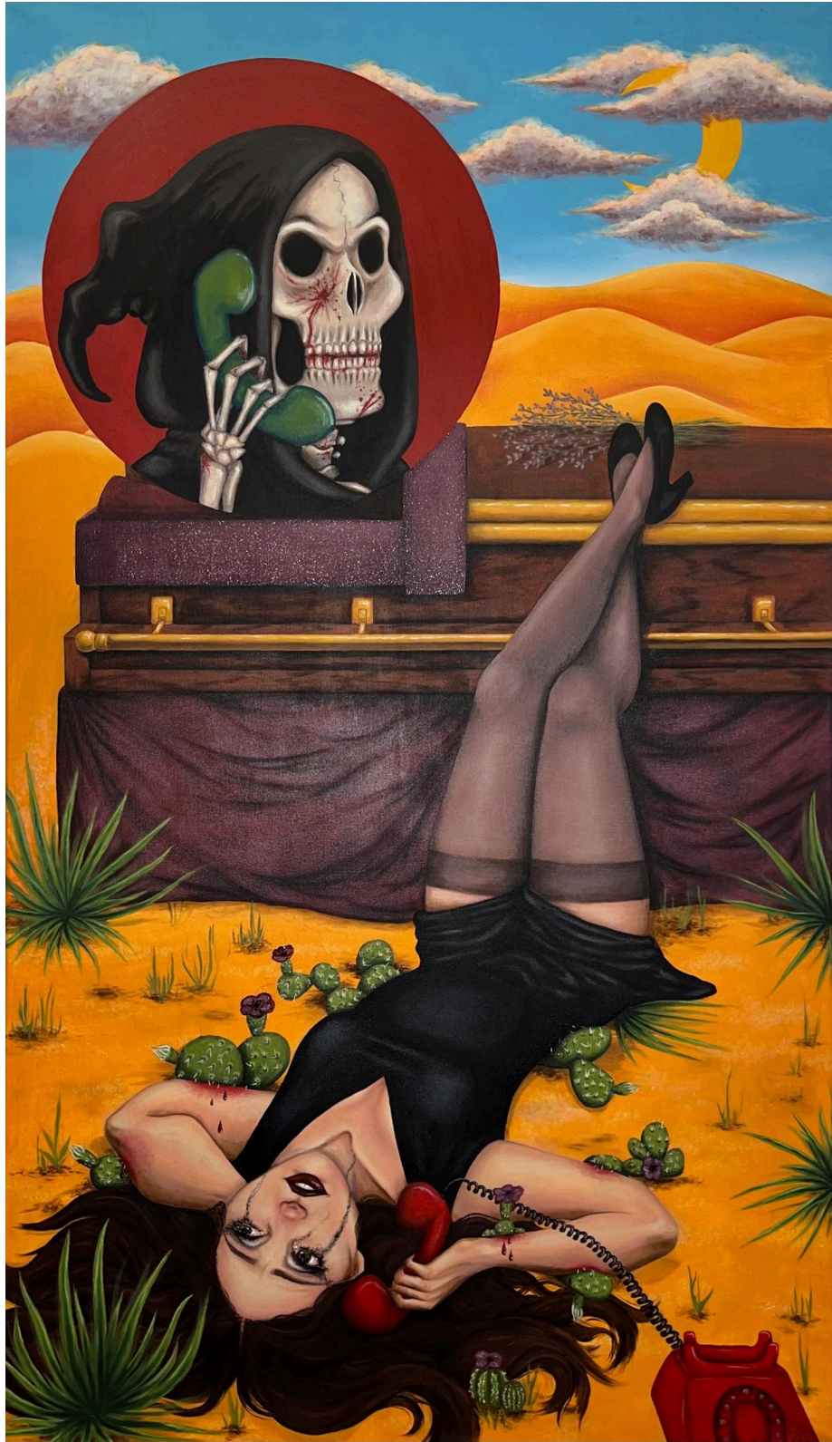
Figure 1: Cruelty