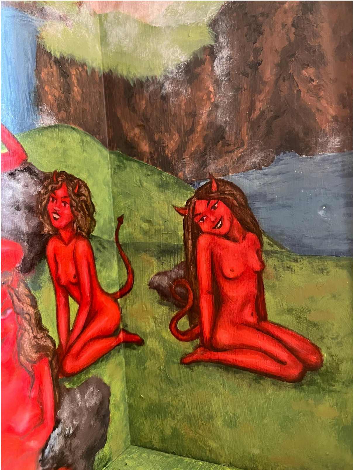
Figure 12: Book of Eve, detail 3