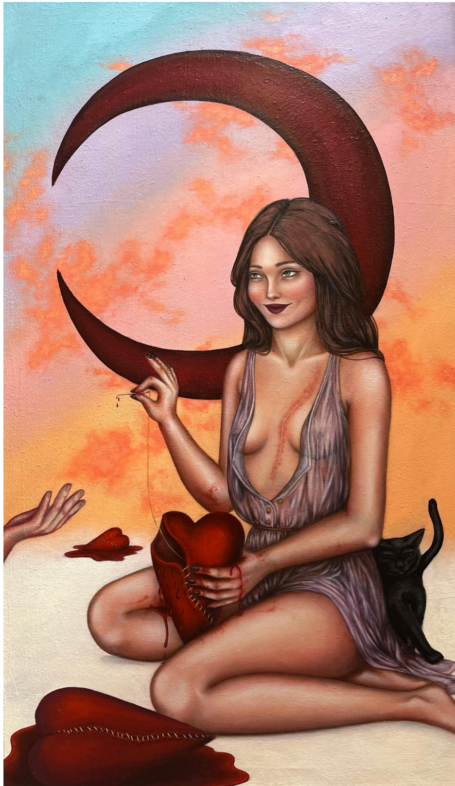
Figure 8: Healer