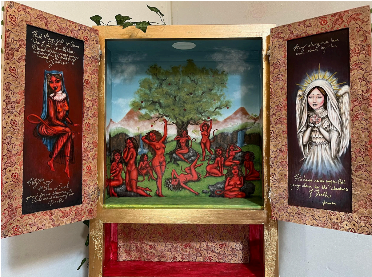
Figure 9: Book of Eve