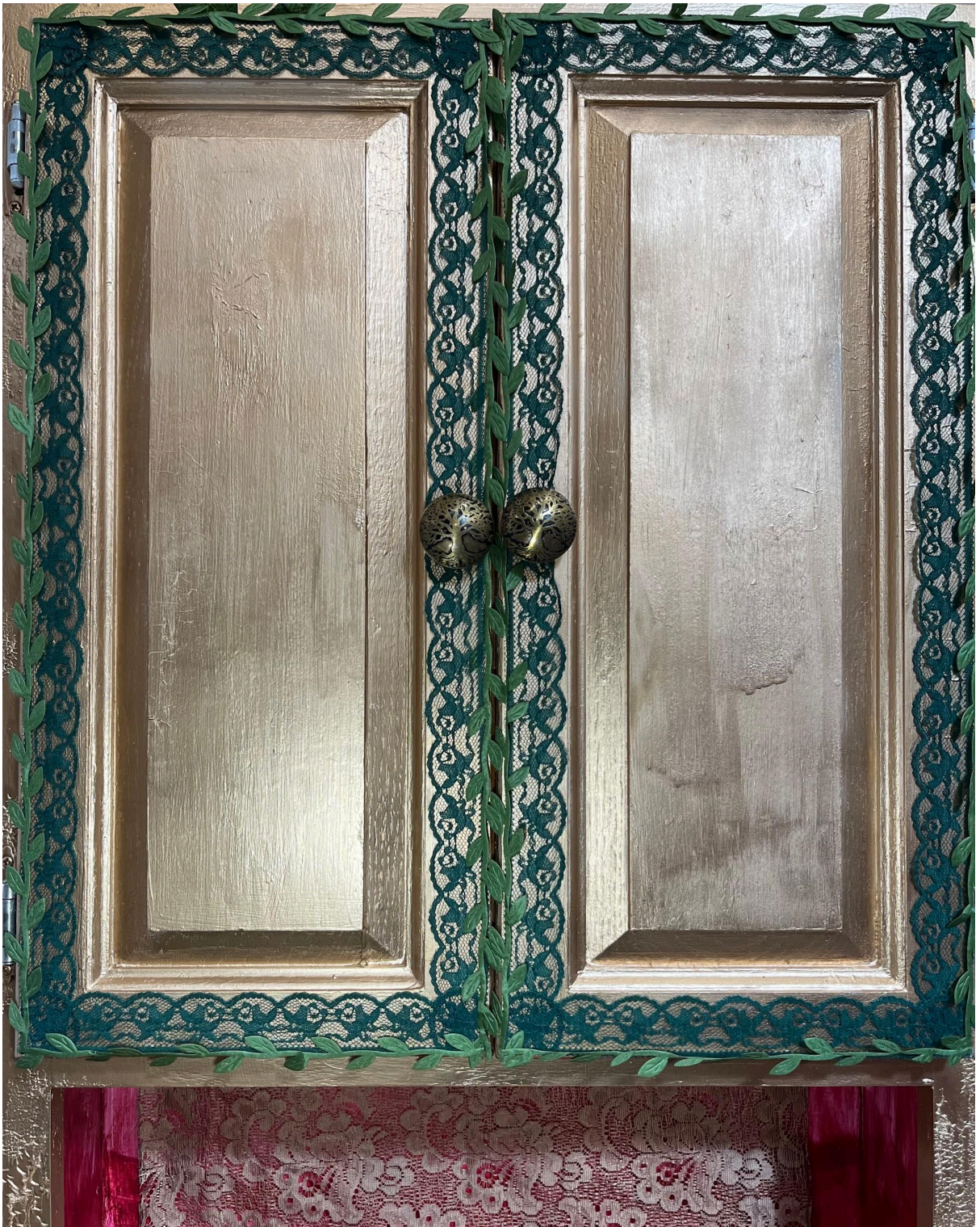
Figure 13: Book of Eve, front