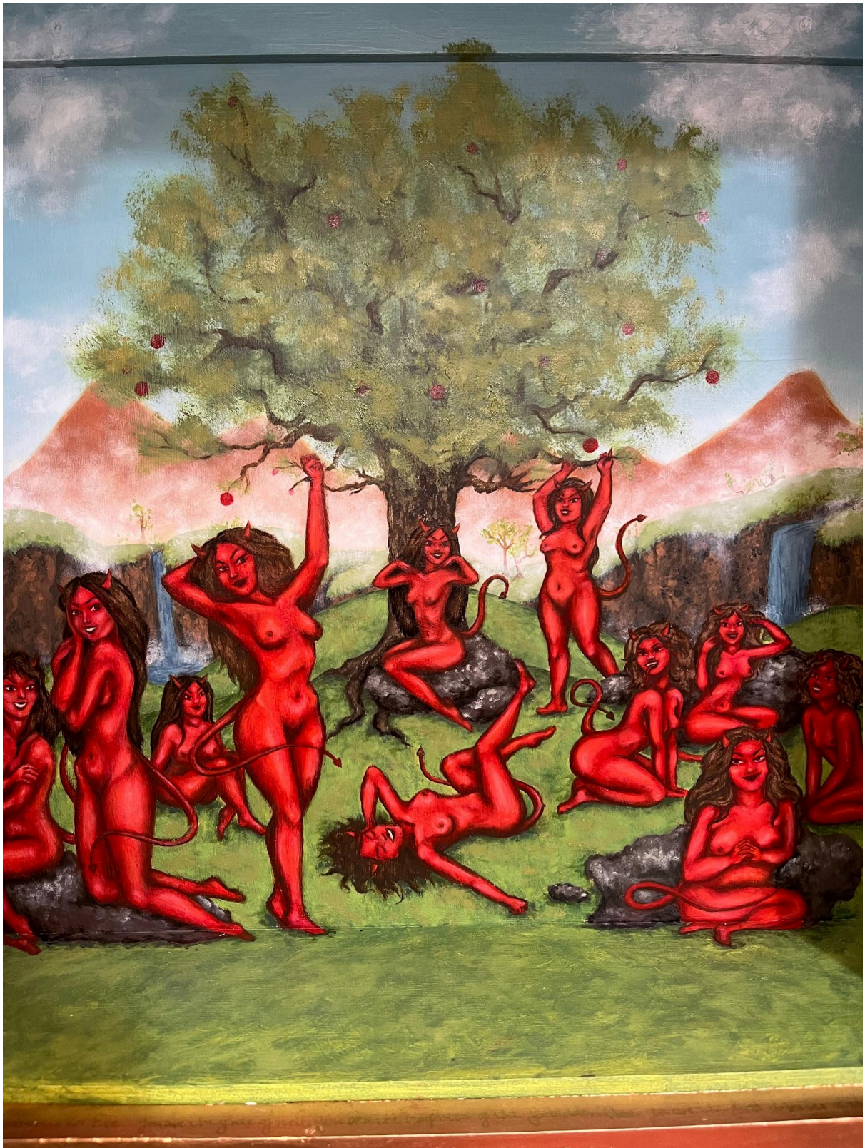
Figure 10: Book of Eve, detail 1