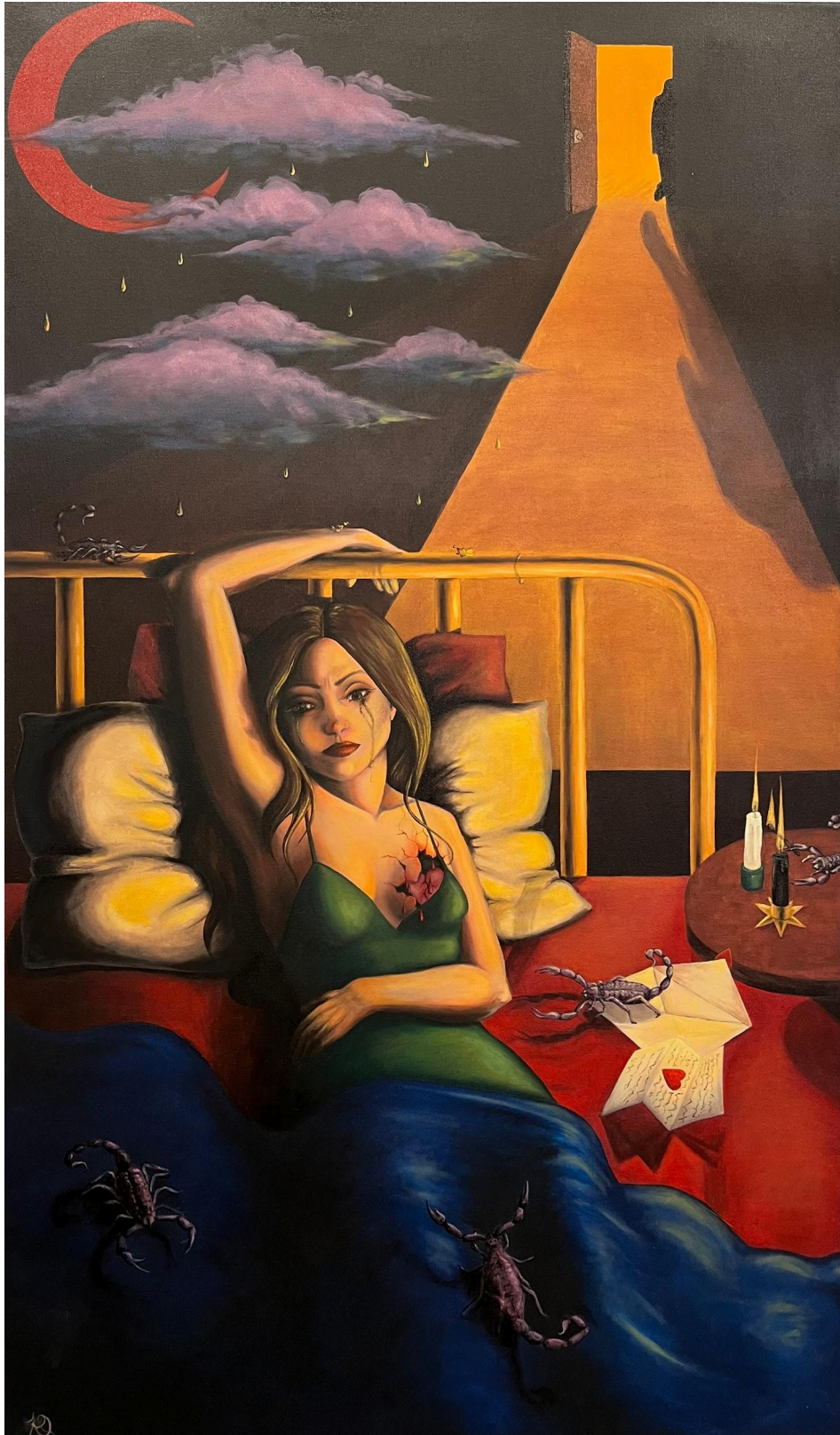
Figure 4: Heartbreak