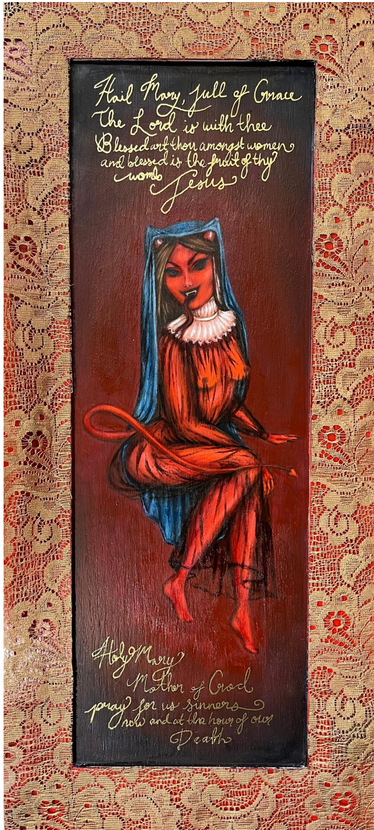
Figure 15: Book of Eve, Mary