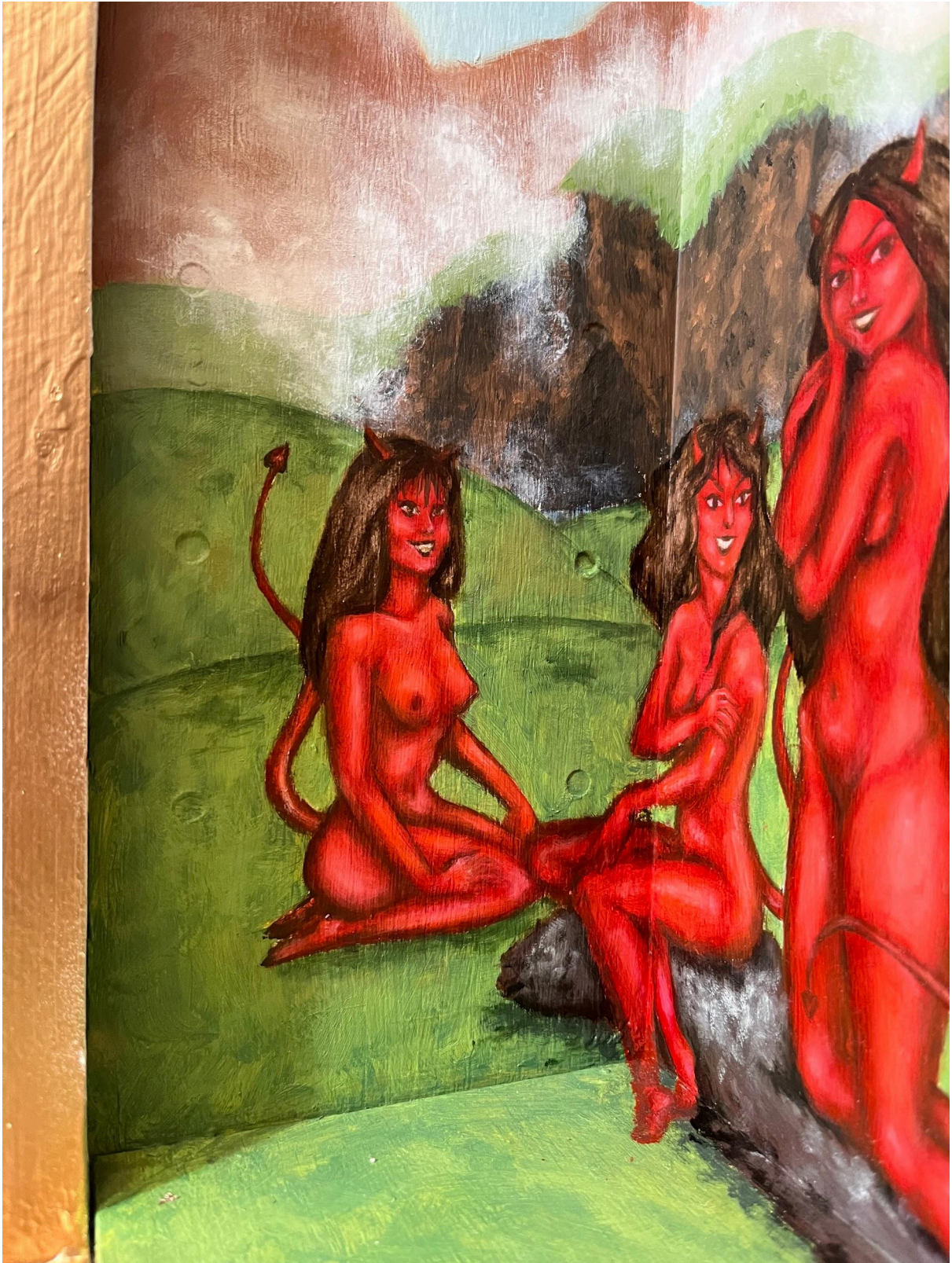
Figure 11: Book of Eve, detail 2