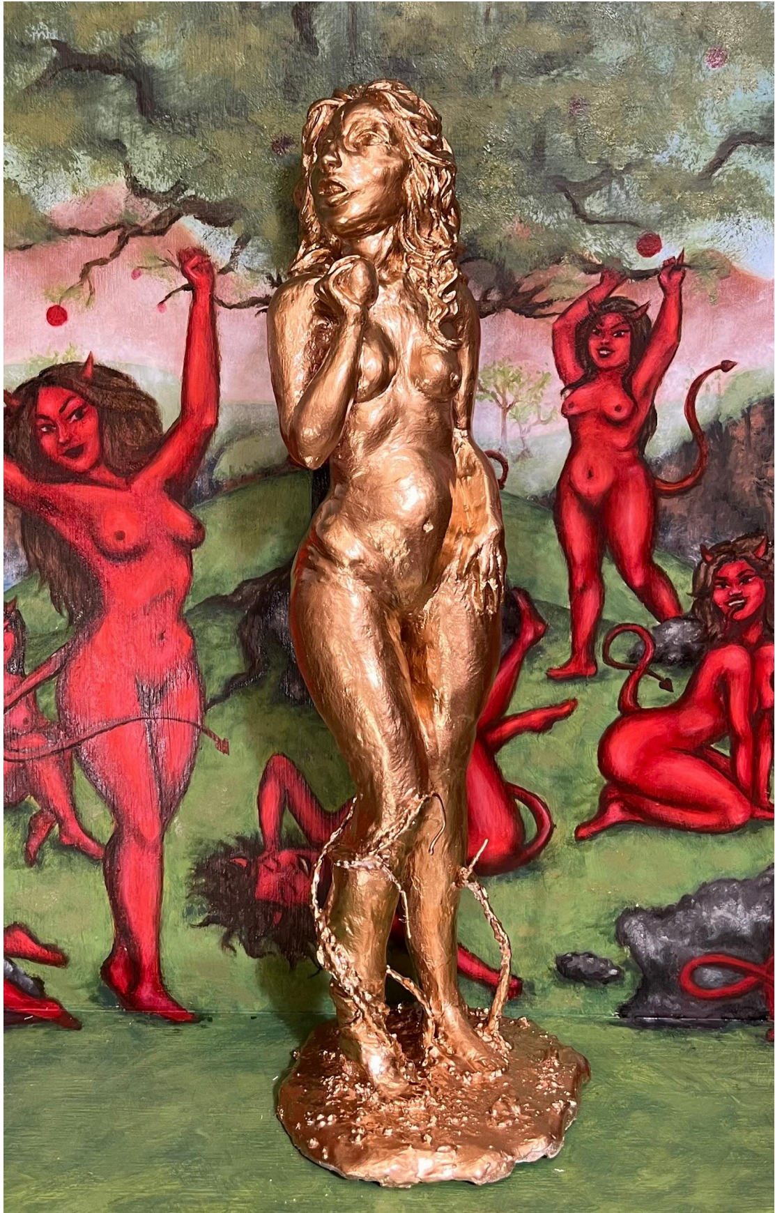
Figure 14: Book of Eve, statue