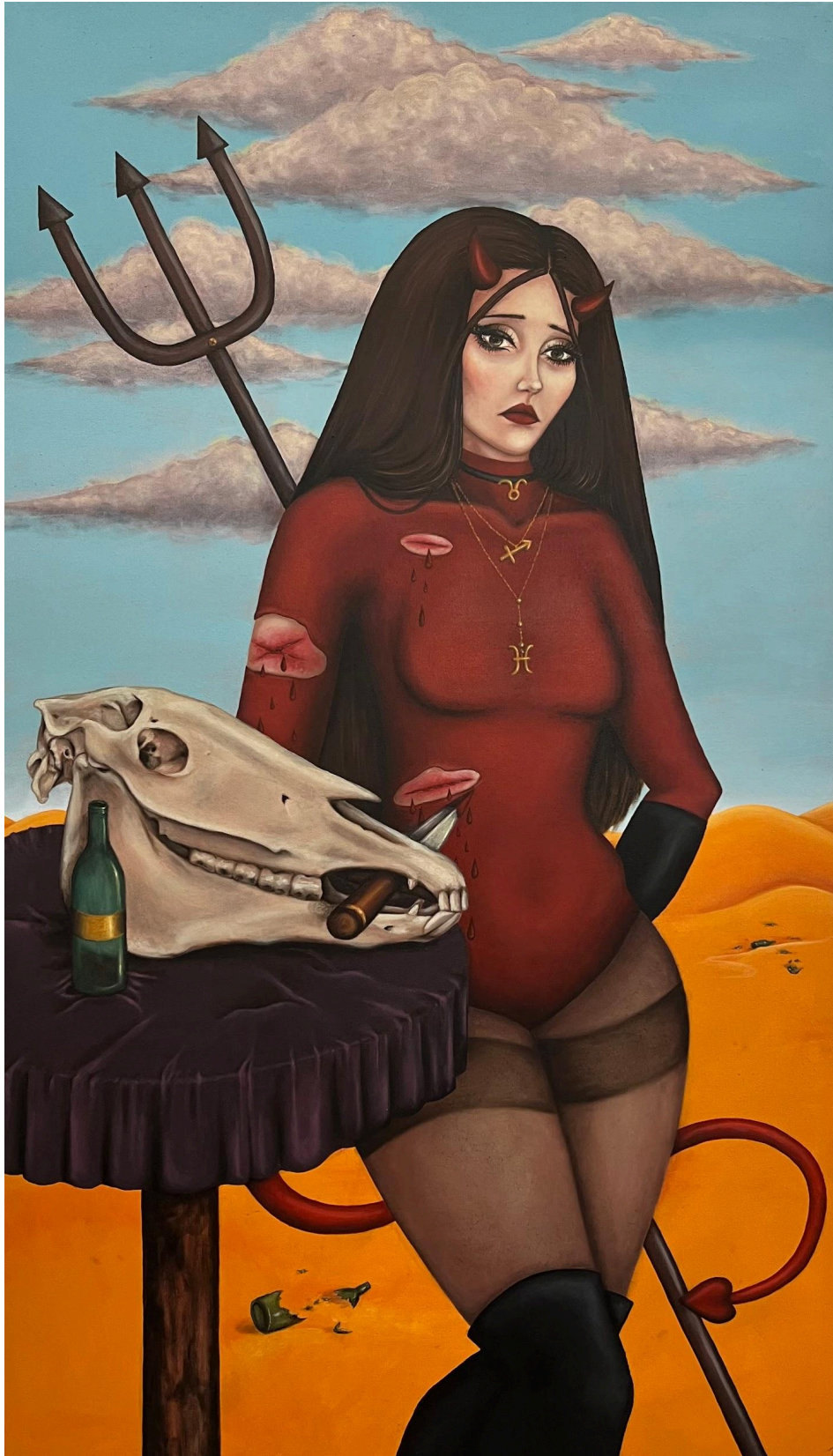
Figure 3: Fear