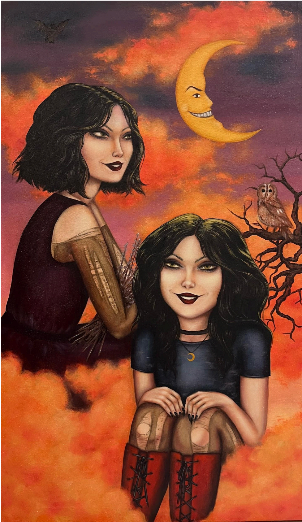
Figure 5: Don't Mind Us...