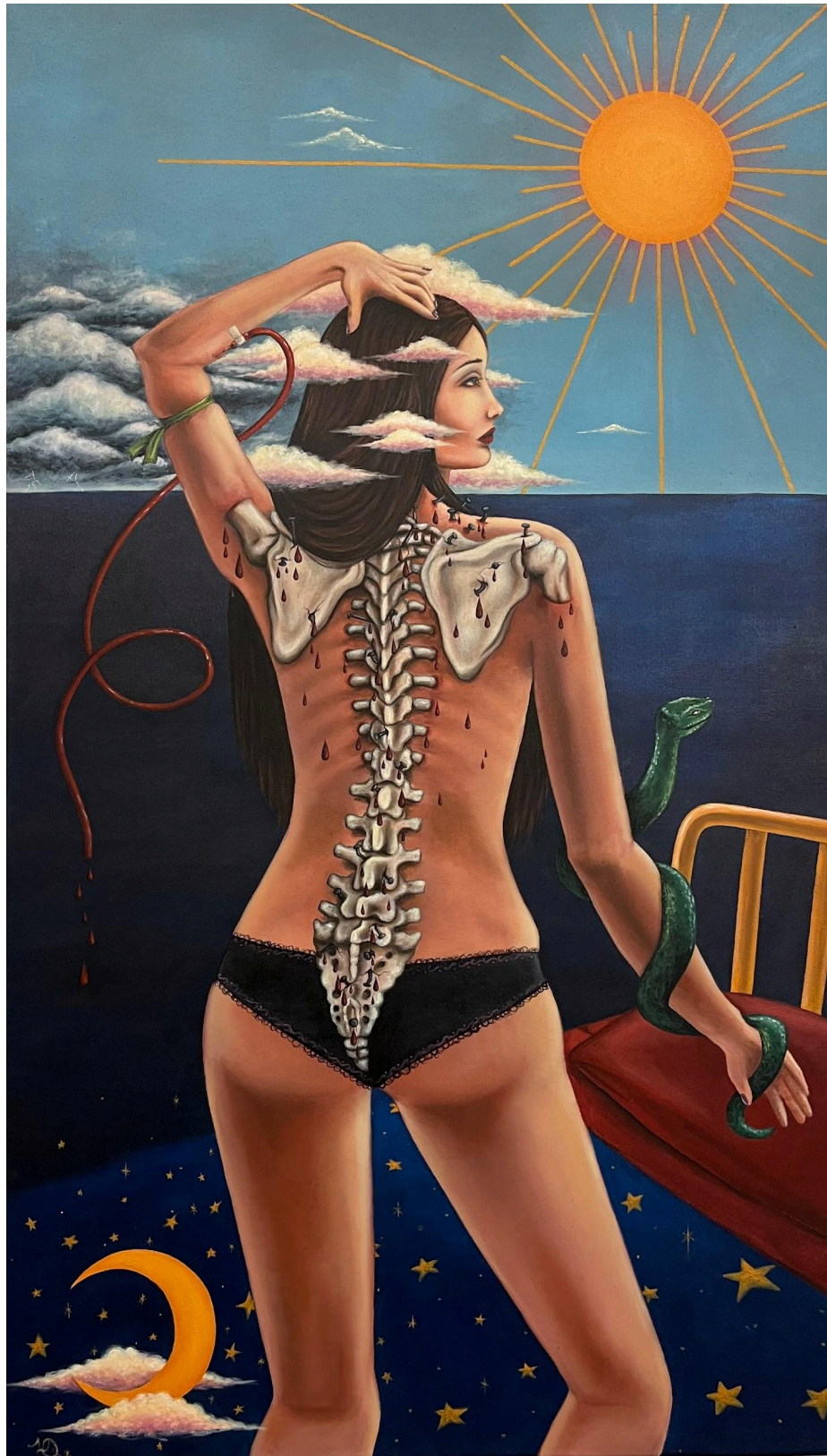
Figure 2: Sickness