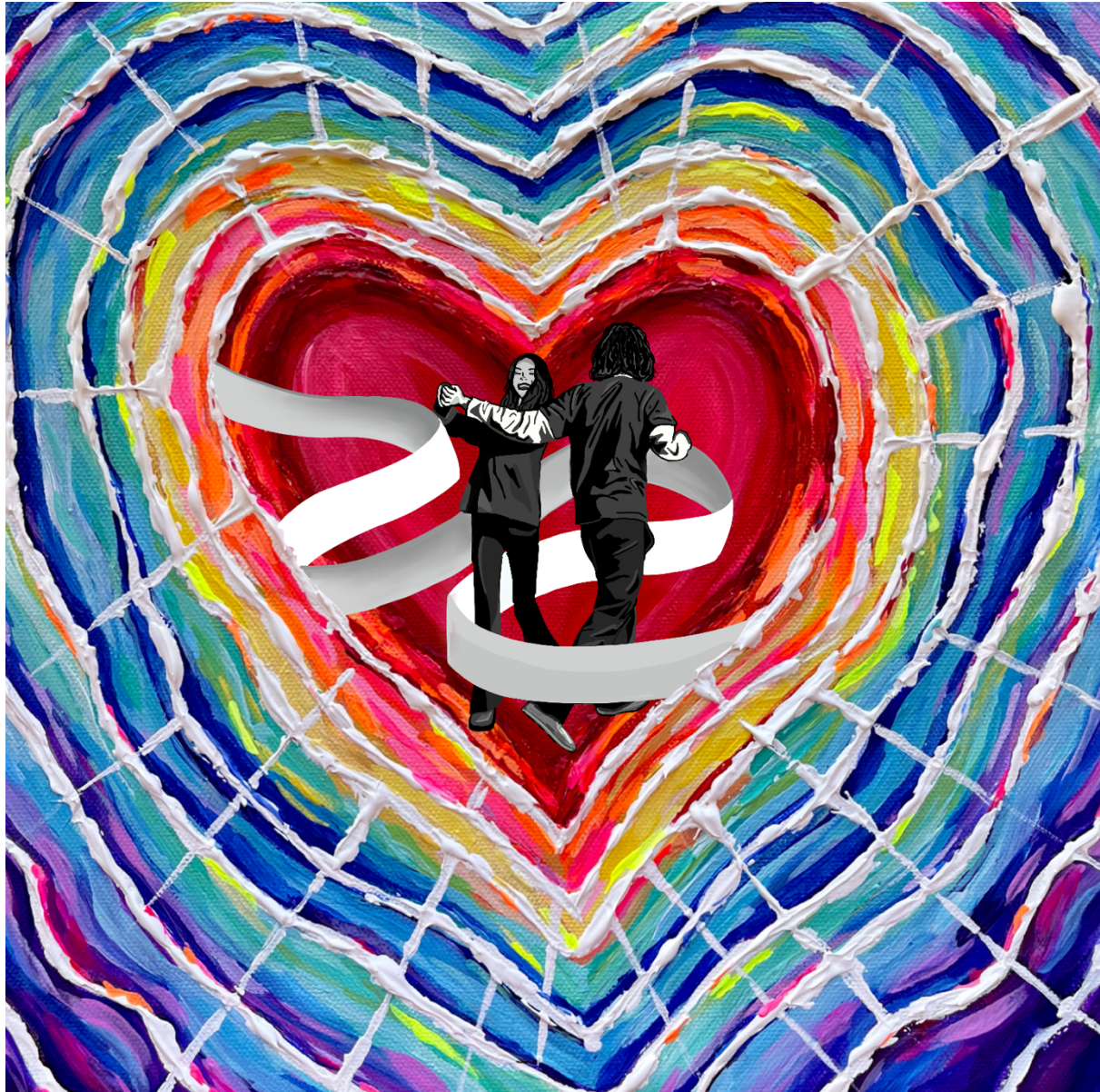
Figure 6: Livin' on a Prayer Calendar Cover