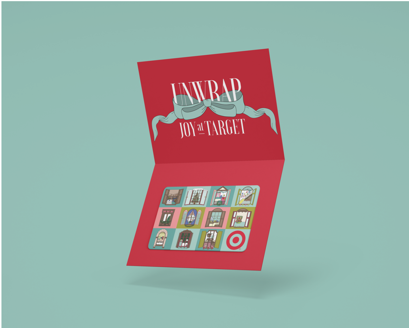
Figure 2: Target Gift Card