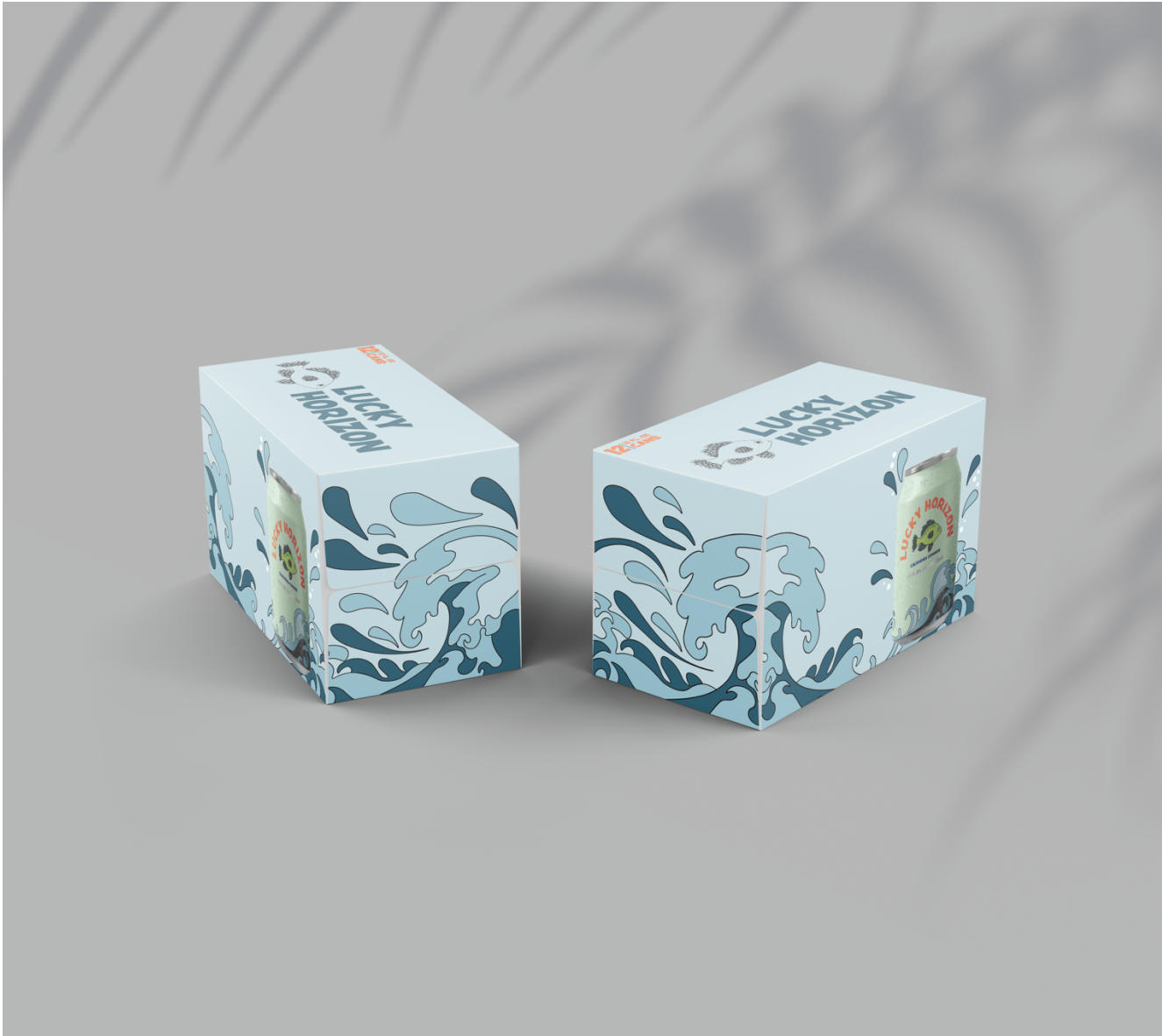
Figure 11: Lucky Horizon Beer Box