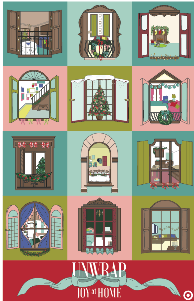
Figure 1: Target Christmas Campaign