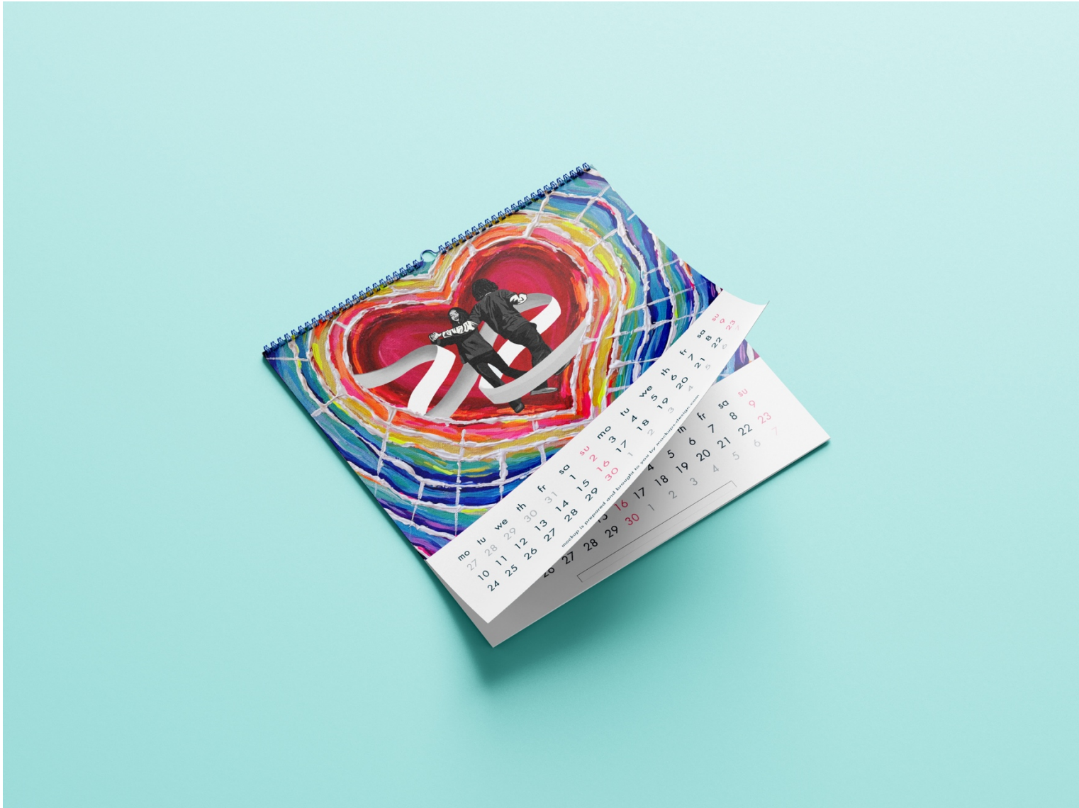
Figure 7: Livin' on a Prayer Calendar Cover Detail