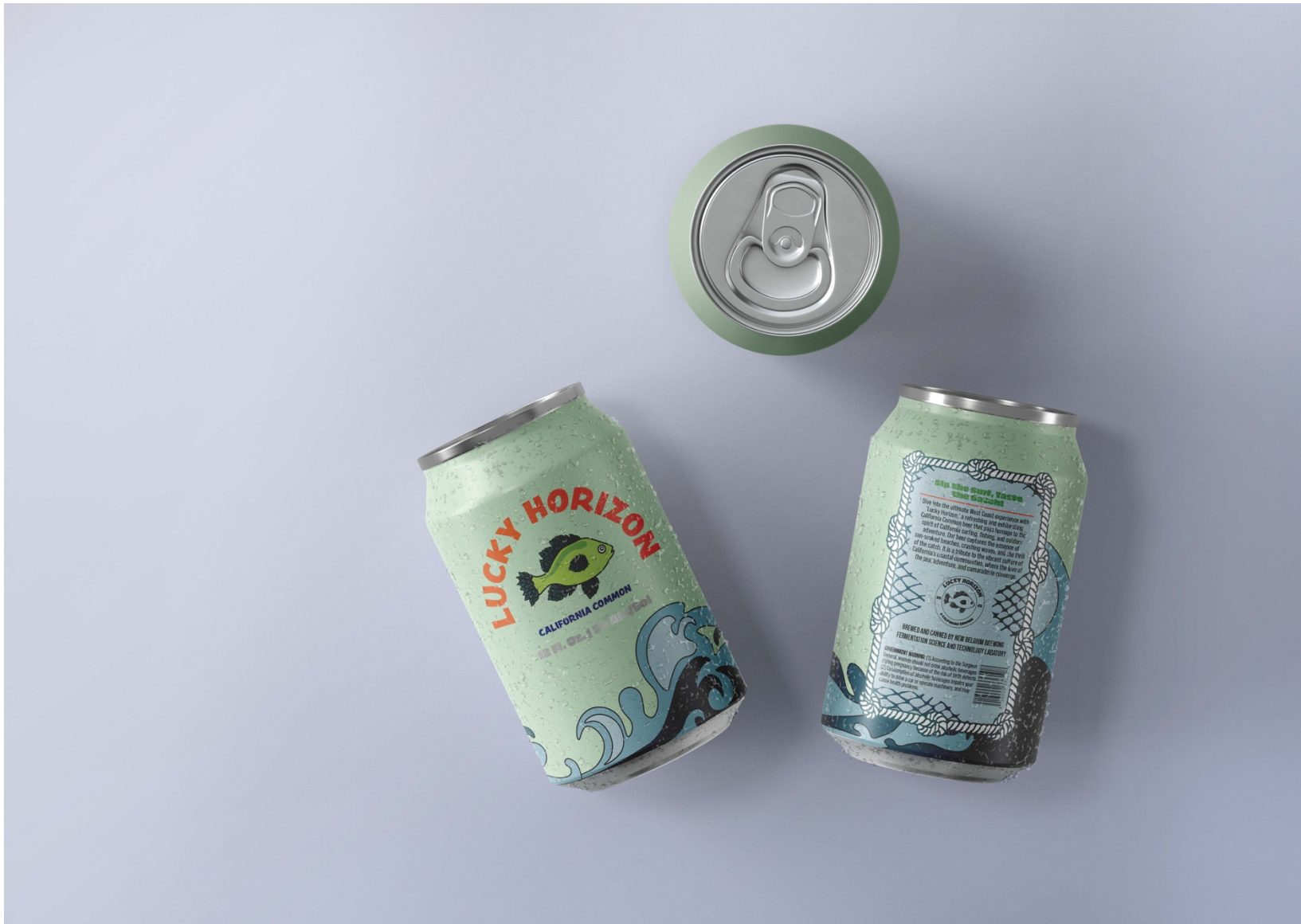
Figure 10: Lucky Horizon Beer