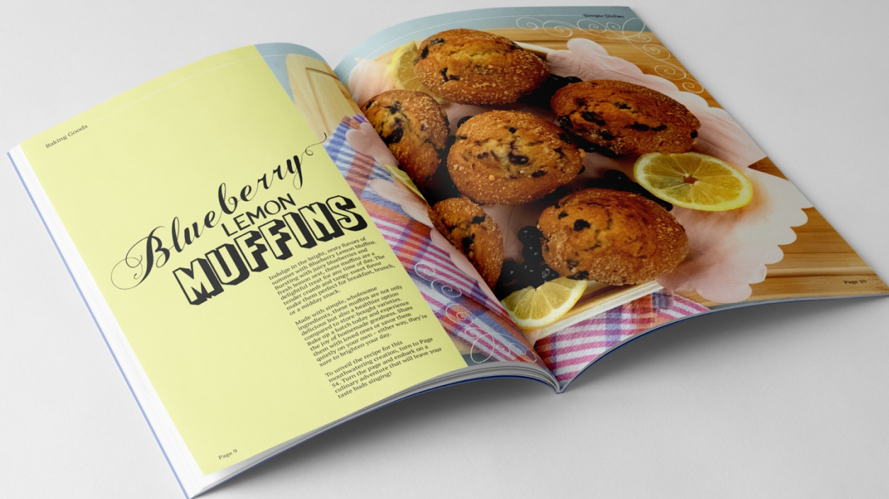
Figure 9: Food Editorial Magazine Spread