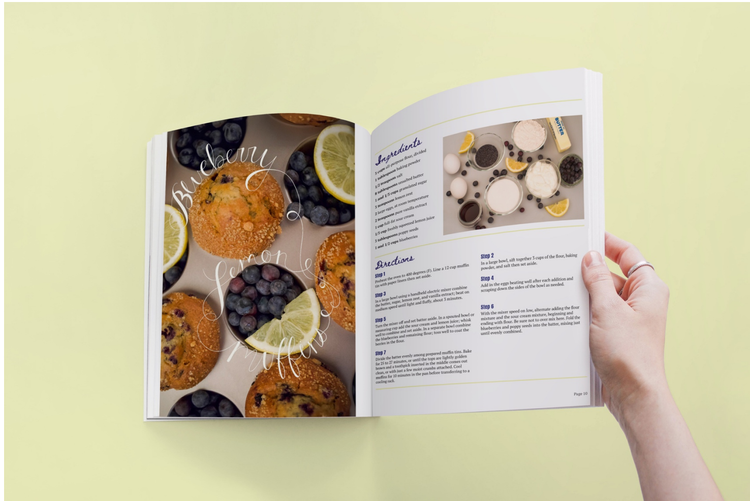
Figure 8: Recipe Magazine Spread