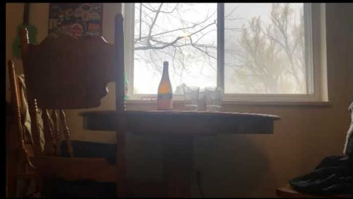
Figure 1: 2/12/22, 3:55