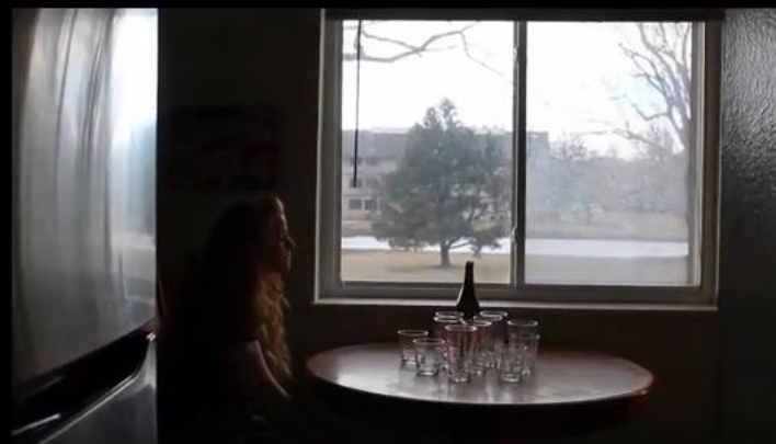
Figure 3: 2/12/22, 6:43