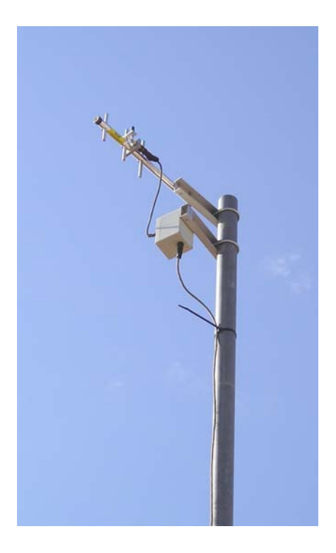
Figure 5. The SCADA system at Central Arizona Irrigation and Drainage District (CAIDD) uses spread spectrum radio which is a relatively new type of radio system that does not require federal licensing. The spread spectrum radio is housed in the white enclosure and the directional antenna shown has a lineof-sight range of approximately 5 miles.

Figure 5 shows a spread spectrum radio and a directional antenna installed on a galvanized steel pipe at one of CAIDD's check structure sites.