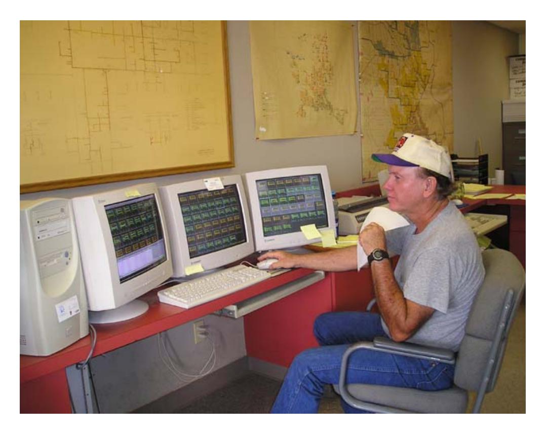
Figure 4. An operator at the Central Arizona Irrigation and Drainage District (CAIDD) near Phoenix monitors primary flows and water surface elevations in the 60-mile canal. This SCADA system was implemented at relatively low cost using affordable RTU equipment and spread spectrum radios for communication.

Most of the district's checks are operated in remote manual mode. See Figure 4 which shows the day operator at the central system where the upstream water surface elevation at all 108 check structures can be viewed simultaneous with three side-by-side computer monitors. Using SCADA, gate adjustments can be made in increments of 1/8<sup>th</sup> inch which coincidentally equates to a change in flow of roughly one cubic foot per second through the check.