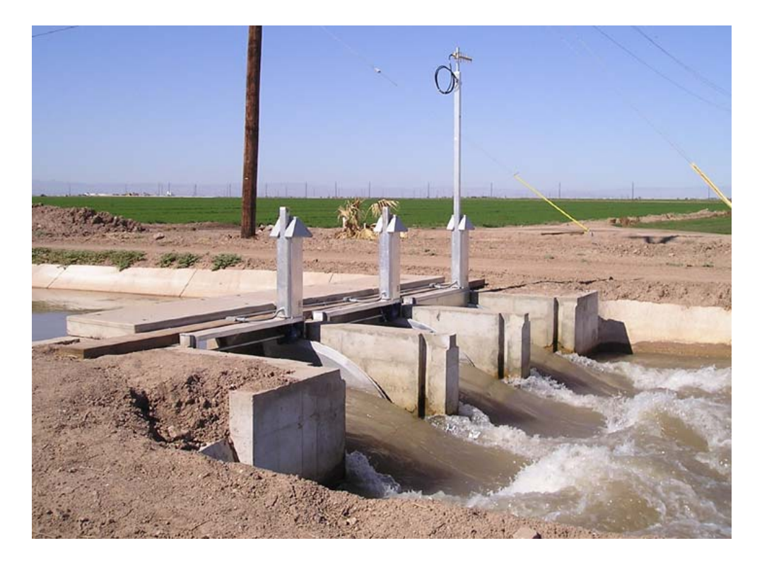
Figure 3. This check structure is controlled by Rubicon gates which are integrated with the SCADA system and used for water surface level control or flow control..

The Central Arizona Irrigation and Drainage District (CAIDD) has implemented SCADA over much of the district's 60 miles of canal. CAIDD has utilized SCADA for many years but it is noteworthy that they have in recent years upgraded their old SCADA system at a relatively low cost. With the upgrade, using the existing gates, actuators, and other infrastructure, the district staff installed new SCADA equipment on 108 sites for an equipment cost of approximately $150,000.