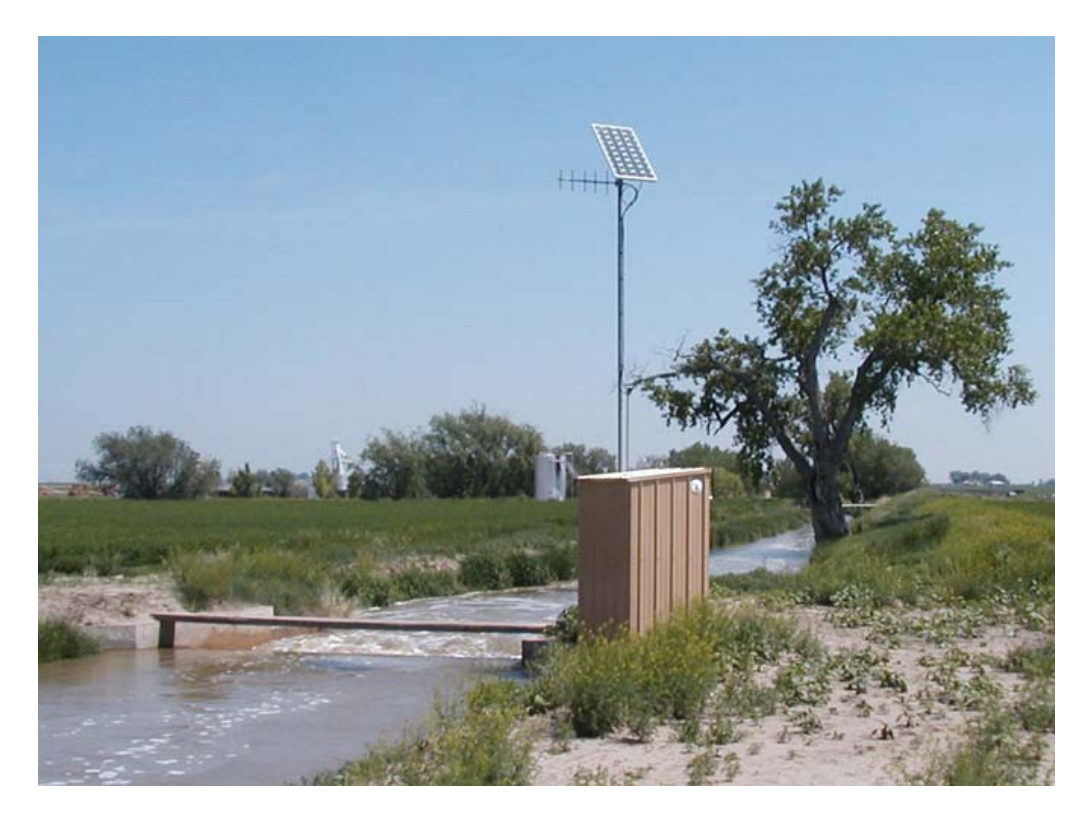
Figure 1. An example of a rated canal section which is remotely monitored using a SCADA system. RTU equipment is 12-volt DC powered from a solar panel that maintains a charge on a battery. Communication with the site is via radio.

The HMI screen can be, and should be, unique to the user and the circumstance. Figure 2 shows an example of the HMI screen in use by district staff at the Dolores Project near Cortez, Colorado. This screen is simple and intuitive in nature. Radial gate (check structure) positions are depicted graphically, each in a somewhat lower position in the HMI screen, to indicate the canal itself. The operator may raise or lower gates, and therefore water surface elevations in canal pools, by using very small incremental gate movements. Interestingly, Delores Project staff can and do make changes in their own HMI software interface without assistance from an outside consultant or system integrator.