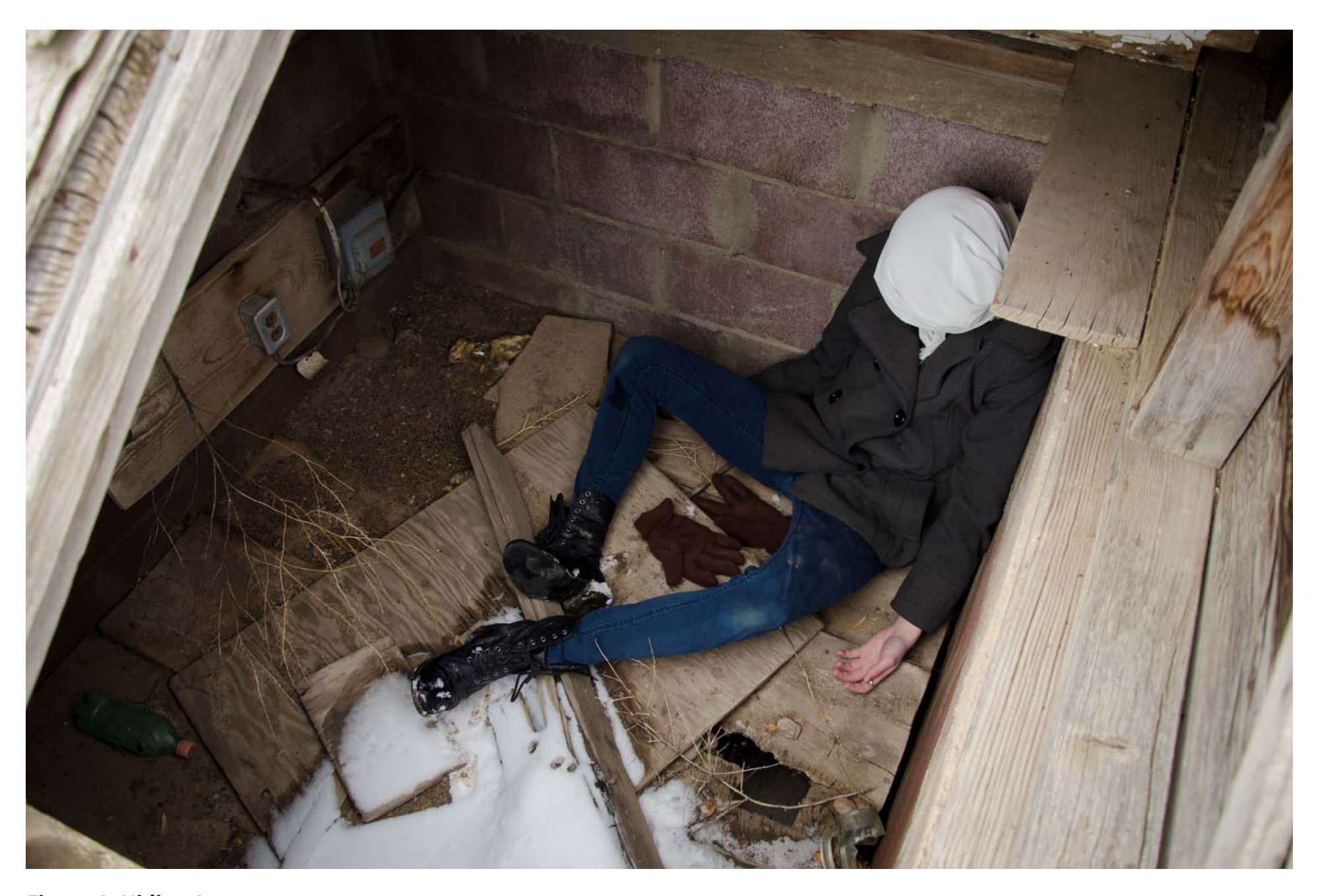
Figure 4: Hiding Away.