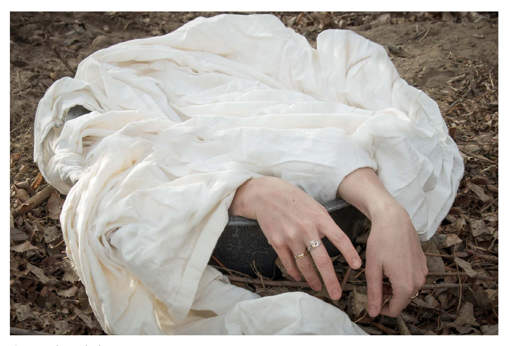
Figure 15: The Washtub.