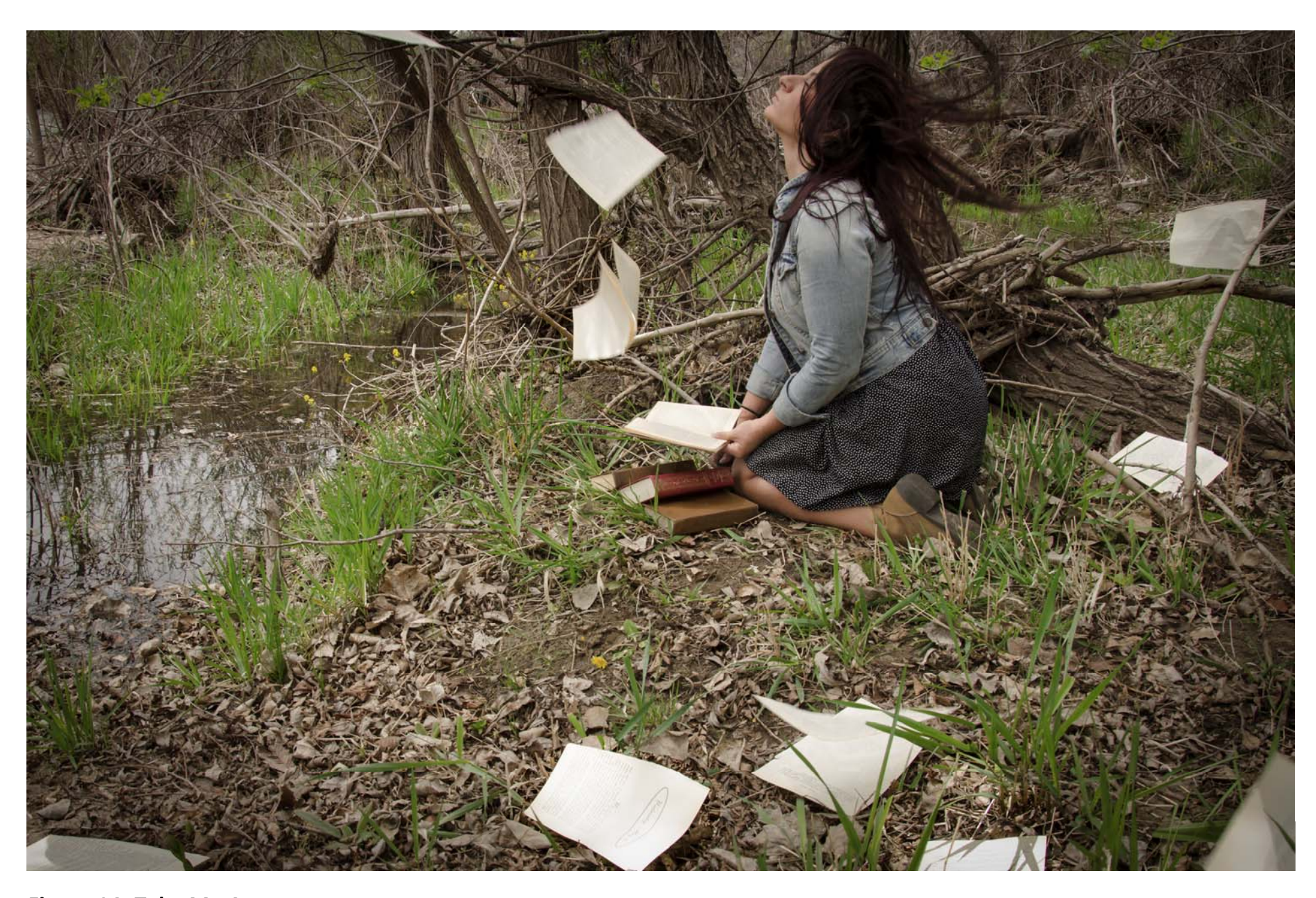
Figure 14: Take Me Away.