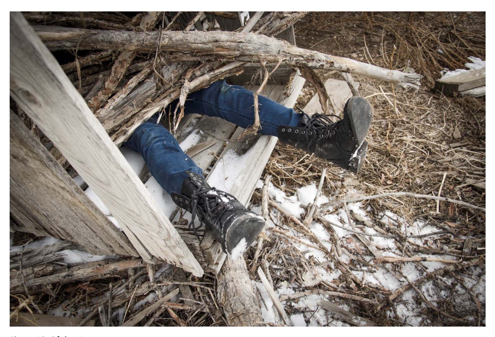
Figure 10: Of the West.