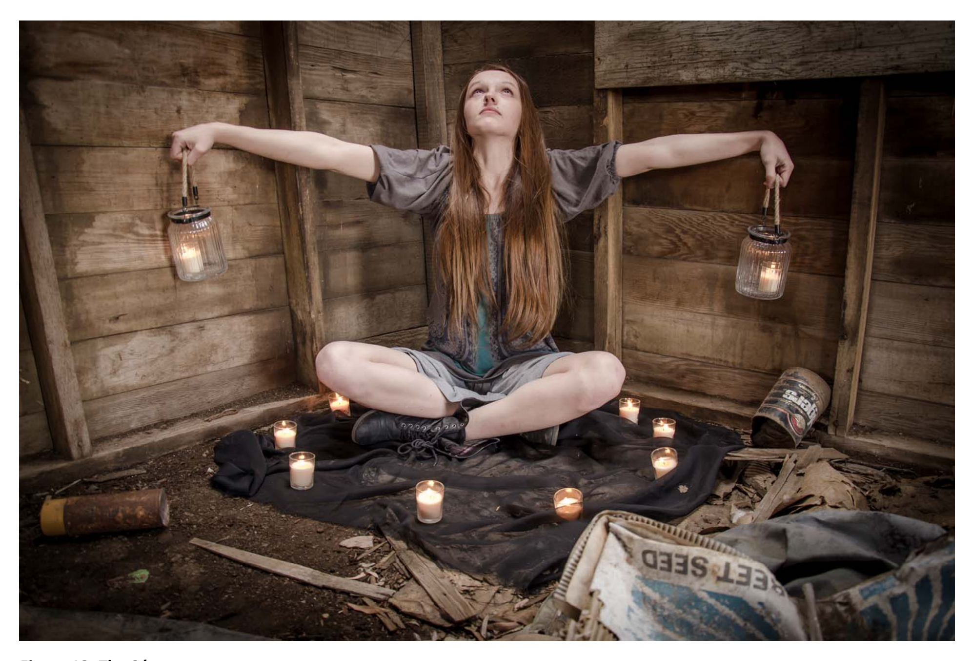
Figure 13: The Séance.