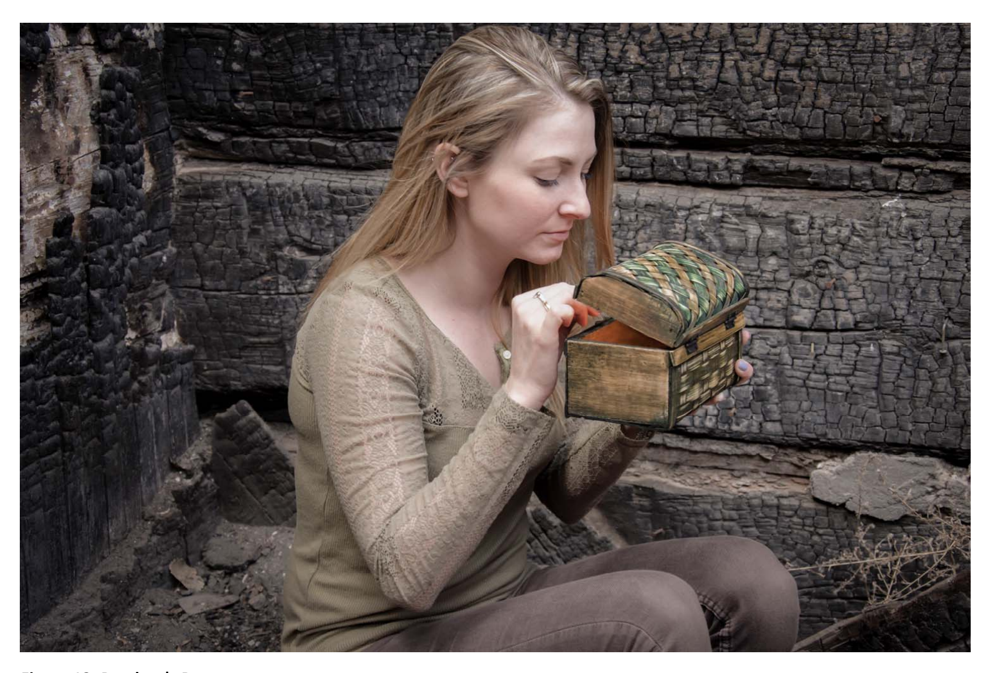
Figure 12: Pandora's Box.