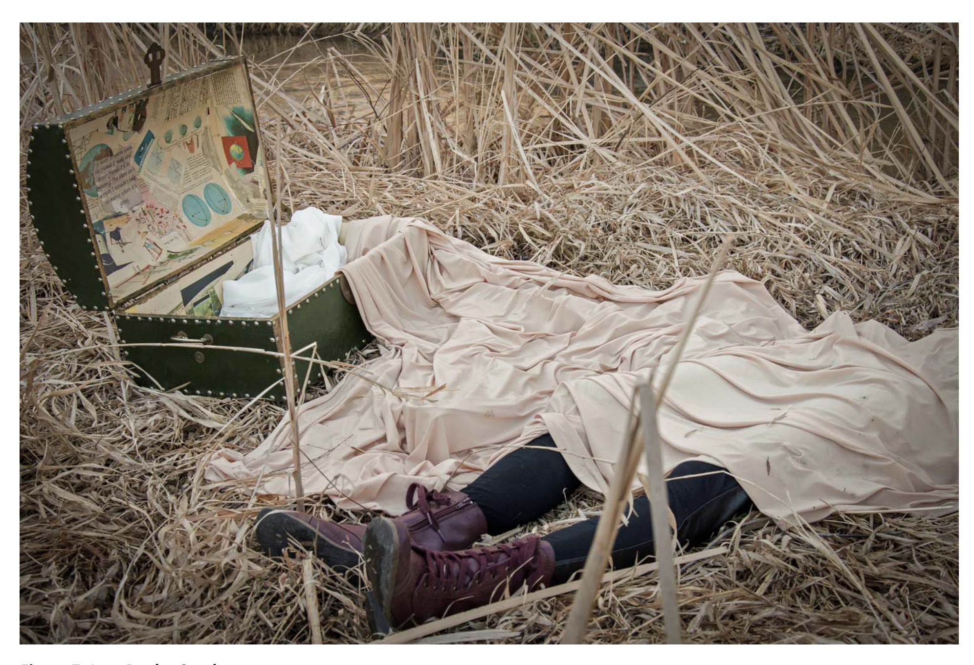
Figure 7: Lost By the Creek.