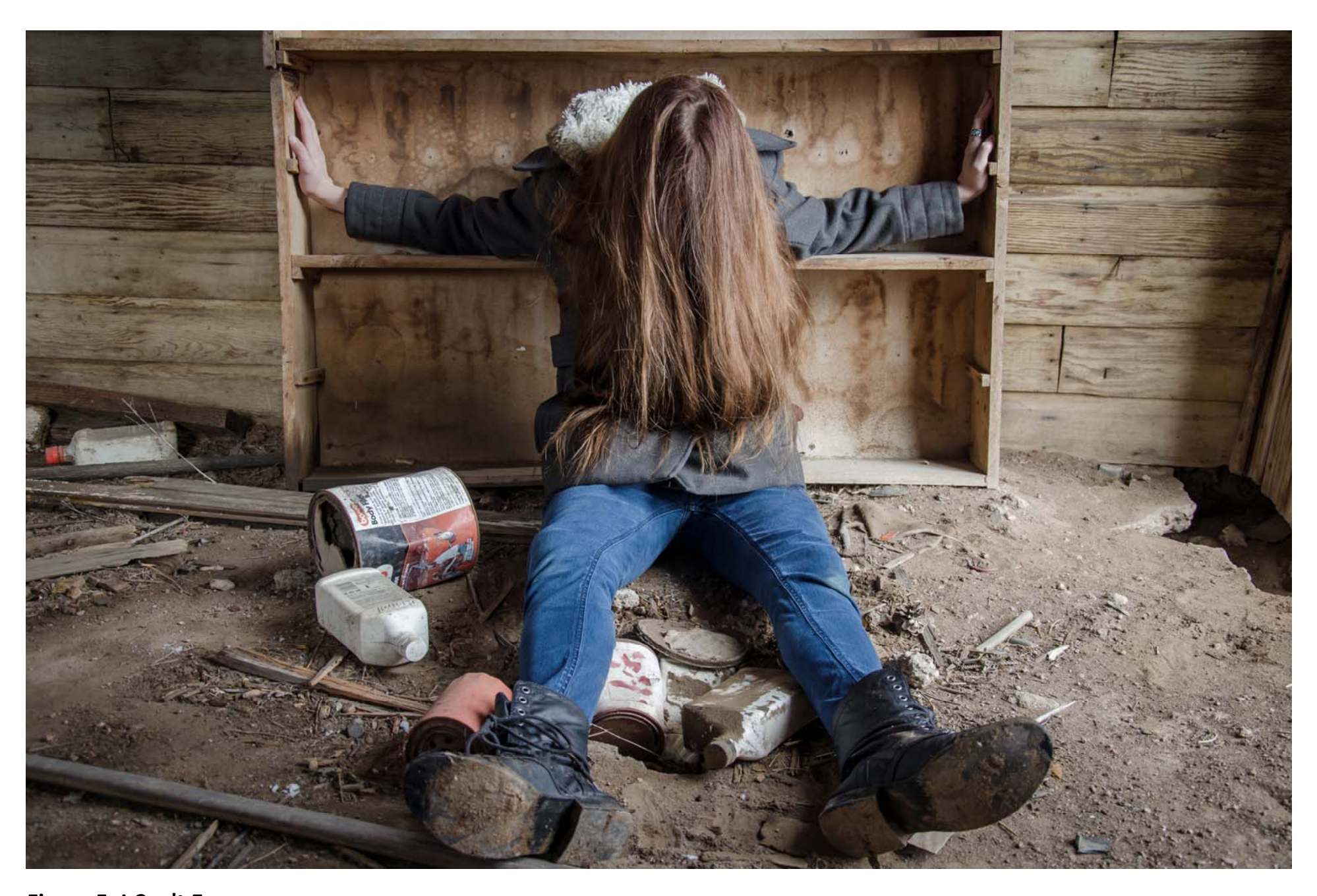
Figure 5: I Can't Escape.