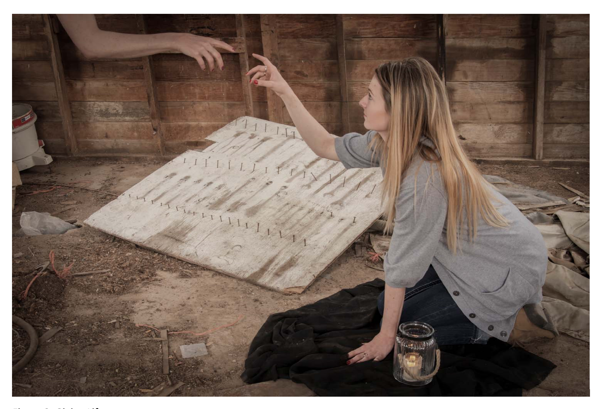
Figure 3: Giving Life.