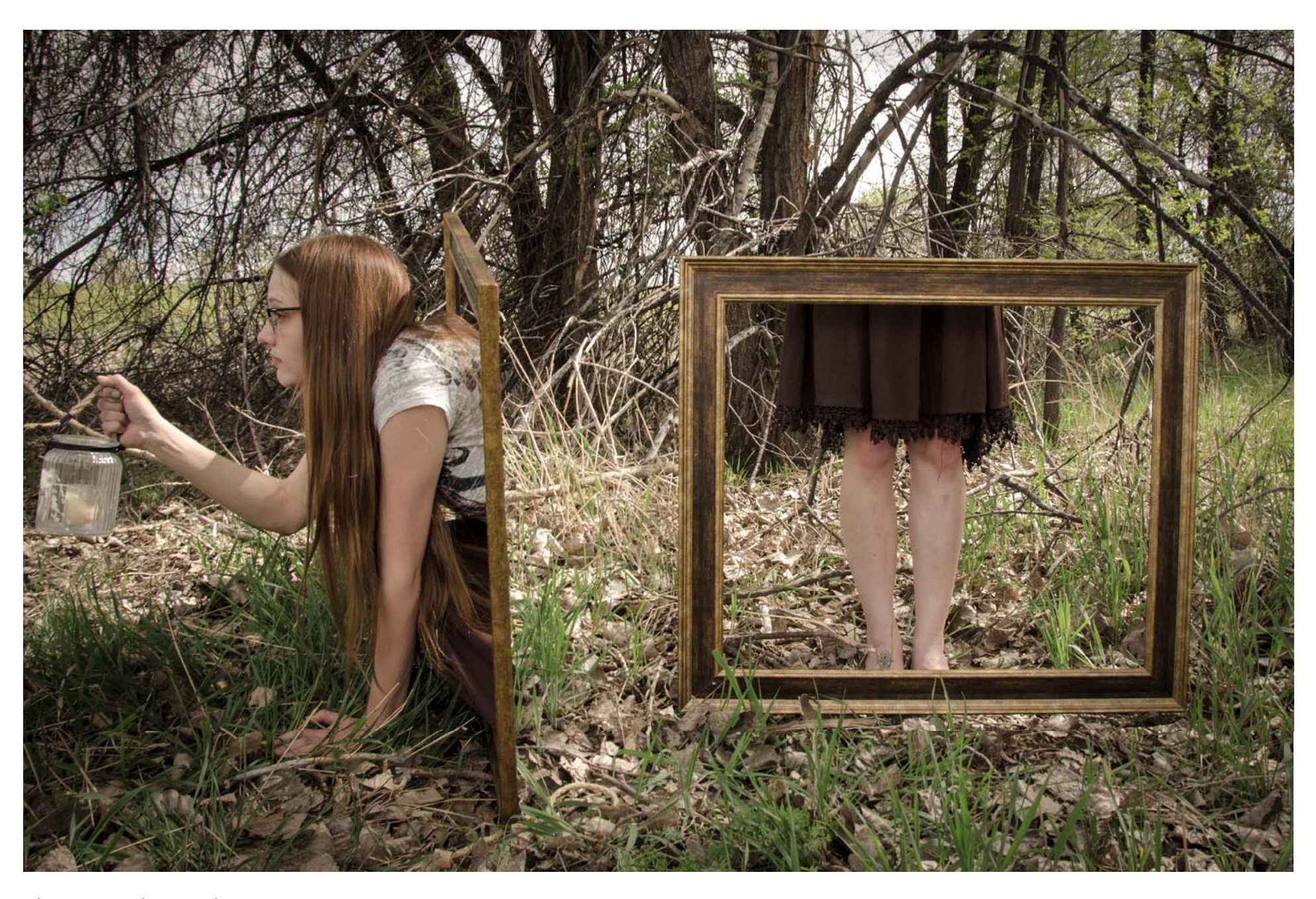
Figure 9: Mirror Mirror.