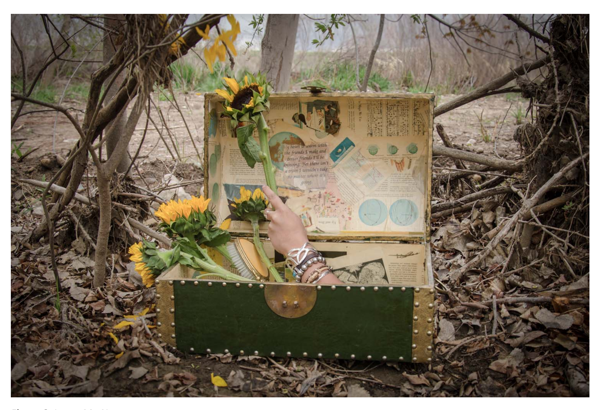
Figure 8: Loves Me Not.