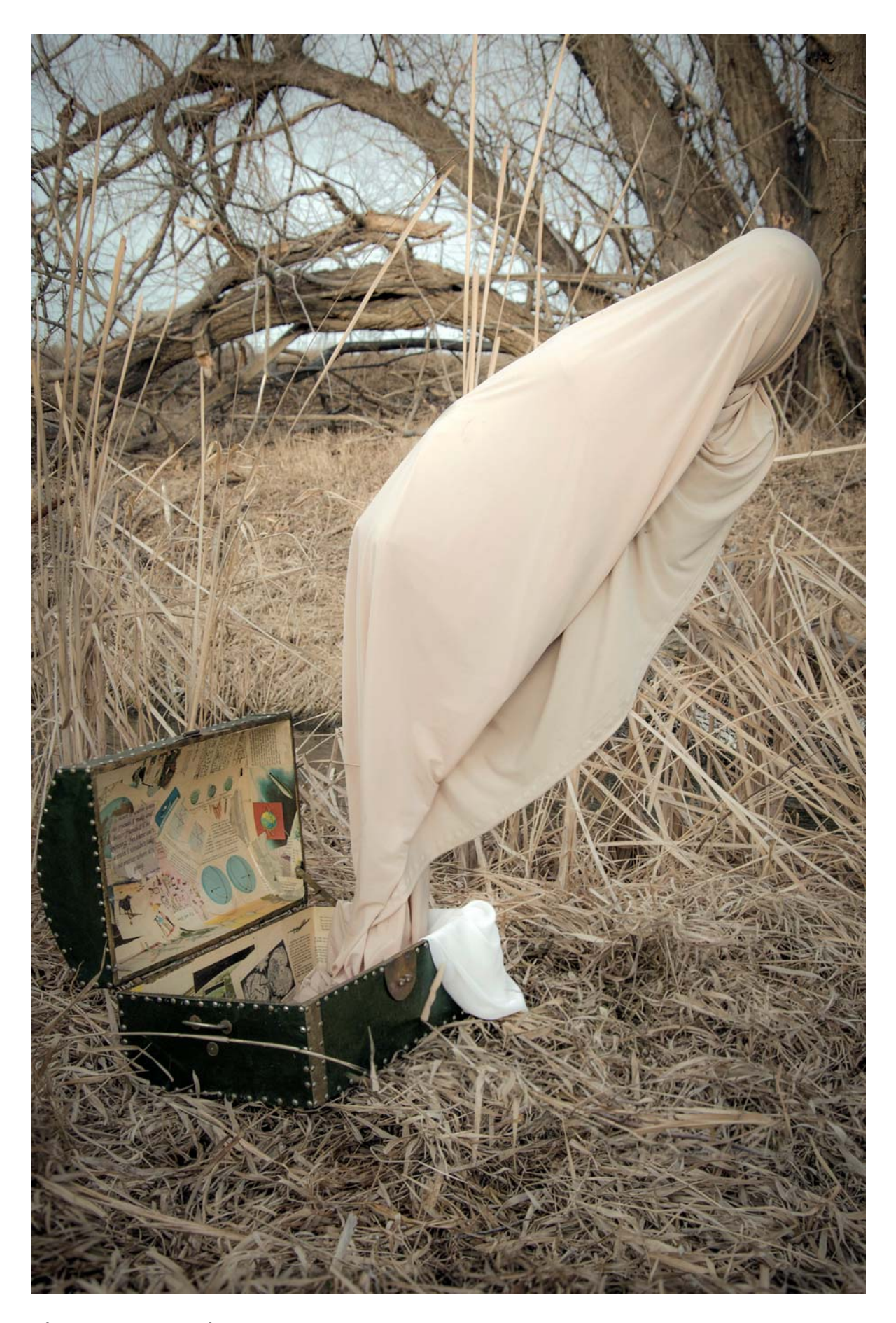
Figure 11: Once it Opens.