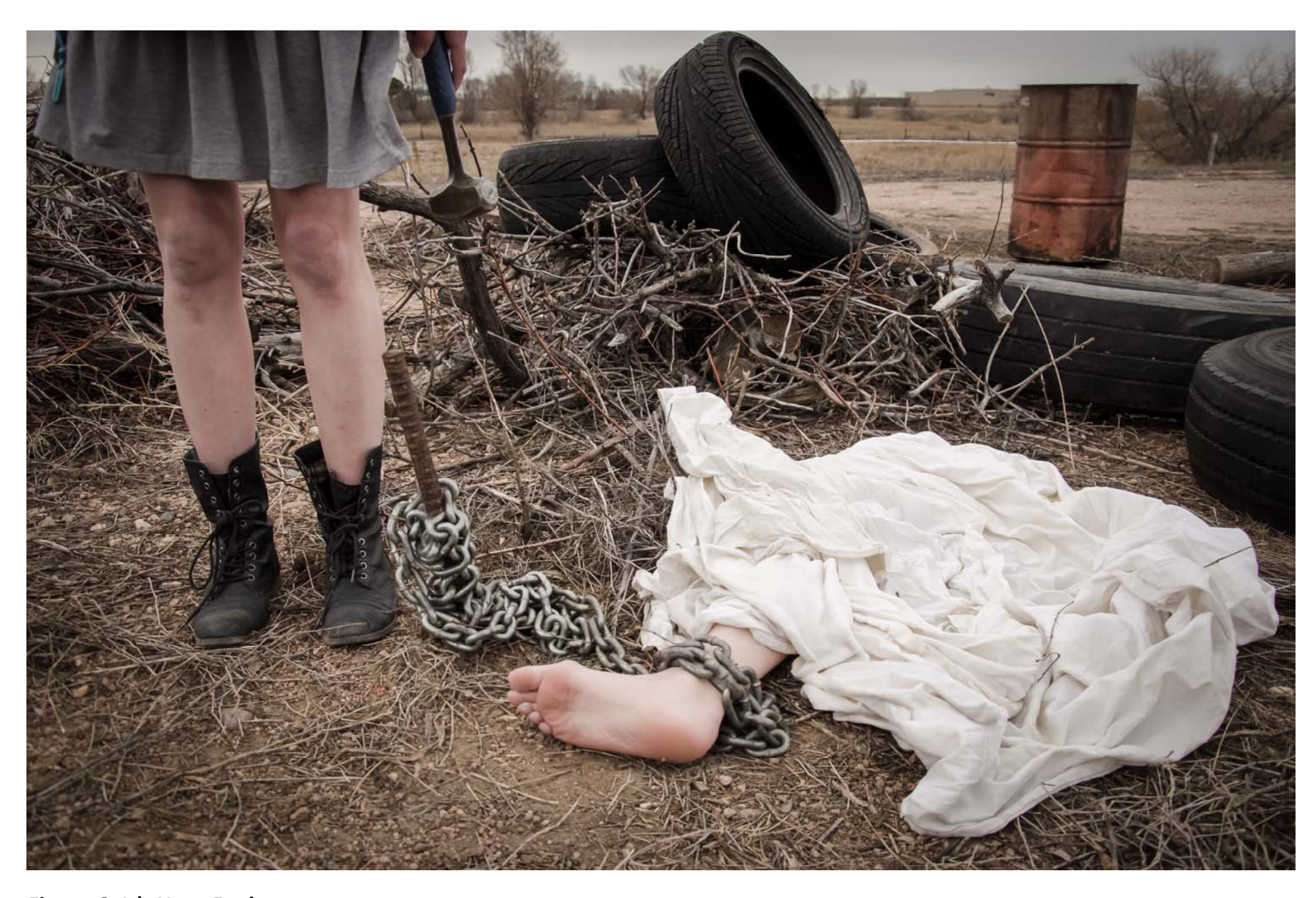
Figure 6: It's Your Fault.