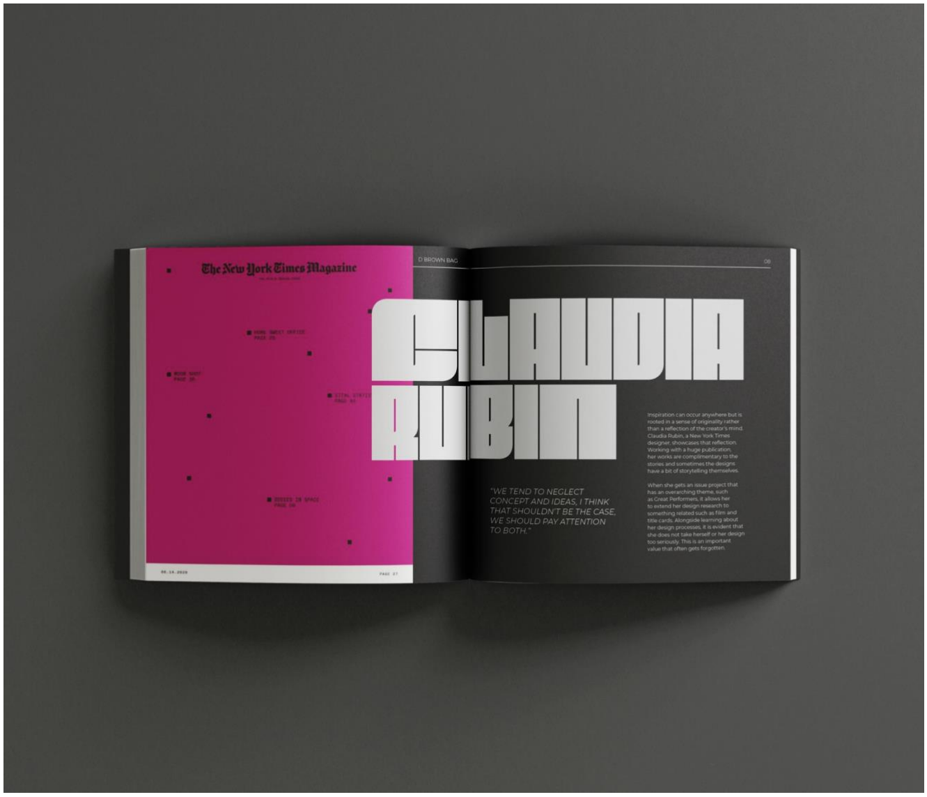
Figure 5: D Brown Bag Publication (Claudia Rubin)