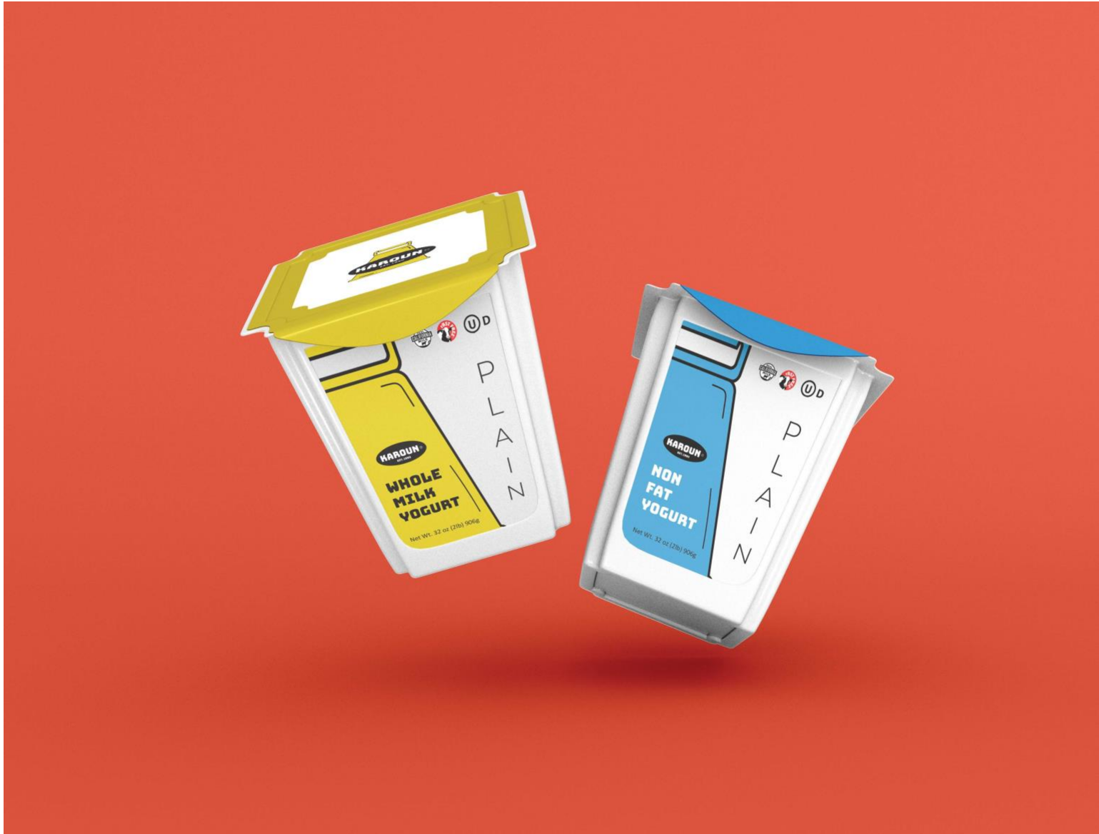
Figure 2: Karoun Dairy Rebrand 02