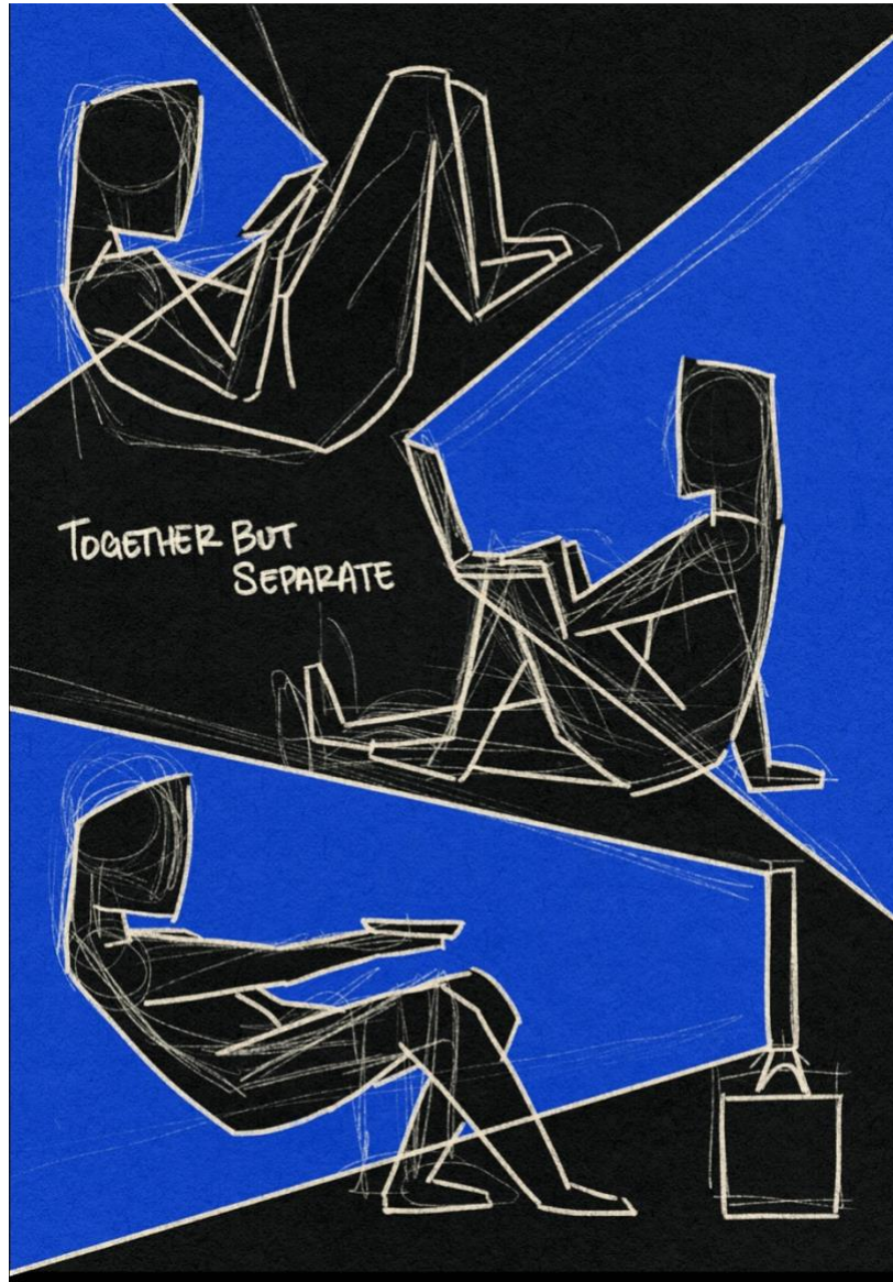
Figure 9: Together but Separate