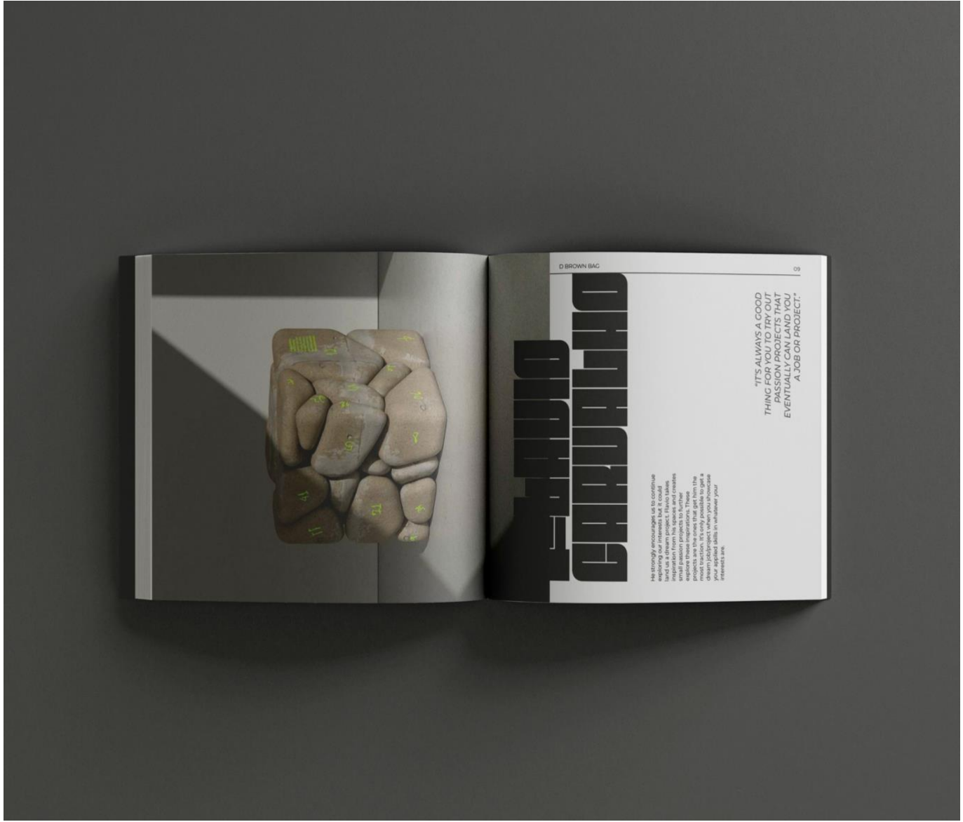
Figure 6: D Brown Bag Publication (Flavio Carvalho)