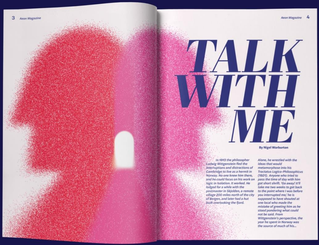
Figure 8: Aeon Magazine