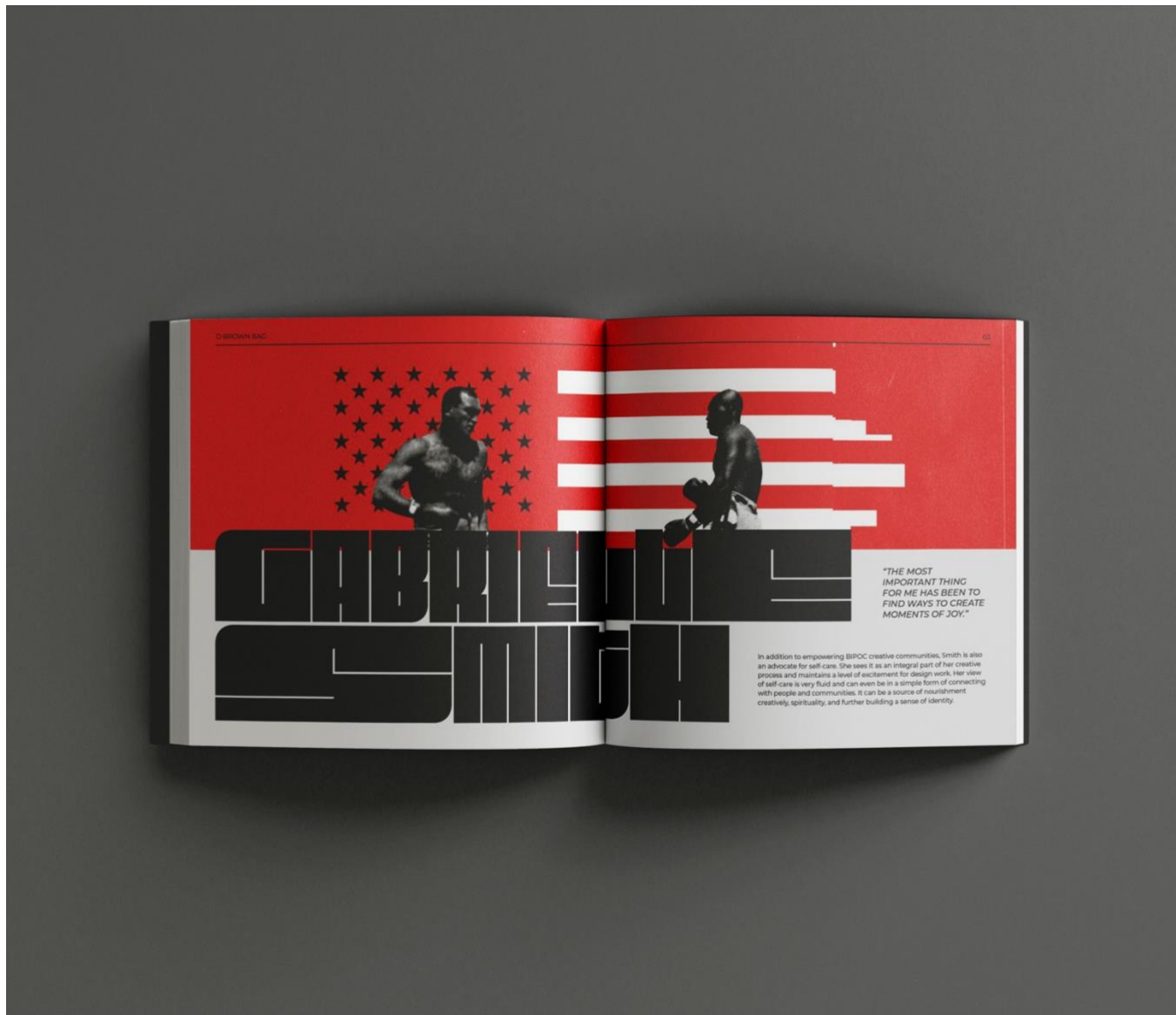
Figure 7: D Brown Bag Publication (Gabrielle Smith)