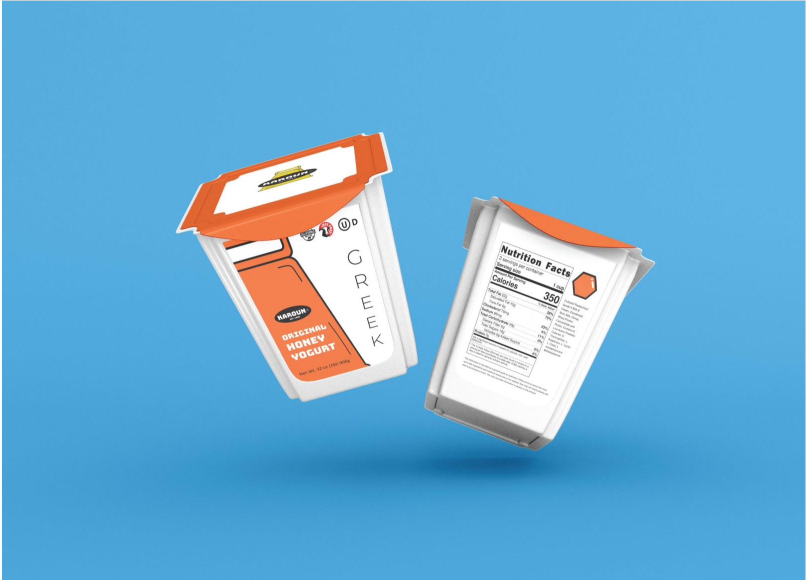
Figure 1: Karoun Dairy Rebrand 01