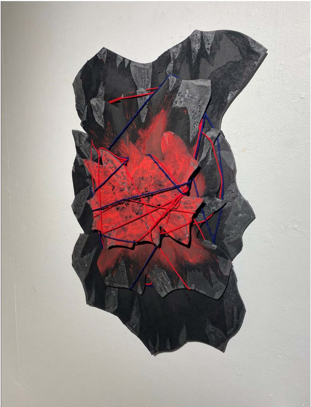
FIGURE 8 - HEADACHE (DETAIL)