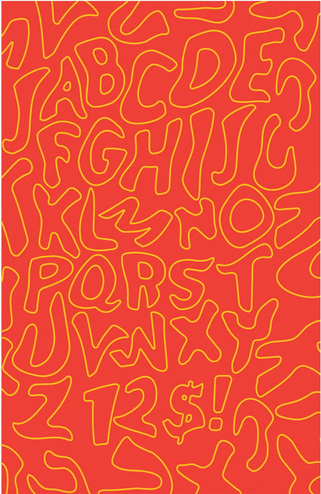
FIGURE 1 - LETTING LOOSE