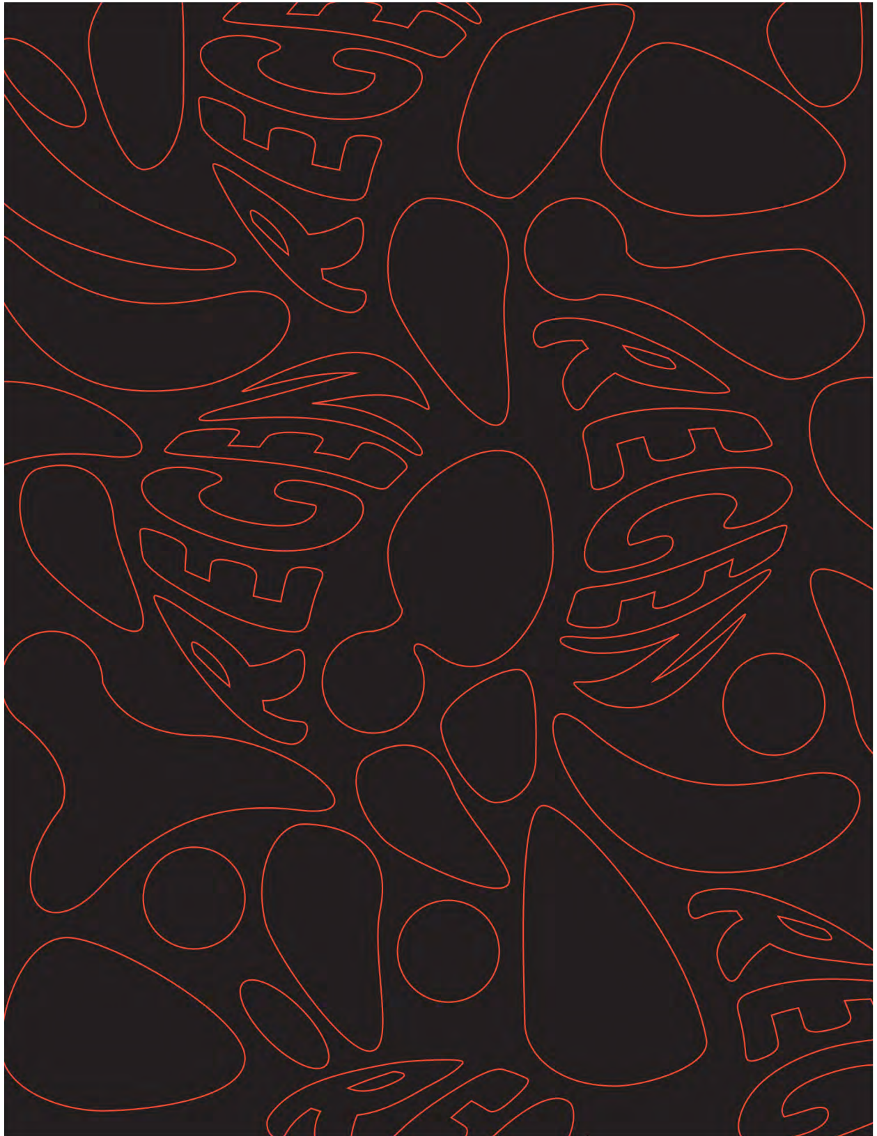
FIGURE 3 - REGEN SERIES 2