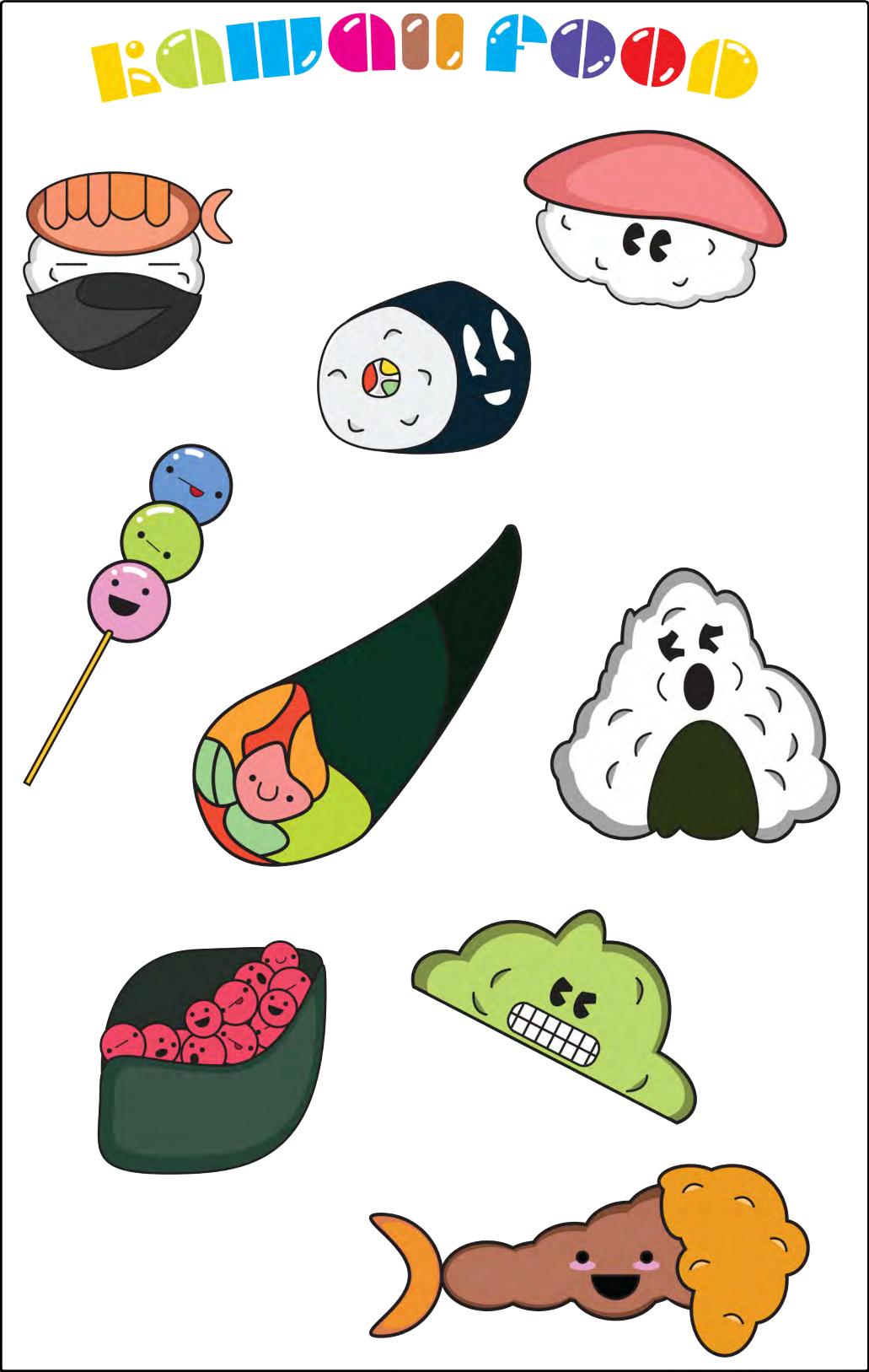
FIGURE 5 - KAWAII FOOD