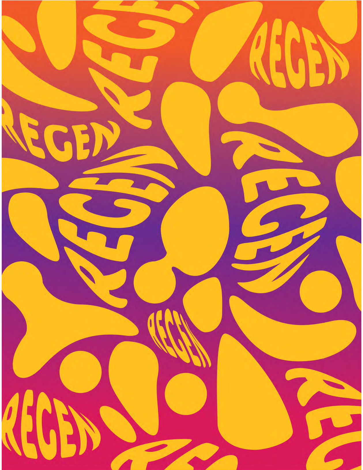
FIGURE 4 - REGEN SERIES 3