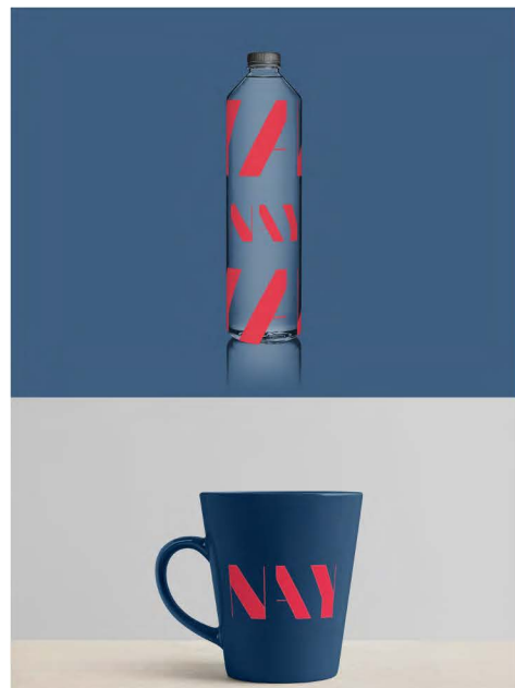
FIGURE 6 - NAY AIRPORT

SECONDARY FONT: Yu Gothic UI Quick Brown fox jumps overthe lazy dog. regular