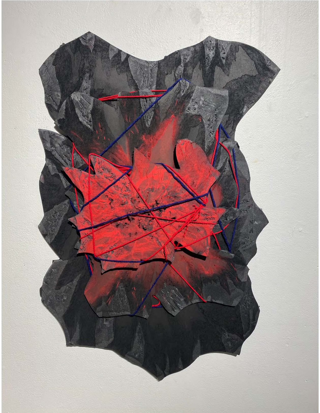
FIGURE 7 - HEADACHE