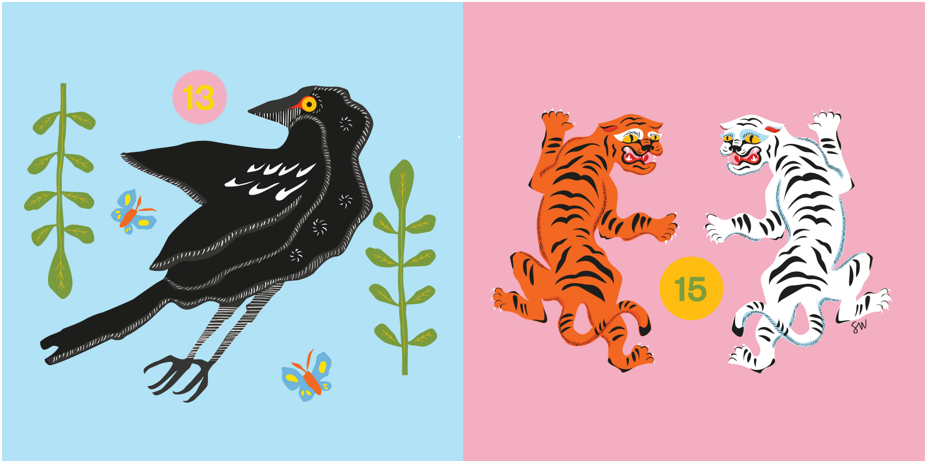
Figure 3: Sustainable Development Goals 13 and 15, Poster Series