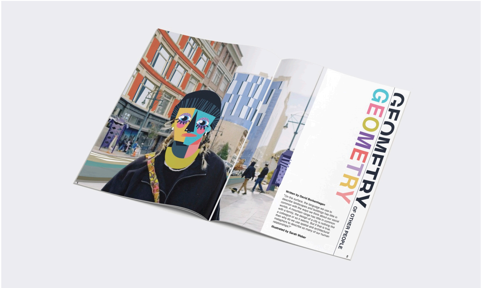
Figure 1: Geometry of Other People Editorial Layout