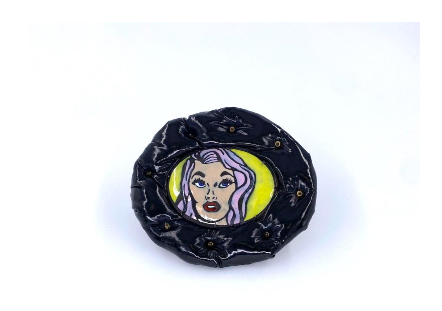
Figure 9: Queen of the Rodeo III