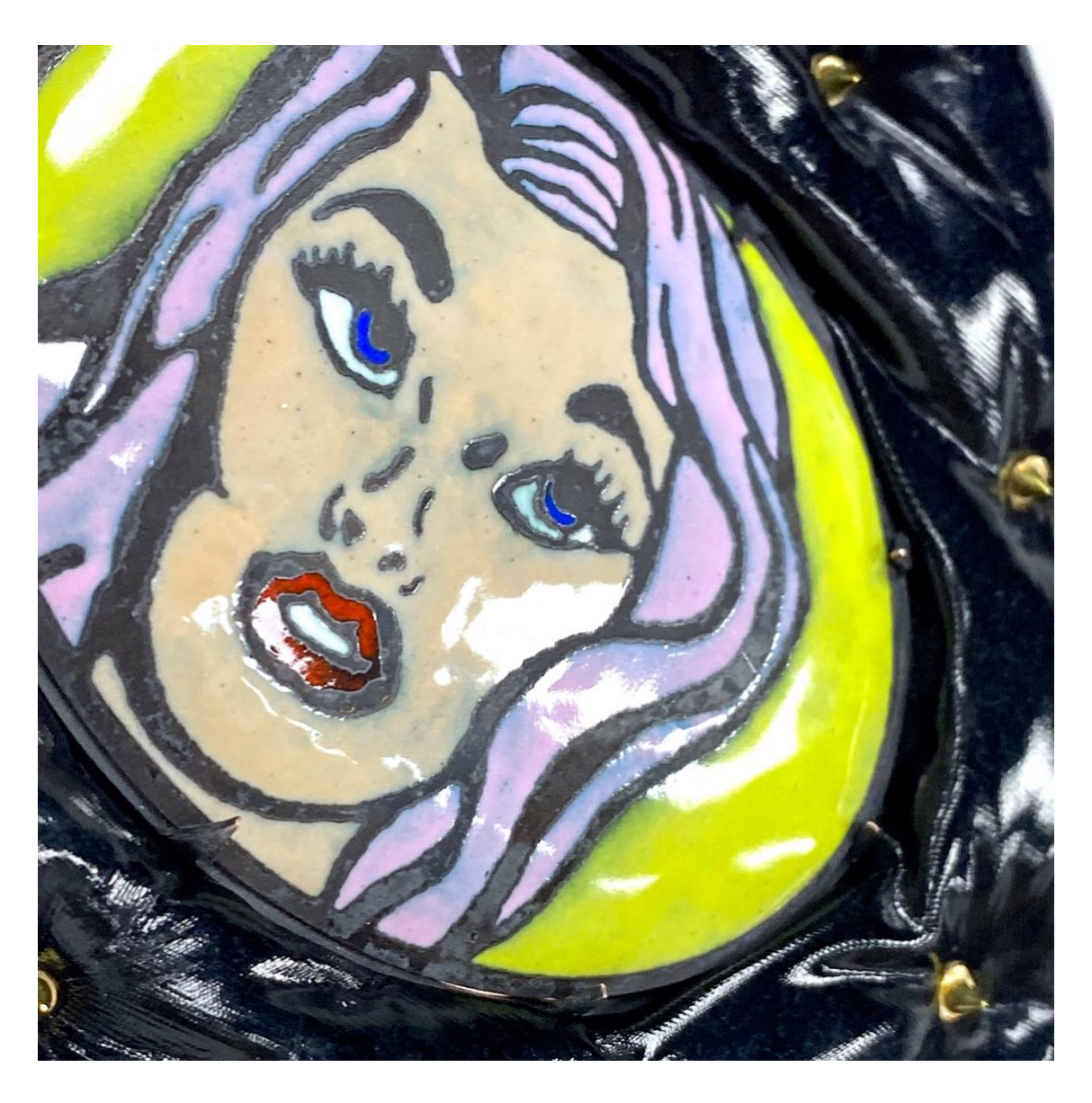
Figure 8: Queen of the Rodeo III (detail)