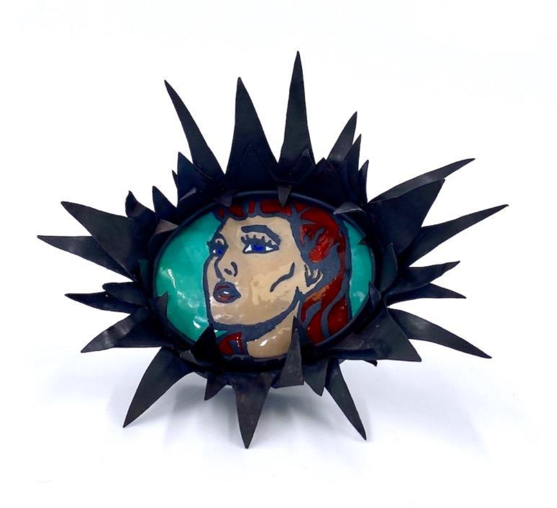
Figure 3: Queen of the Rodeo I