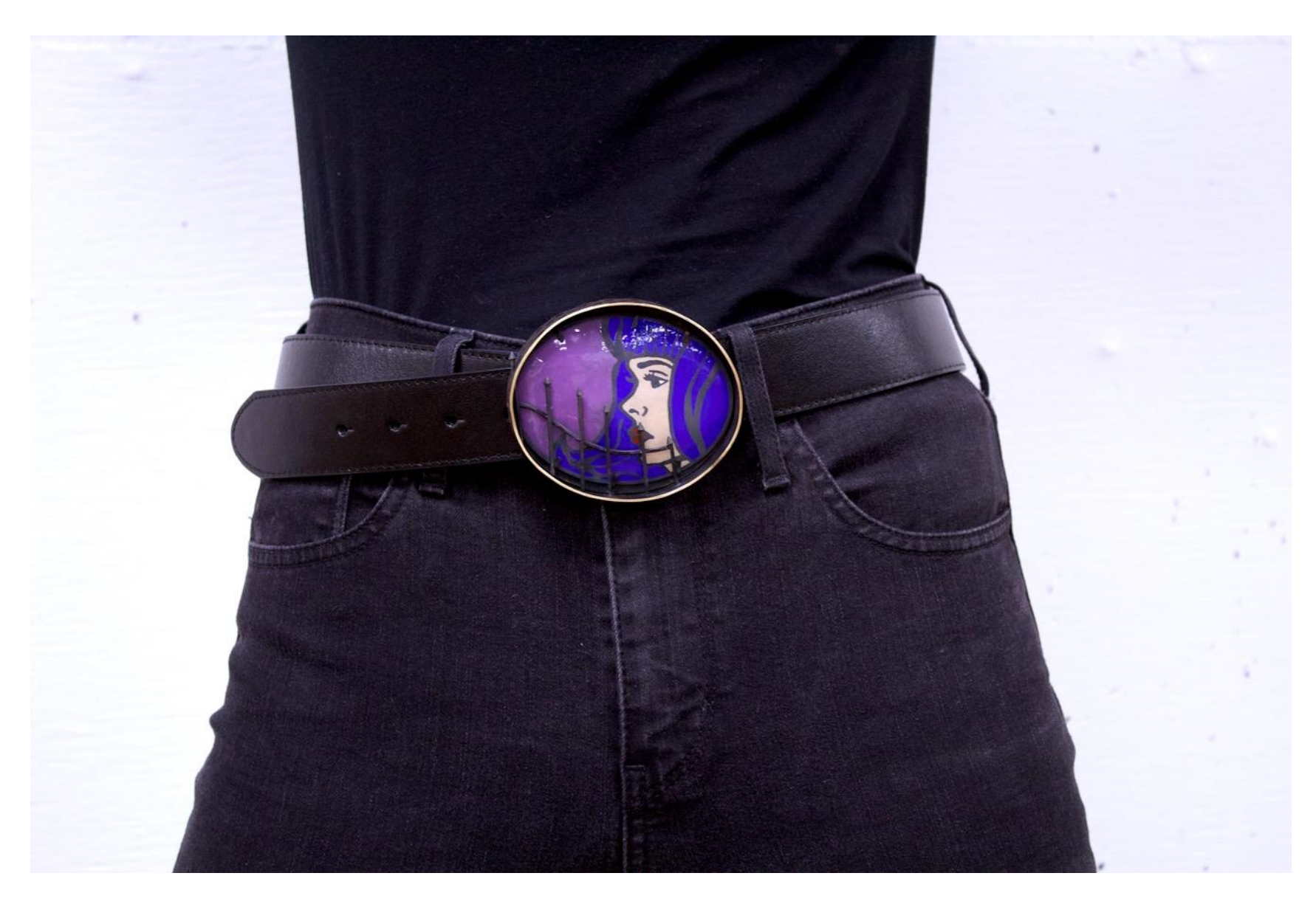
Figure 4: Queen of the Rodeo II