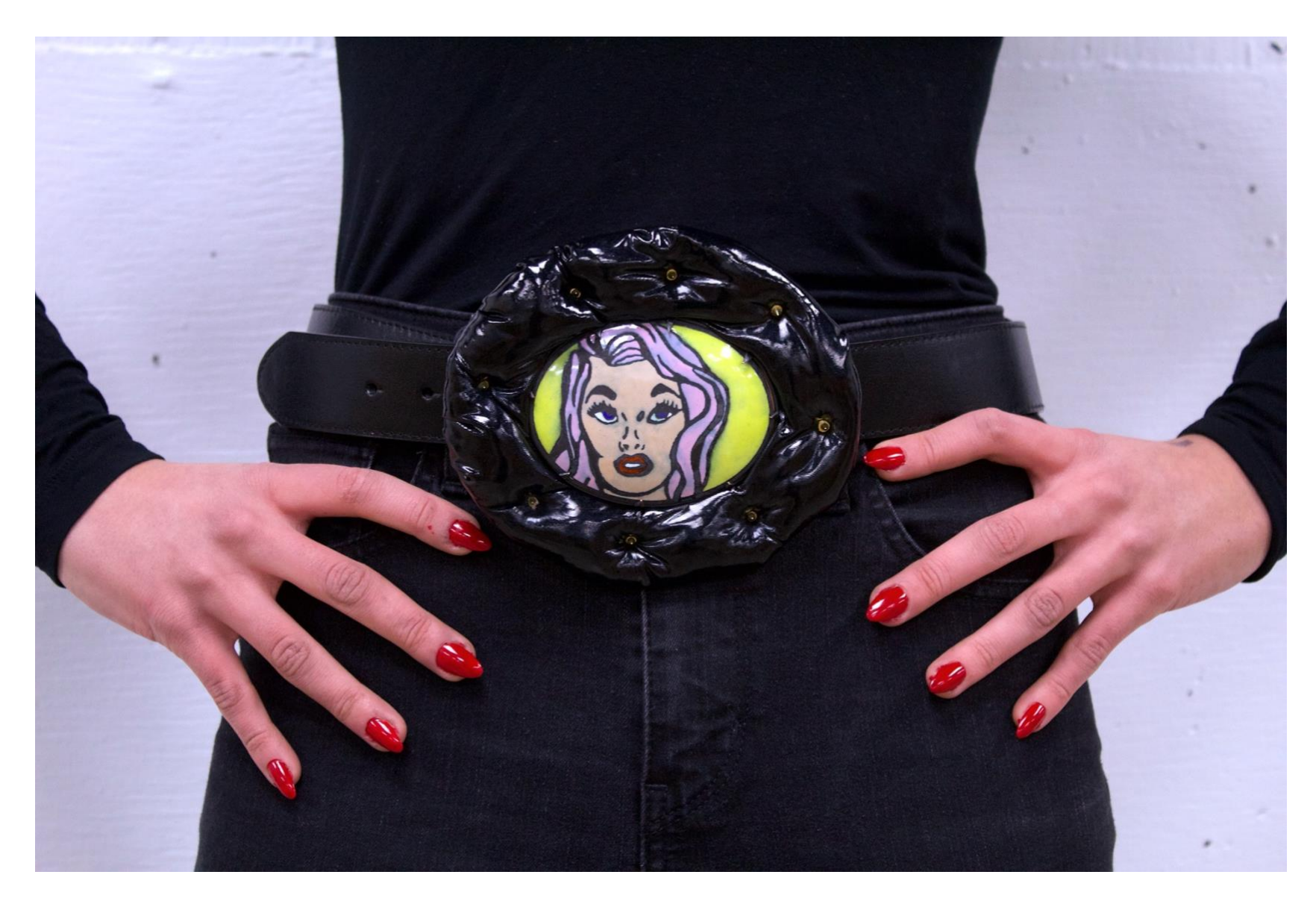
Figure 7: Queen of the Rodeo III