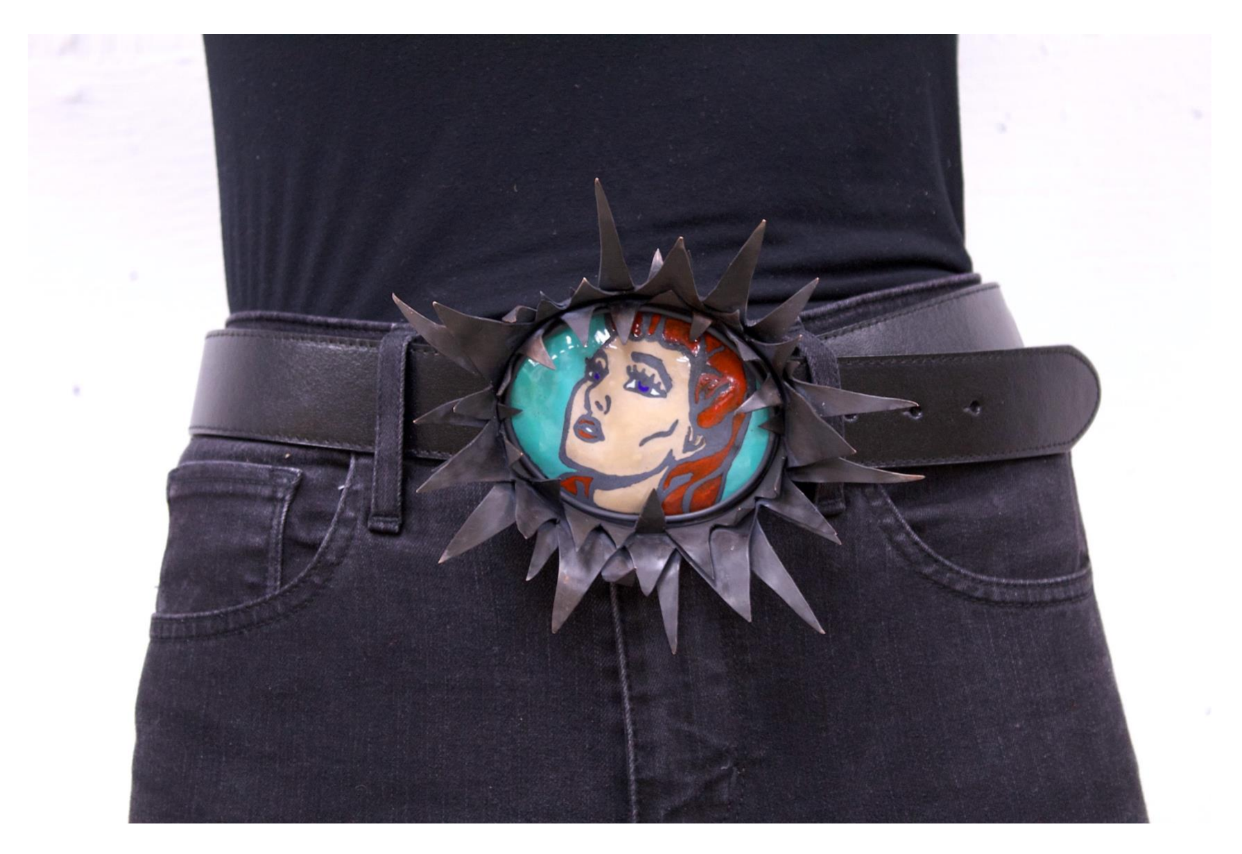
Figure 1: Queen of the Rodeo I