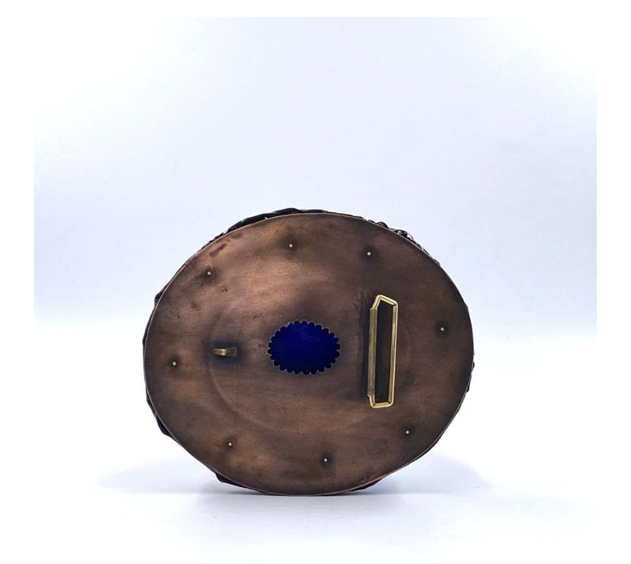
Figure 10: Queen of the Rodeo III