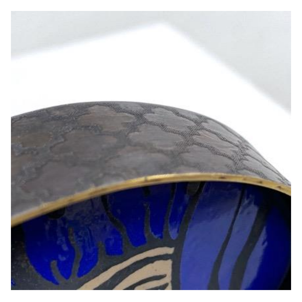
Figure 5: Queen of the Rodeo II (detail)