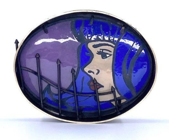
Figure 6: Queen of the Rodeo II