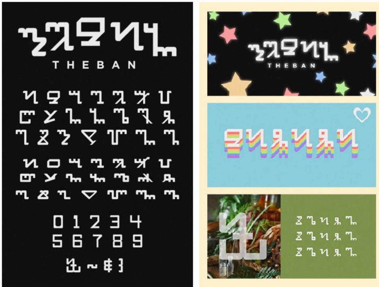
Figure 3: Modern Typeface for Theban