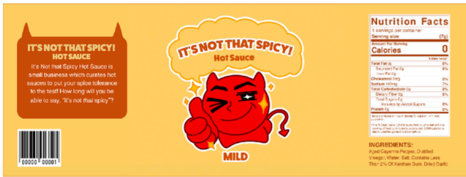
Figure 1: It's Not That Spicy Hot Sauce