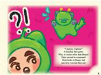
Figure 2: Space Cookies