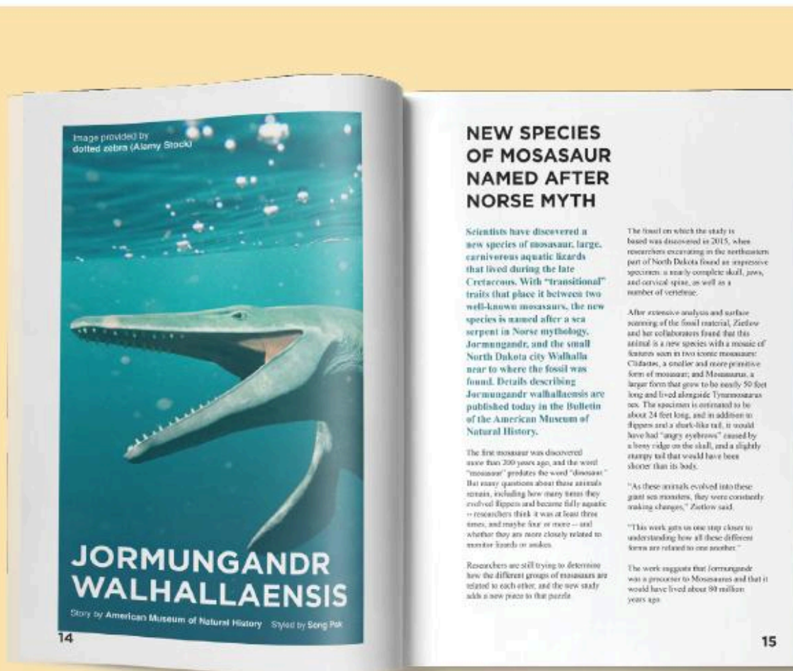
Figure 4: Marine Biology Magazine