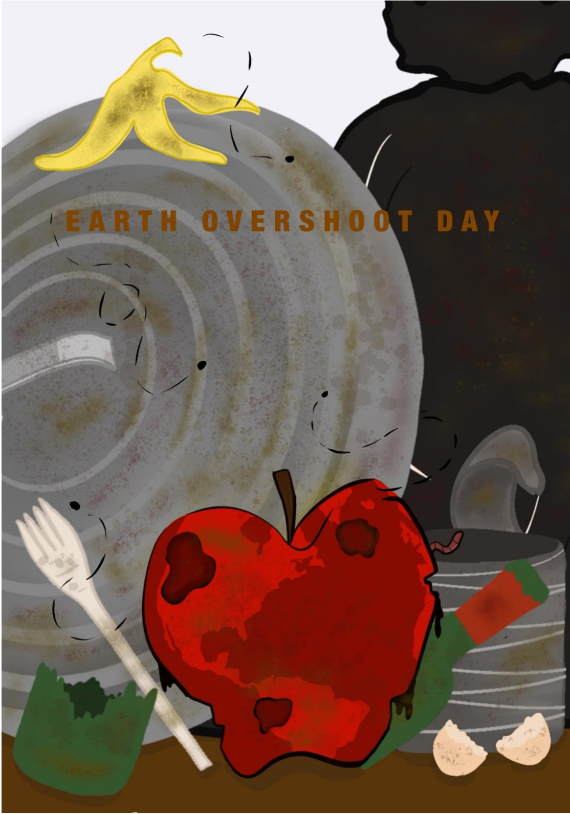
Figure 2: Earth Overshoot Day