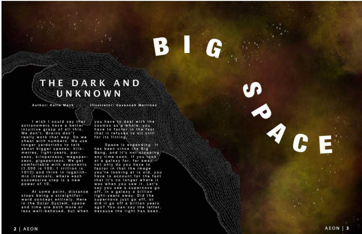
Figure 3: Big Space