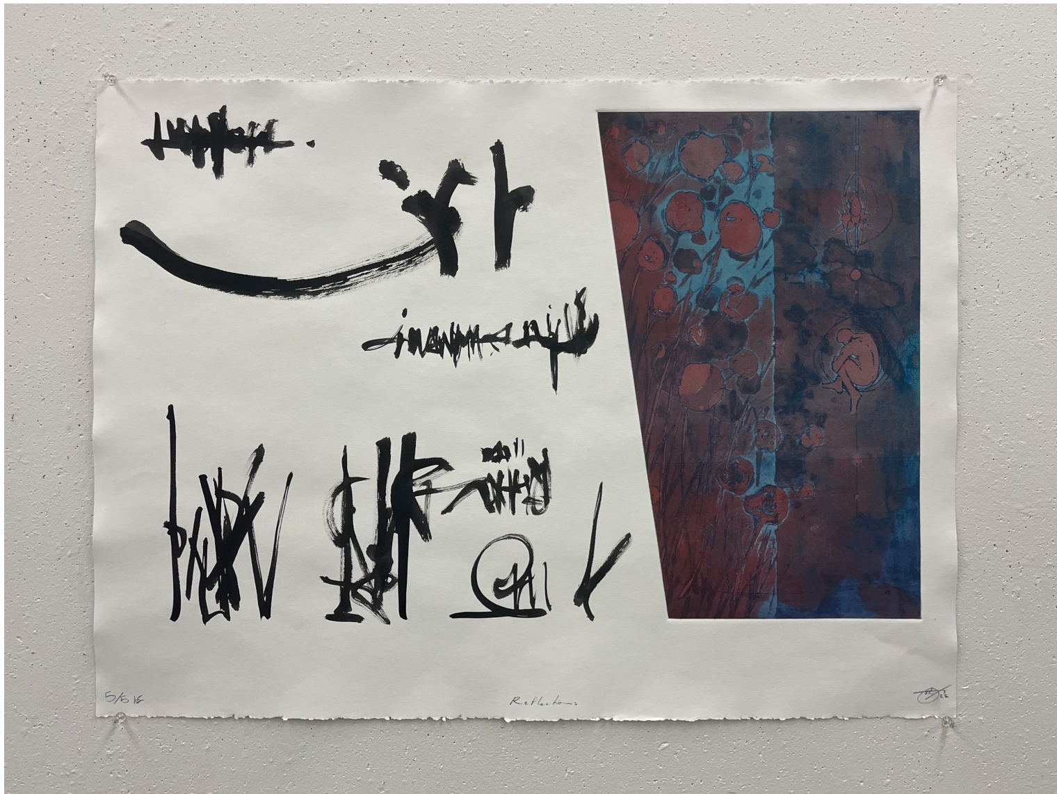
Figure 1: Reflections