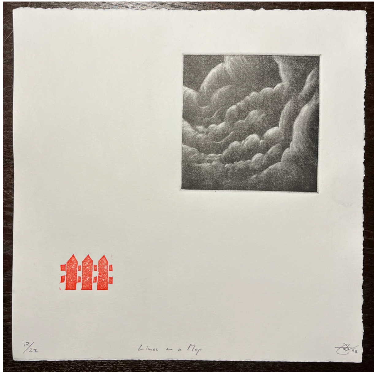
Figure 4: Lines on a Map