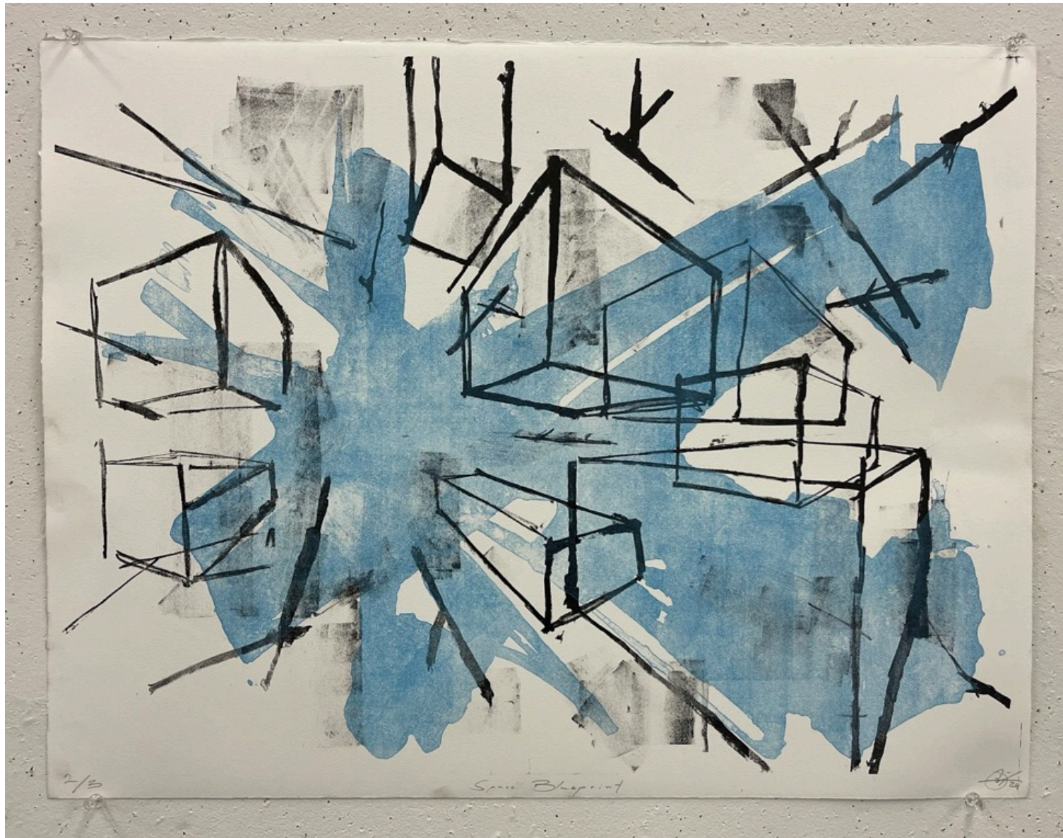
Figure 2: Space Blueprint