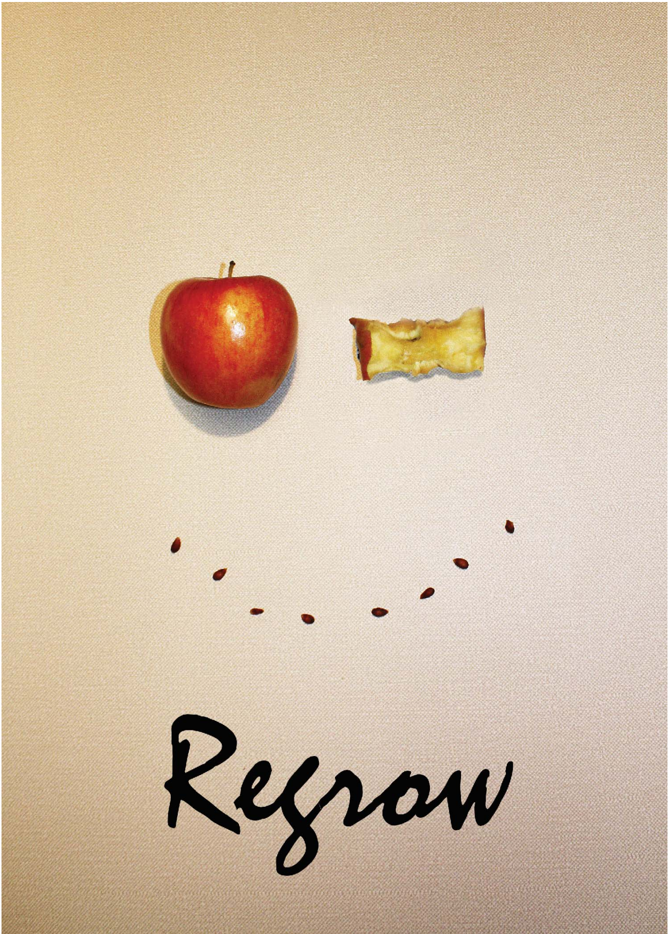
Figure 11: Regrow.