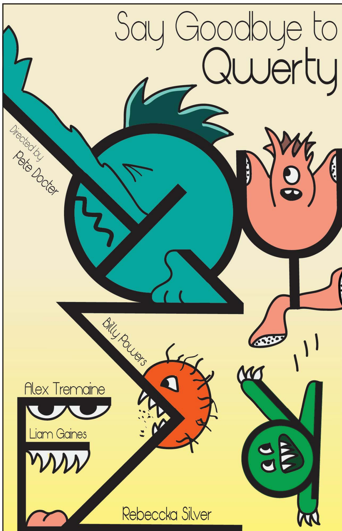
Figure 10: Say Goodbye to Qwerty.