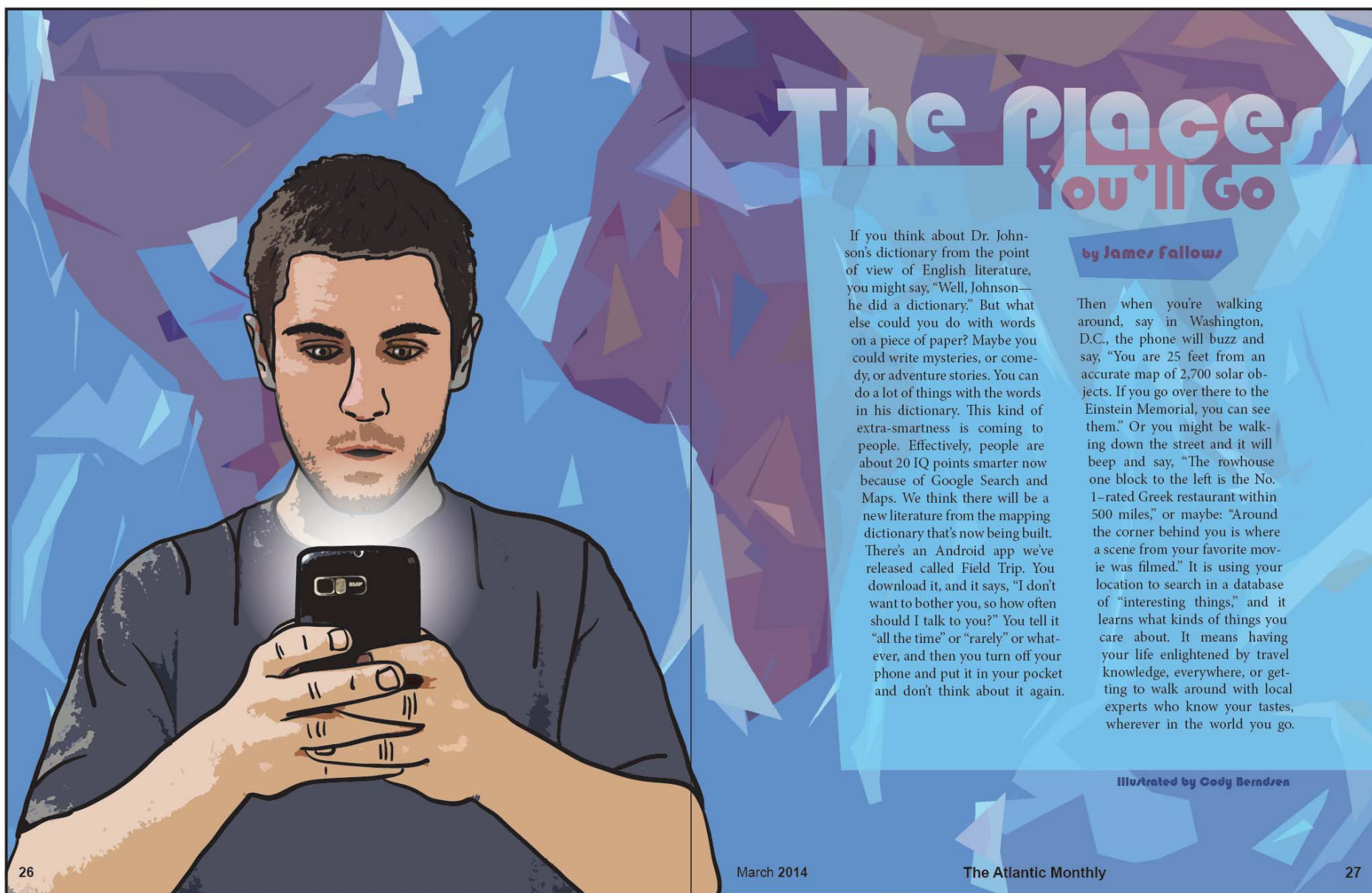
Figure 12: The Places You'll Go.