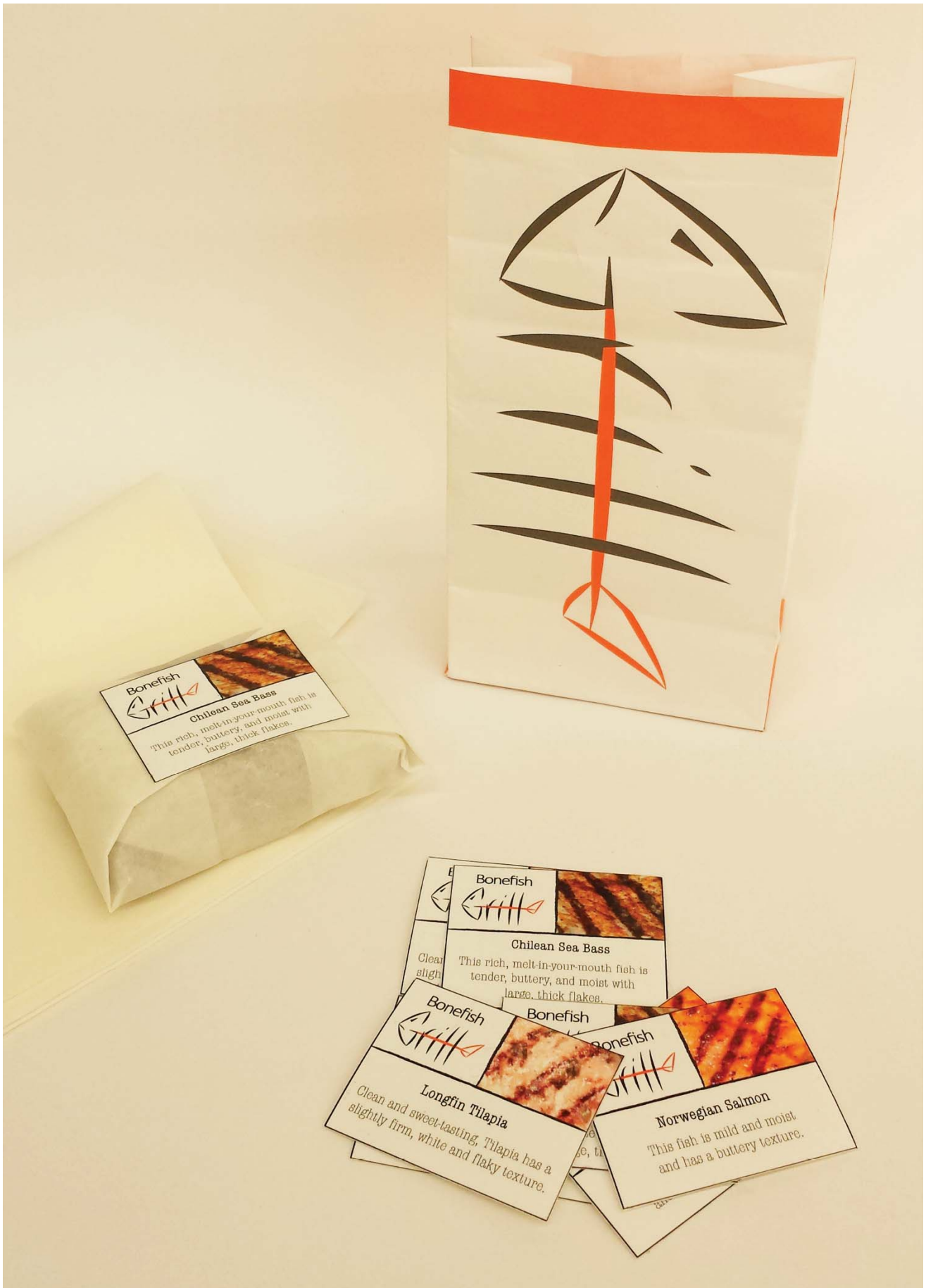
Figure 6: Bonefish Grill Packaging 2.