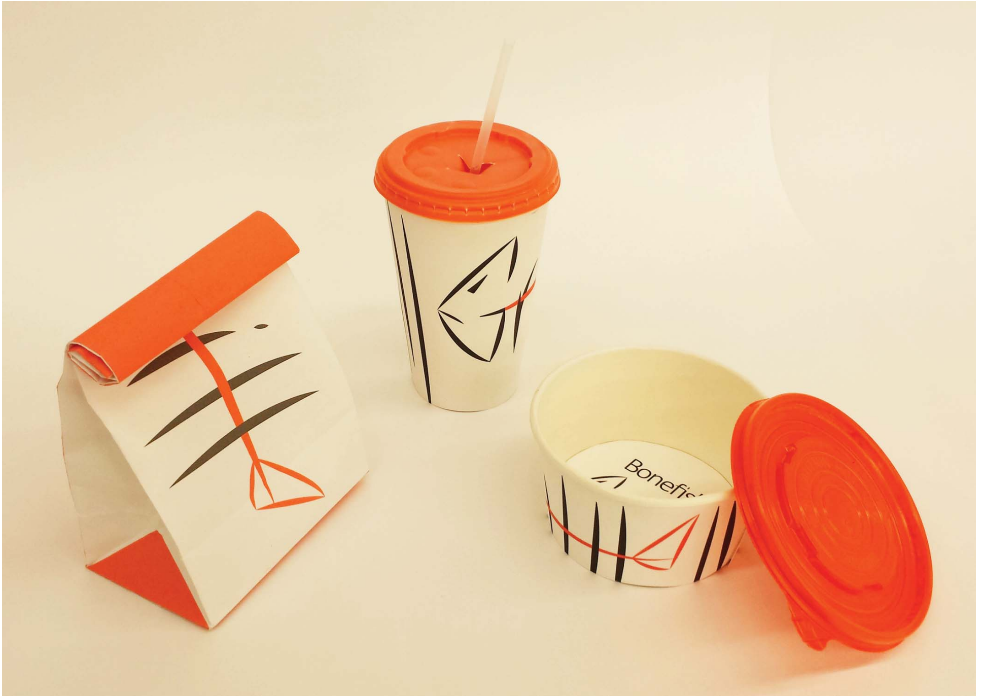
Figure 5: Bonefish Grill Packaging 1.