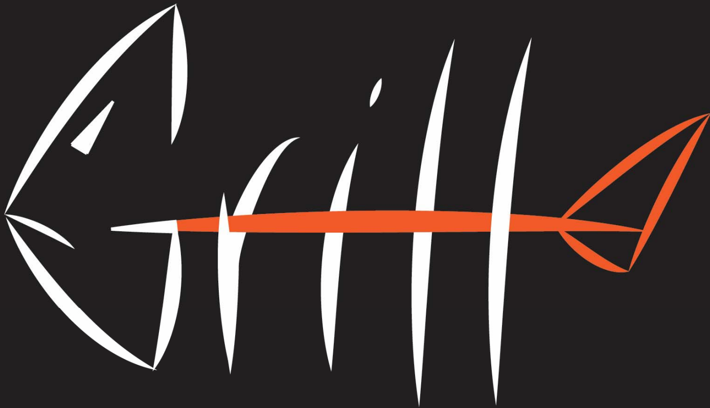
Figure 3: Bonefish Grill Logo Reversed.