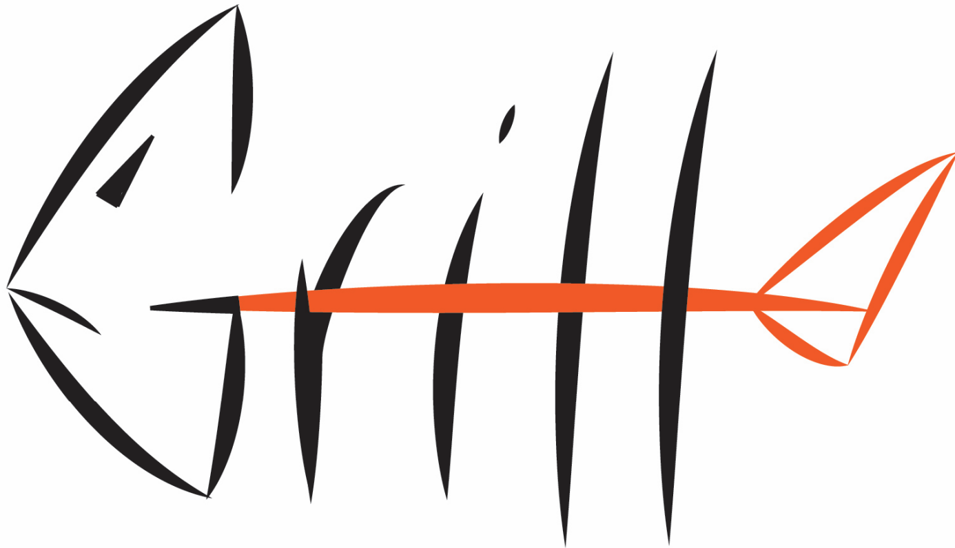
Figure 4: Bonefish Grill Logo.