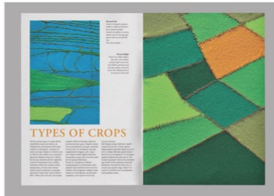
Figure 4: Field Series