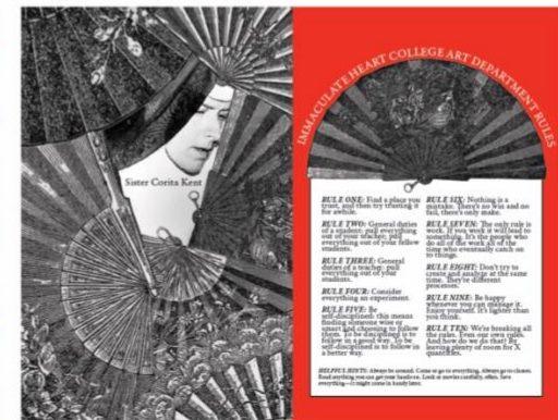
Figure 8: Design Manifestos