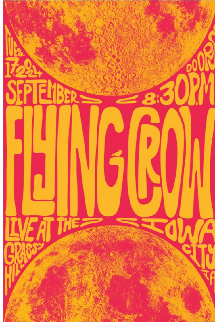
Figure 2: Flying Crow Concert Poster