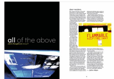
Figure 7: design? Magazine