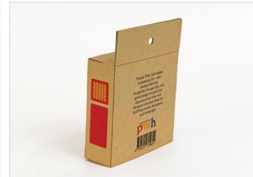
Figure 3: People with Hair