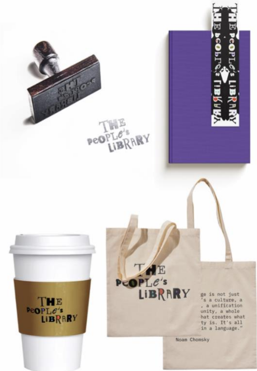
Figure 6: The People's Library