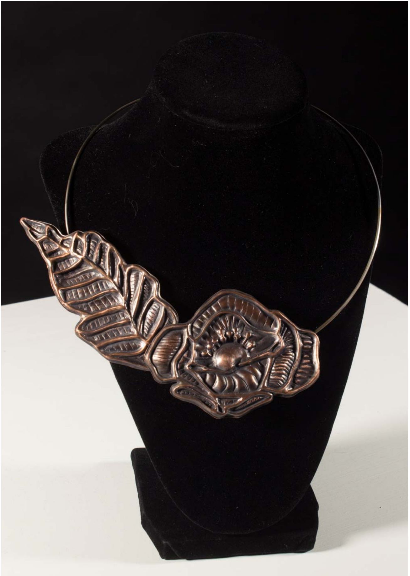
Figure 4: Flowering.