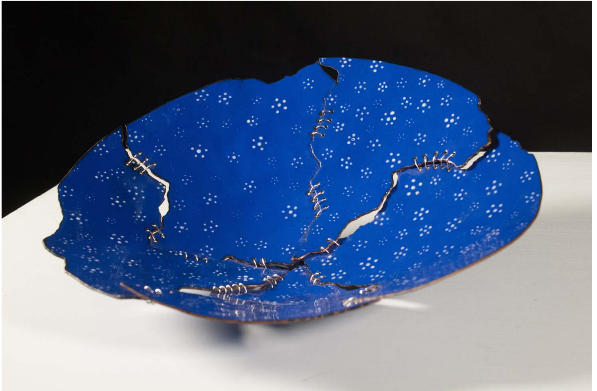
Figure 9: Stitched.