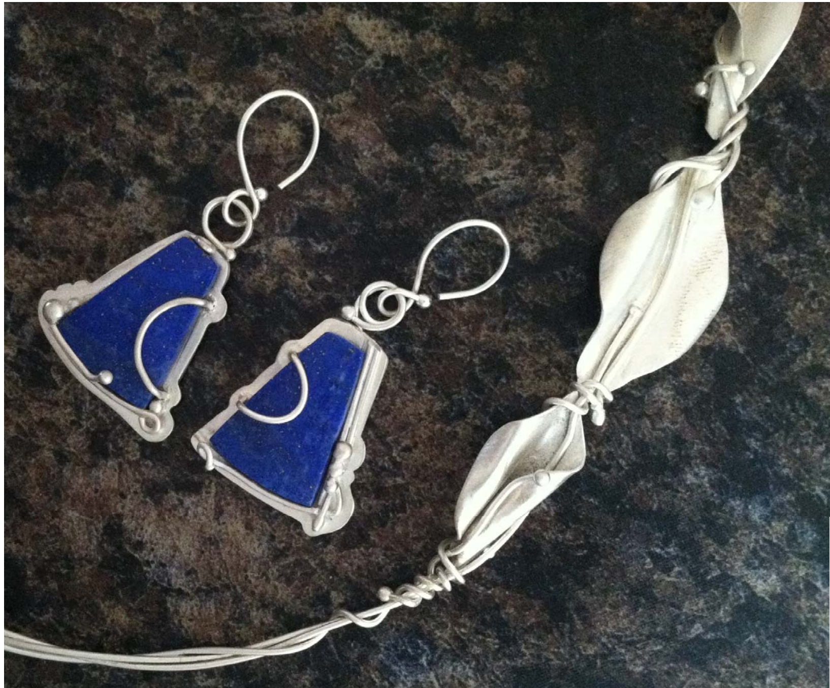
Figure 8: Detail.