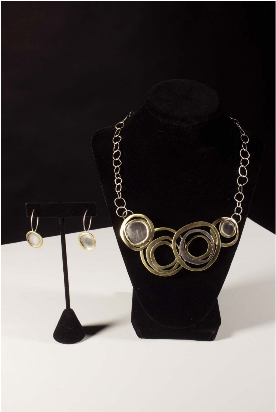
Figure 5: Rippling.