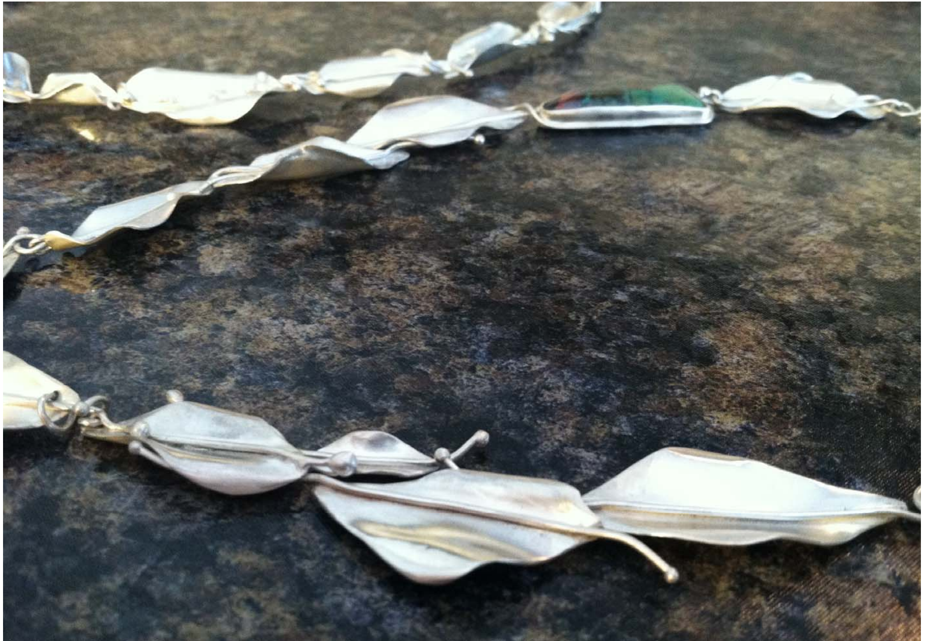
Figure 7: Detail.