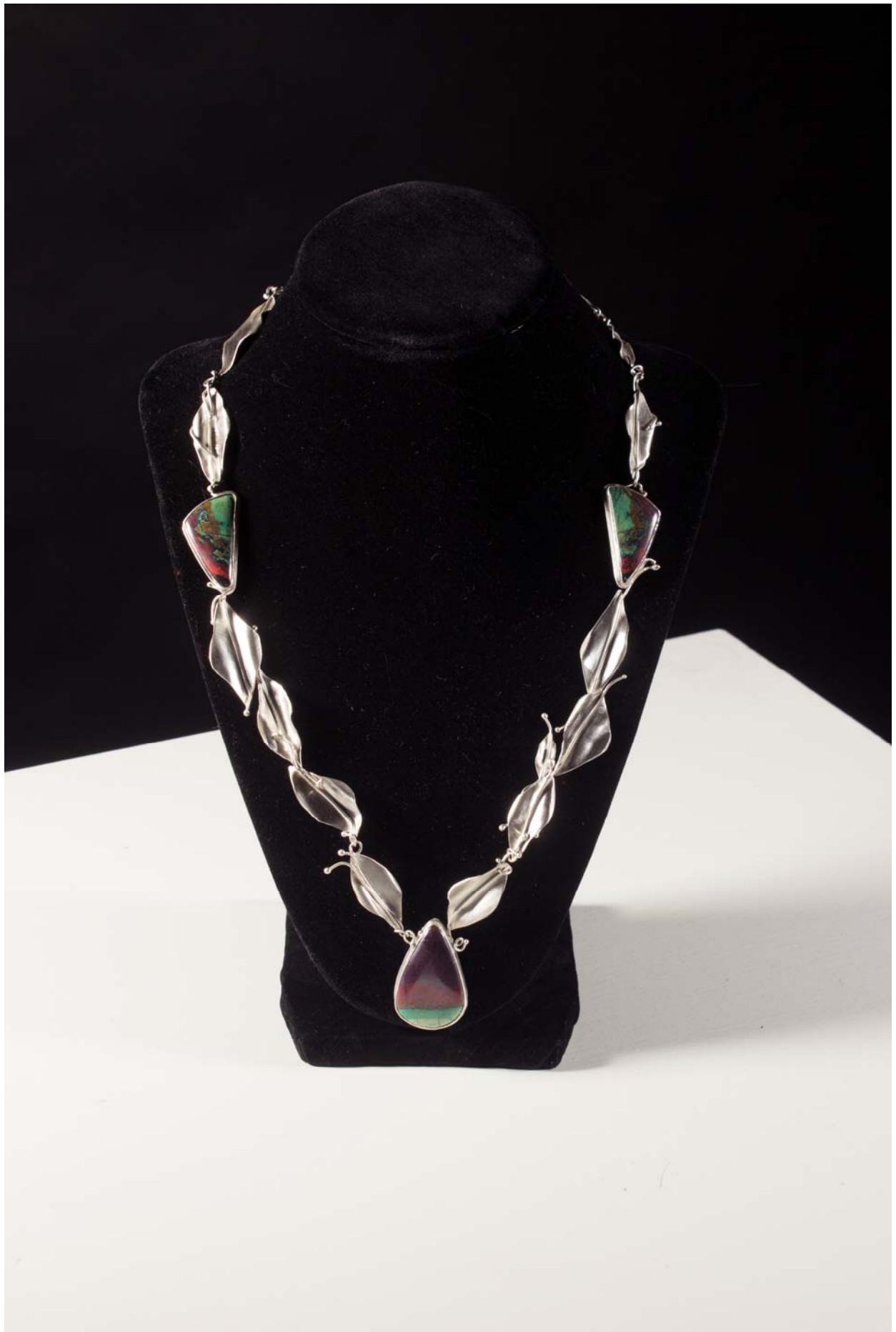
Figure 1: Growing.