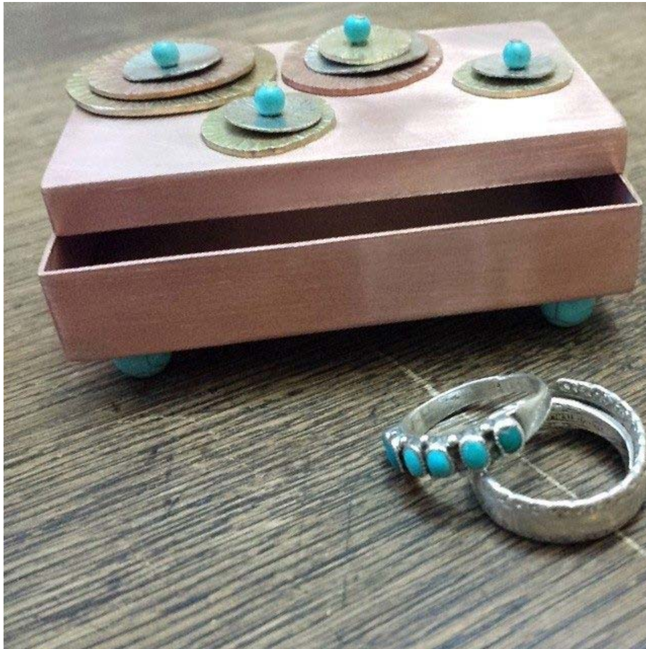
Figure 10: Box.