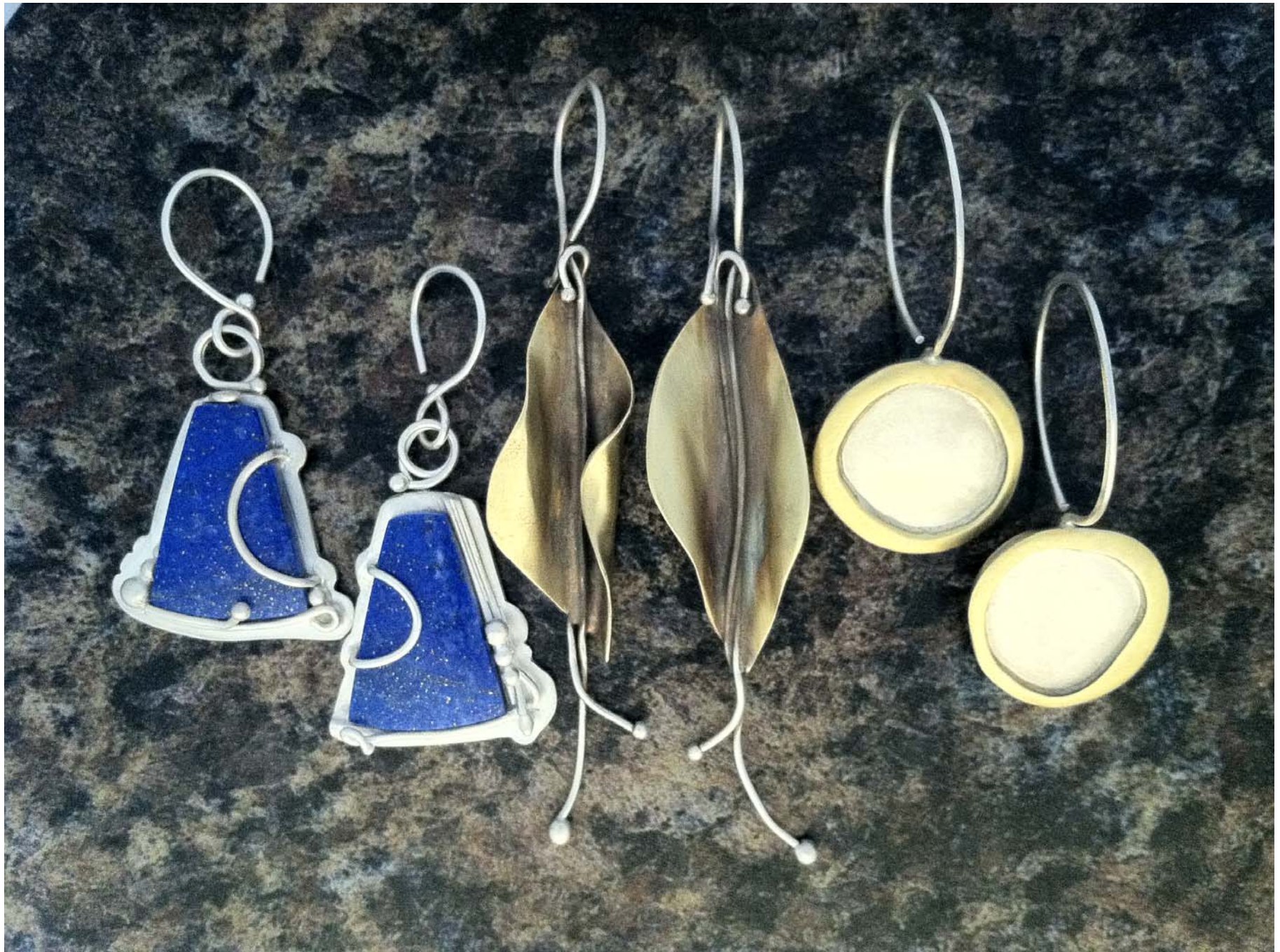
Figure 6: Various Earrings.