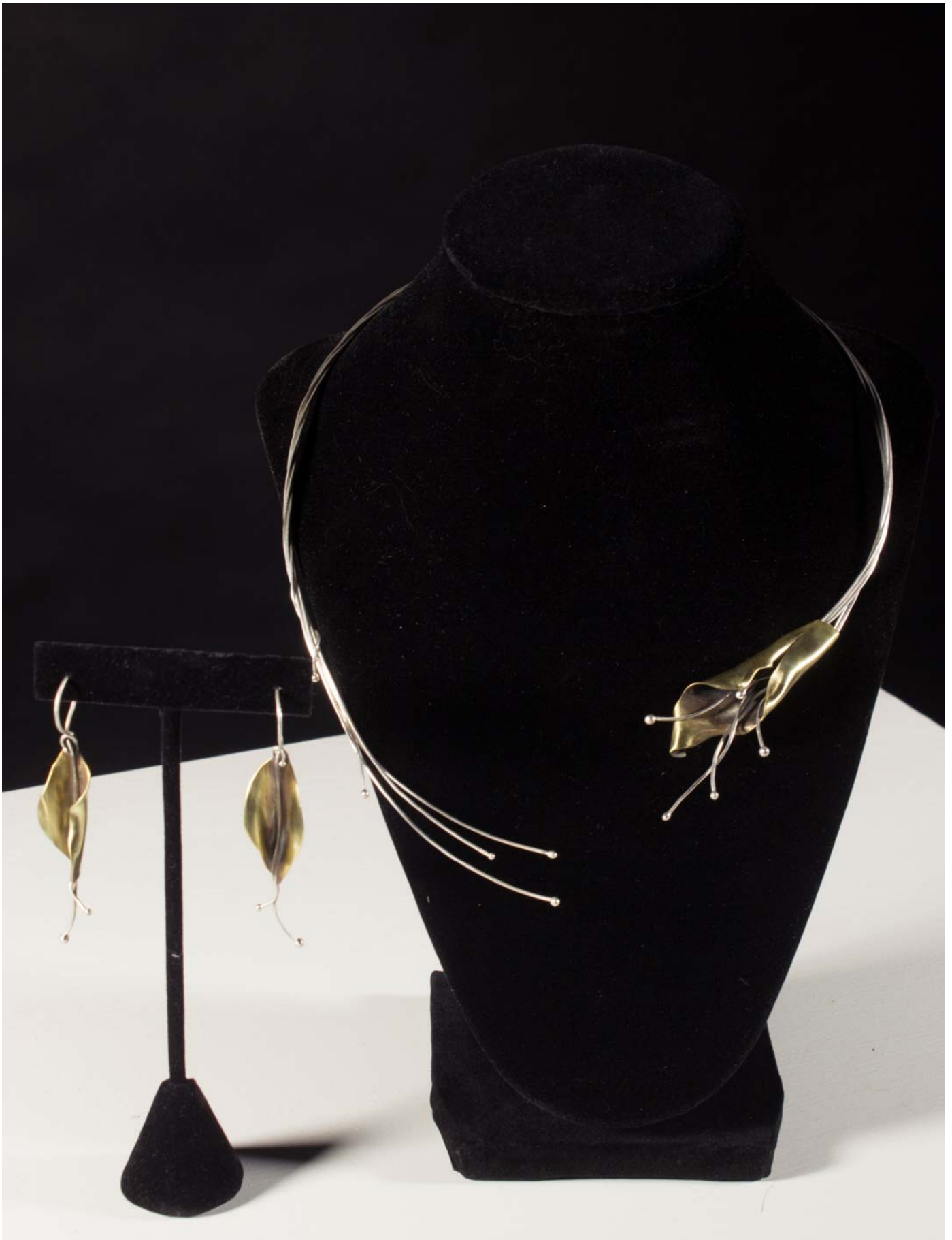
Figure 3: Blossoming.