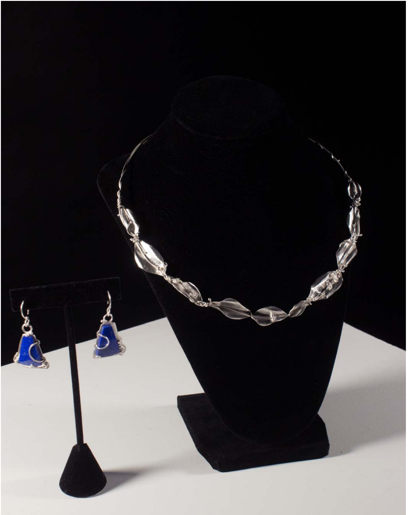
Figure 2: Maturing.