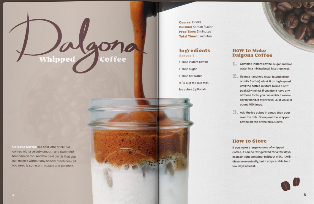
Figure 3: Dalgona Coffee Magazine Article