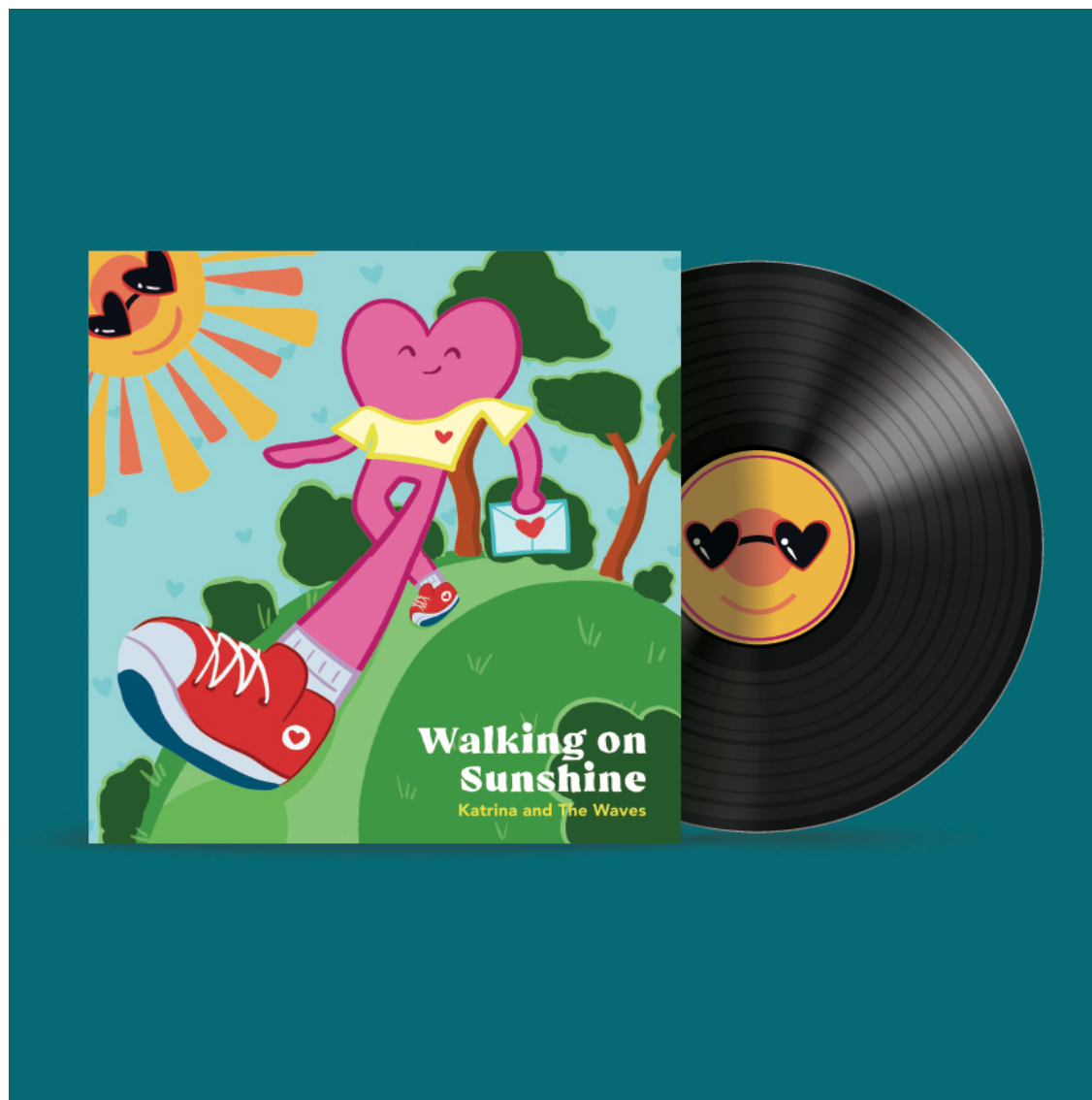
Figure 1: Walking on Sunshine Album Cover