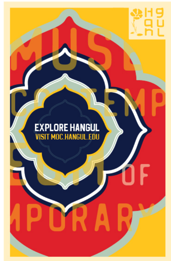
Figure 2: Museum of Contemporary Hangul Poster Series