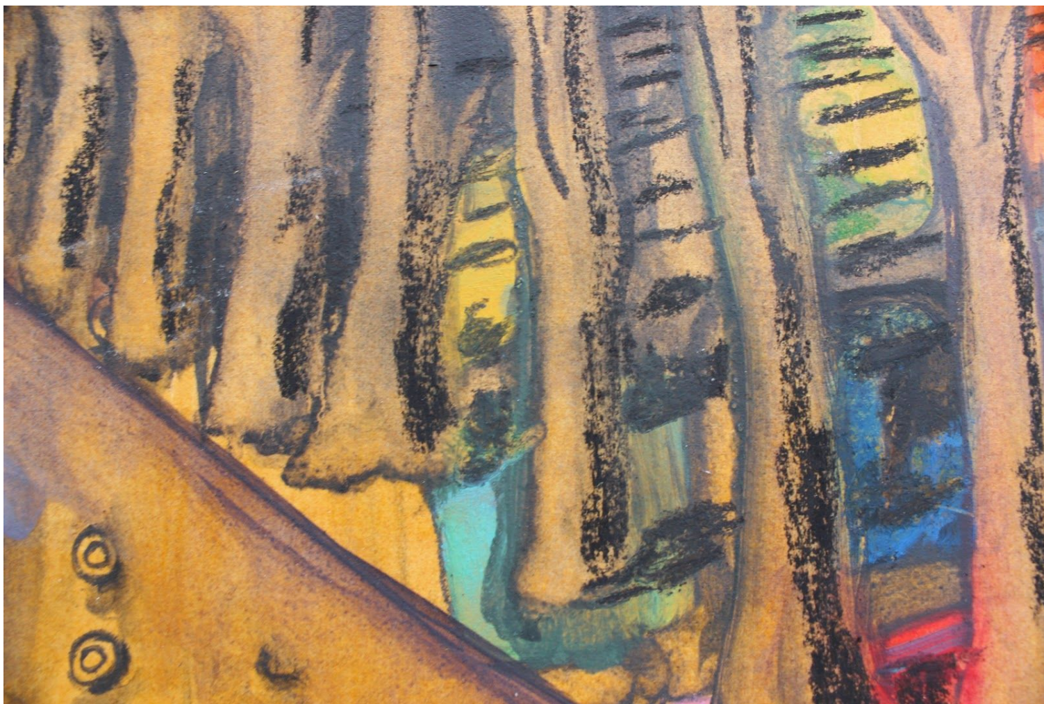
Figure 3: The Ice Cream dream, detail 2