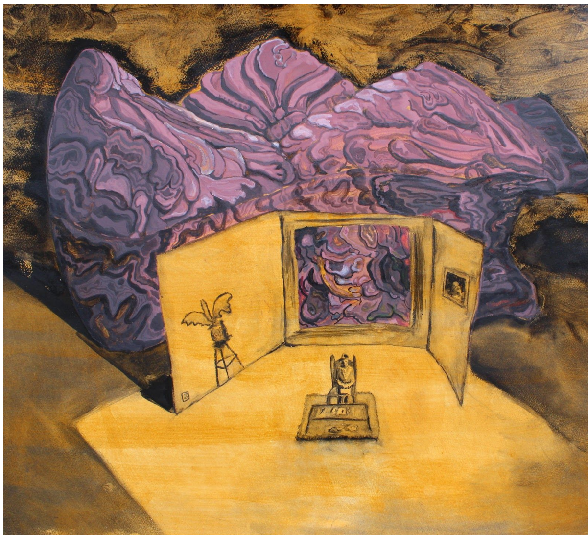
Figure 10: The Tolo and Bulgarian Dream Bowl dream