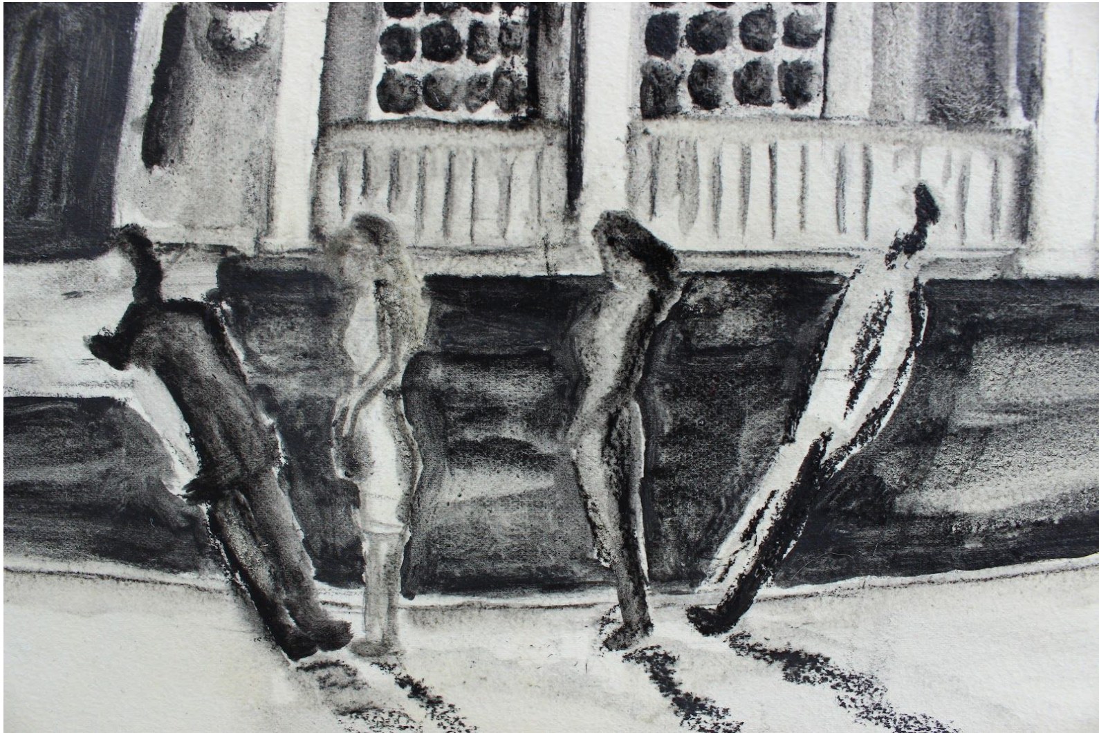
Figure 7: The Ferris Wheel dream detail