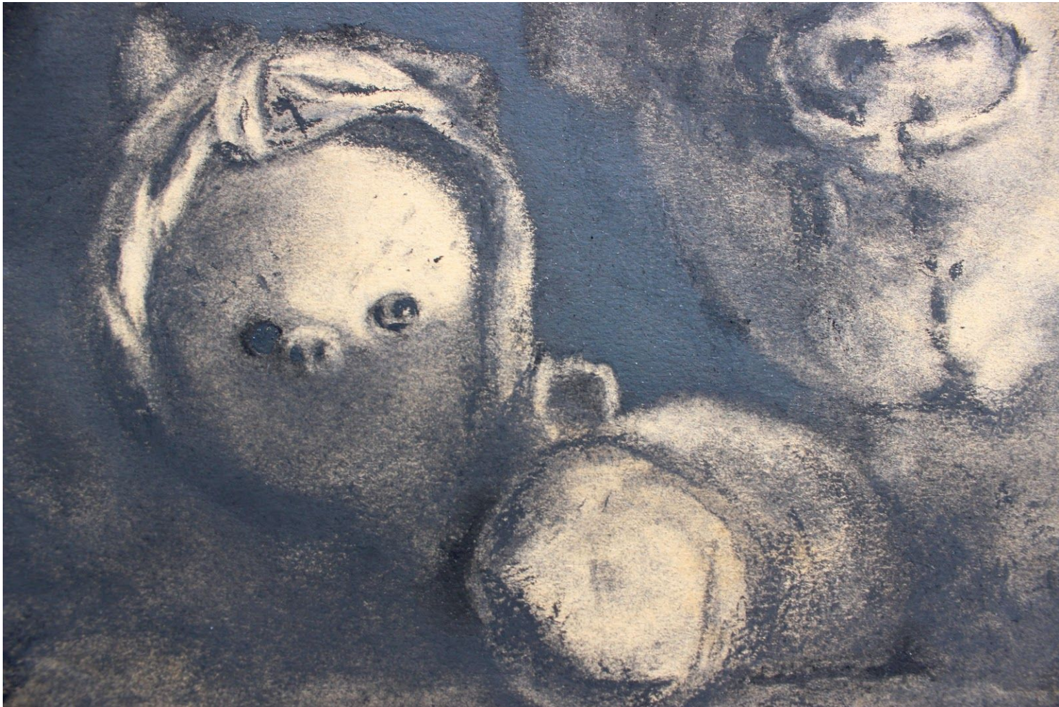
Figure 9: The Reoccurring Pig dream detail