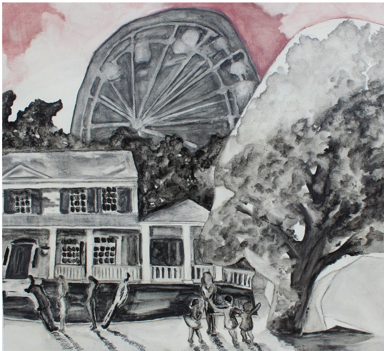
Figure 6: The Ferris Wheel dream