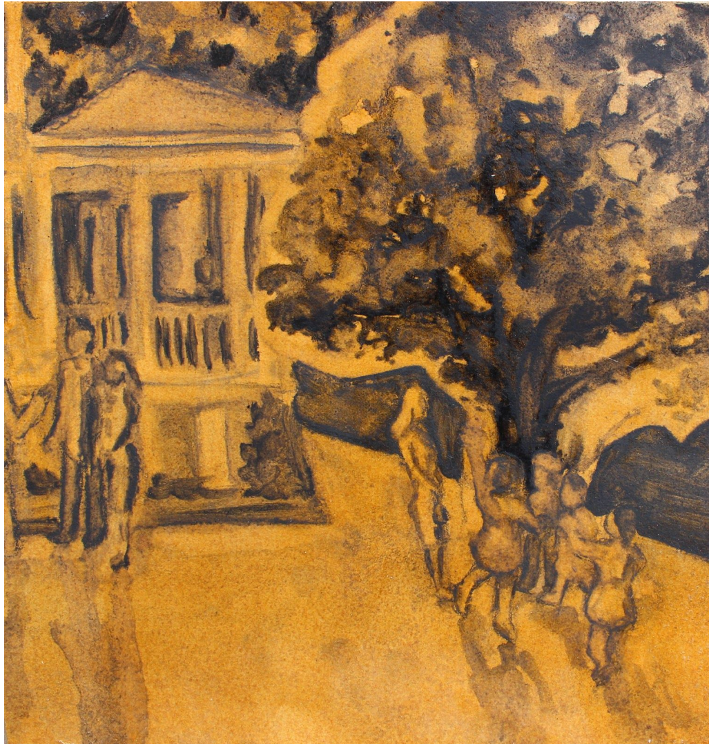
Figure 5: Study for Ferris Wheel dream