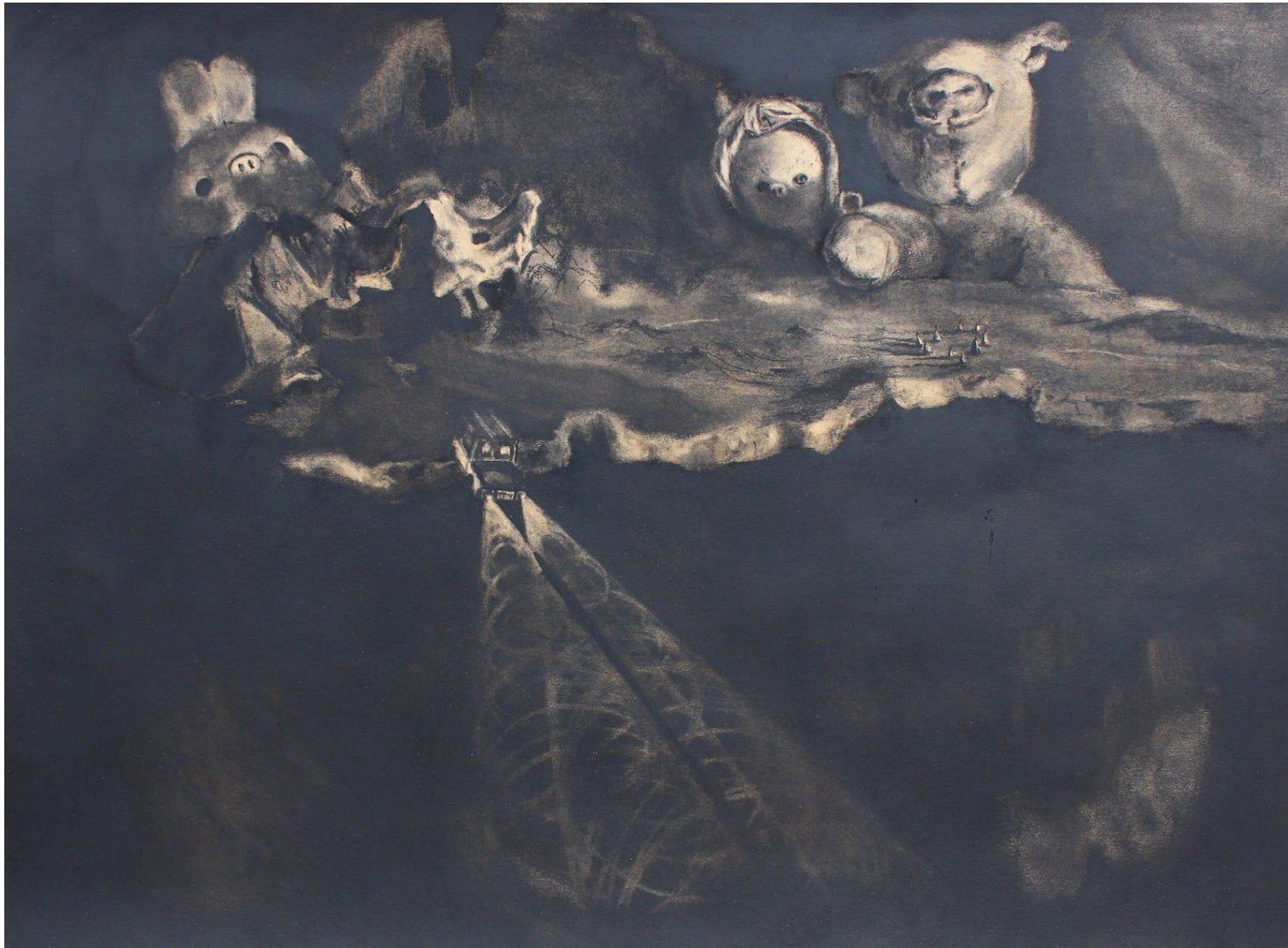
Figure 8: The Reoccurring Pig dream