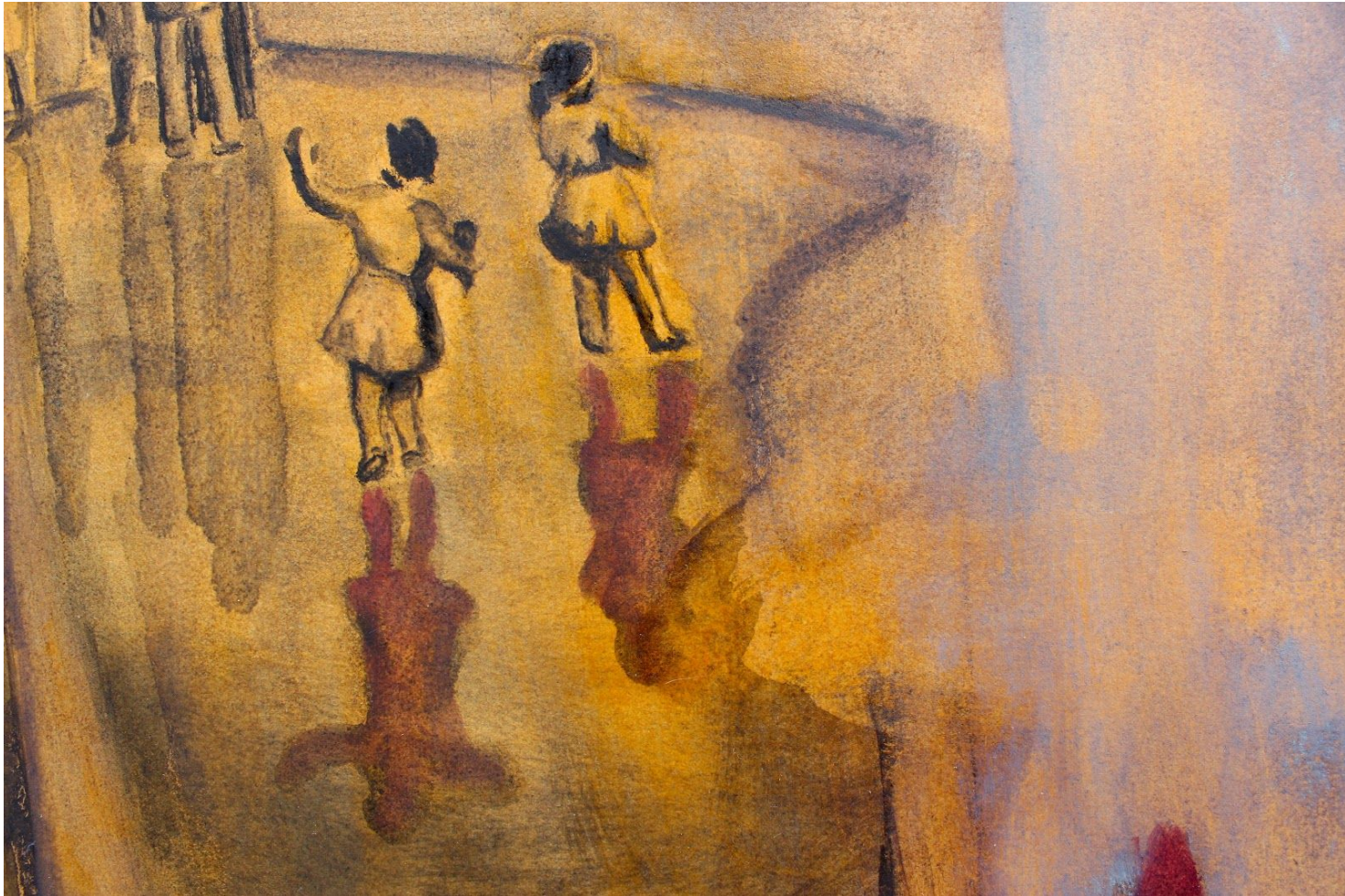
Figure 2: The Ice Cream dream, detail 1