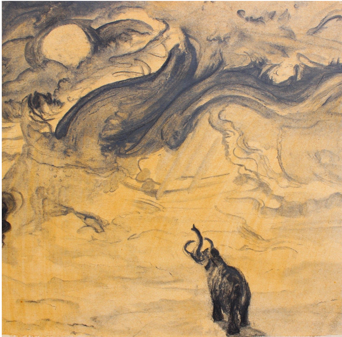
Figure 4: The Woolly Mammoth dream