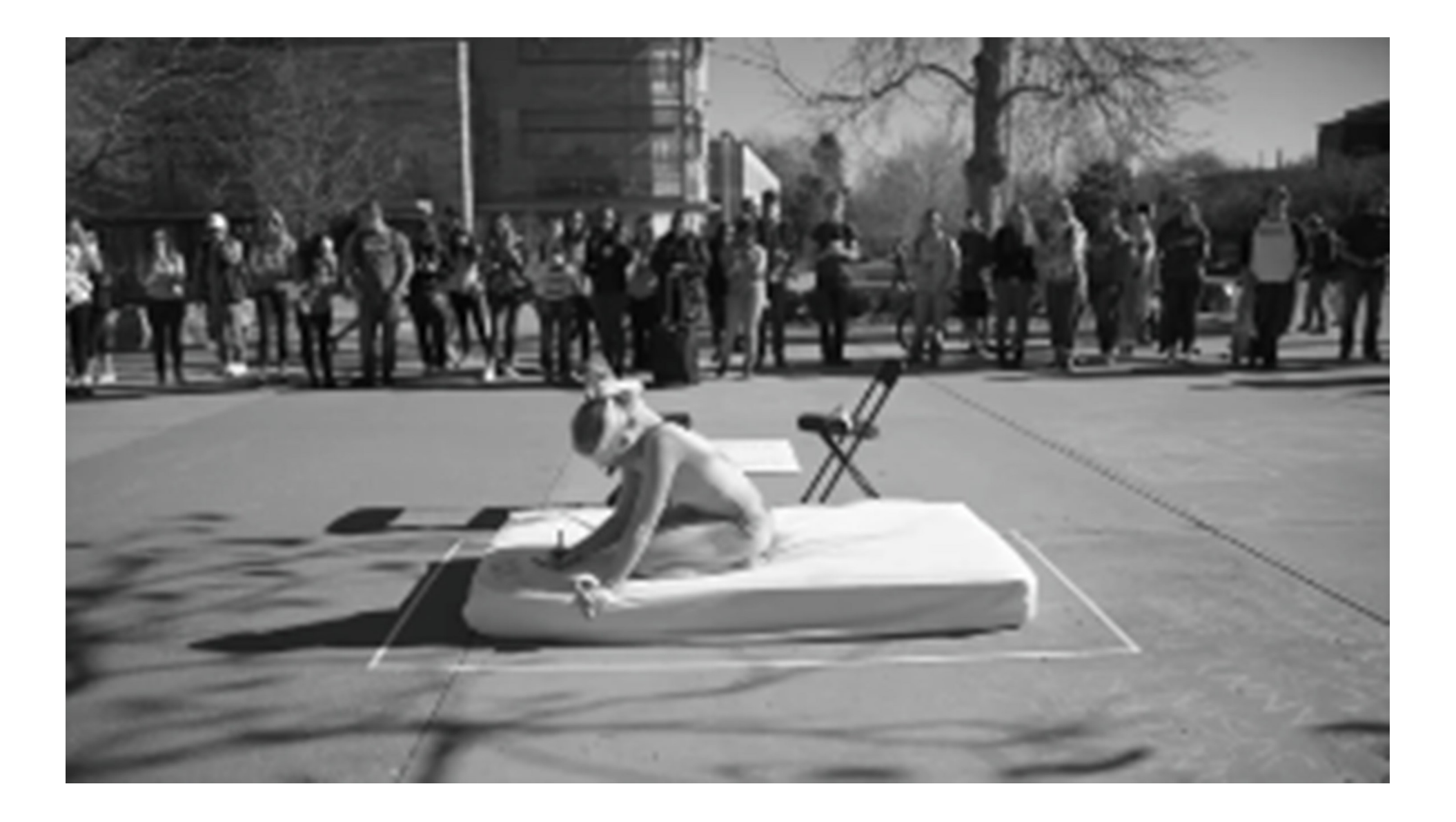
Figure 1: Asking For It.