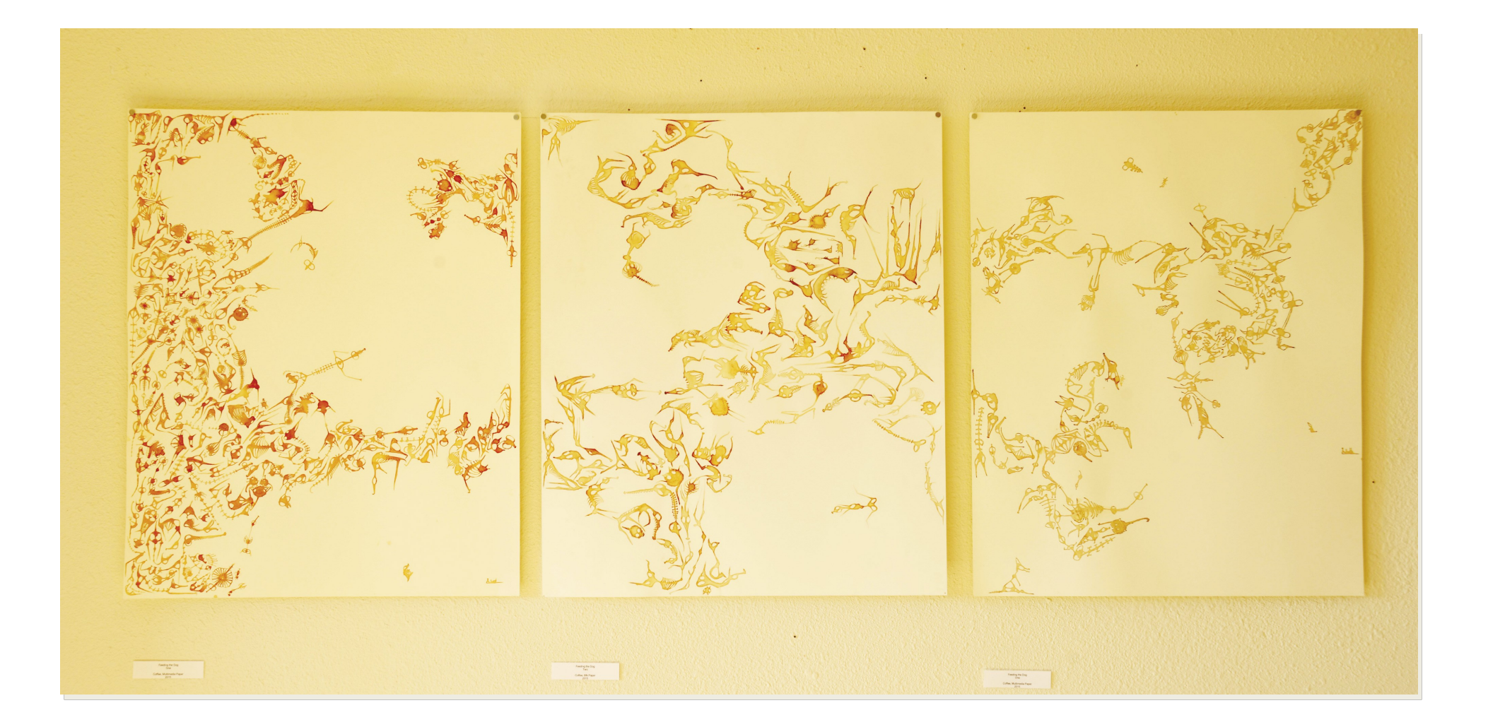
Figure 10: Feeding The Dog.