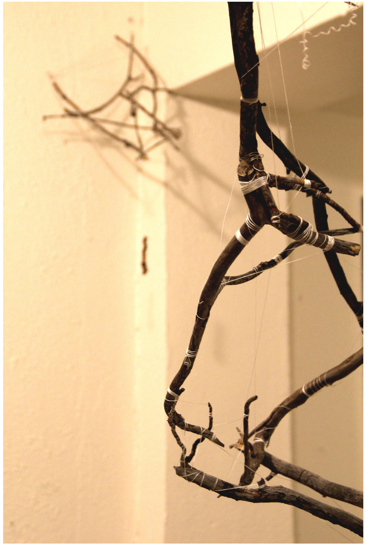
Figure 11: It's Only Temporary.