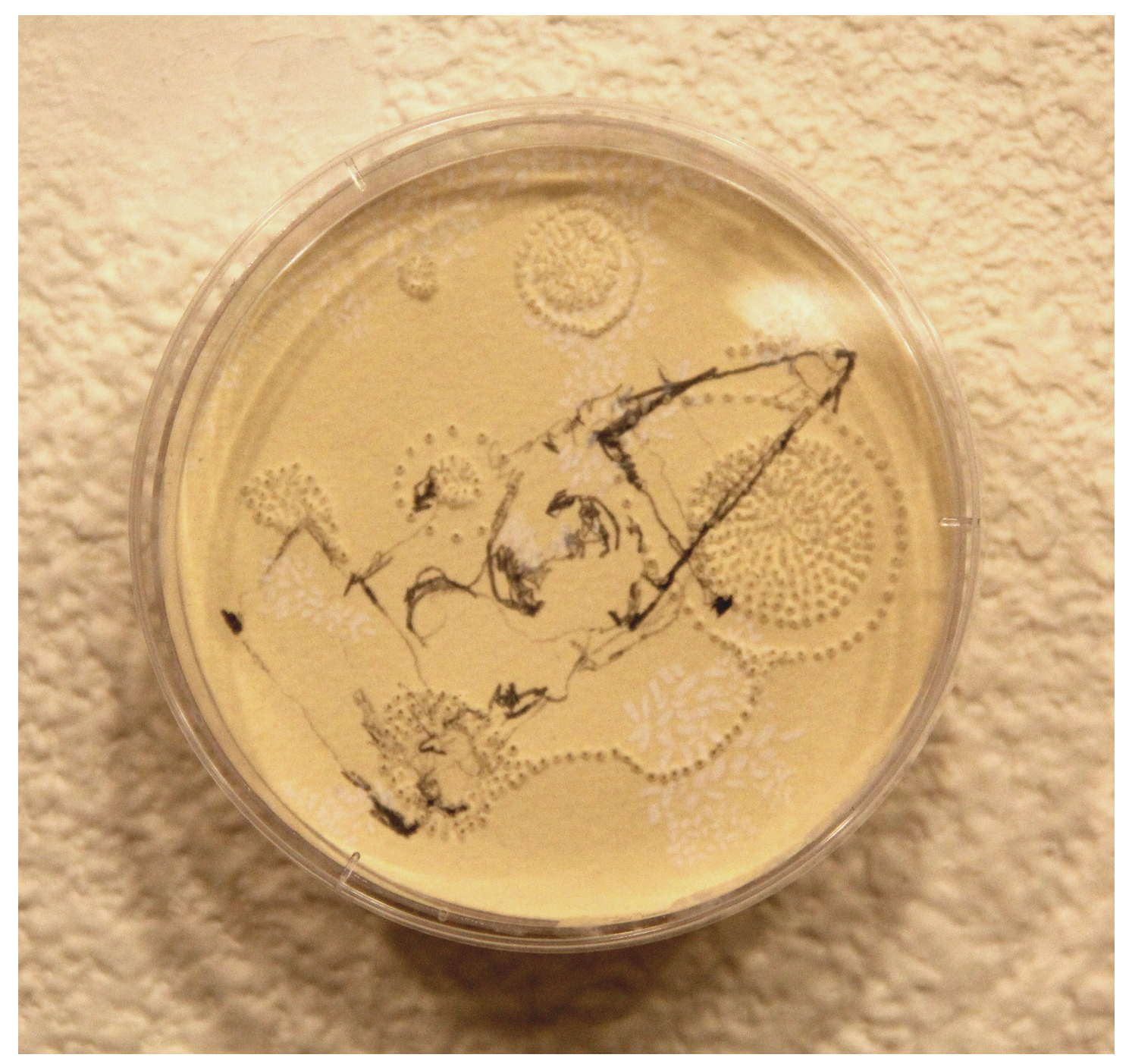
Figure 9: Sanctuary Petri Dish.