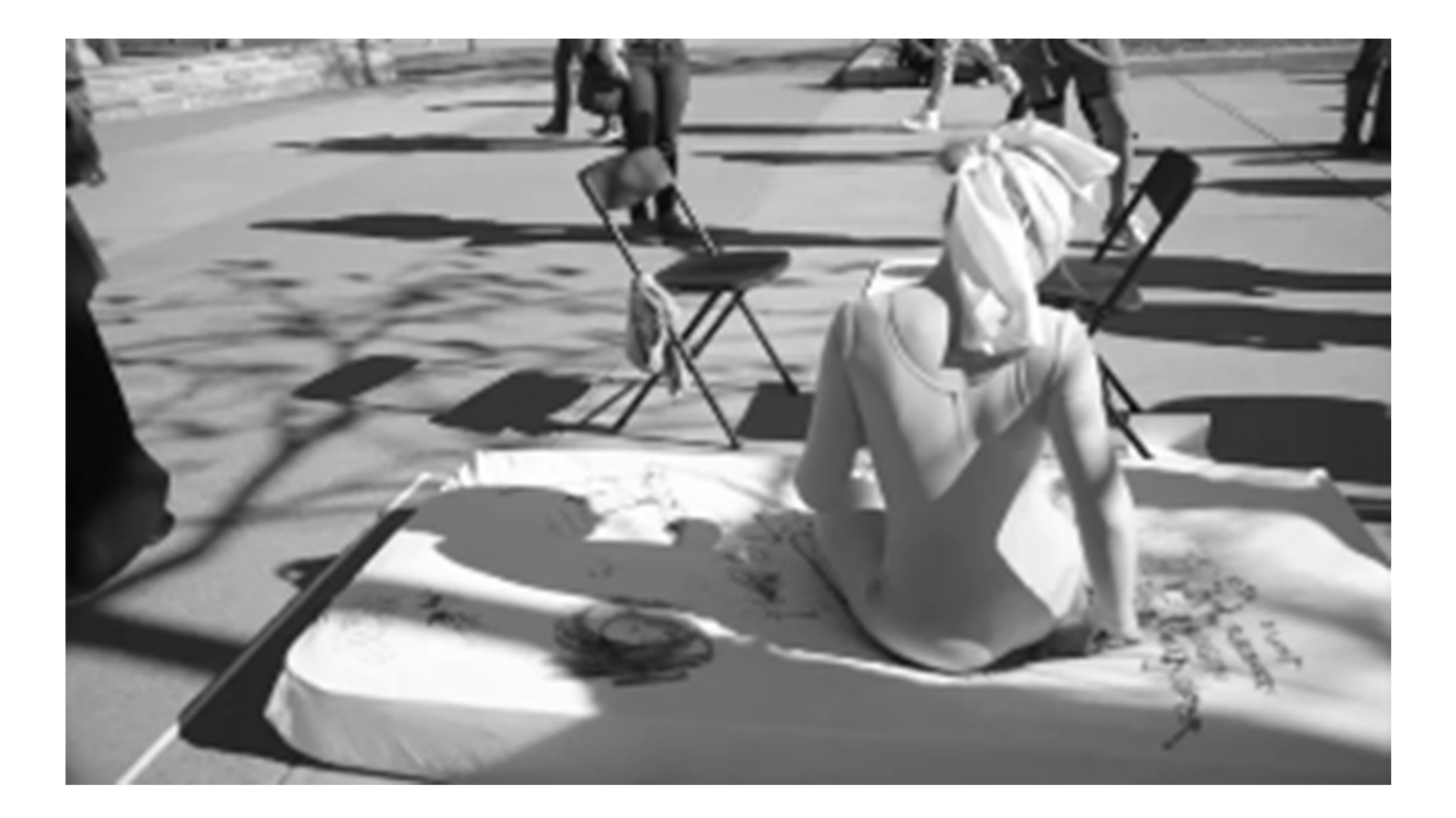
Figure 3: Asking For It.