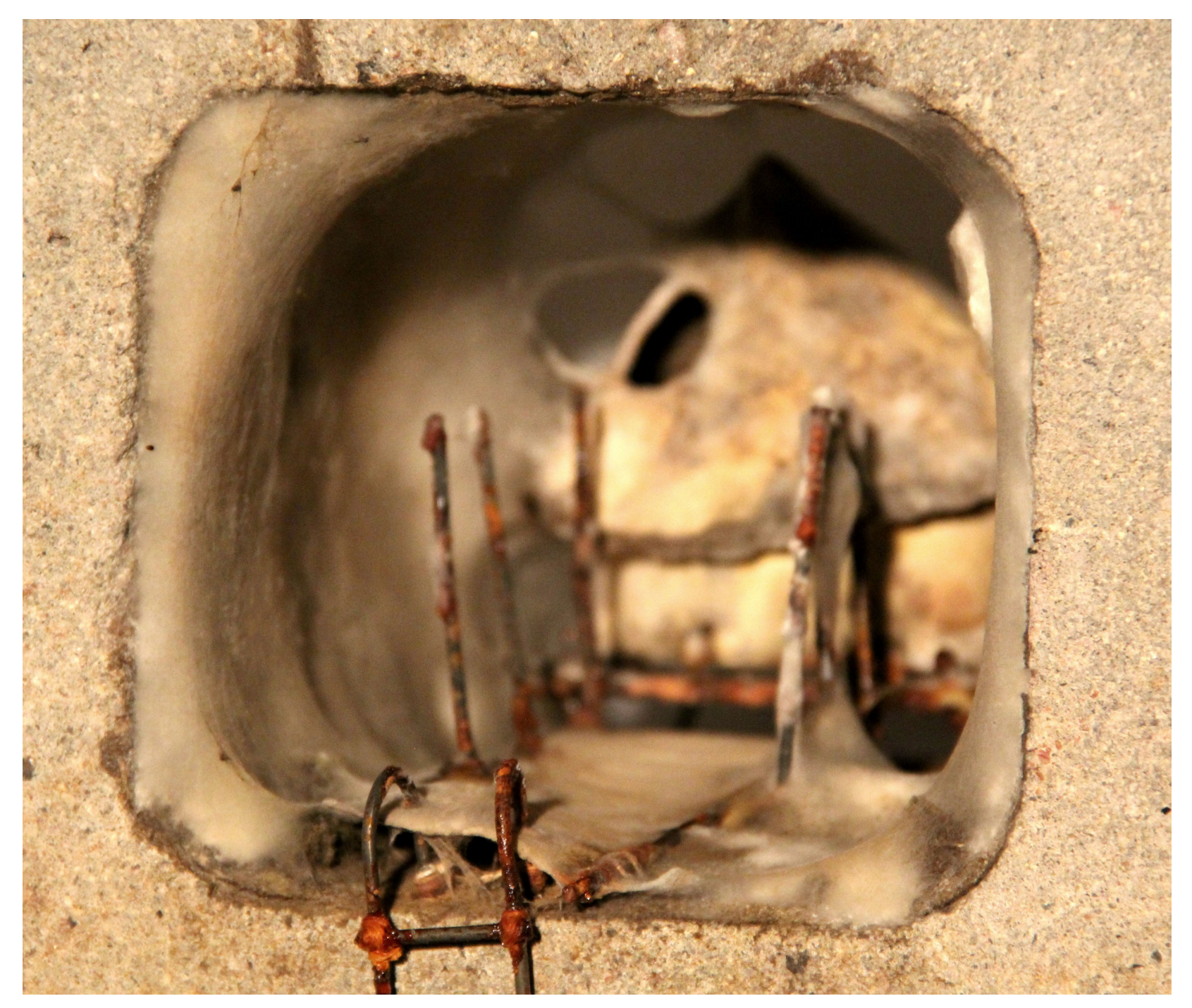
Figure 5: Sanctuary 2.