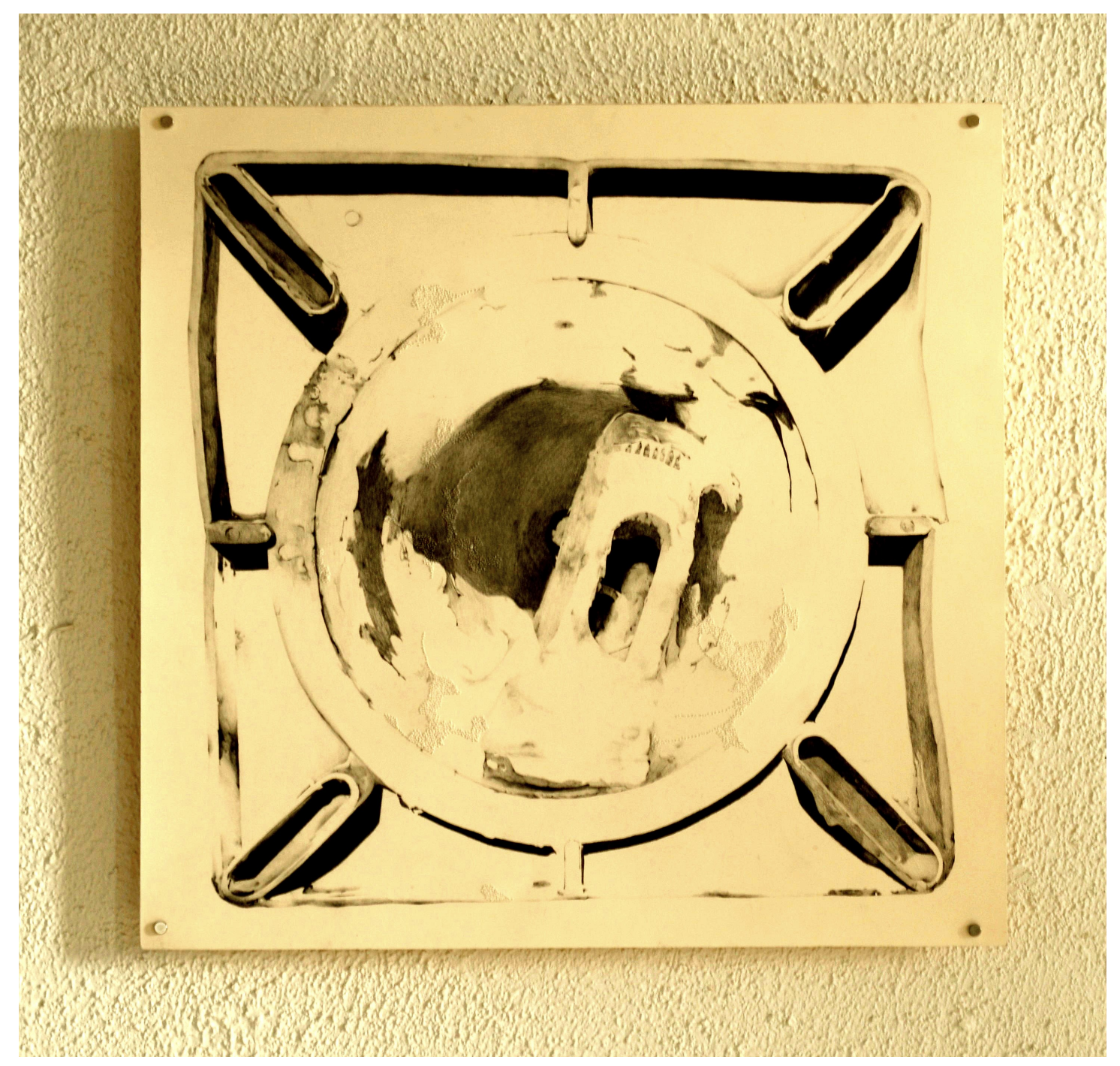
Figure 8: She Dresses Her Stones in Gold and Lets Her Sons Go Naked.