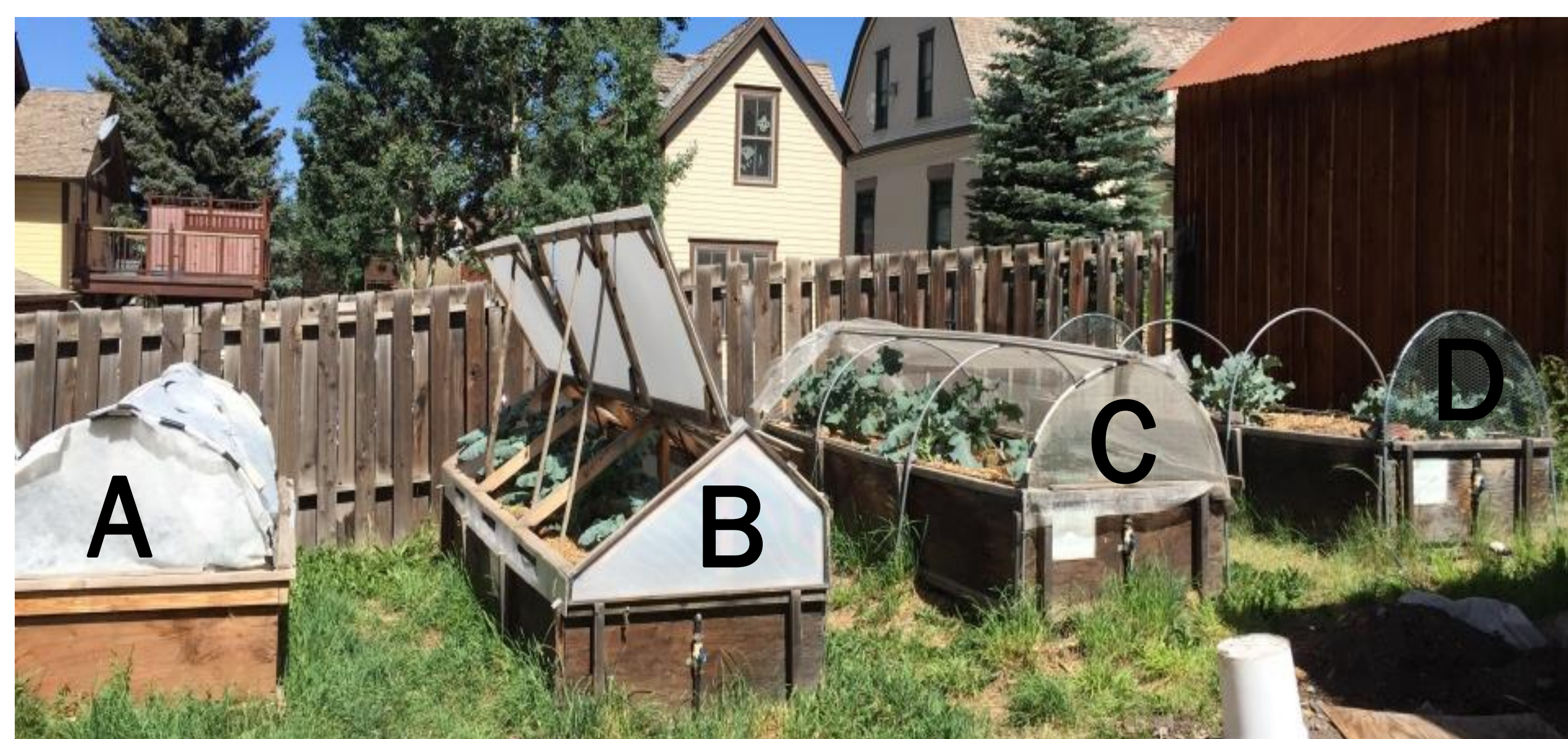
Figure 2. Season extension cover materials over research beds. A:17% Row Cover Material, B:Solexx, C:Diobetalon, D: Control w/ plastic chicken wire