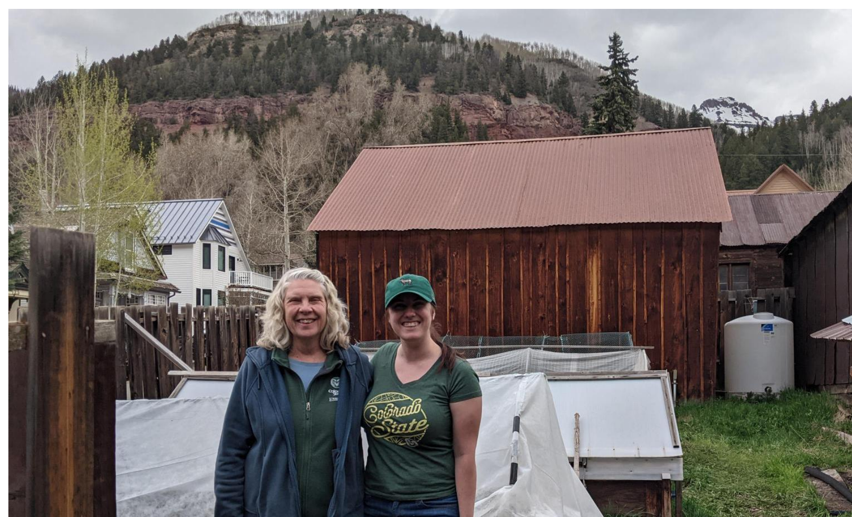
Figure 1. 2023 Internship visit at the Telluride research beds.

There is an increased demand for local food production in rural Colorado mountain communities, like Telluride, with extremely short growing seasons where residents must rely on fresh produce and other food items that are trucked into the area. Season extension techniques and growing adapted varieties play a necessary role in crop production in these communities.