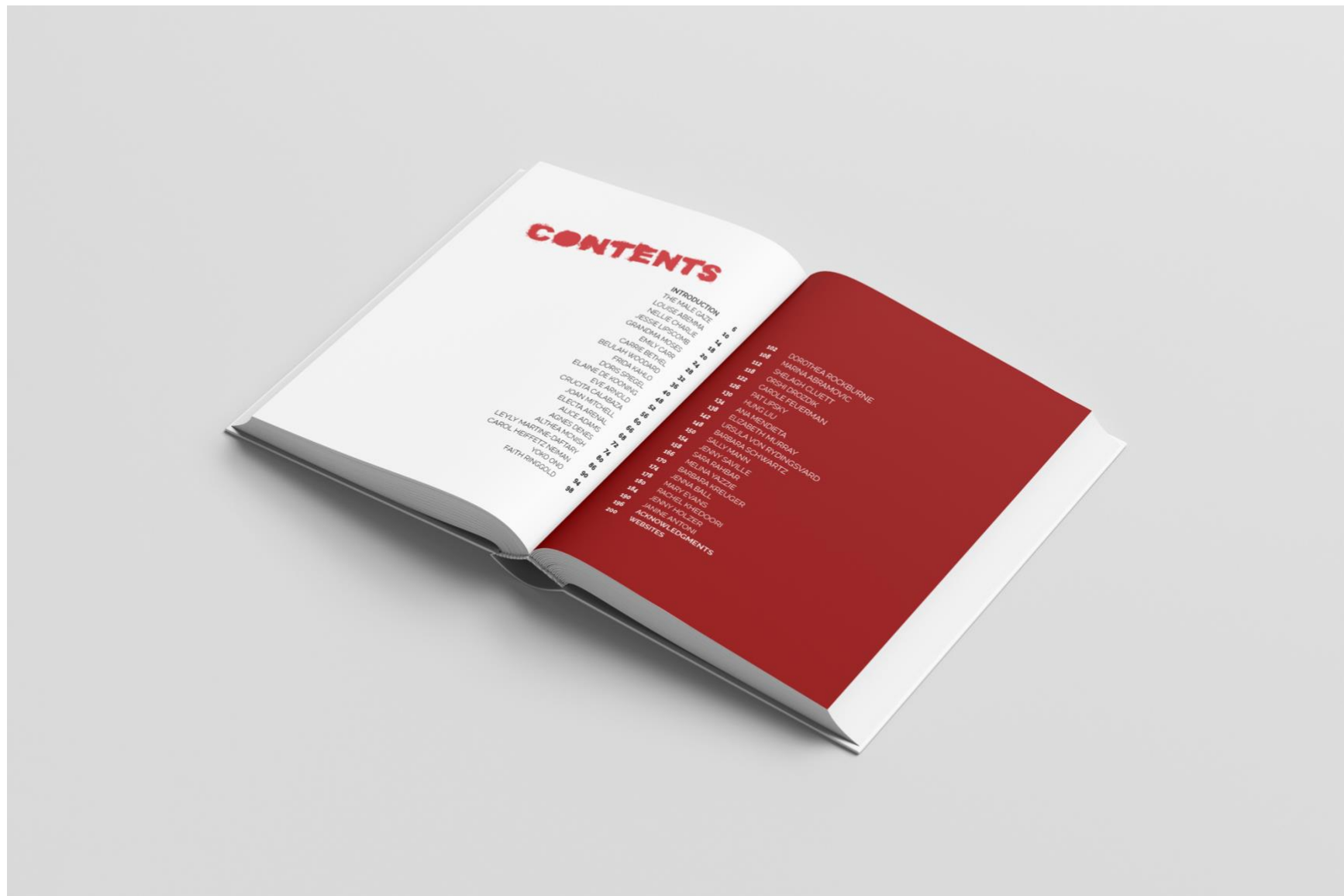
Figure 7: Taking It Back Exhibition Book Contents Page