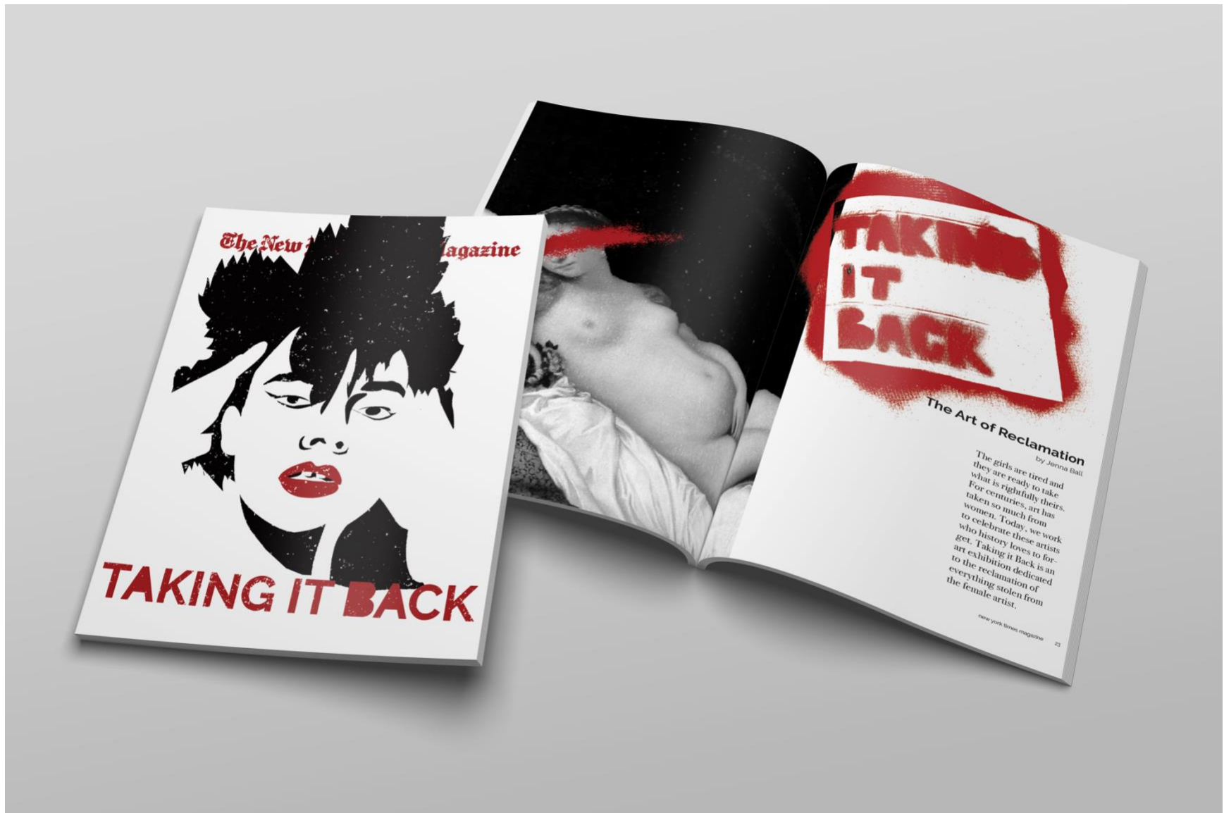
Figure 3: Taking It Back Magazine Design