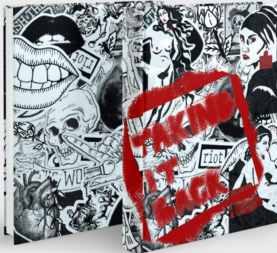
Figure 5: Taking It Back Exhibition Book