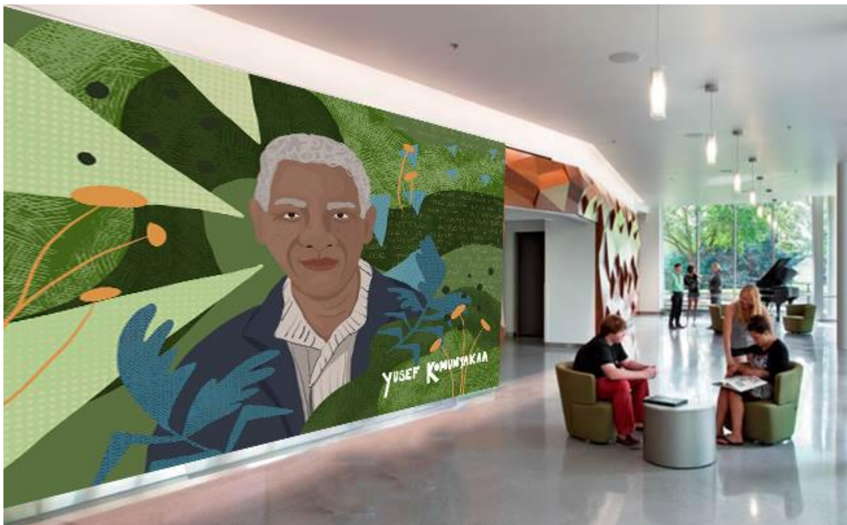
Figure 10: CSU Alumni Mural