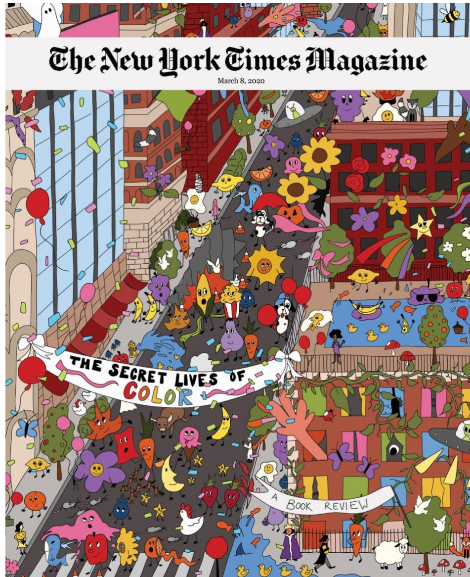
Figure 1: Hues You Can Use Cover