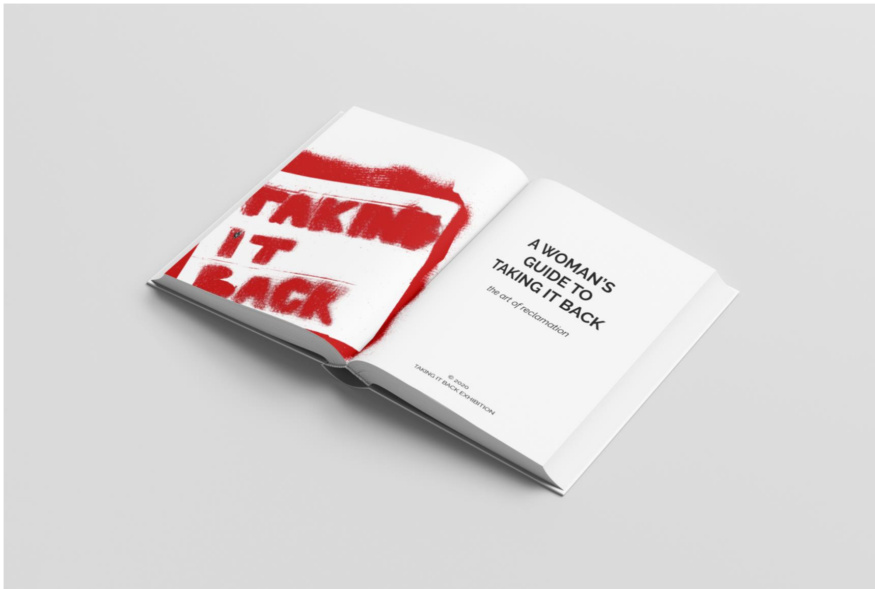
Figure 6: Taking It Back Exhibition Book Intro Page