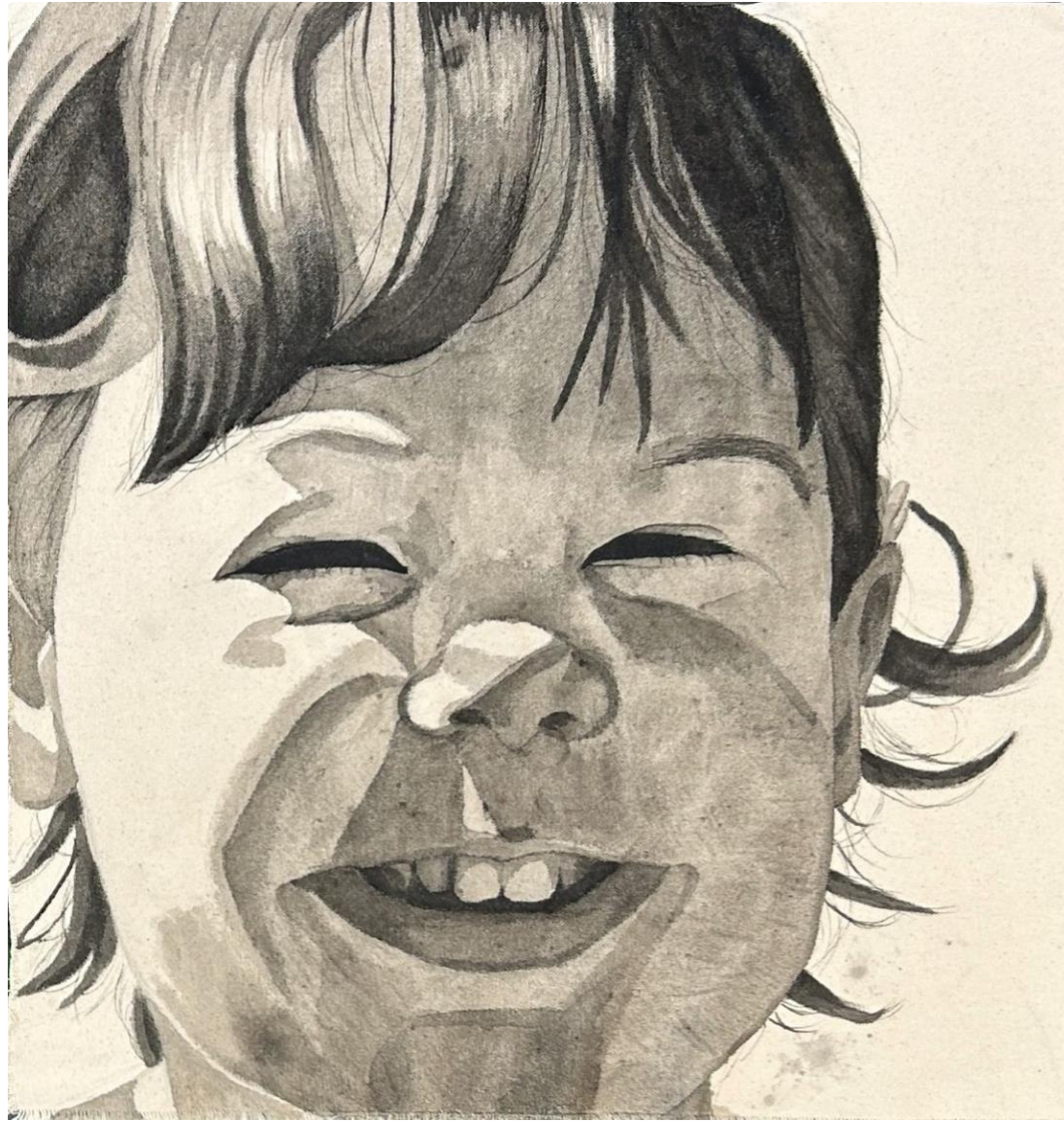
Figure 5: A Glimpse of Childhood, Detail 2