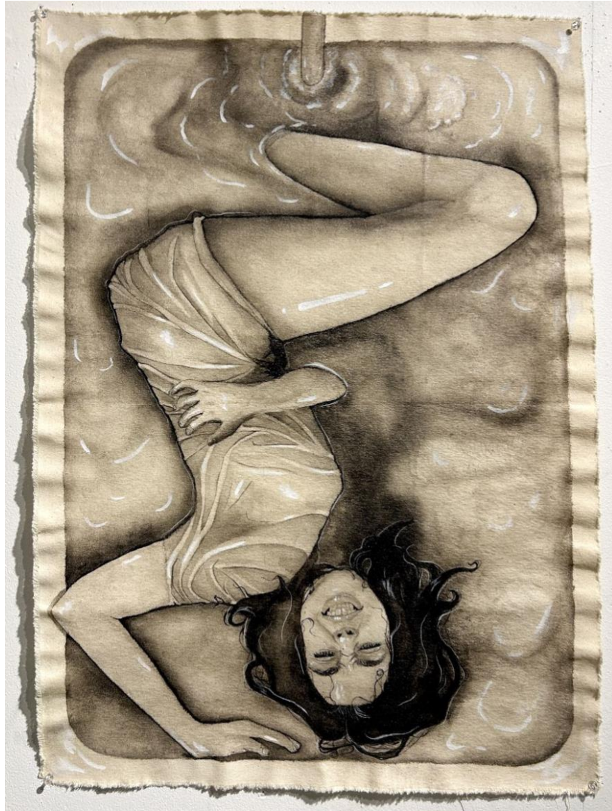
Figure 6: Untitled