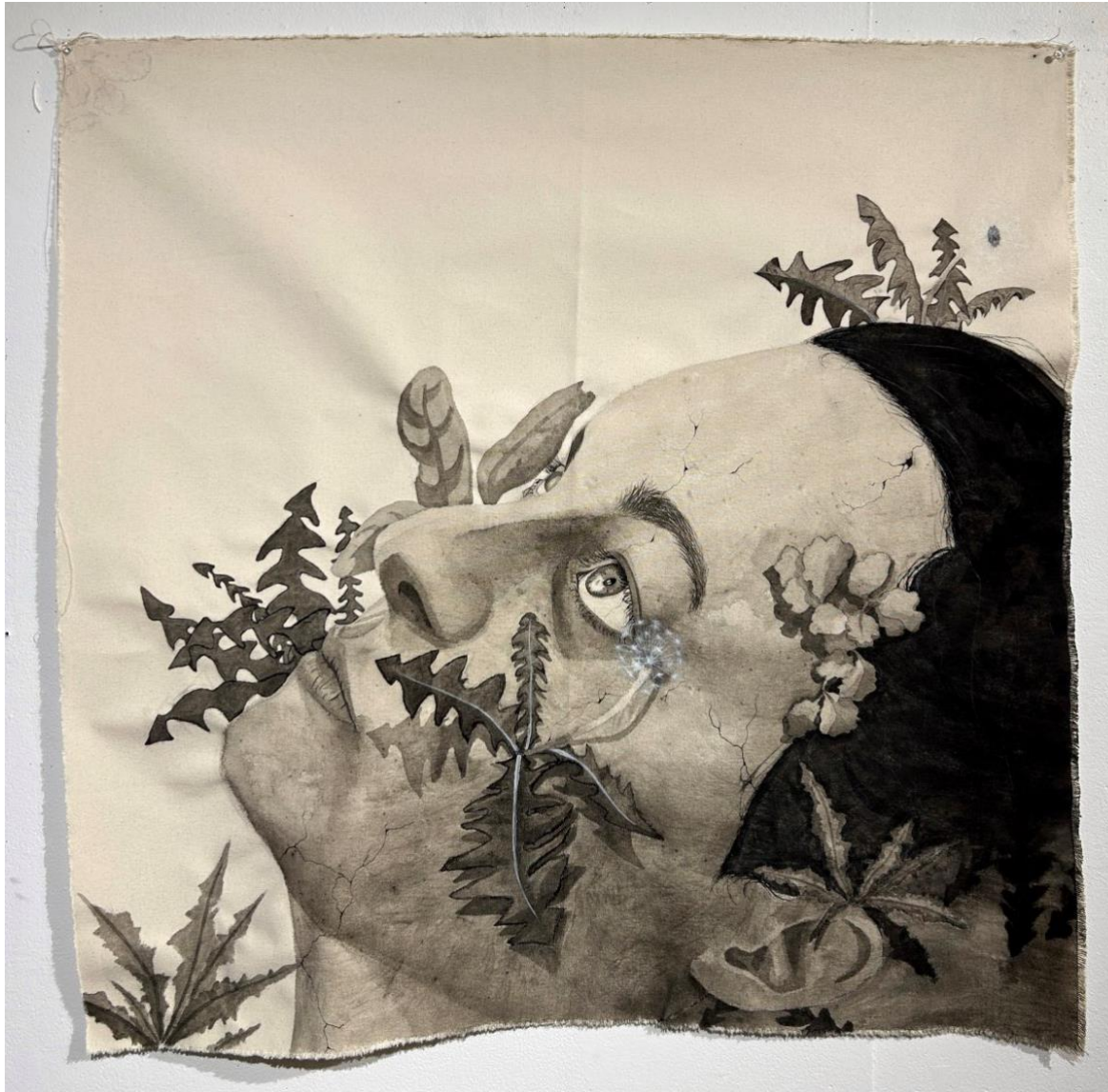
Figure 2: Weeds