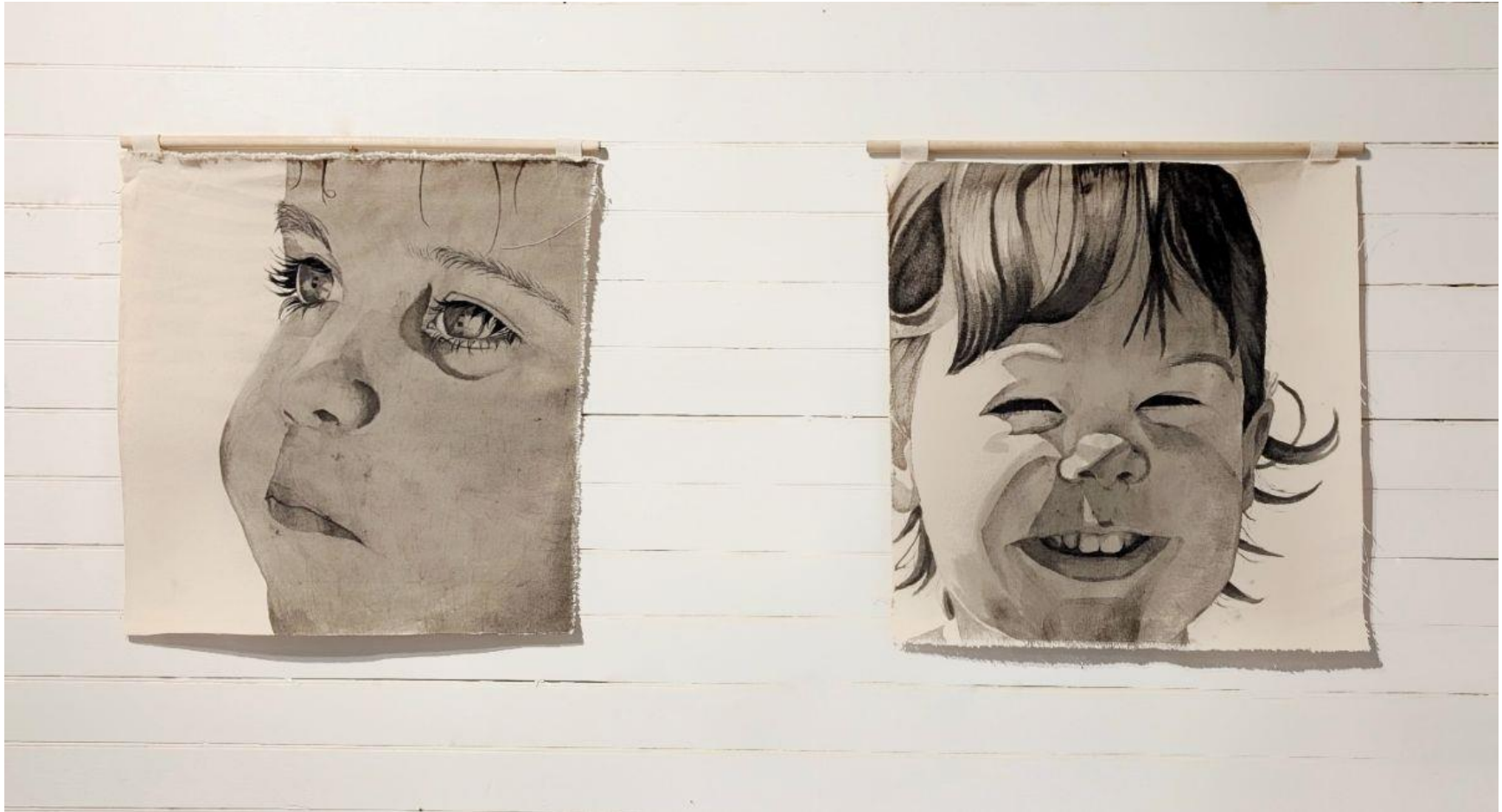
Figure 3: A Glimpse of Childhood