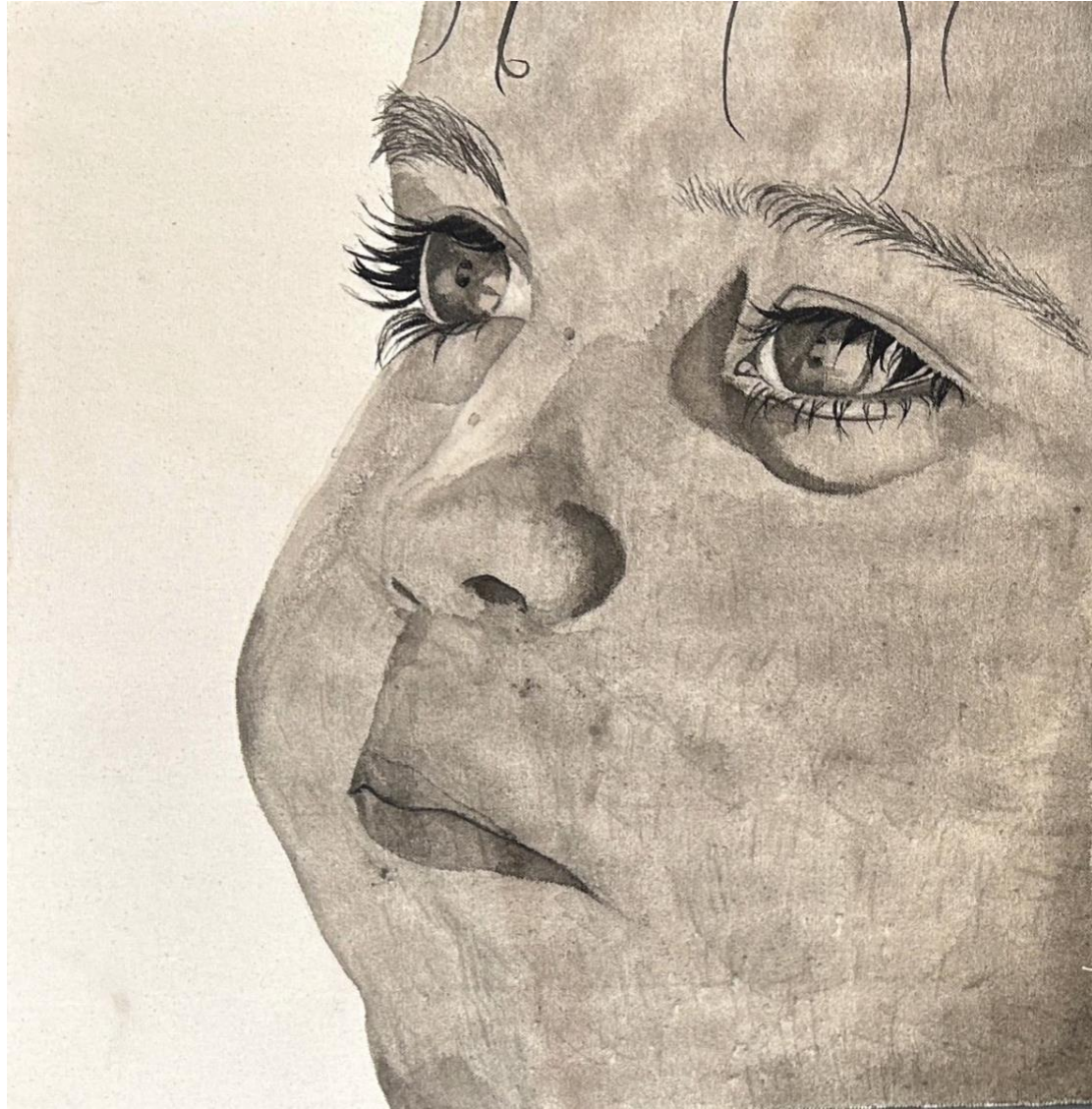
Figure 4: A Glimpse of Childhood, Detail 1