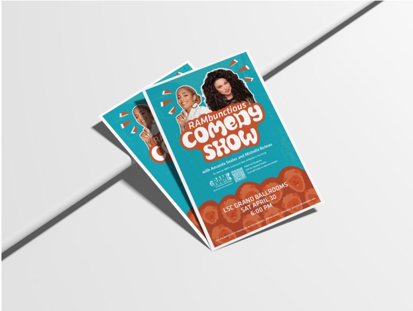
Figure 1: Rambunctious Comedy Show Poster