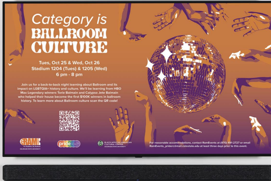
Figure 8: Category is Ballroom Culture LCD