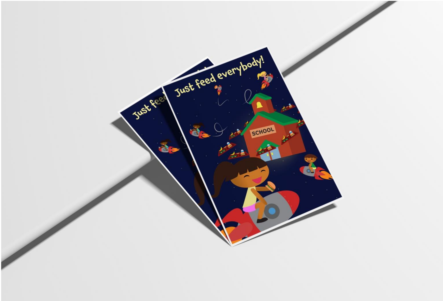
Figure 7: Free Lunch Poster