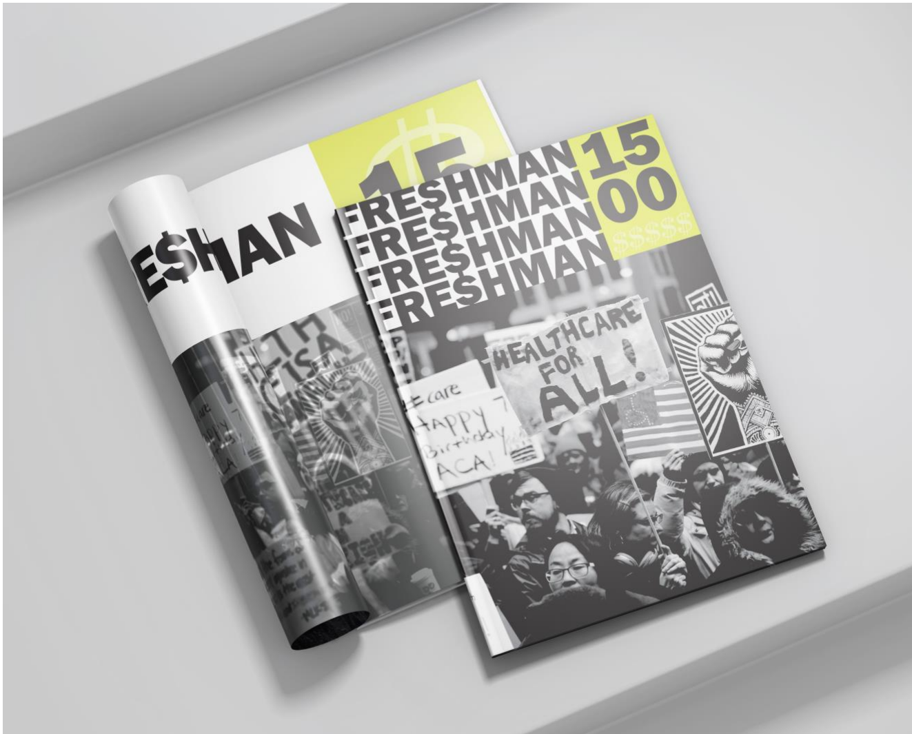
Figure 2: Freshman $1500 Magazine