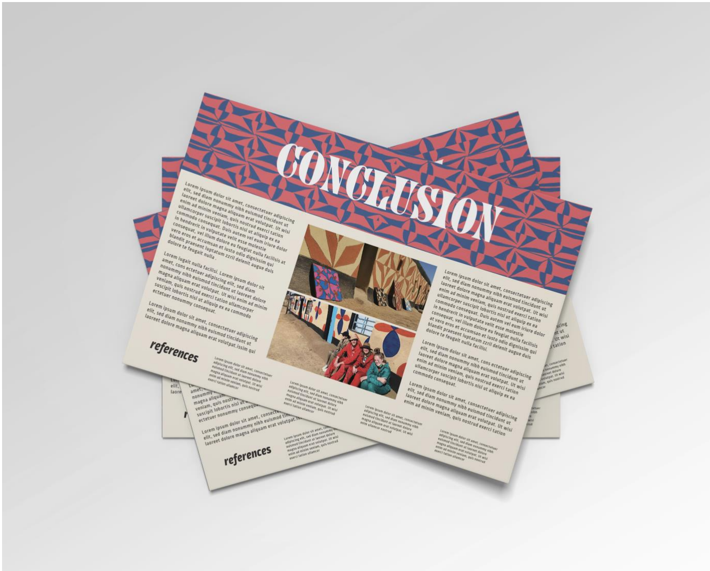
Figure 5: Daughters of Litema Conclusion Poster