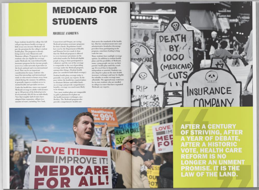
Figure 3: Freshman $1500 Magazine Spread