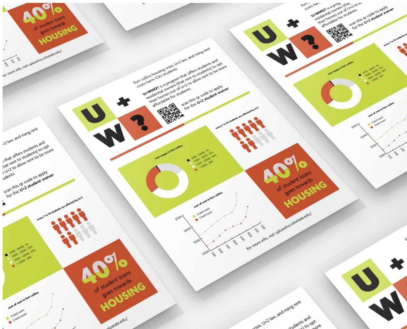
Figure 9: U+WHO? Infographic