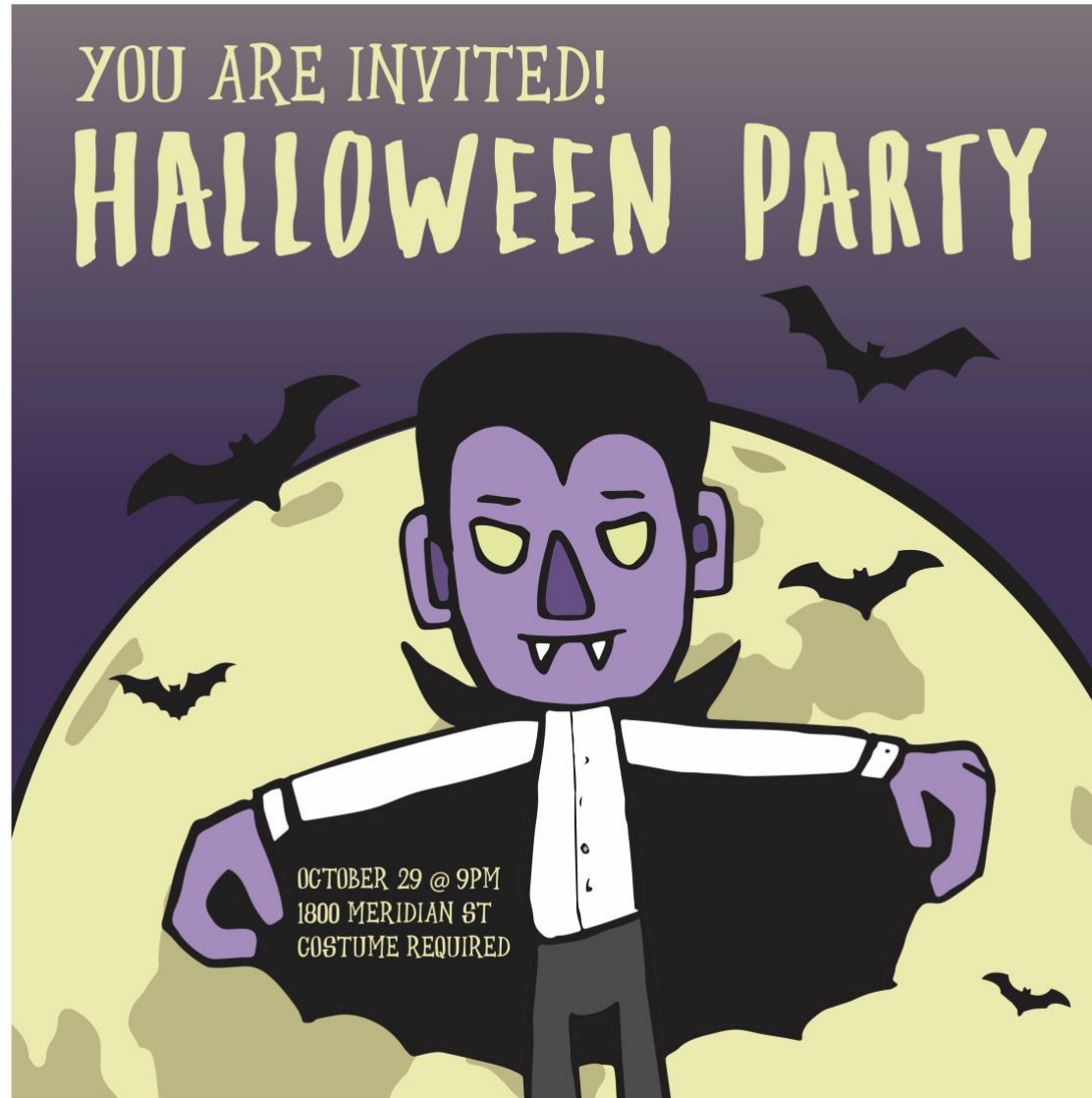
Figure 4: Halloween Party Thumbnail