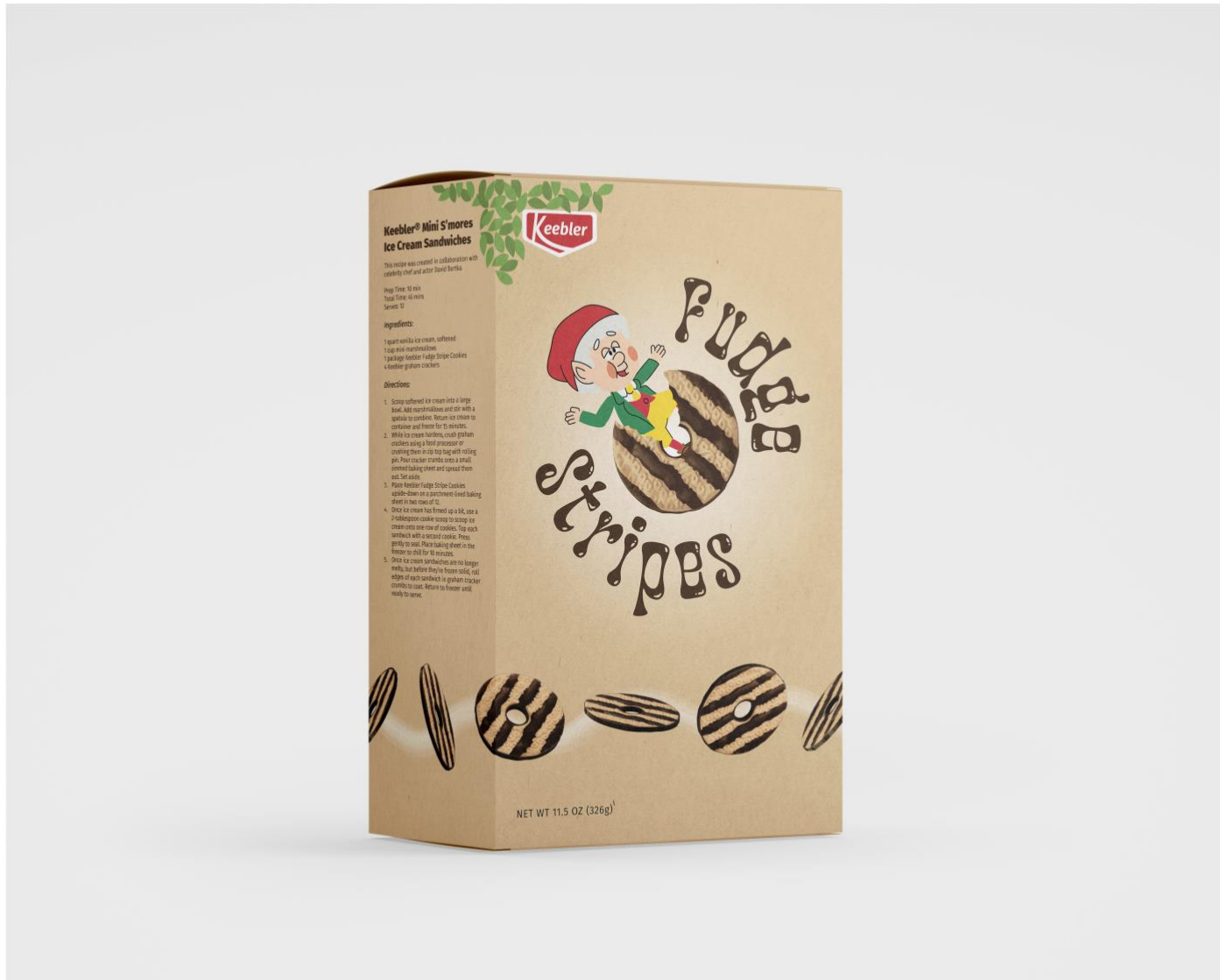
Figure 6: Keebler Fudge Stripes Rebrand