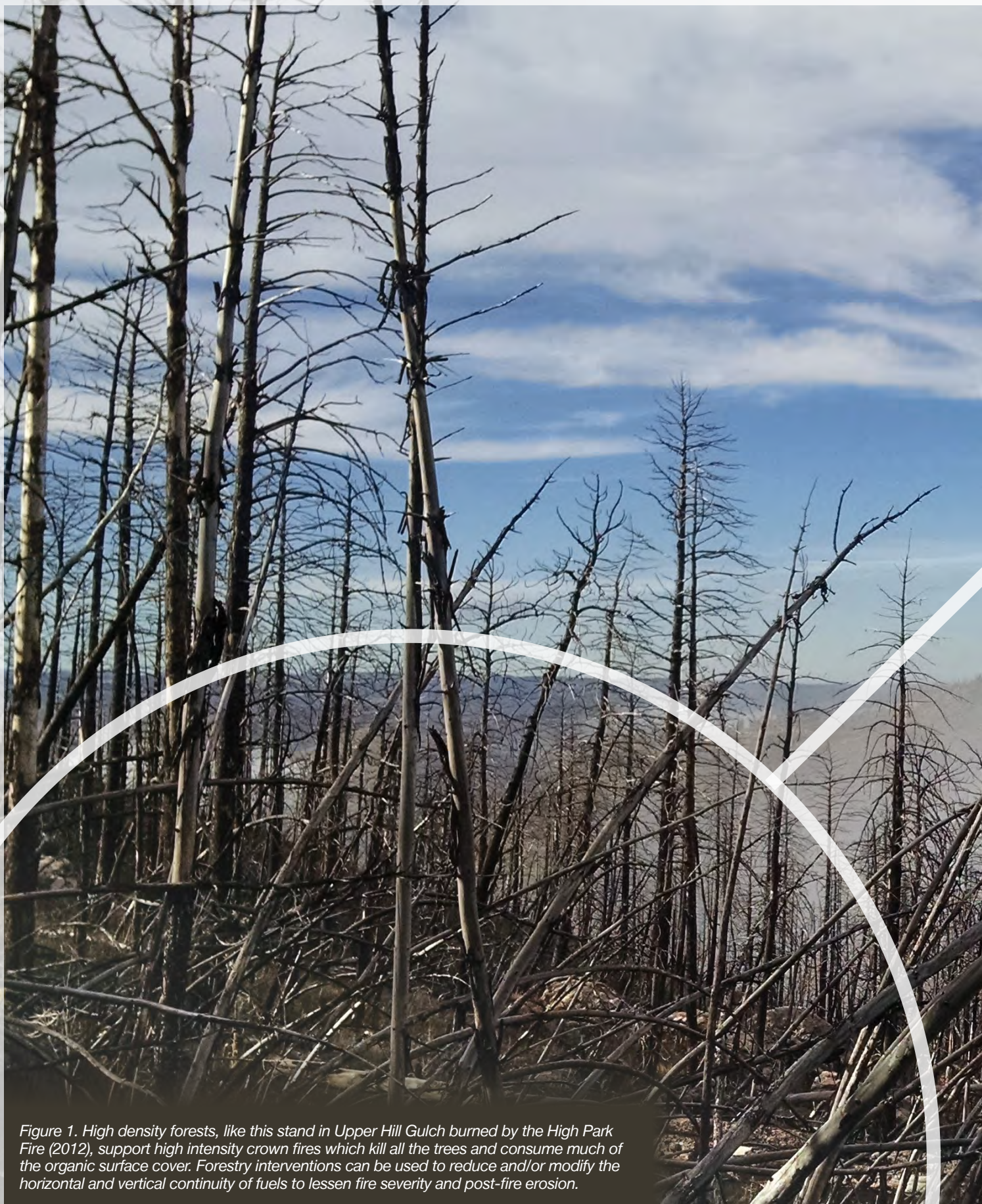
Figure 1. High density forests, like this stand in Upper Hill Gulch burned by the High Park Fire (2012), support high intensity crown fires which kill all the trees and consume much of the organic surface cover. Forestry interventions can be used to reduce and/or modify the horizontal and vertical continuity of fuels to lessen fire severity and post-fire erosion.