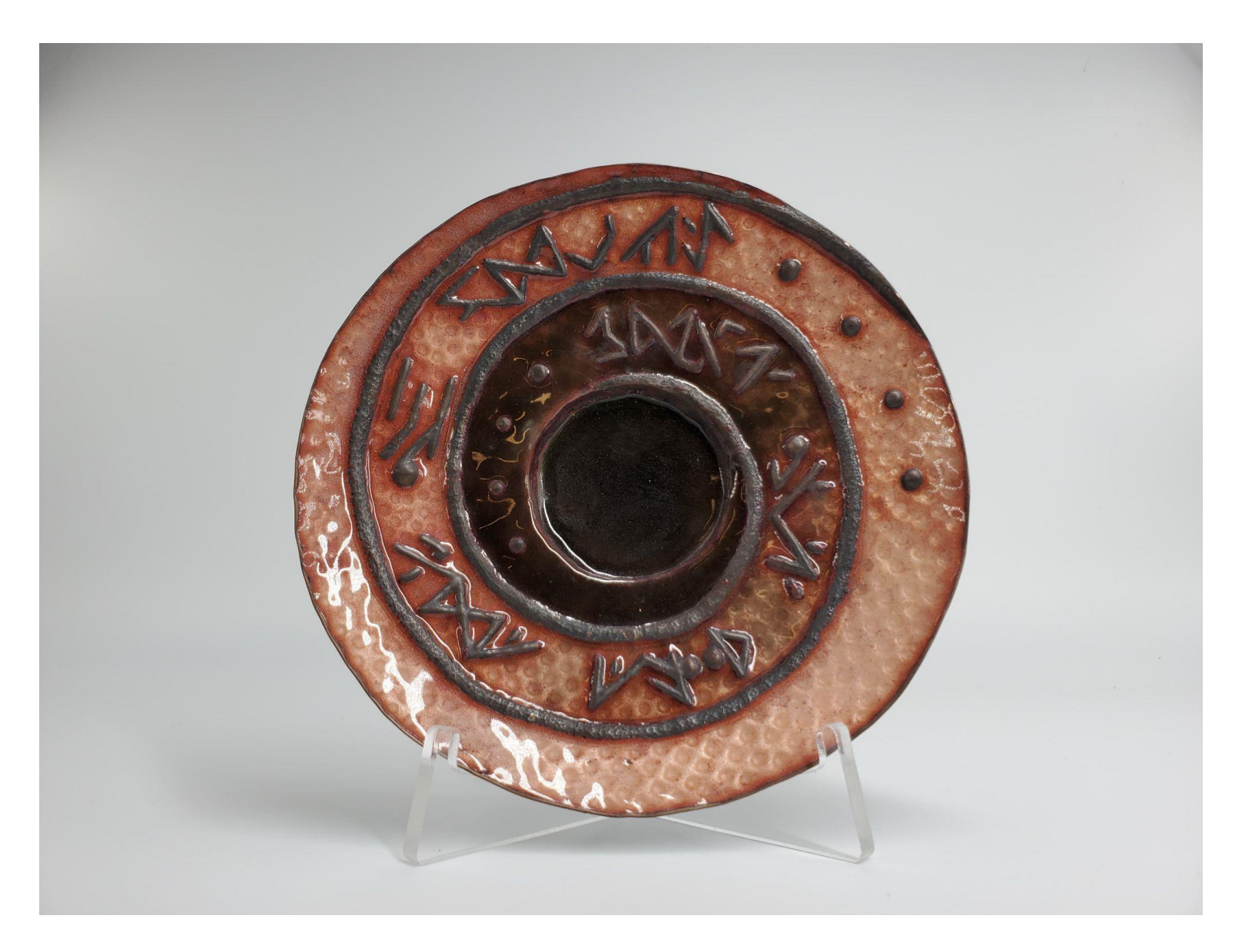
Figure 6: Long Way Down, Long Way Out