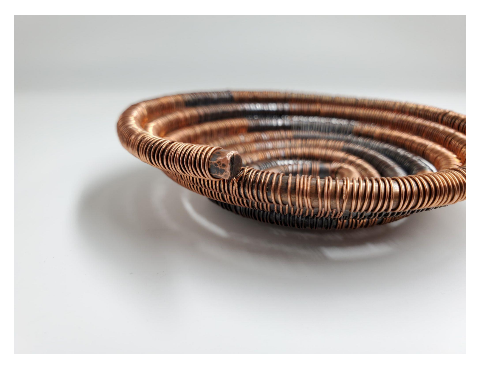
Figure 9: Existential Question, Formal Answer (Detail)