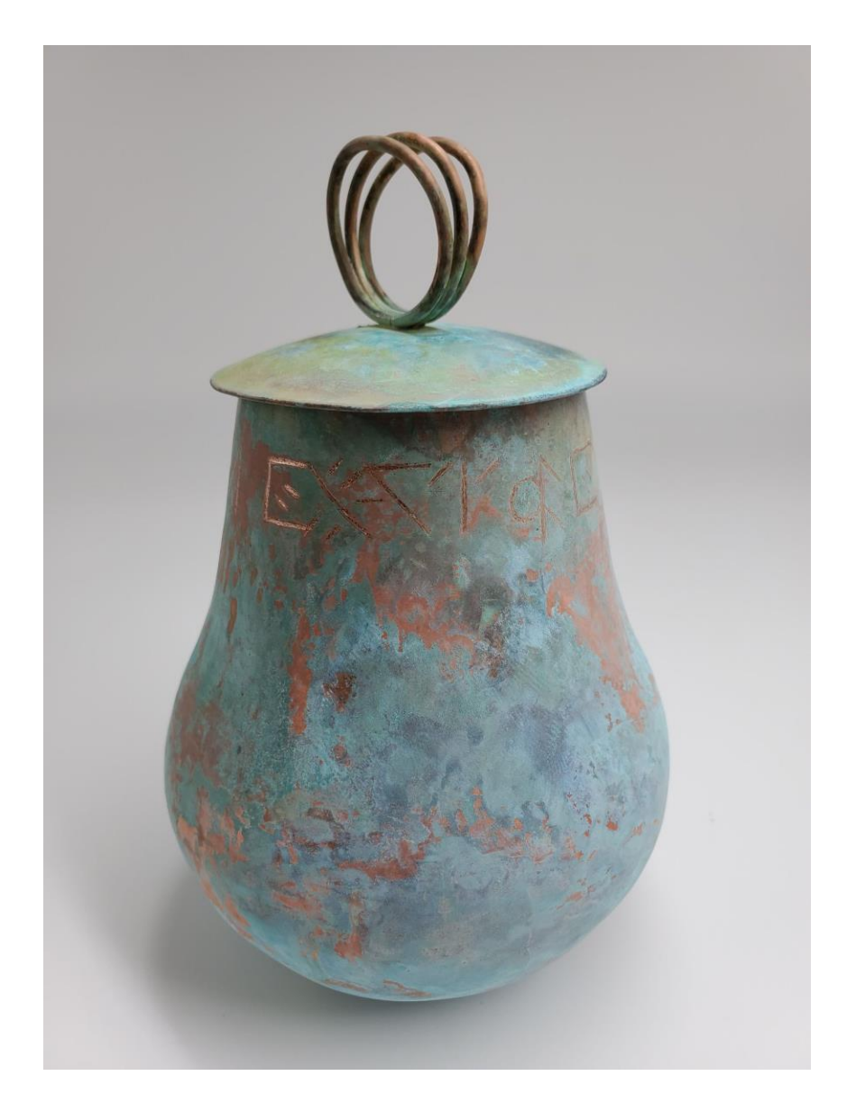
Figure 10: Boston Tincture