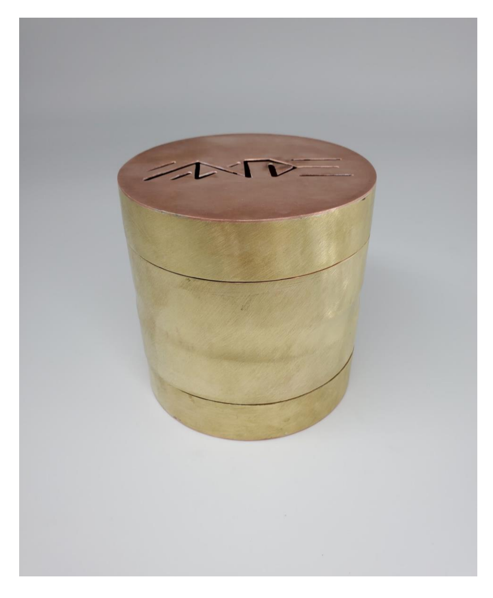
Figure 3: "Walk until your feet bleed, then keep walking."