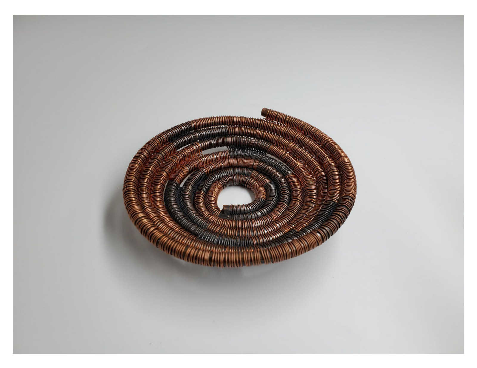
Figure 8: Existential Question, Formal Answer