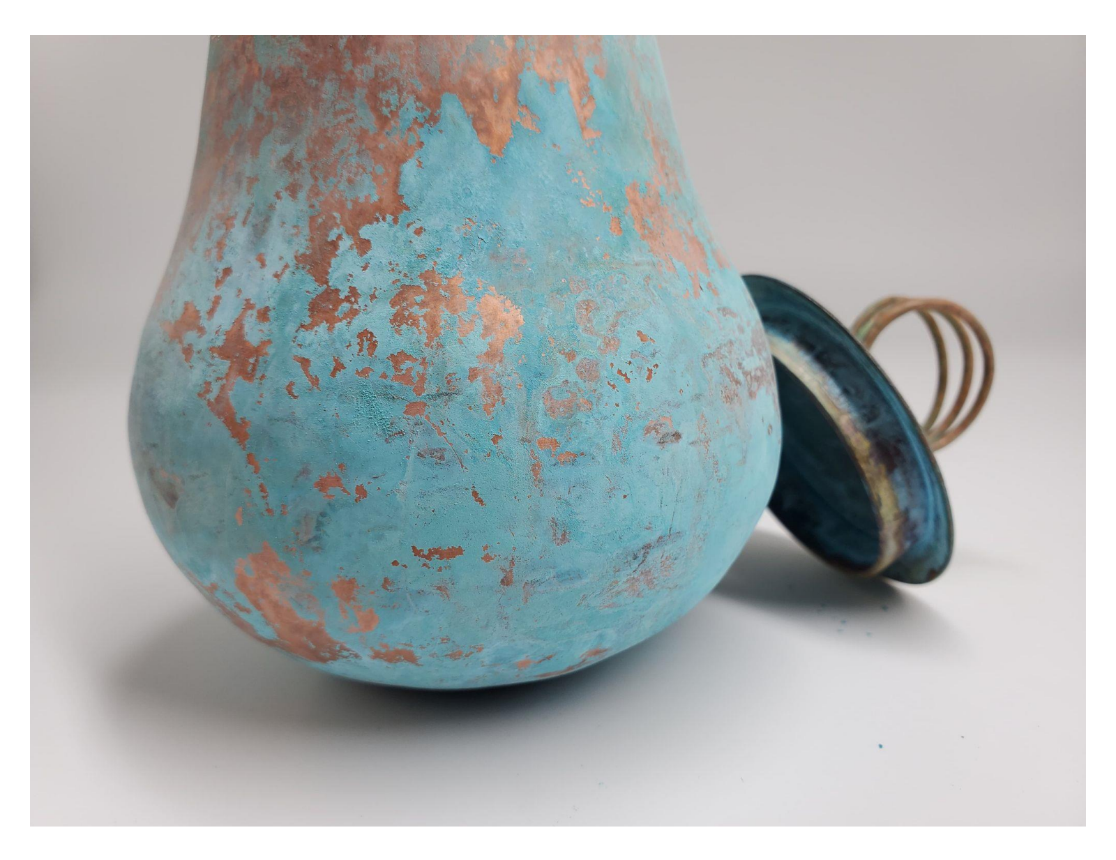
Figure 11: Boston Tincture (Detail)