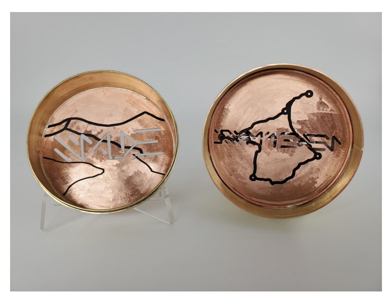
Figure 4: "Walk until your feet bleed, then keep walking." (Detail)