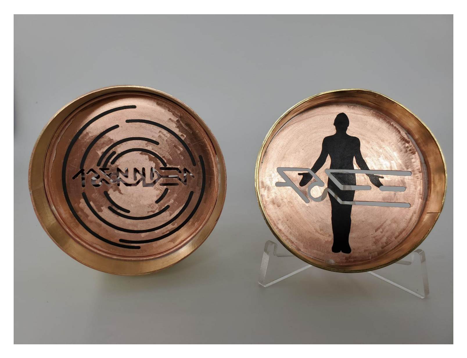
Figure 5: "Walk until your feet bleed, then keep walking." (Detail)