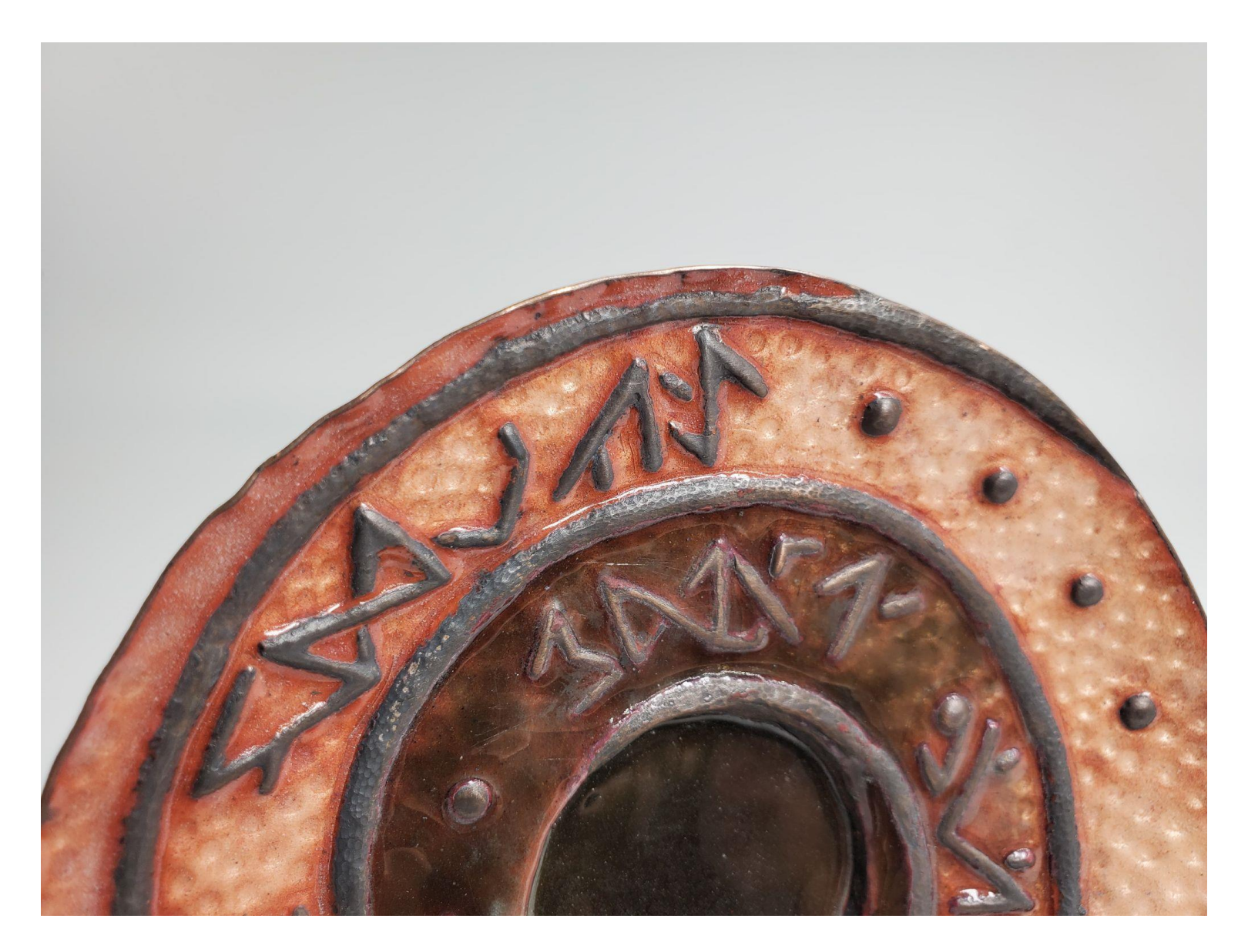
Figure 7: Long Way Down, Long Way Out (Detail)