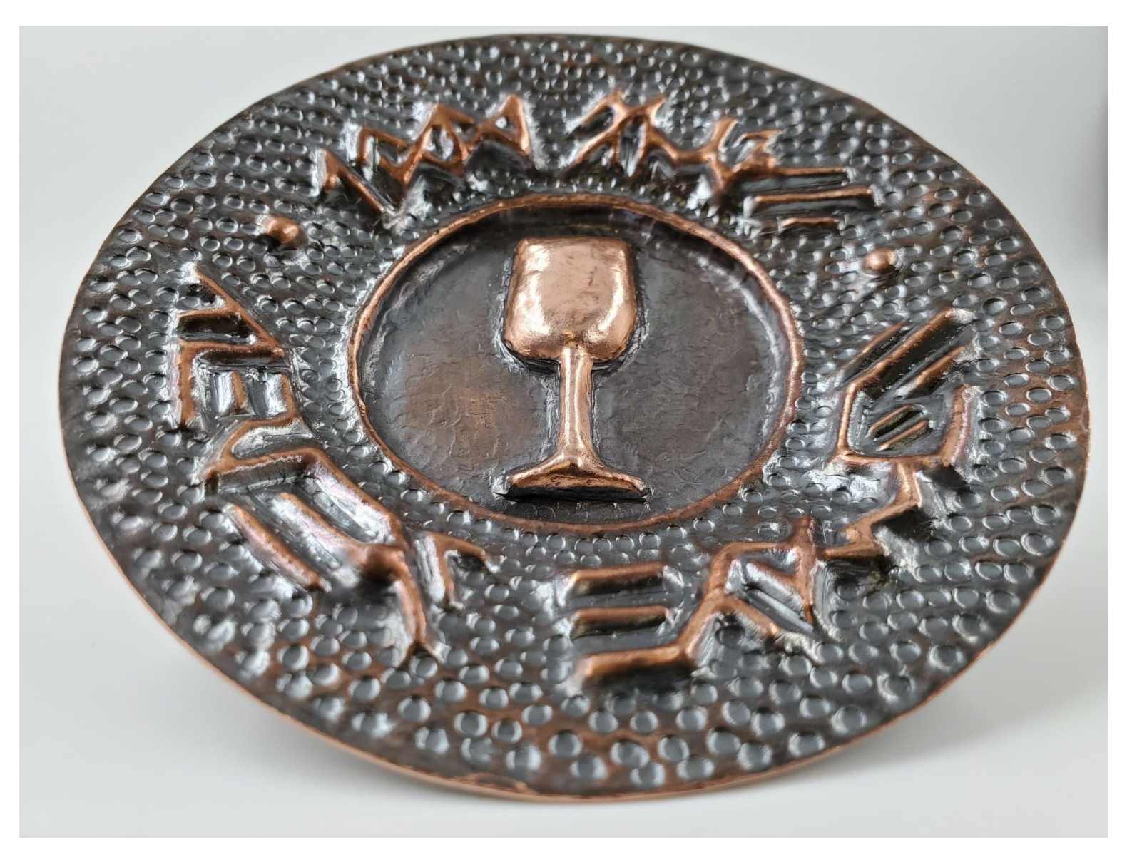
Figure 1: Drinking Habits