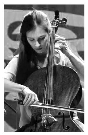
THE PROGRAM WILL BE ANNOUNCED FROM THE STAGE. ENJOY THE PERFORMANCE.