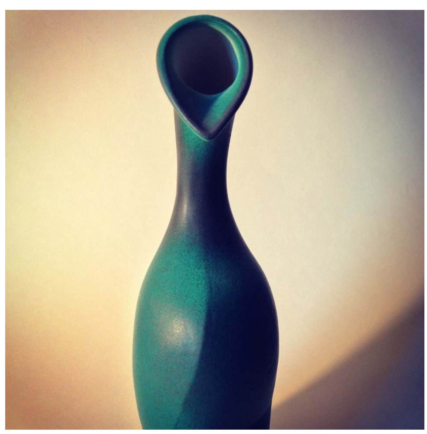
Figure 3: Bottle.