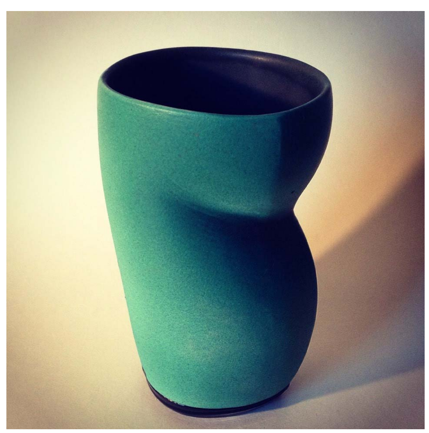
Figure 16: Tumbler.