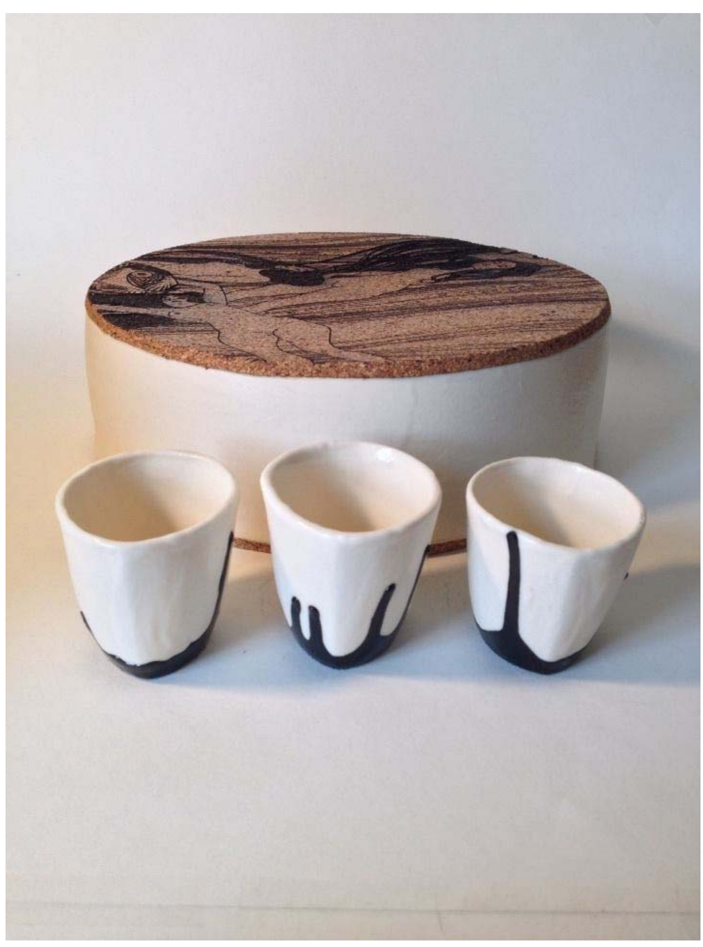
Figure 20: Whiskey Set.