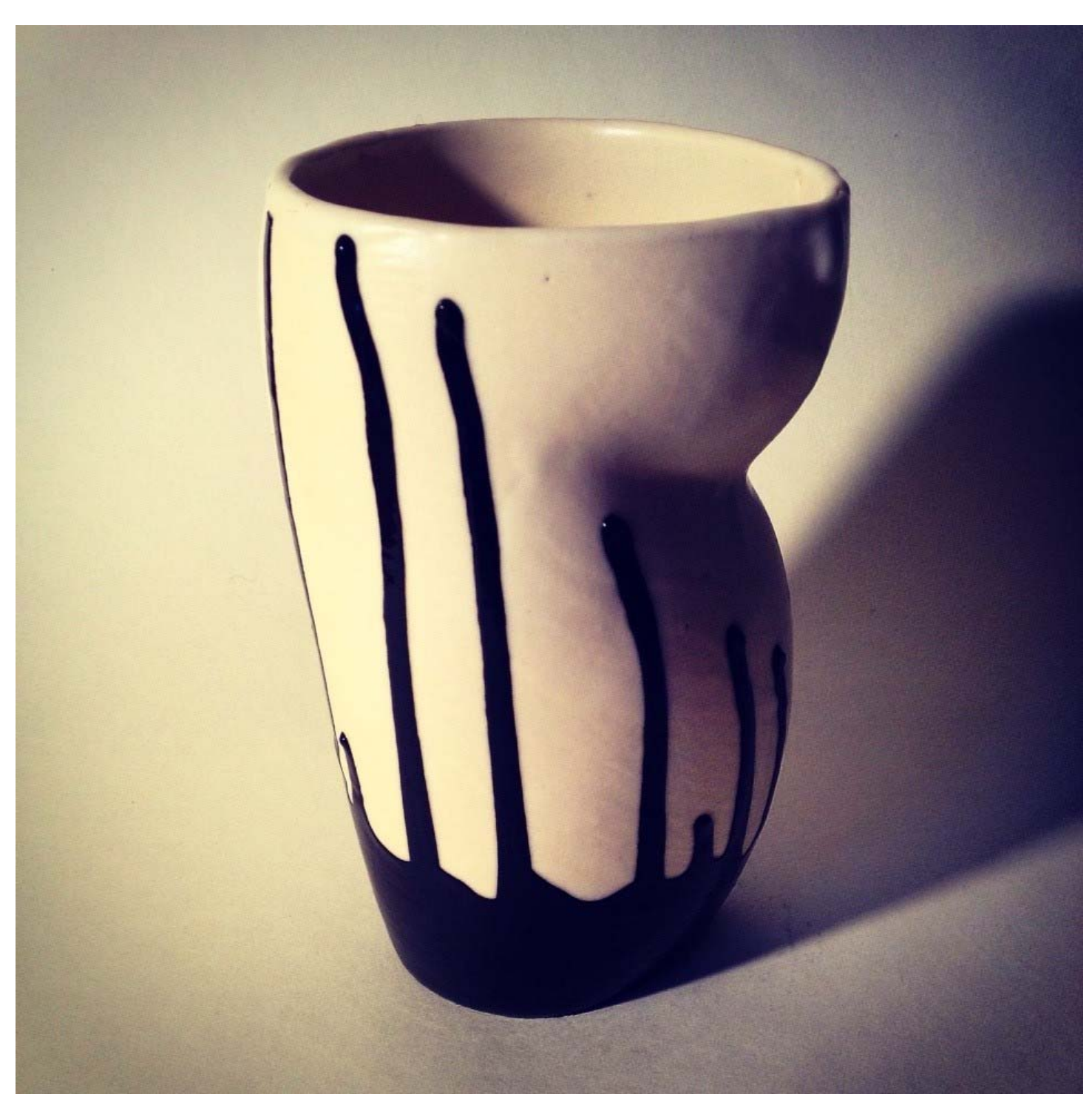
Figure 12: Tumbler.