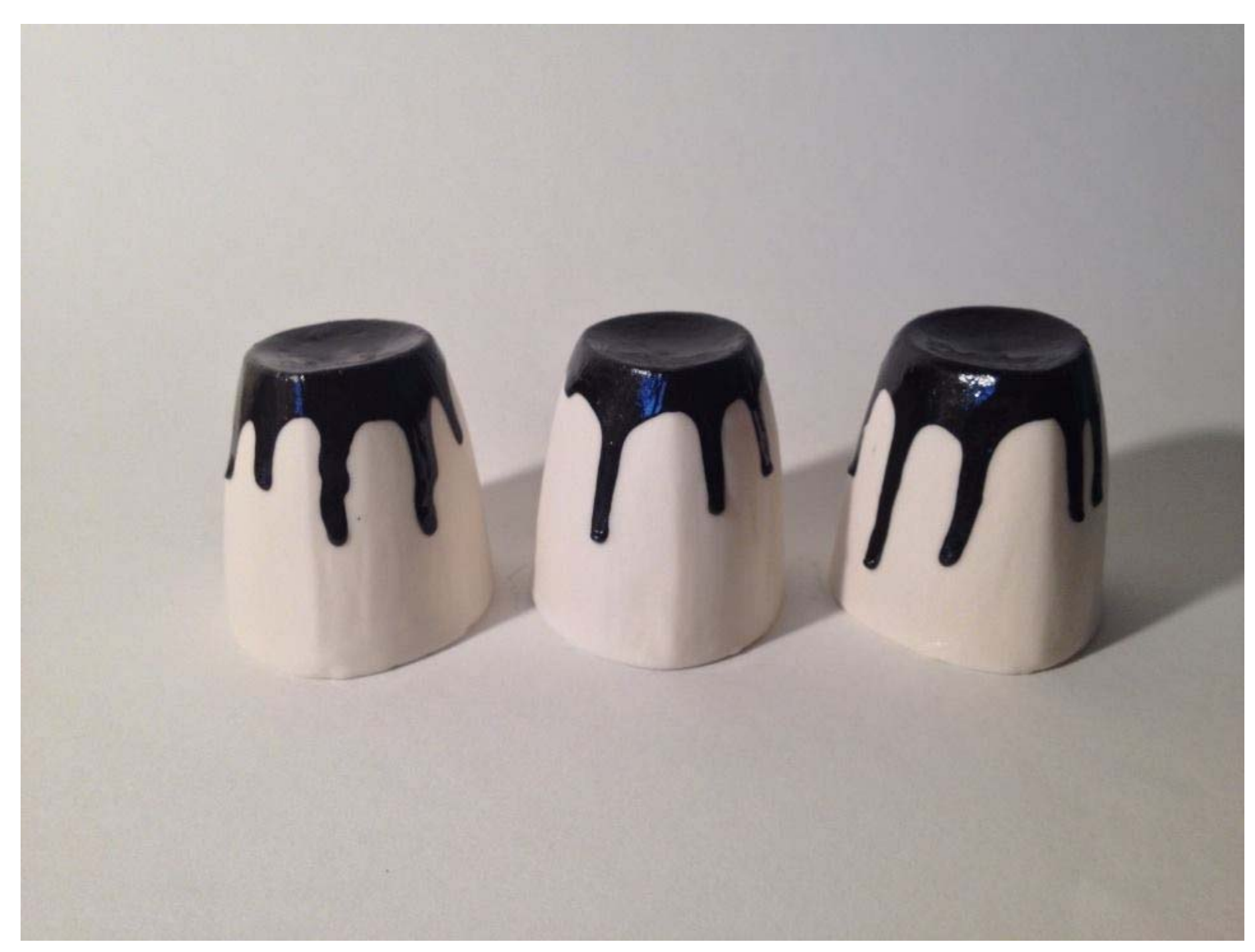
Figure 4: Whiskey Cups.