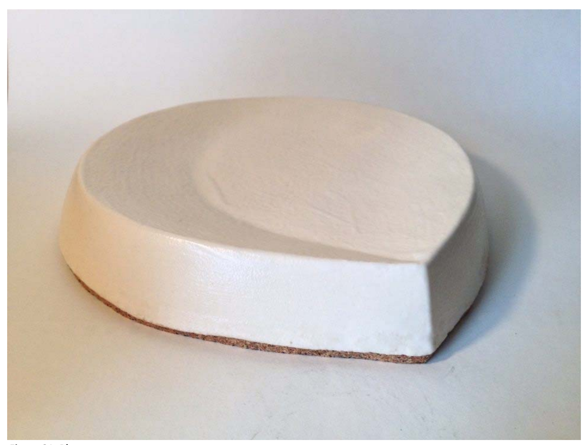
Figure 21: Plate.