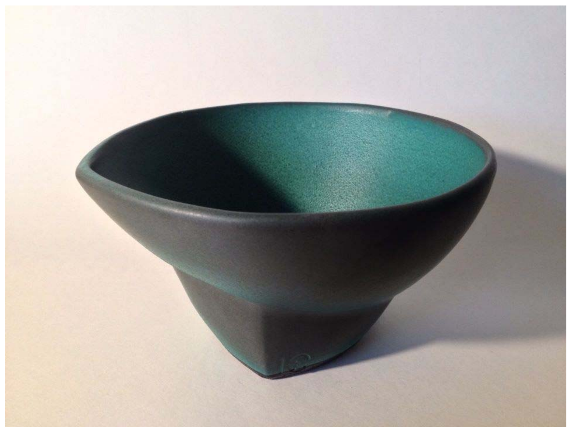
Figure 10: Bowl.