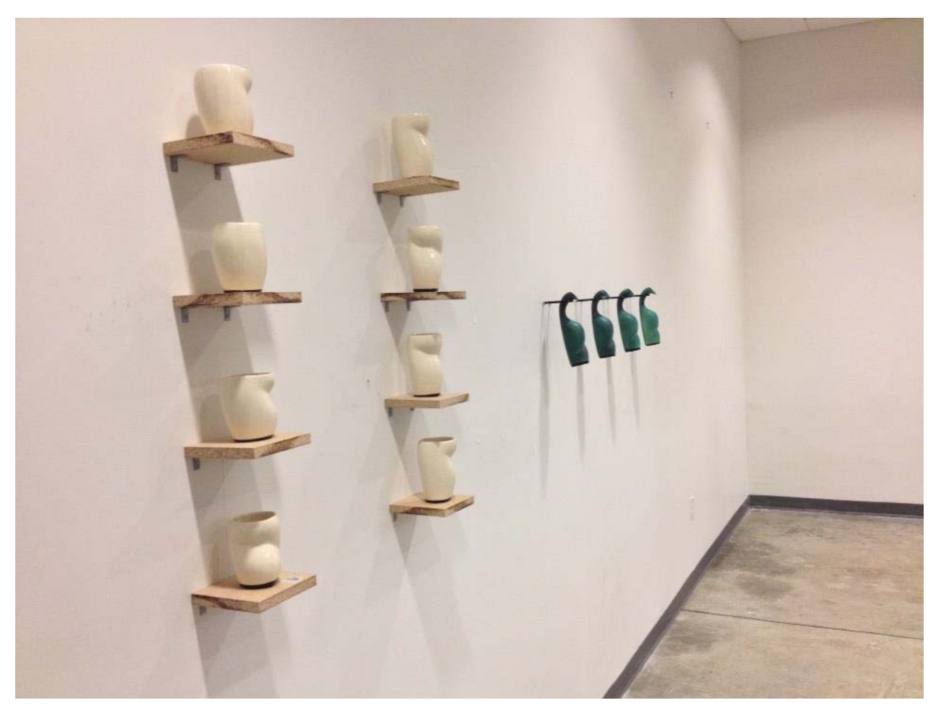
Figure 11: Installation.