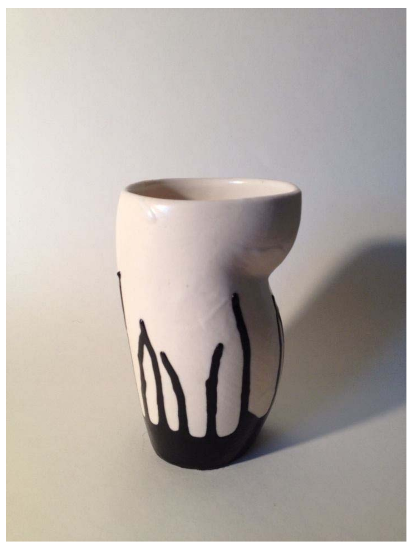
Figure 25: Tumbler.