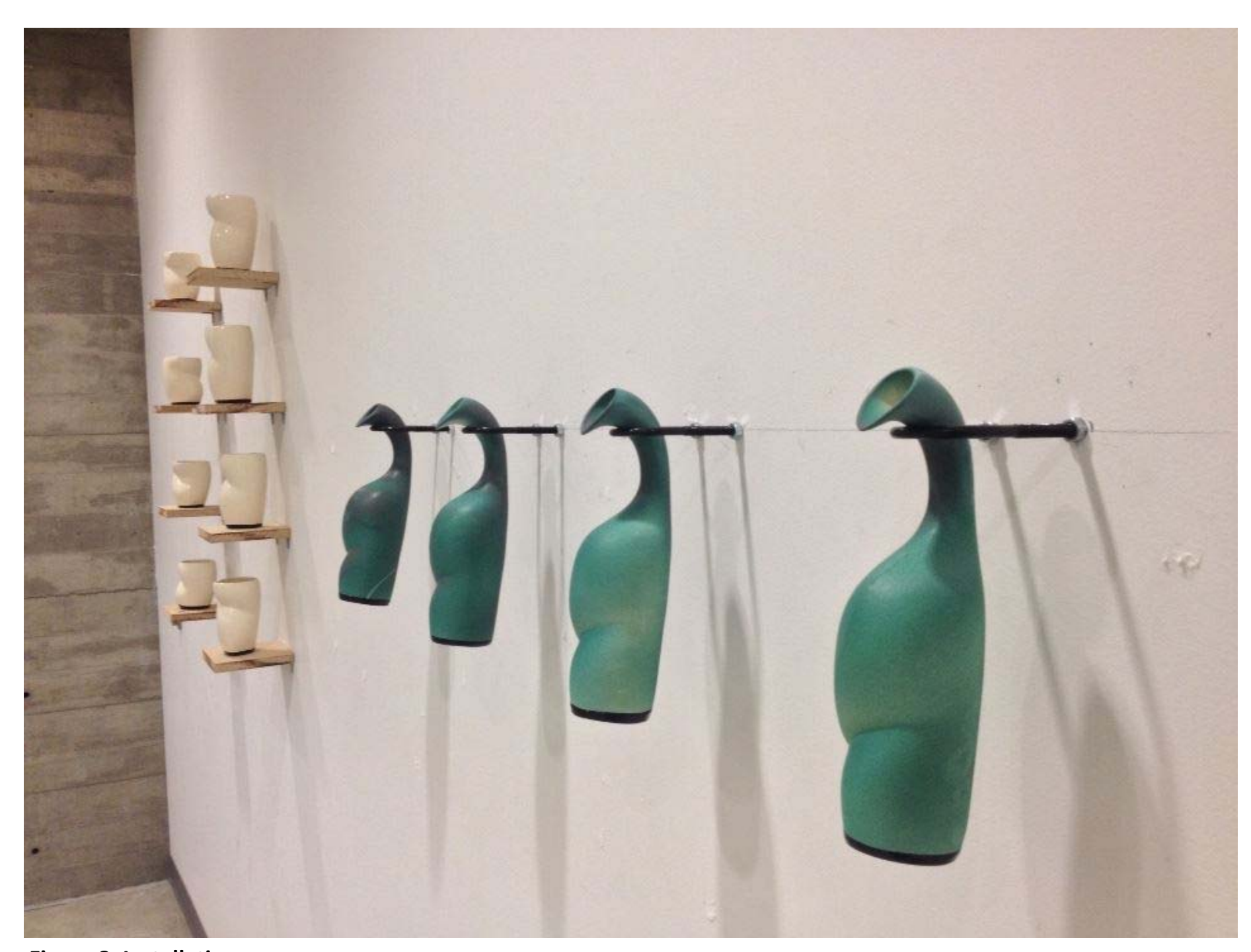
Figure 8: Installation.