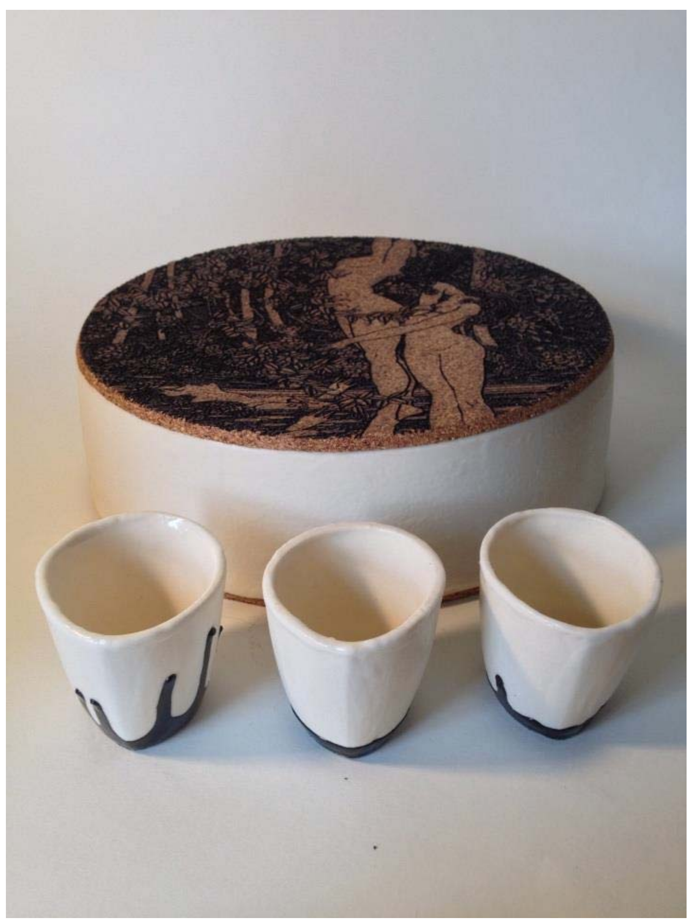
Figure 18: Whiskey Set.