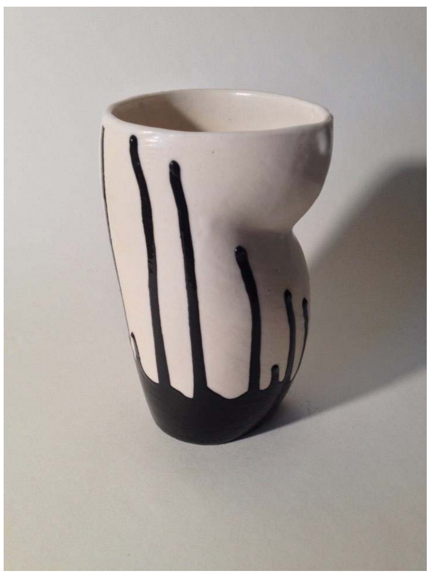
Figure 23: Tumbler.