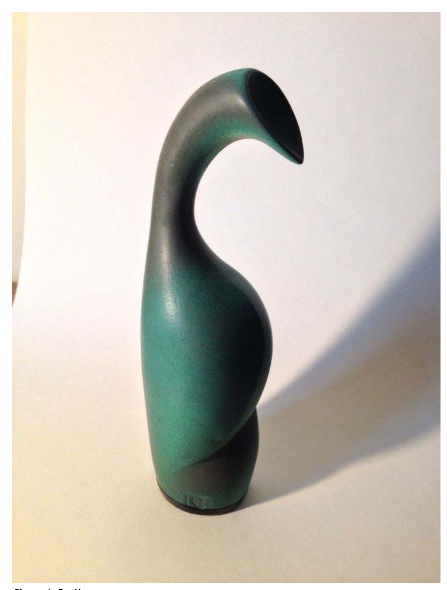
Figure 1: Bottle.