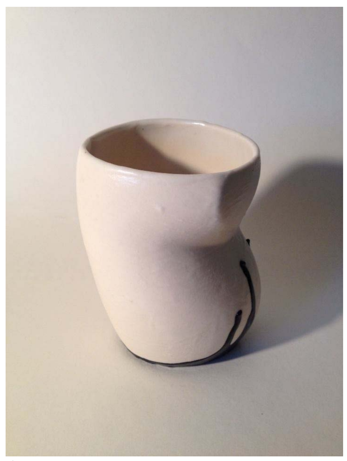
Figure 24: Cup.