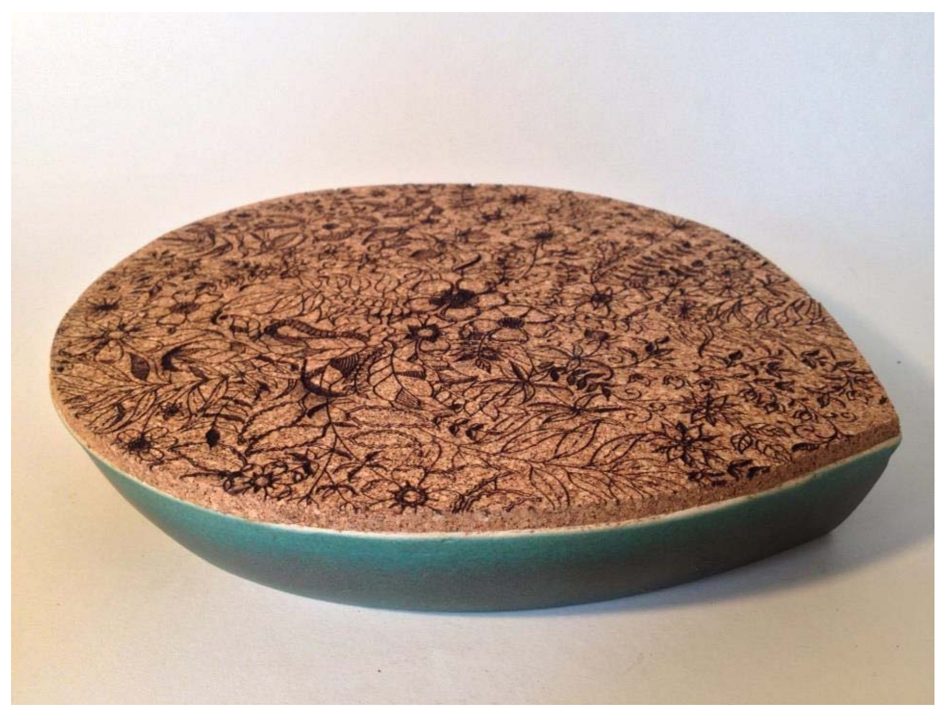
Figure 22: Plate.