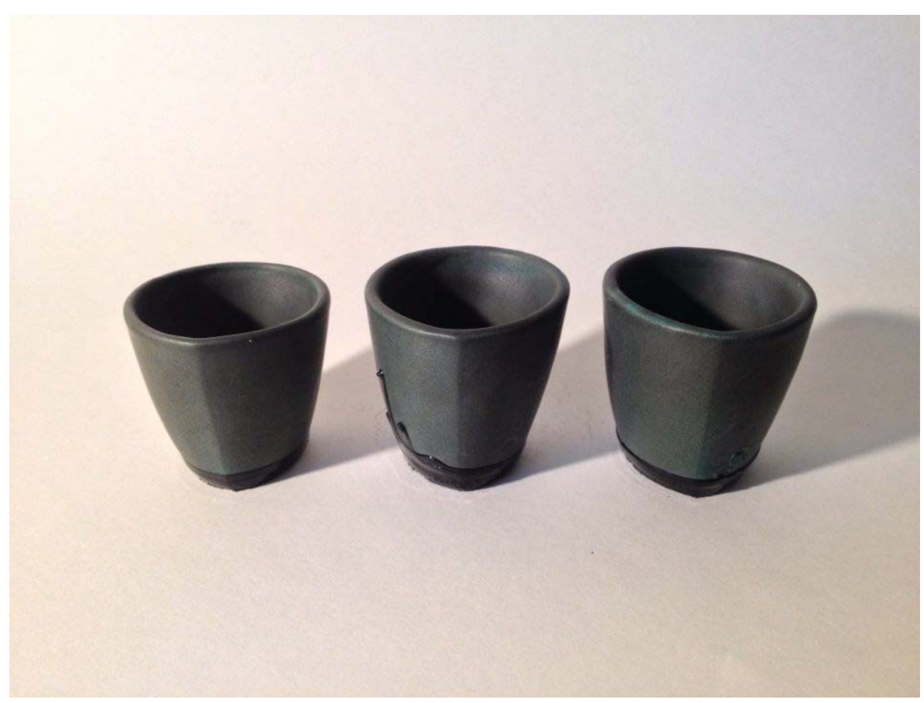
Figure 2: Whiskey Cups.