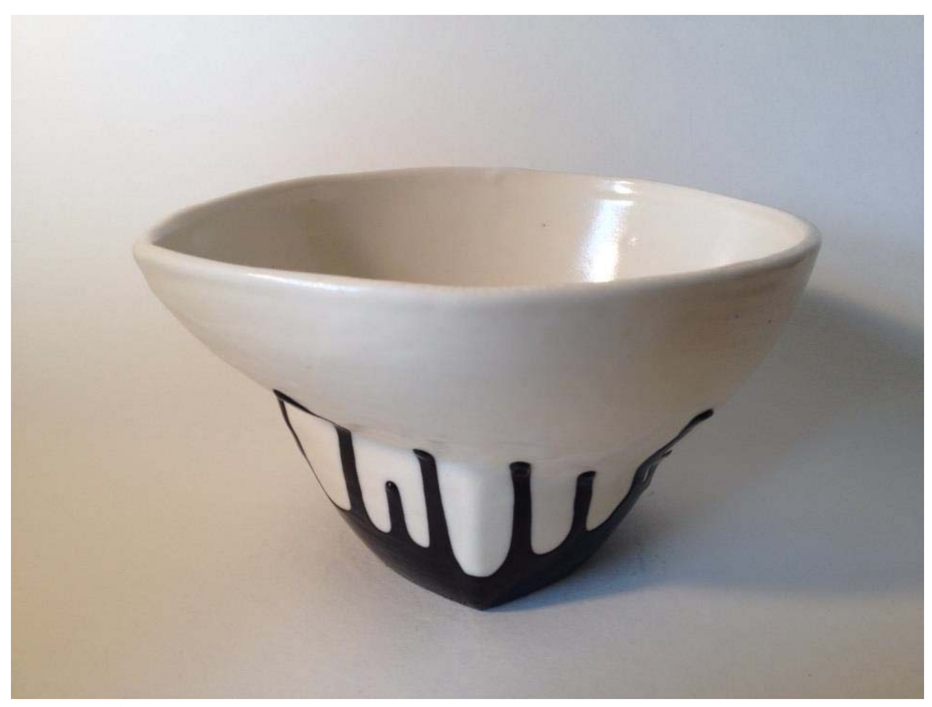
Figure 9: Bowl.