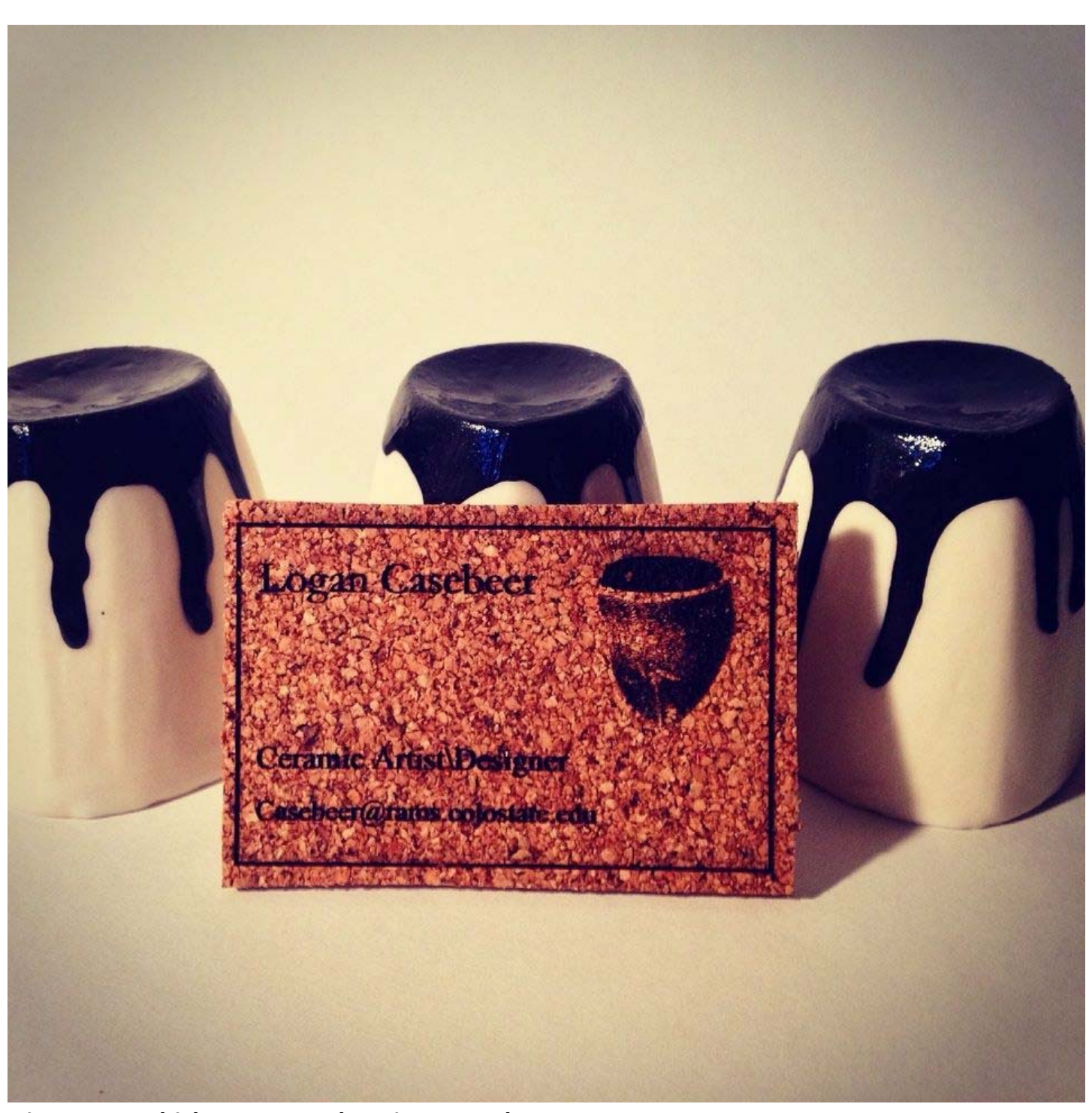
Figure 15: Whiskey Cups and Business Card.