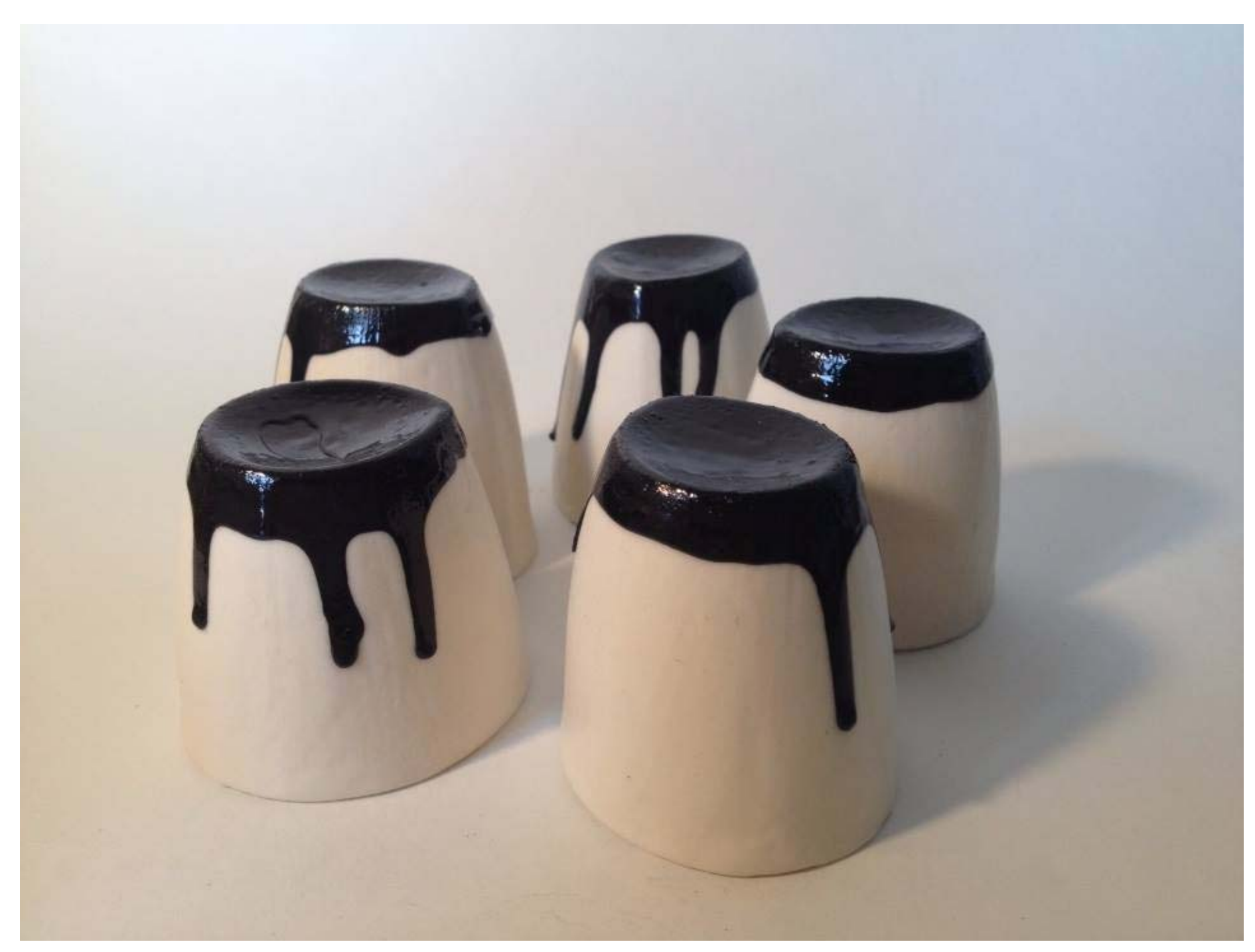
Figure 14: Whiskey Cups.