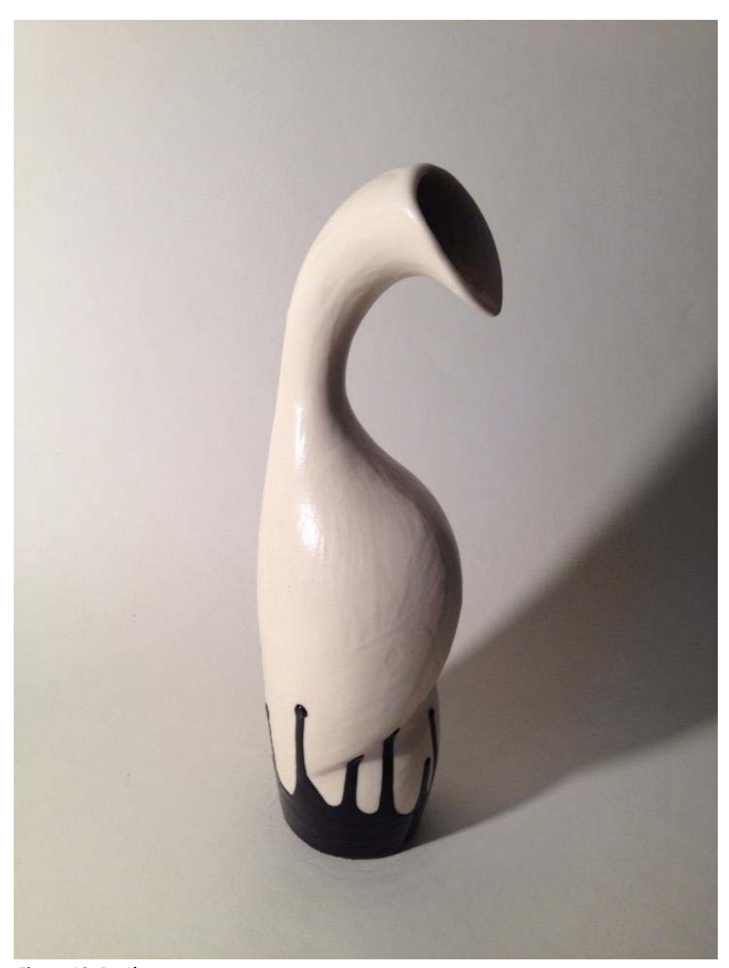
Figure 19: Bottle.