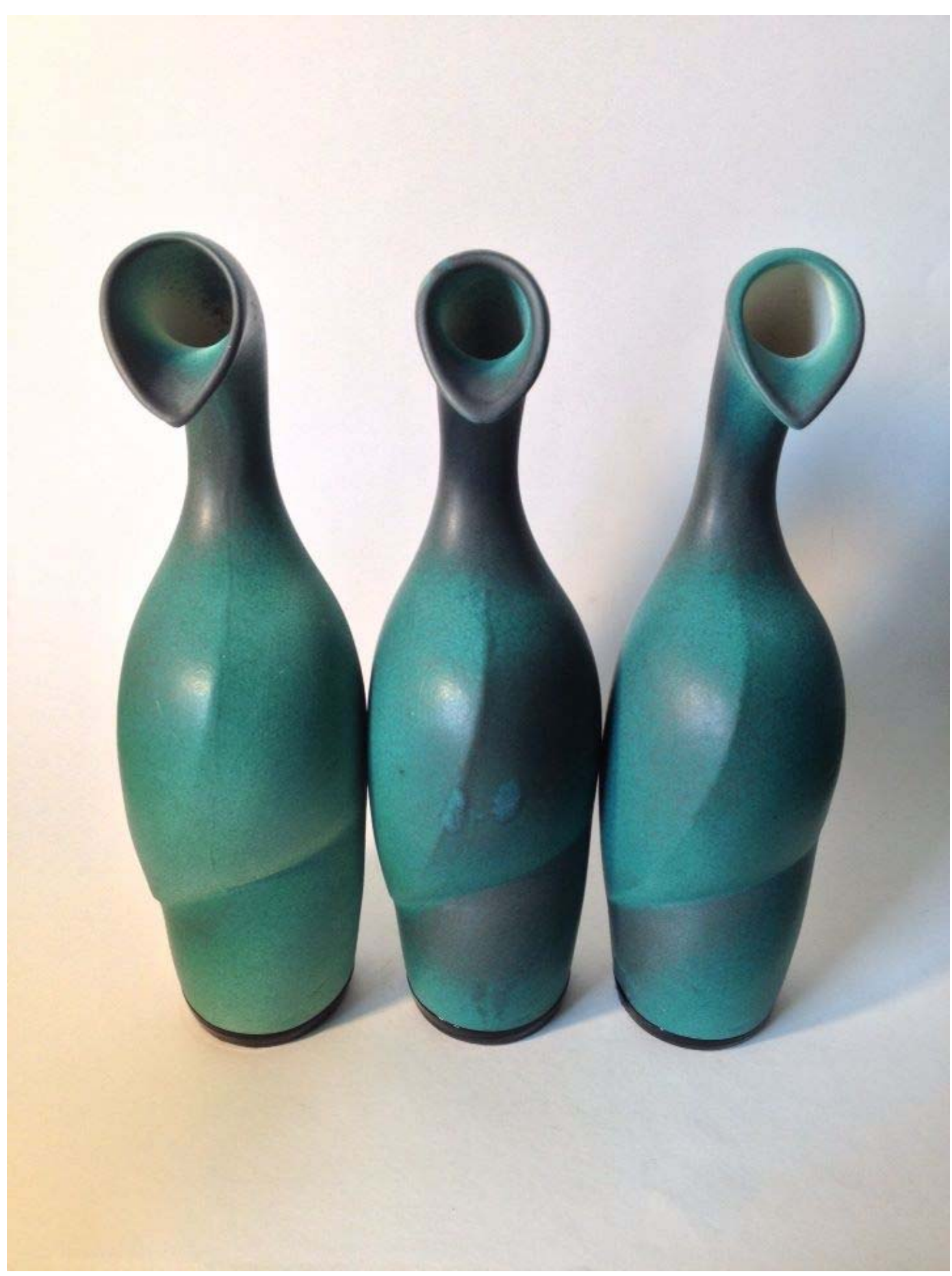
Figure 17: Bottles.