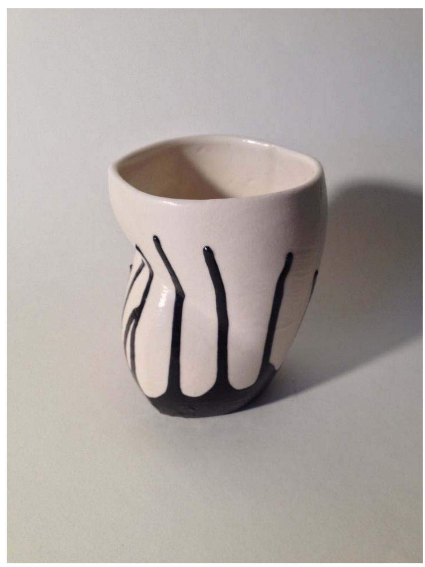
Figure 26: Cup.