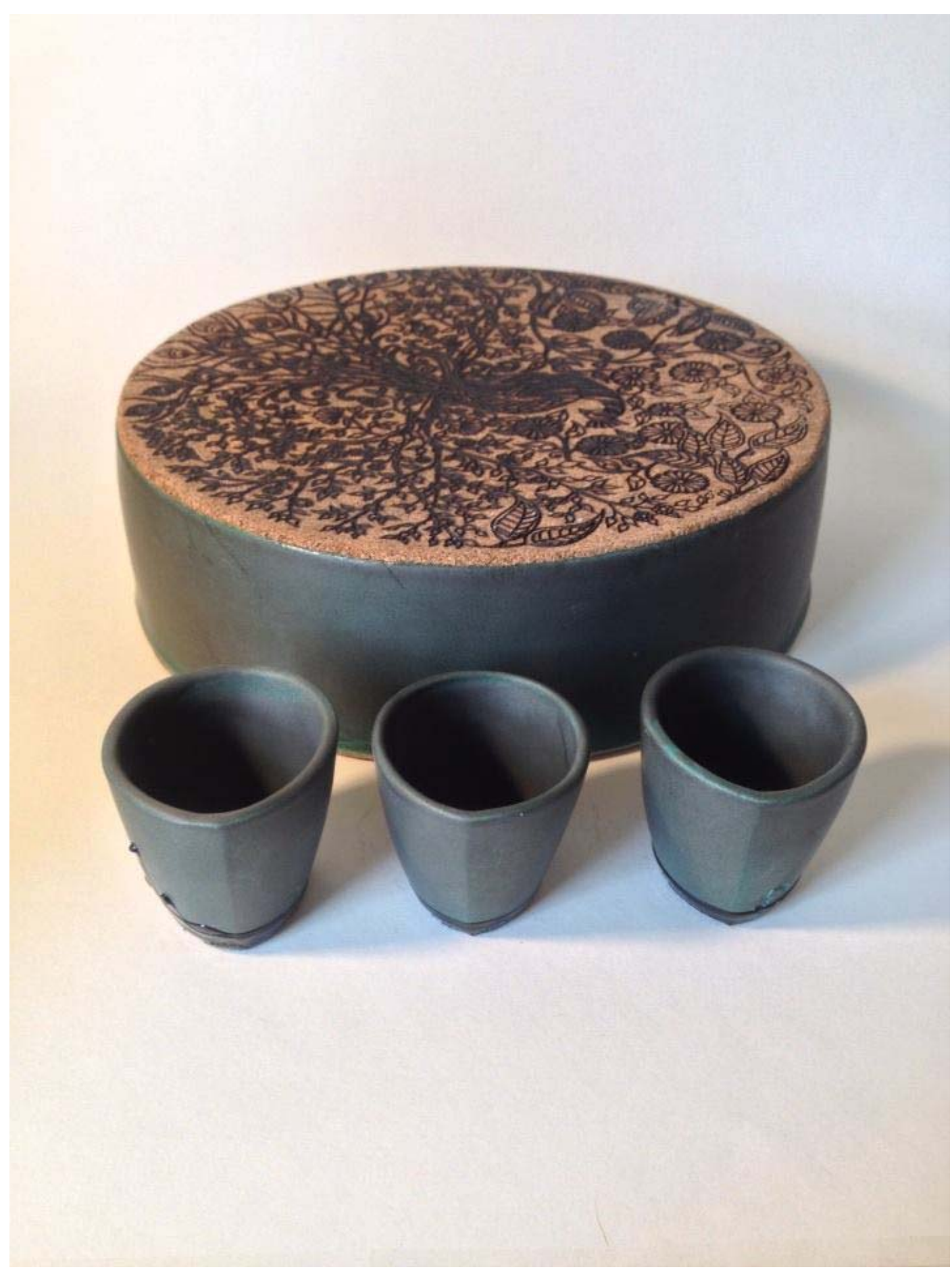
Figure 5: Whiskey Set.