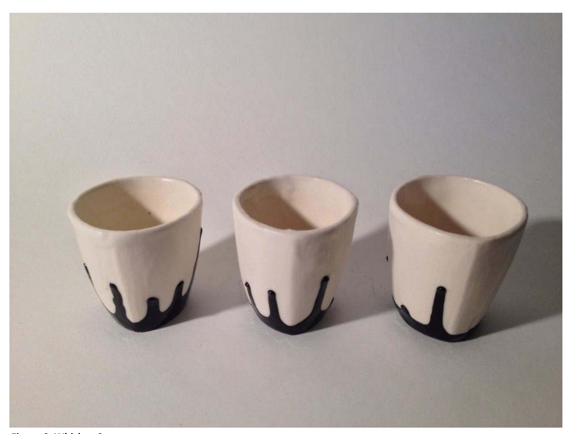
Figure 6: Whiskey Cups.