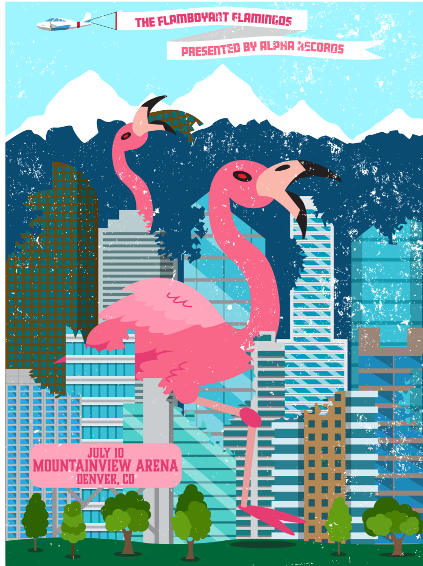
Figure 4: Flamboyant Flamingos