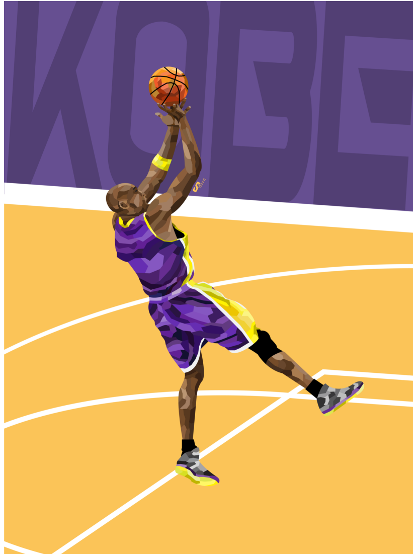
Figure 5: Bean