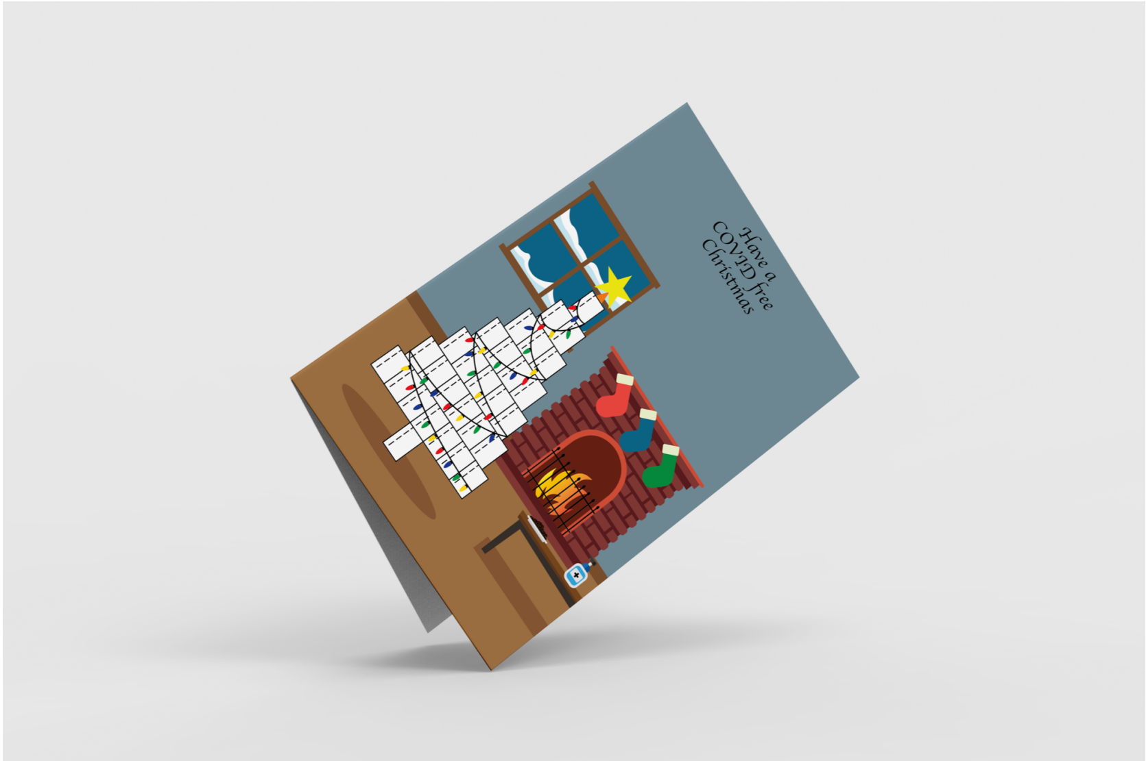
Figure 6: COVID Greeting Cards