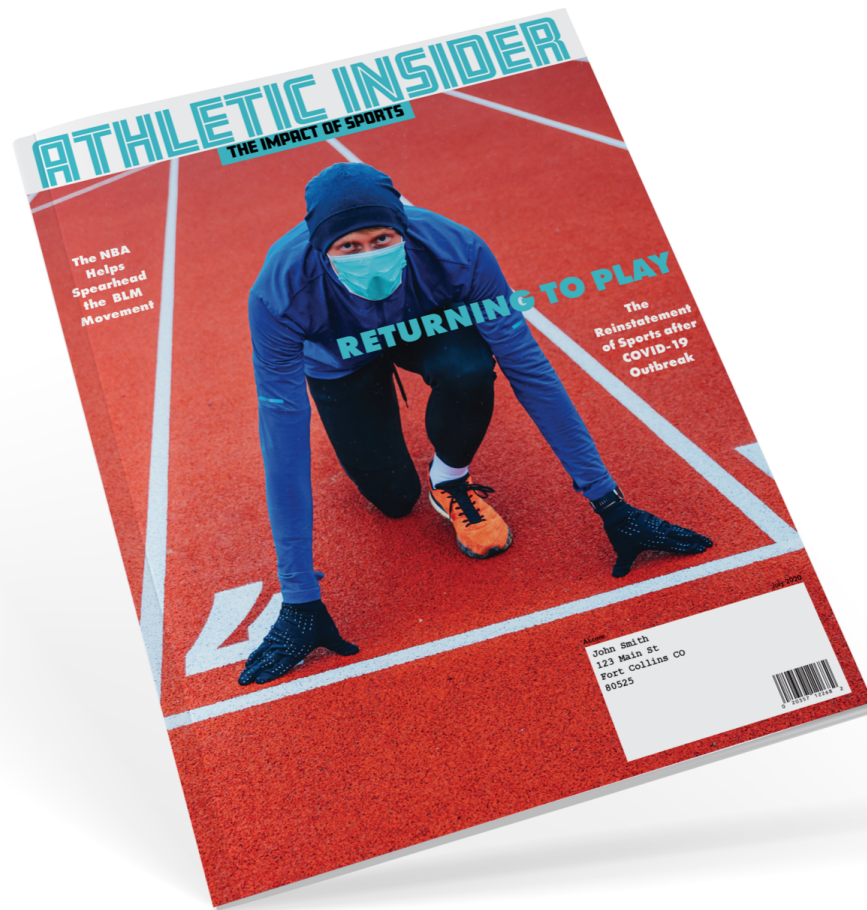
Figure 7: Athletic Insider