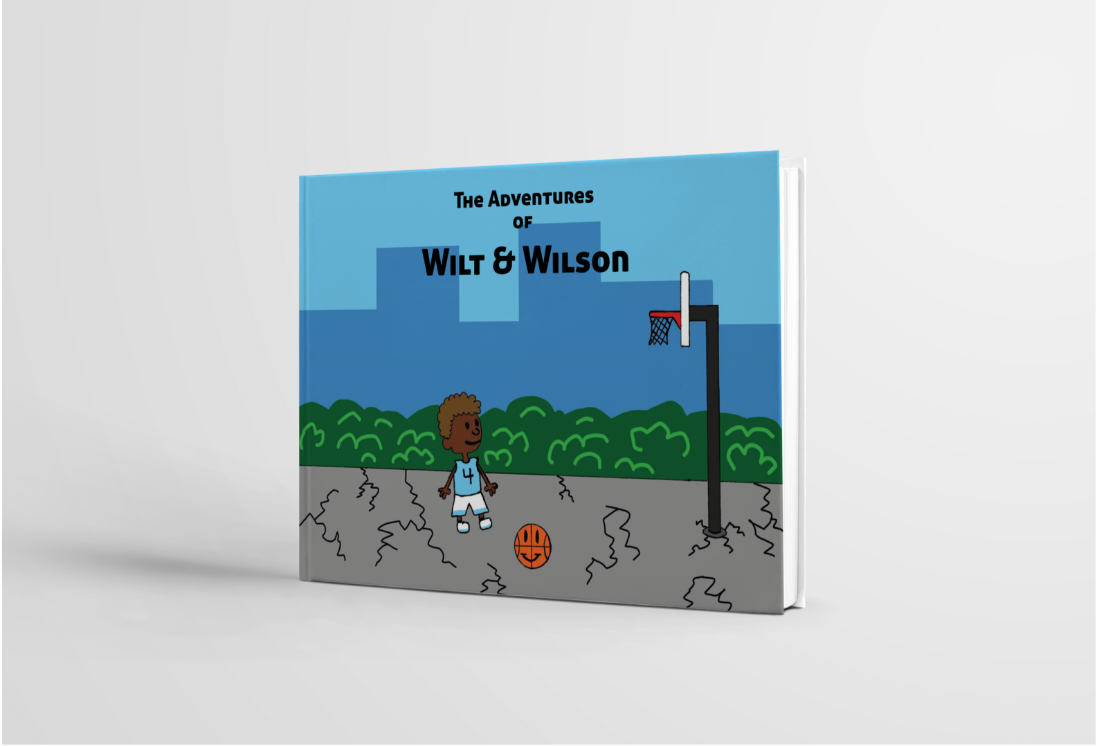
Figure 8: Wilt & Wilson