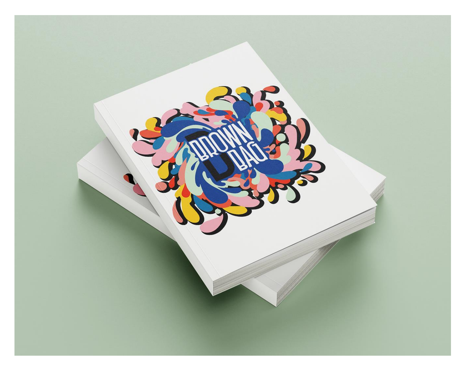
Figure 3: D Brown Bag