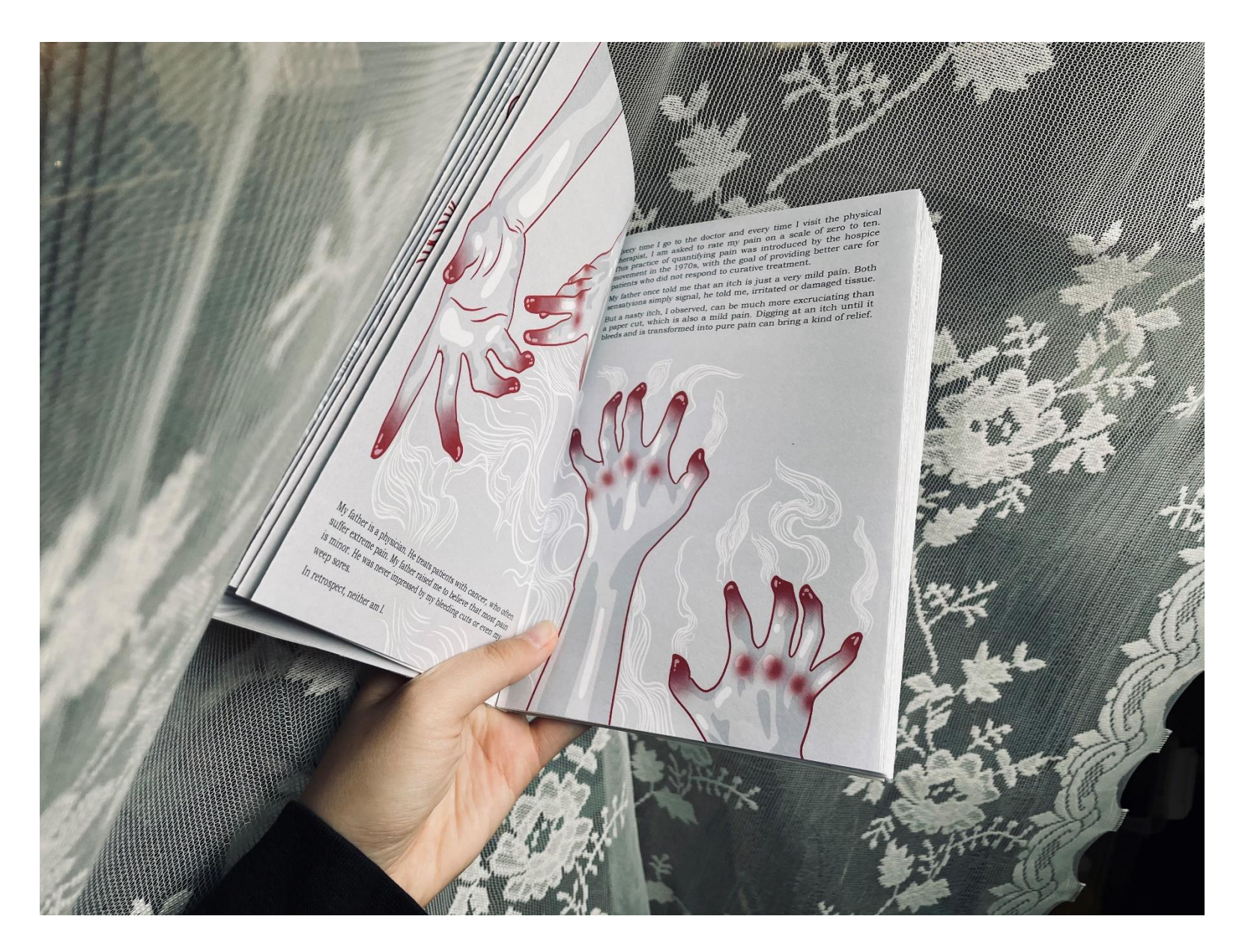
Figure 9: The Pain Scale – open spread