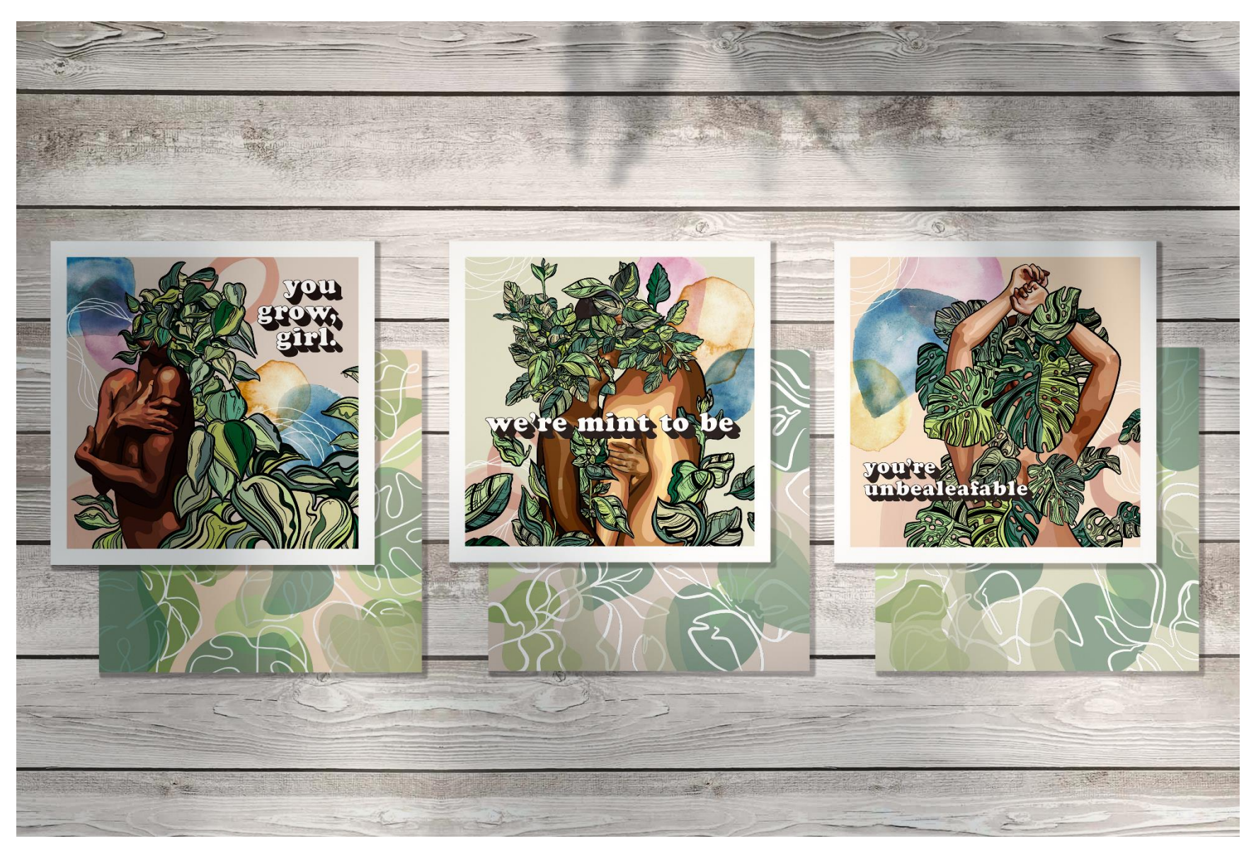
Figure 7: The Pothead Collection