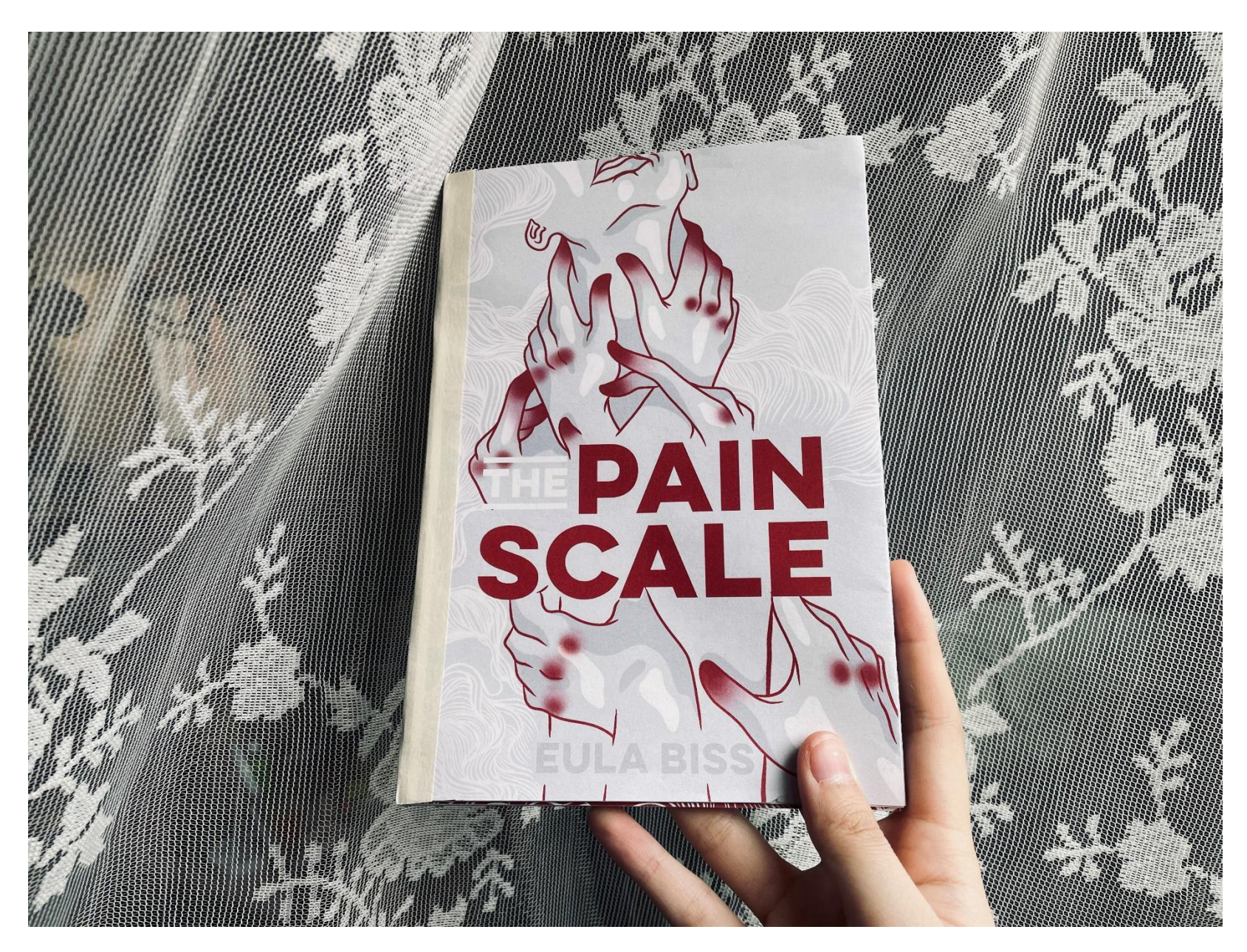
Figure 8: The Pain Scale