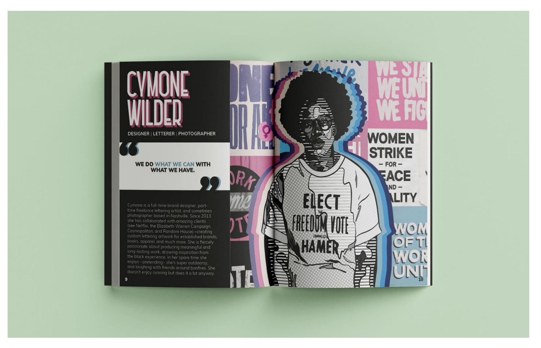
Figure 4: D Brown Bag - open spread