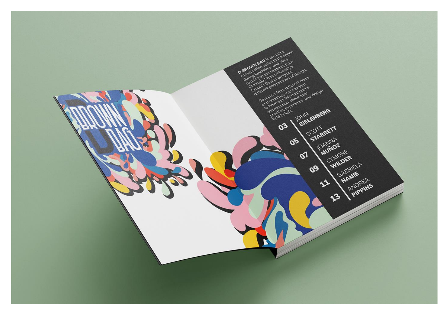
Figure 5: D Brown Bag – open spread