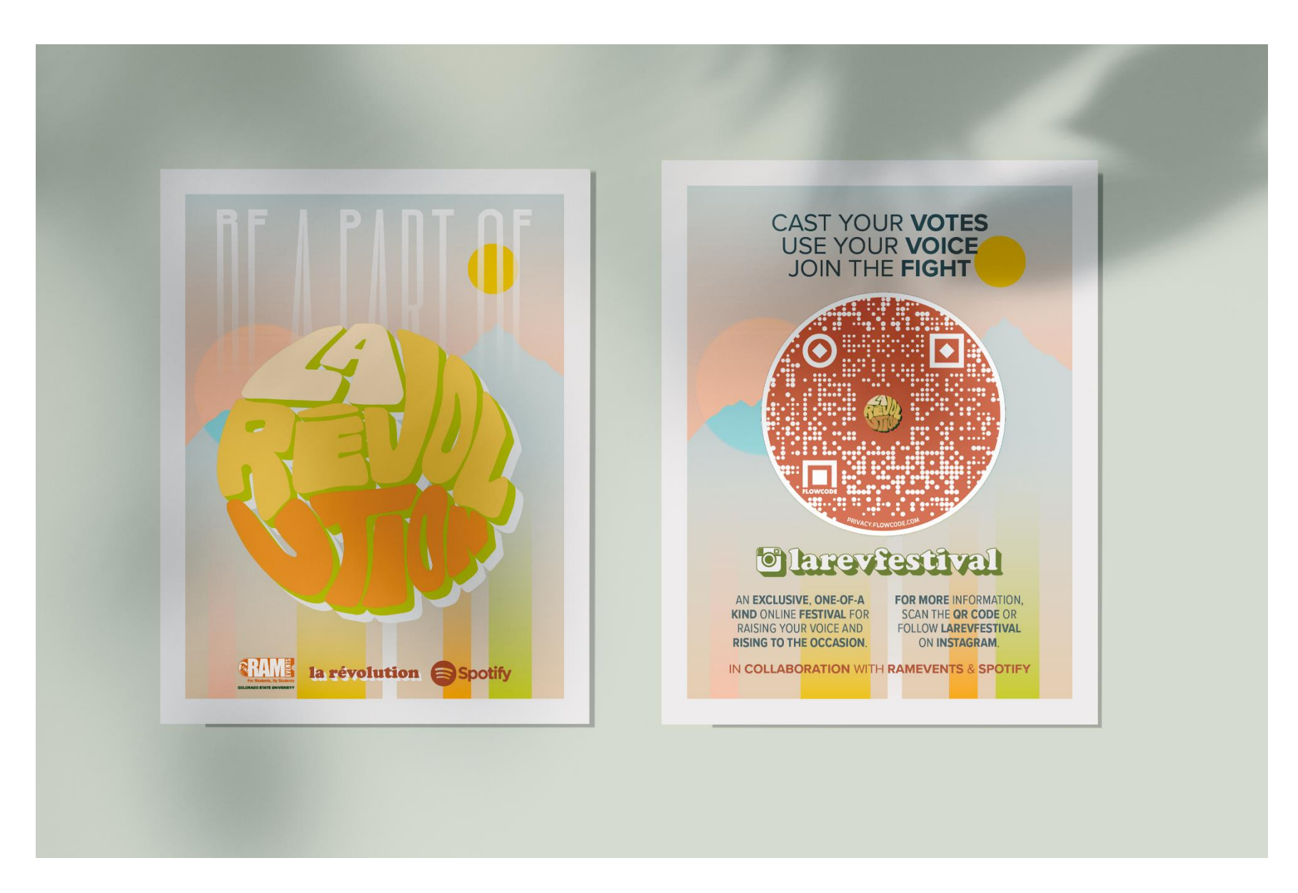
Figure 2: La Revolution Music Festival – campaign