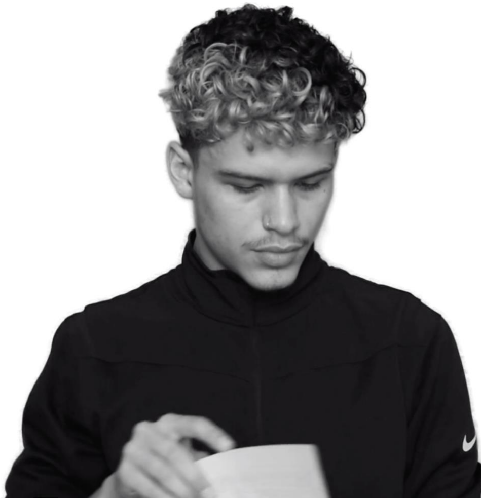
Figure 2: Reading Every word in the dictionary and giving it a color (A-M) https://vimeo.com/473043243