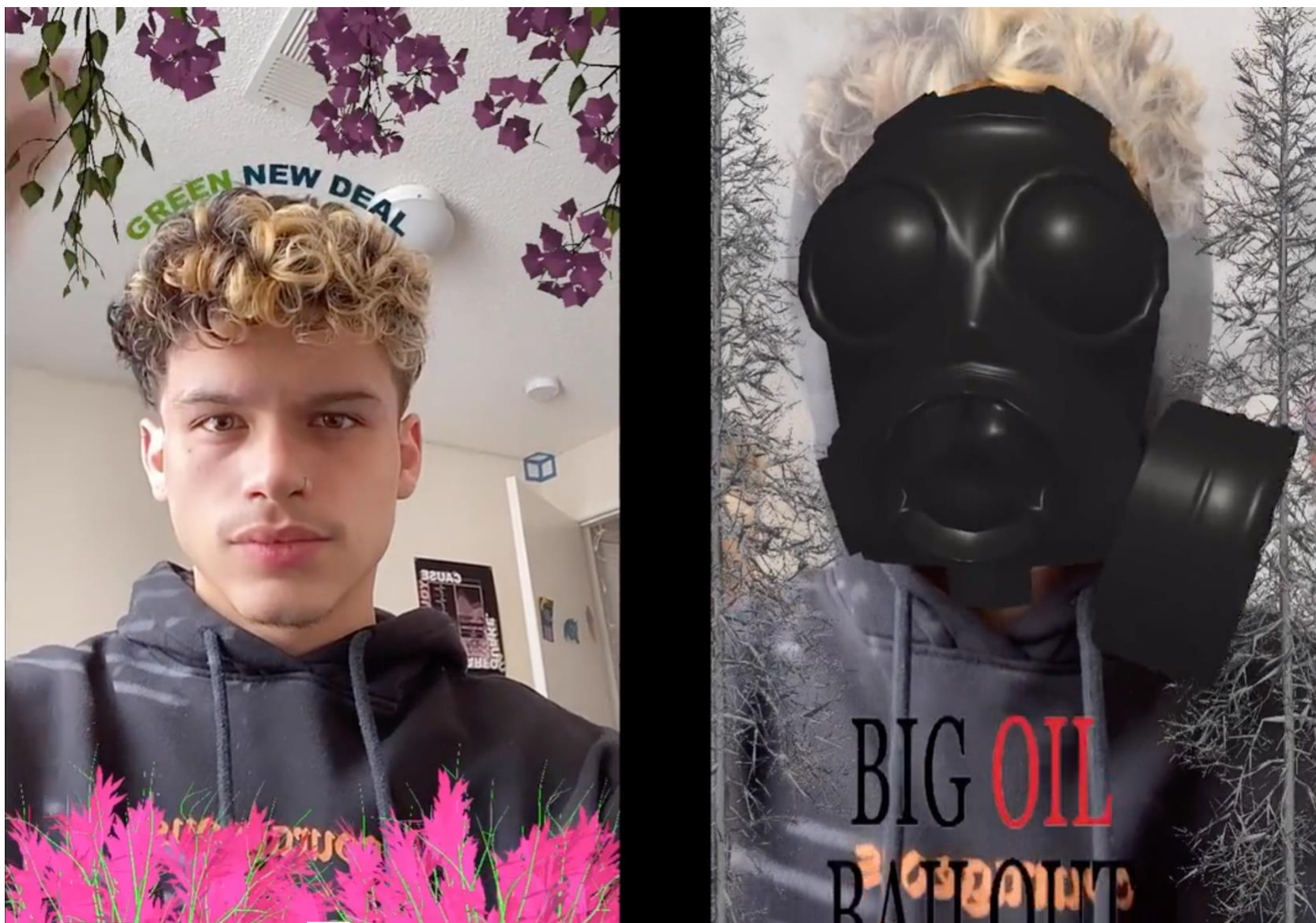
Figure 5: Green New Deal Propaganda Filters