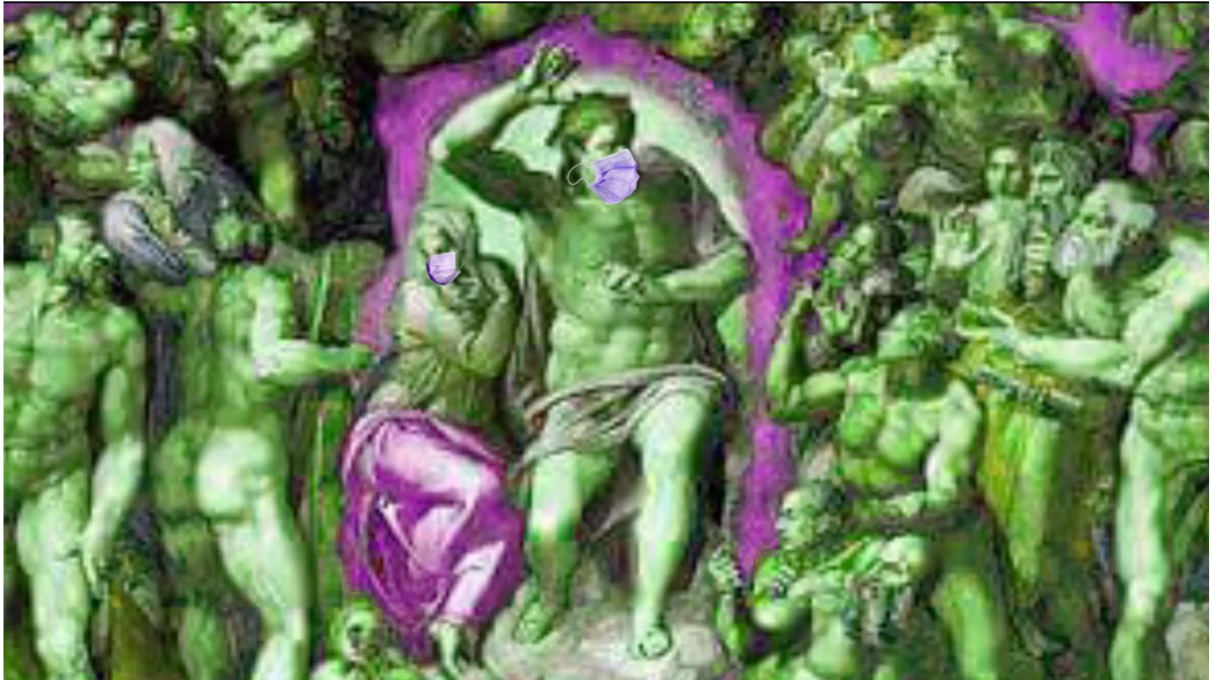
Figure 1: Isolation