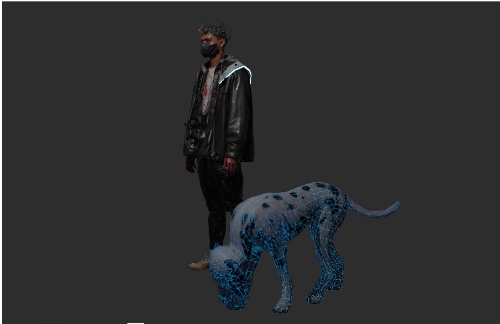
Figure 6: Guardian Holo-Pets https://vimeo.com/546124164