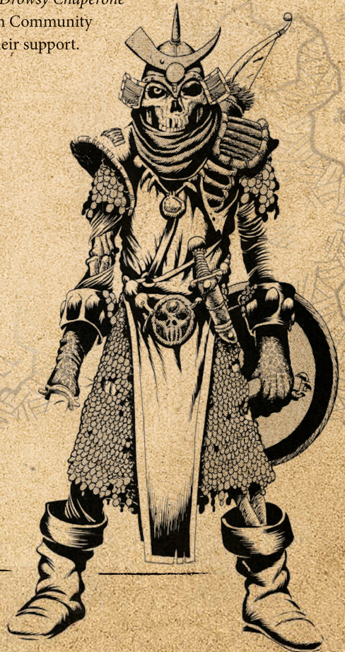
Illustration by Tim Trusan