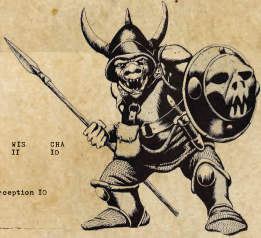
Illustration by Tim Truman

Skills: Intimidation +2 Senses: darkvision 60 ft., passive perception 10 Languages: Common, Orc Challenge: 1/2