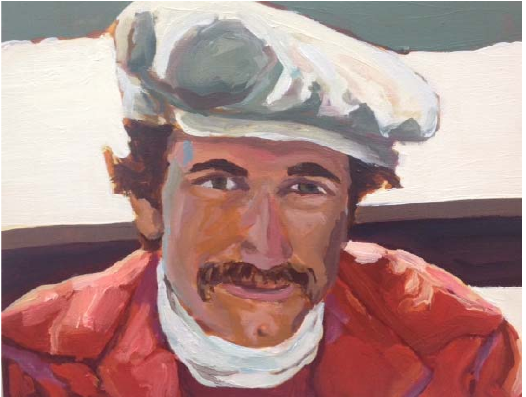
Figure 10: Austria.