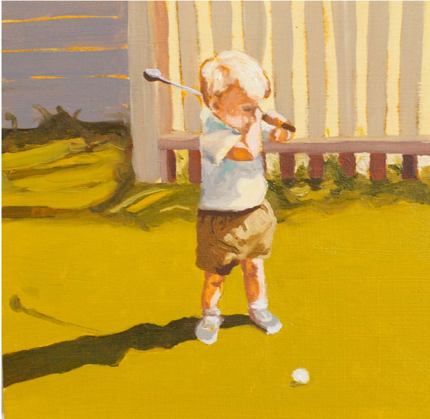
Figure 2: Born to Golf.