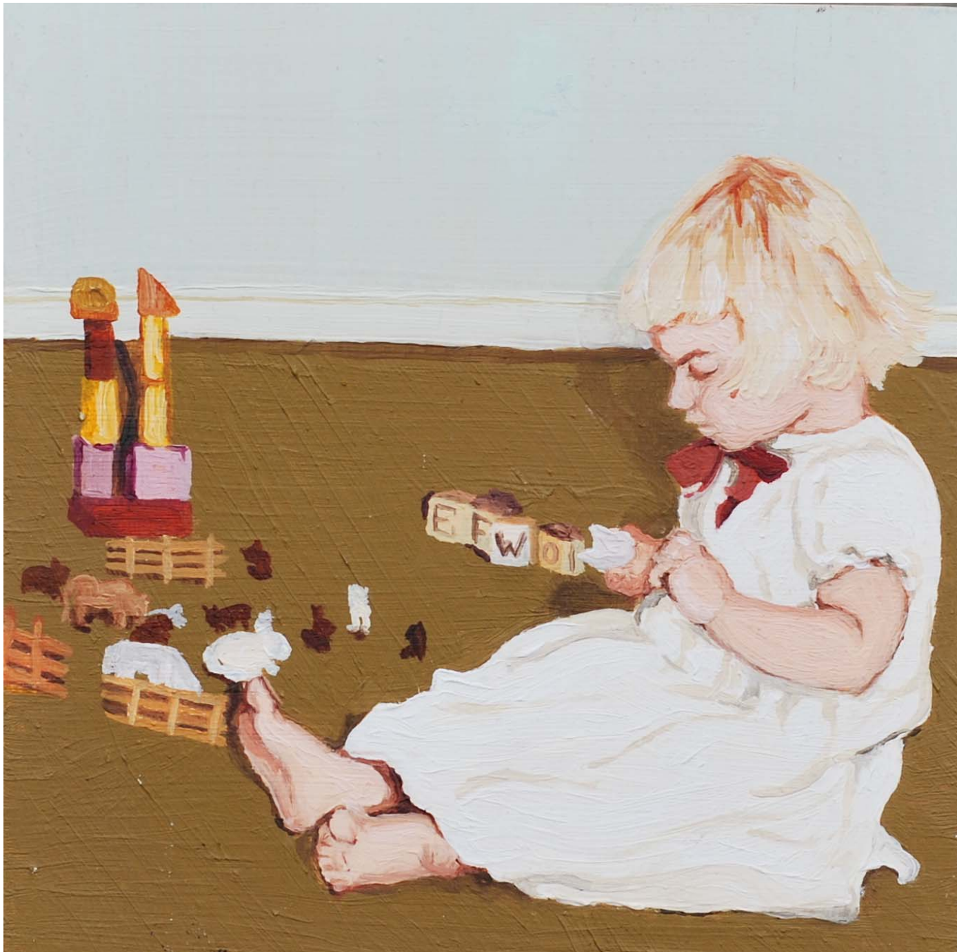
Figure 5: Toys.