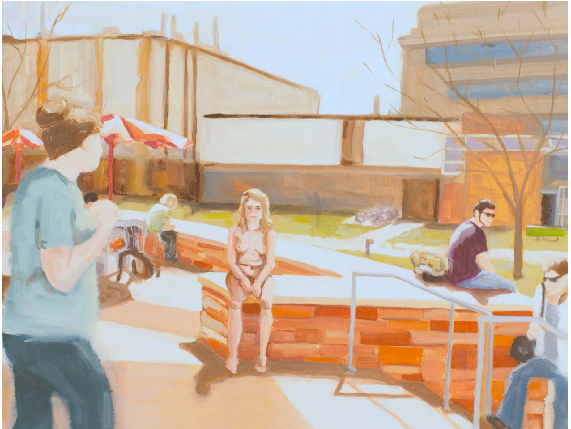
Figure 13: Exposed.