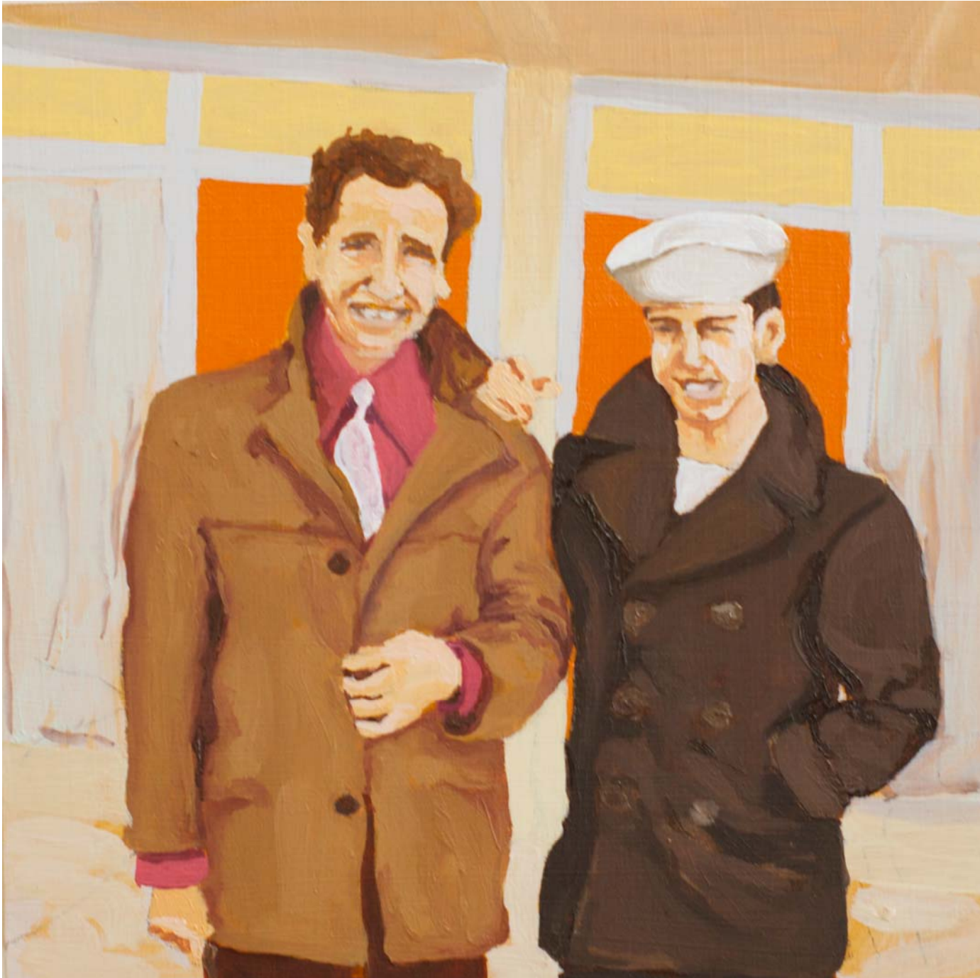
Figure 1: Navy.