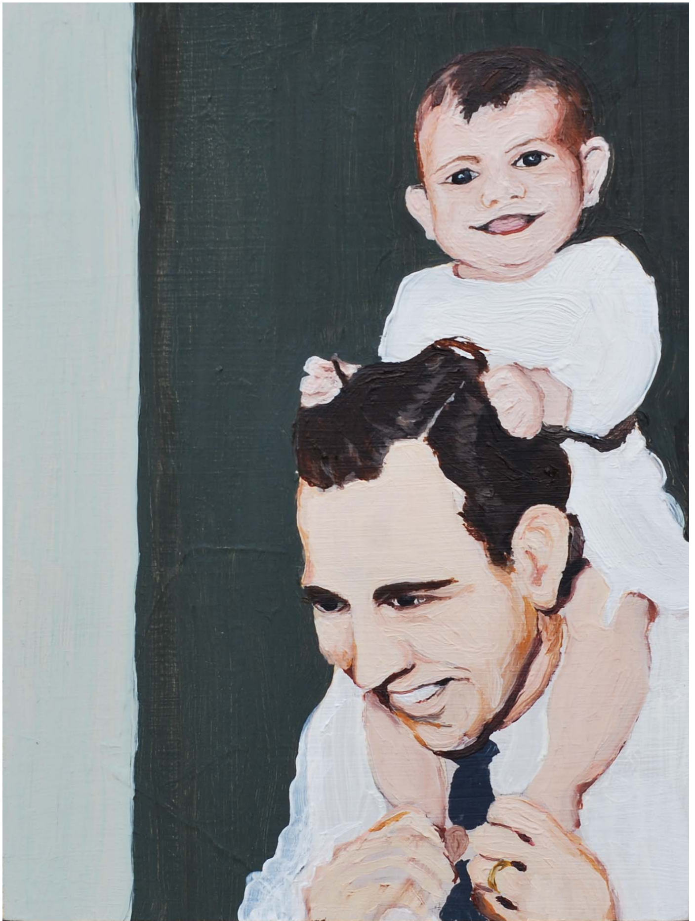
Figure 9: Opa.