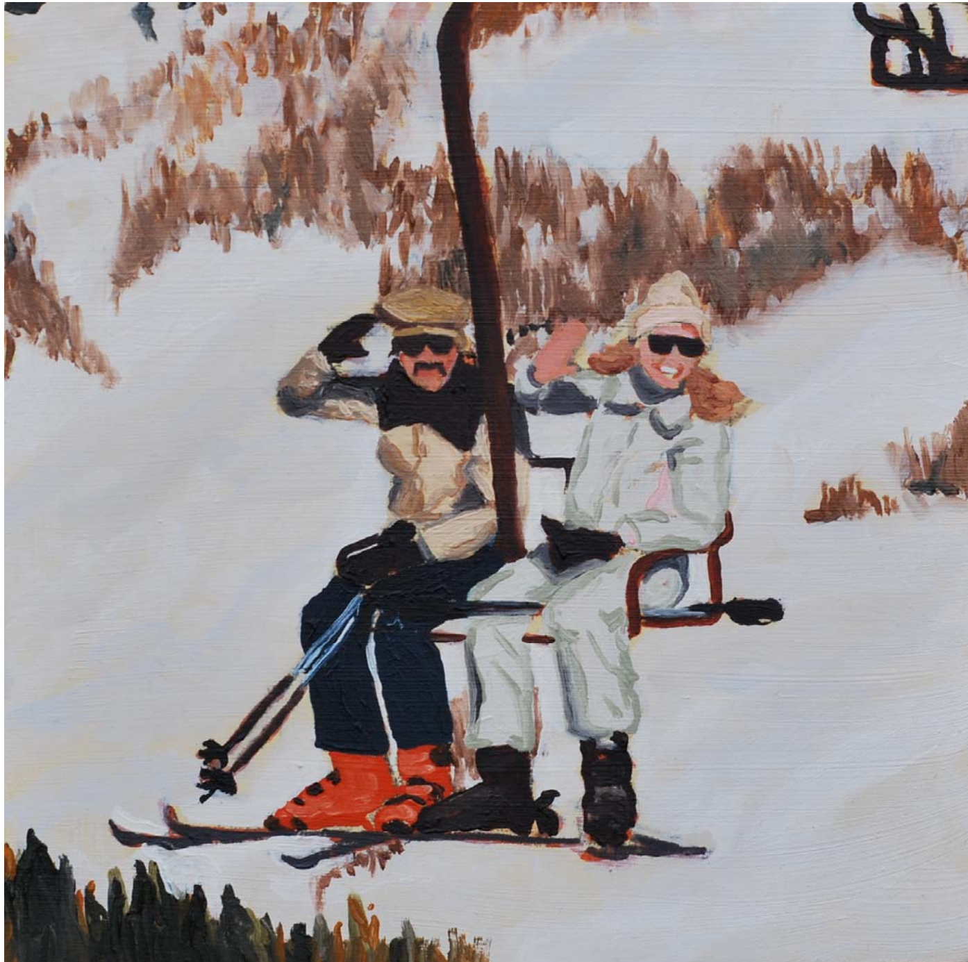
Figure 6: Happy.