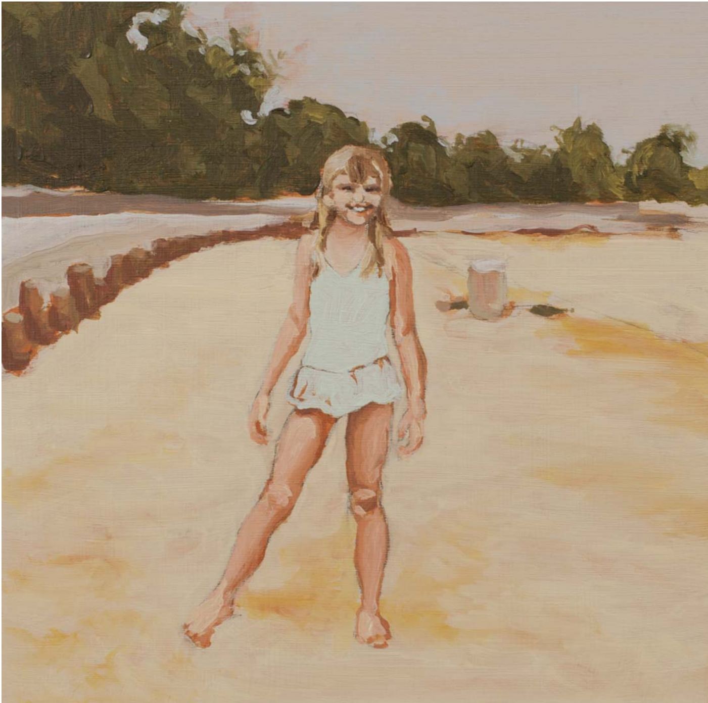
Figure 3: Chicago.