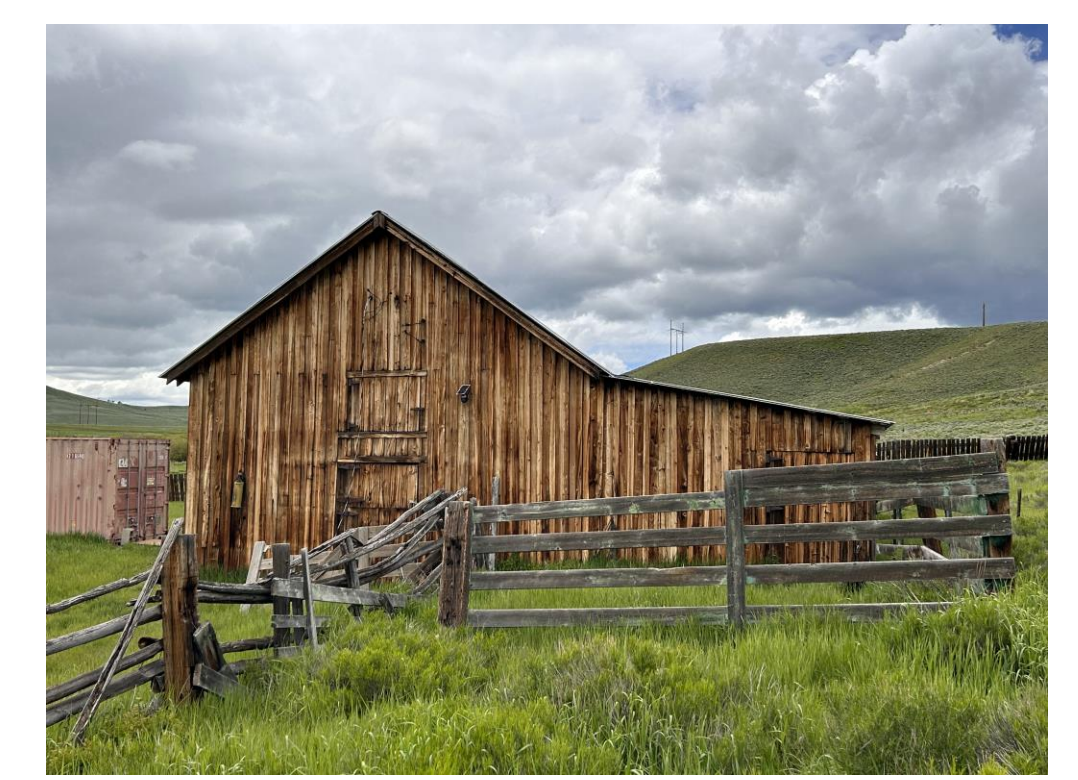
A historic barn at The Perry Ranch