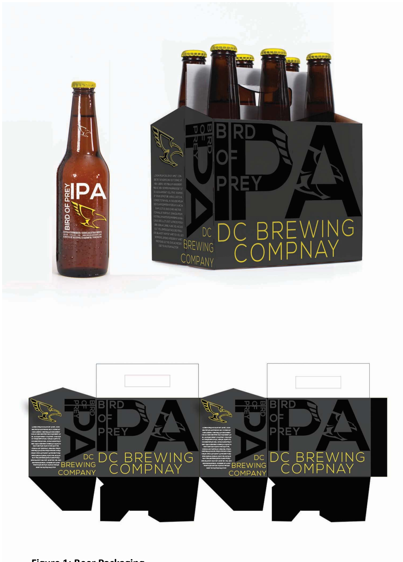
Figure 1: Beer Packaging.