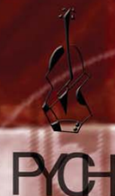
Figure 7: PYCH Poster 3.