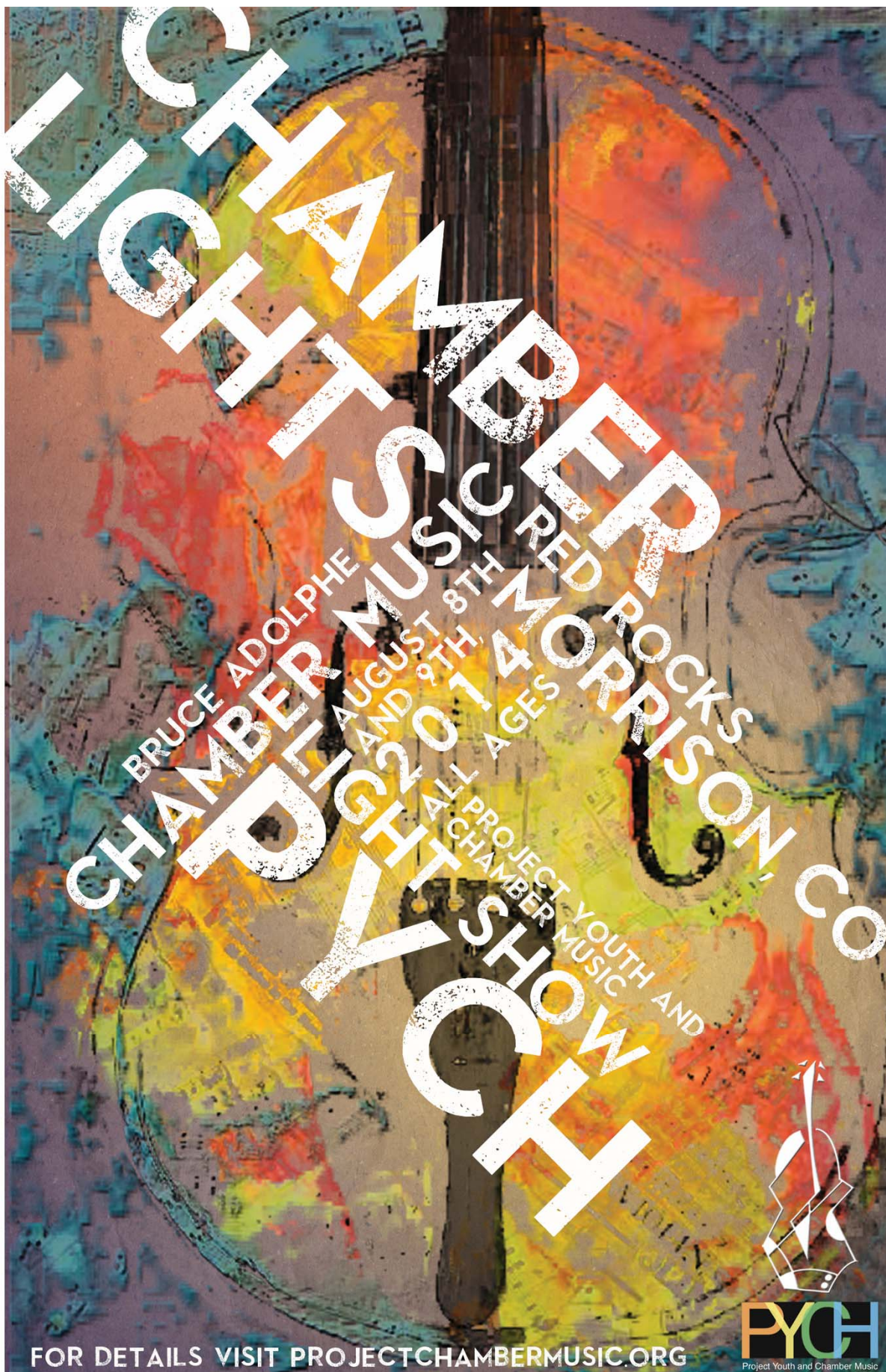
Figure 5: PYCH Poster 1.