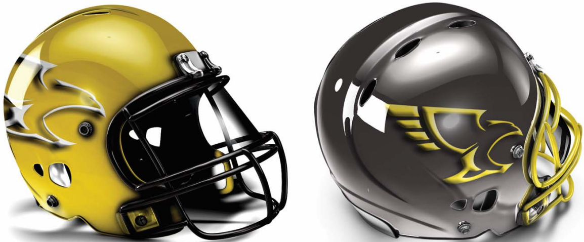
Figure 8: Uniform Design.