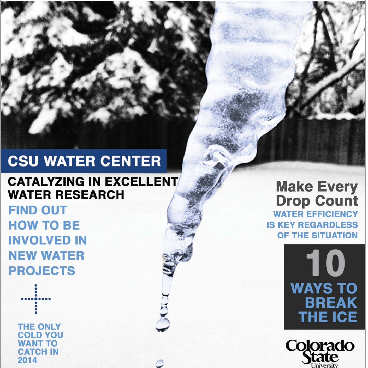
Figure 9: Water Magazine Cover.