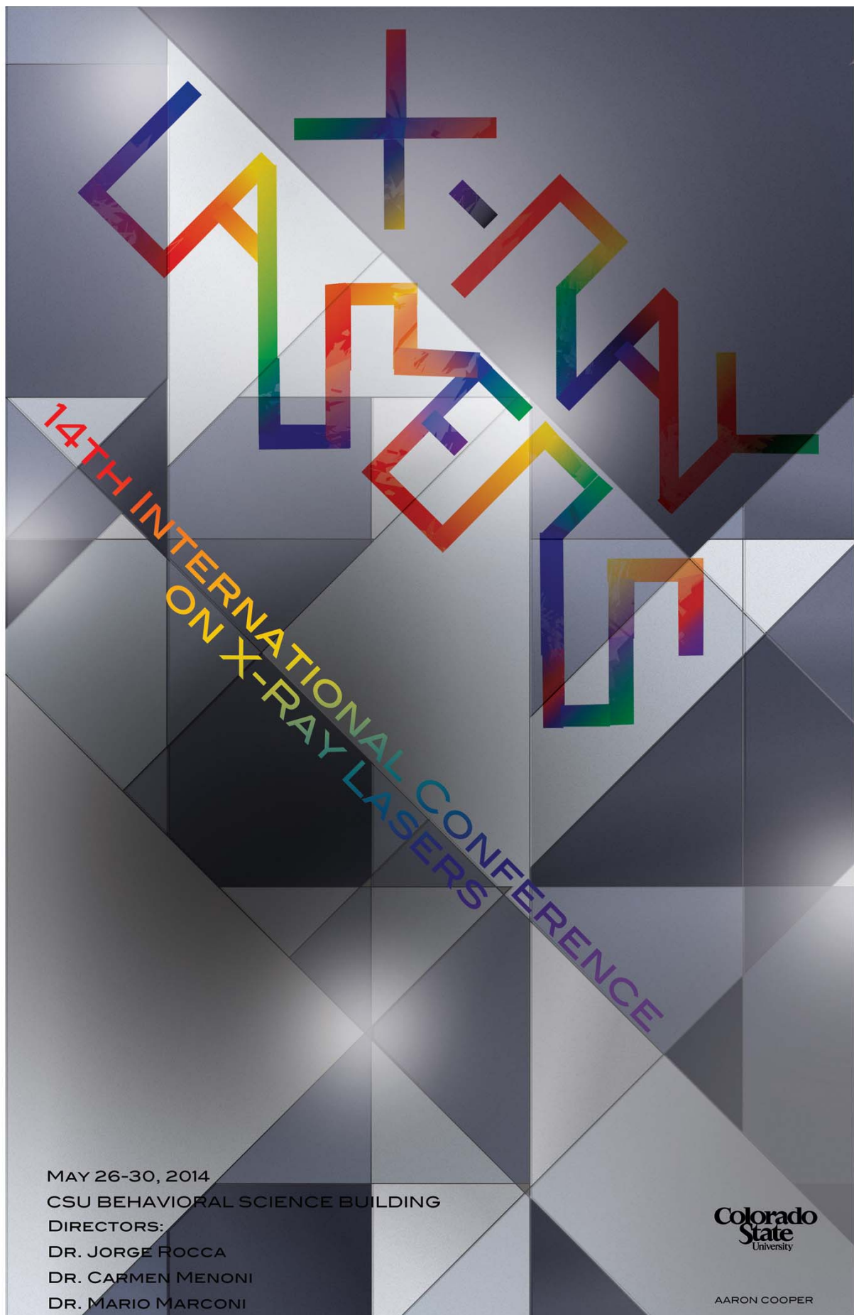
Figure 10: X-Ray Laser Poster.