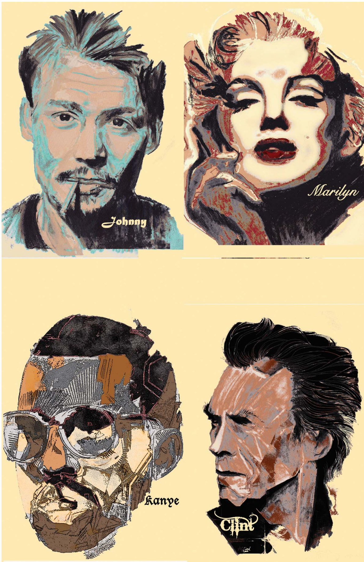
Figure 2: Gemini Celebrities.