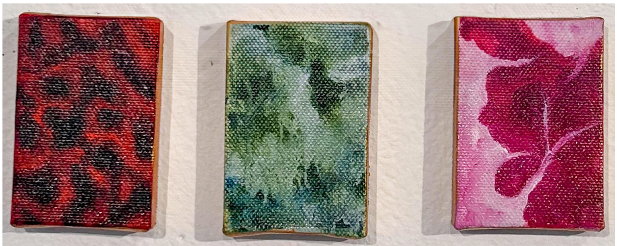
Figure 2: Mini Triptych