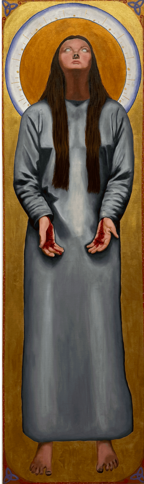
Figure 8: Ultimum Agnus