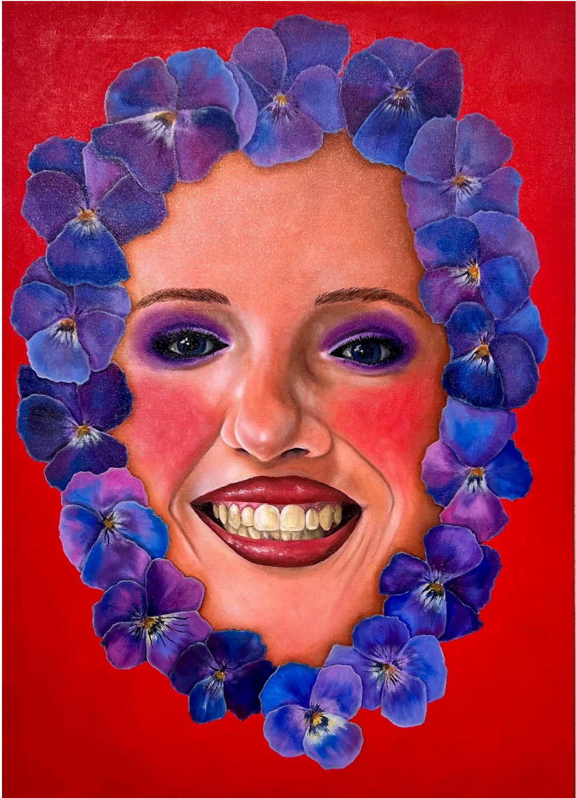
Figure 4: Sweet Violet