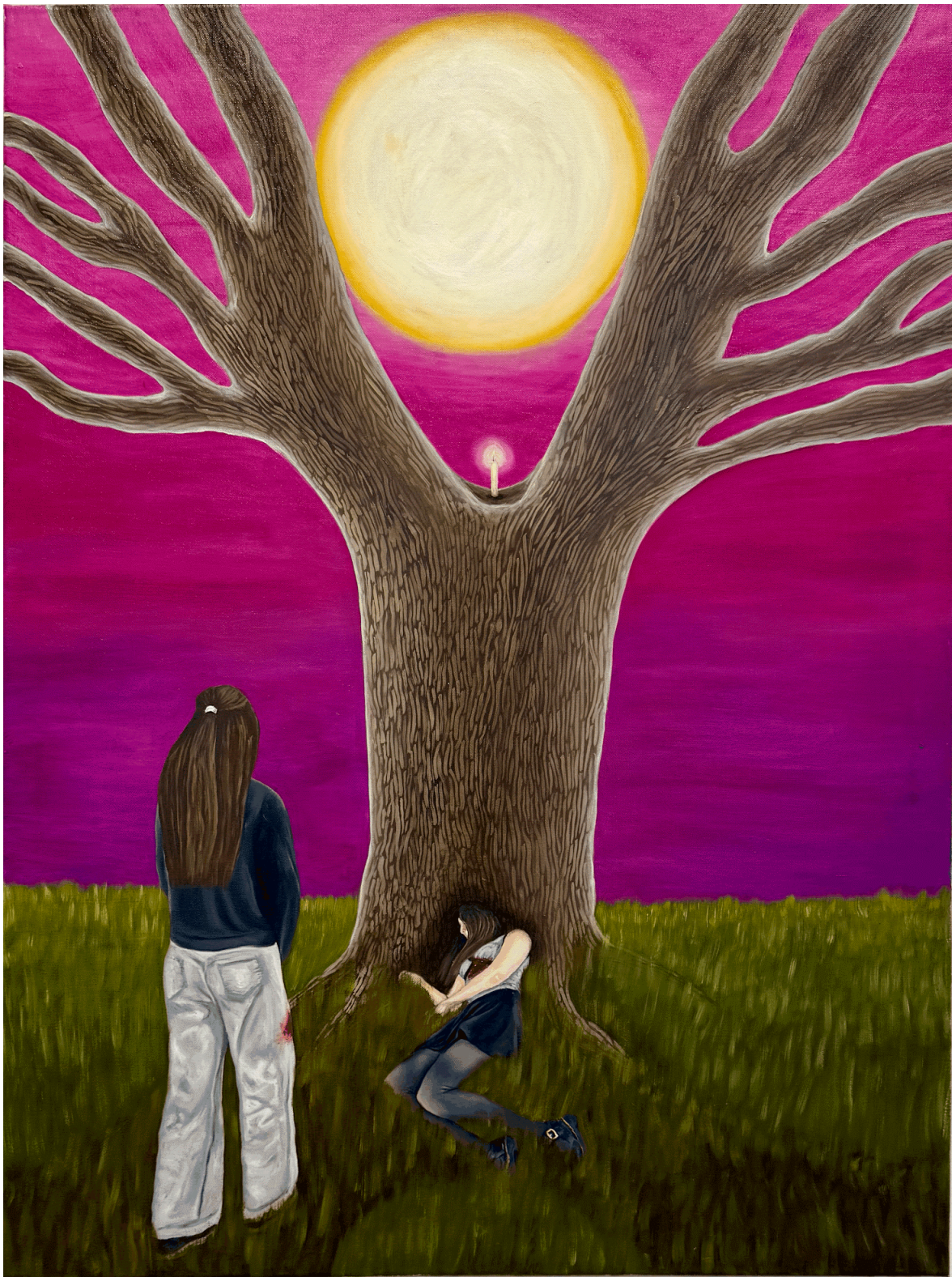
Figure 6: Under The Witching Elm