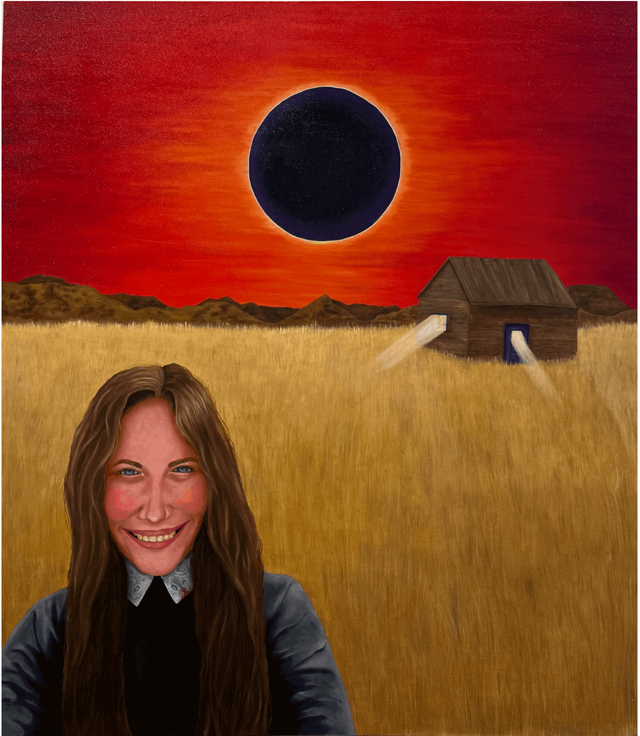
Figure 7: The Killing Fields