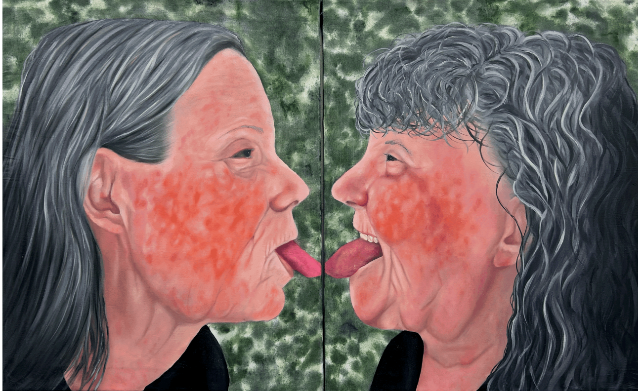
Figure 1: Expired