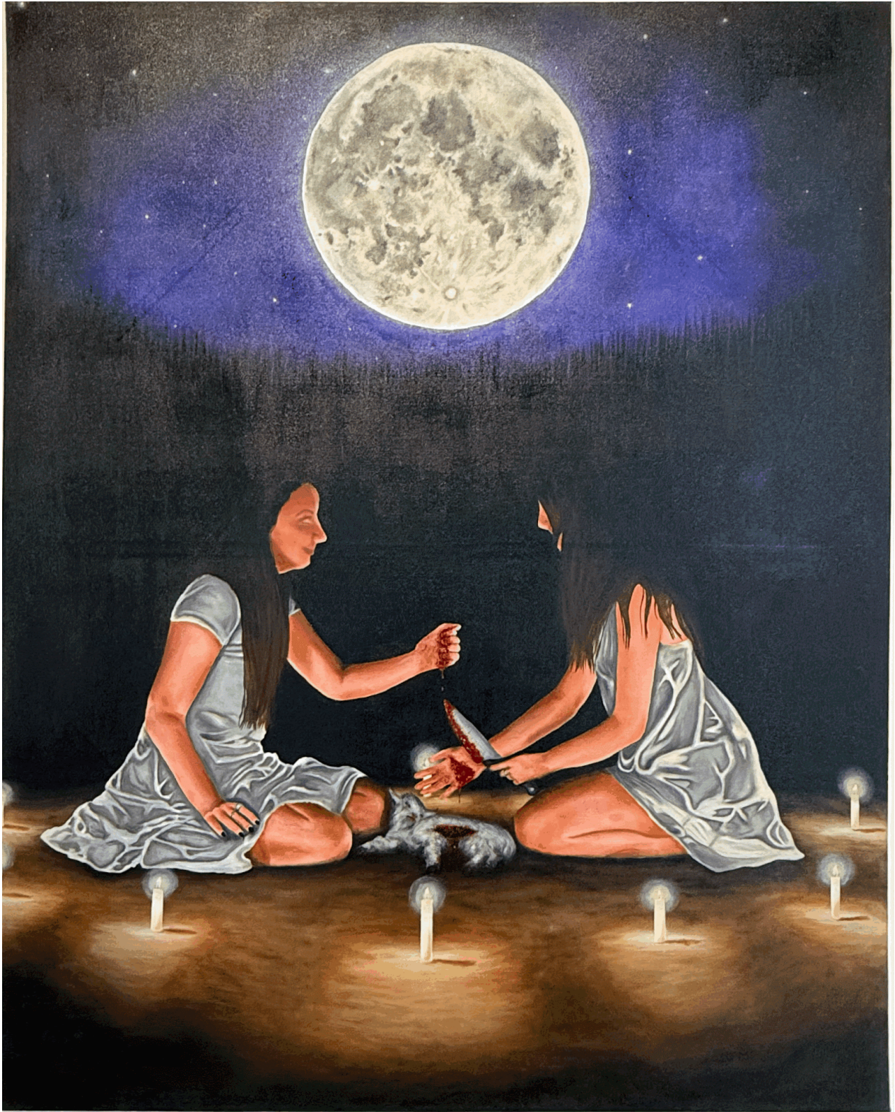
Figure 5: Hebrews 9:22