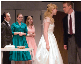
Image 3: Fool for Love by Sam Shepard.