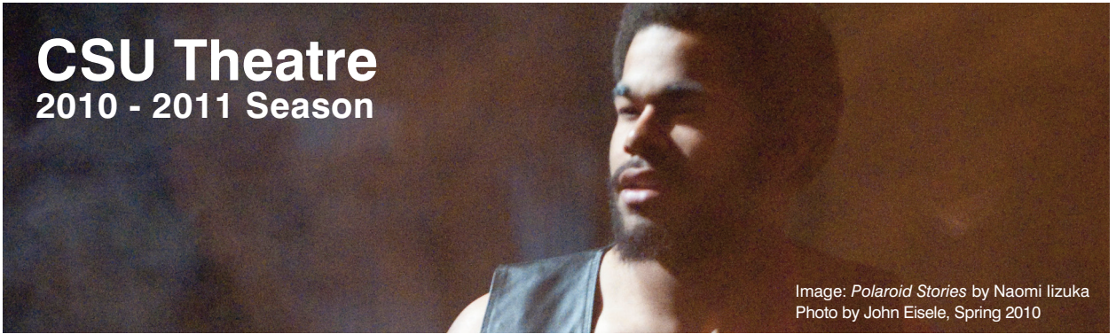
Image: Polaroid Stories by Naomi Iizuka Photo by John Eisele, Spring 2010