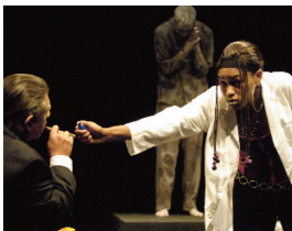
Image: The Marriage of Bette and Boo by Christopher Durang.

February 1, 2, 3, 4, 5, 8 p.m., Sunday, February 6, 2 p.m., University Theatre