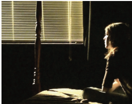
Image 2: Oh What A Lovely War, by London's Theatre Workshop.

The brilliant American classic by the author of Death of a Salesman . The complex relationships between fathers and sons and the conflicts between business ethics and personal morality.