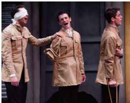
Image 1: One Flew Over the Cuckoo's Nest, by Dale Wasserman adapted from the novel by Ken Kesey.

An unauthorized parody of Peanuts depicting Charles M. Schultz's characters as teenagers.