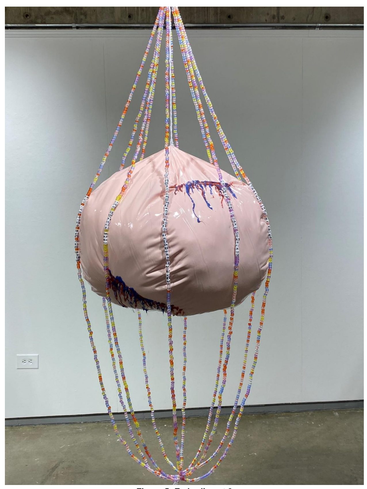
Figure 5: Embodiment 2