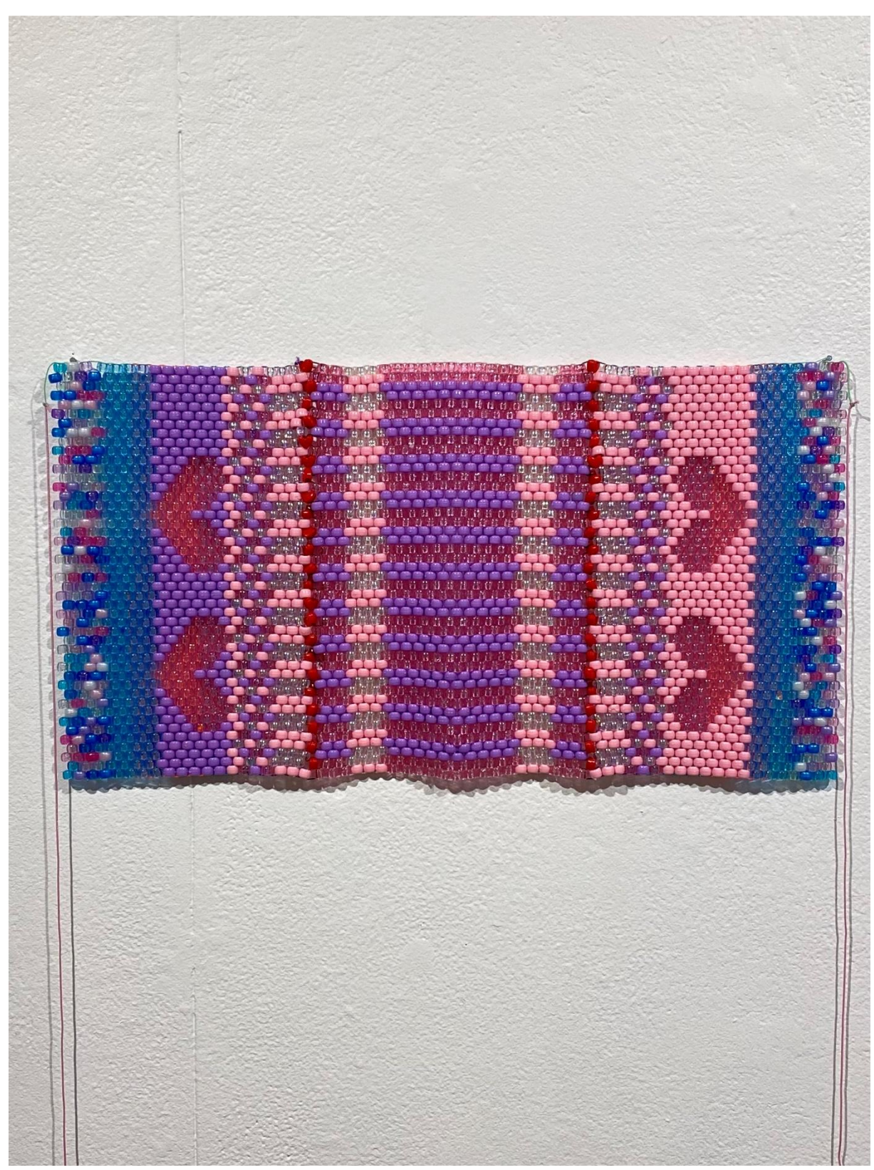
Figure 3: Candy Love