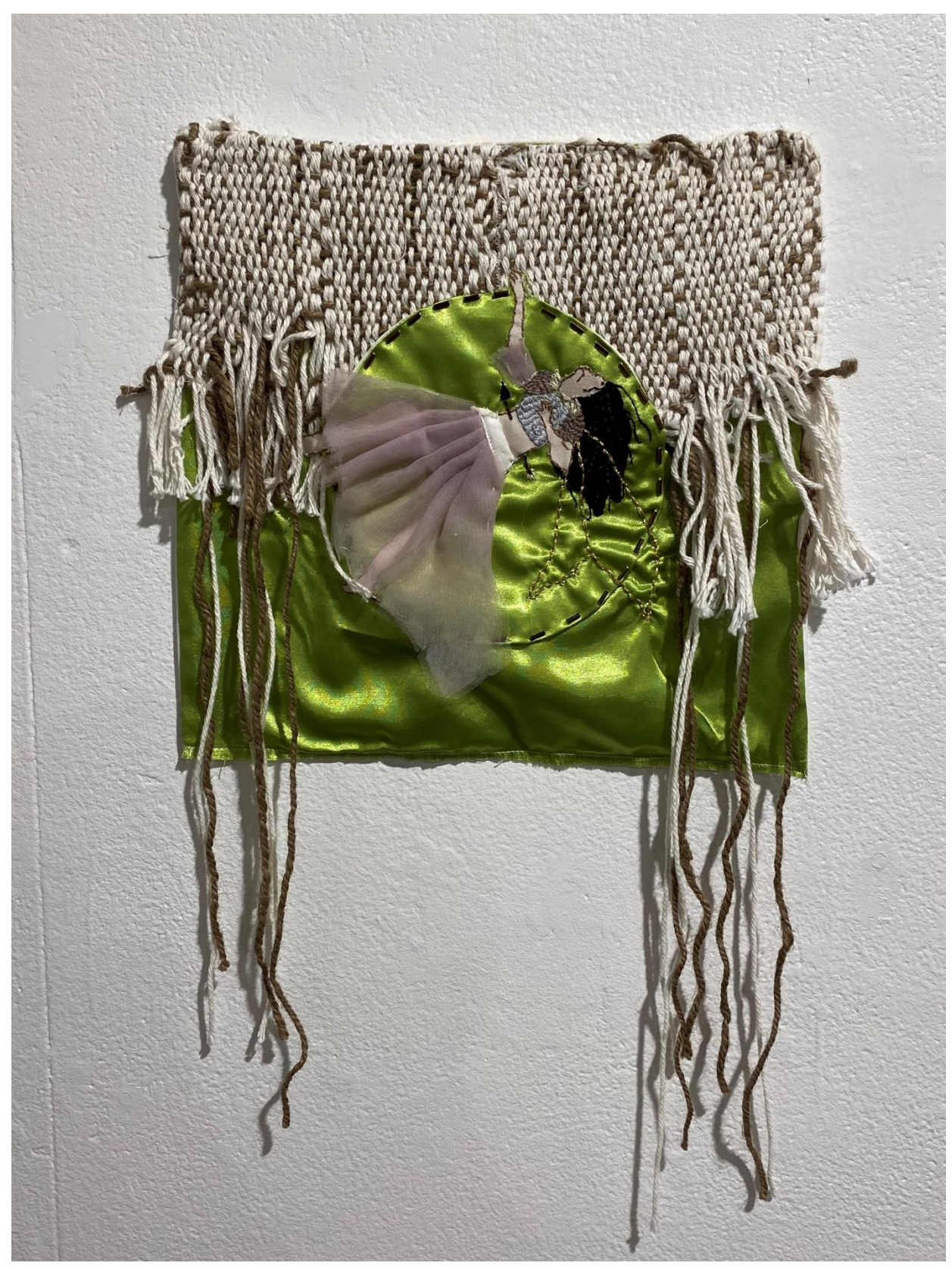
Figure 2: Fantasy