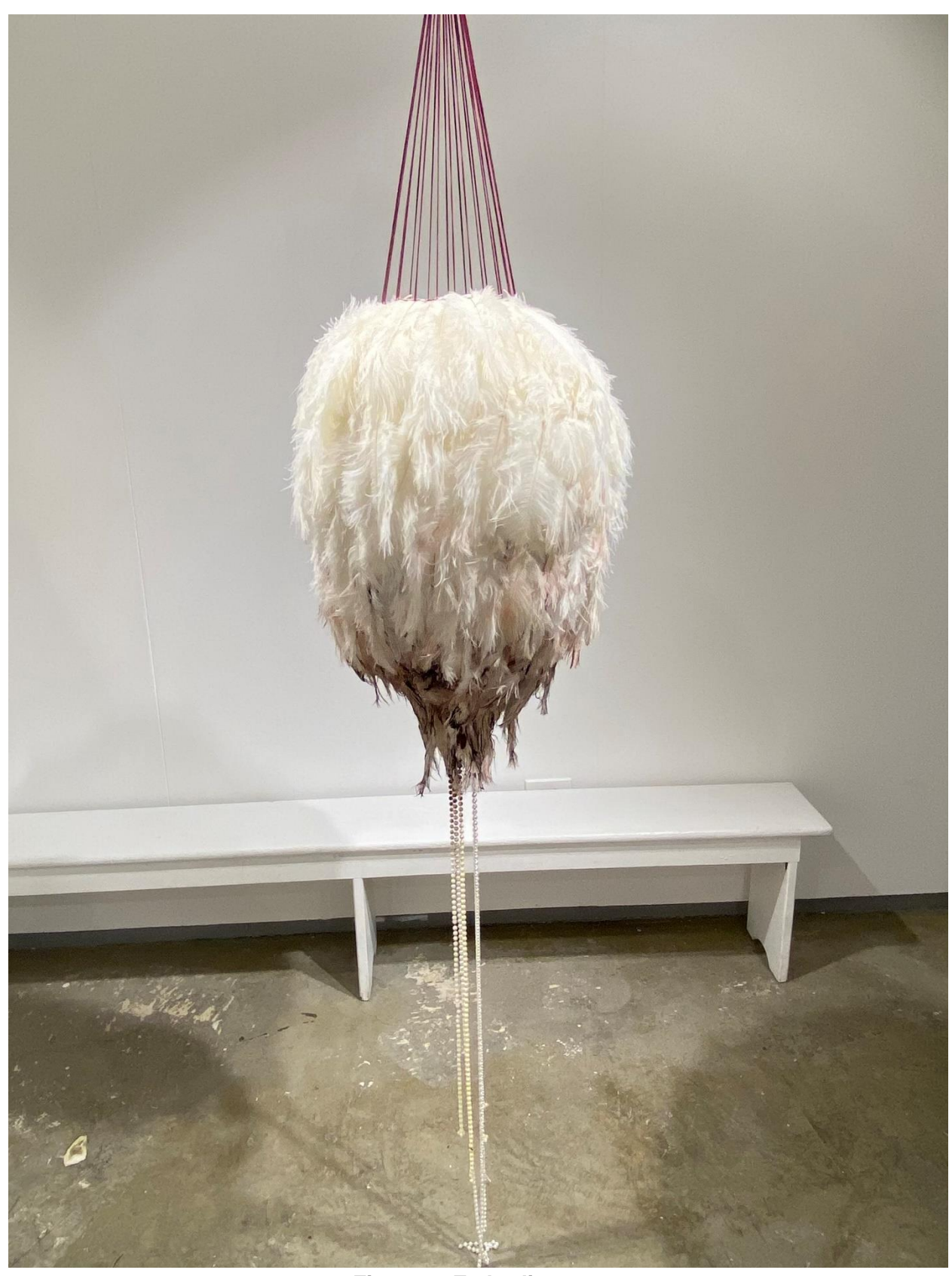
Figure 6: Embodiment 3