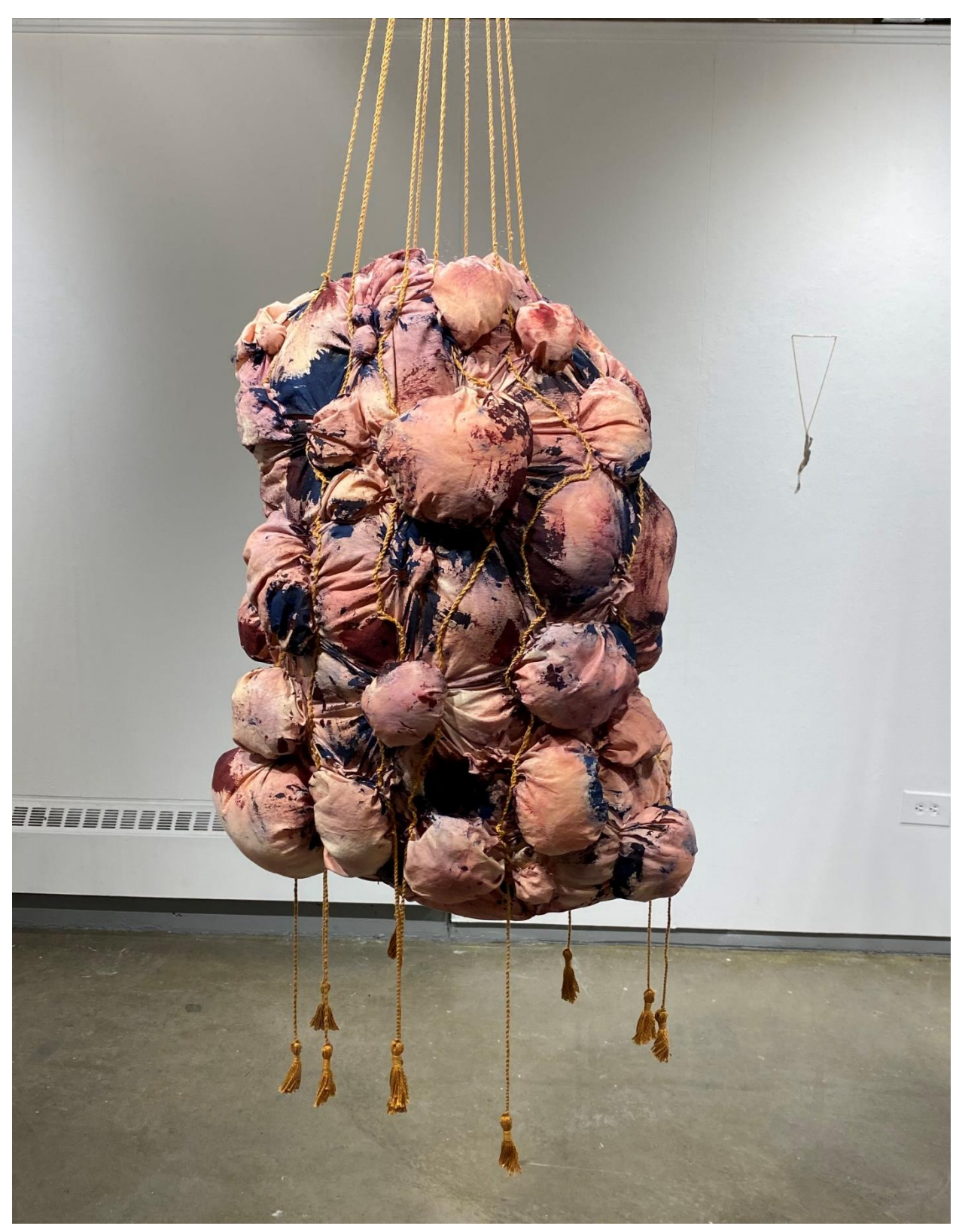
Figure 4: Embodiment 1