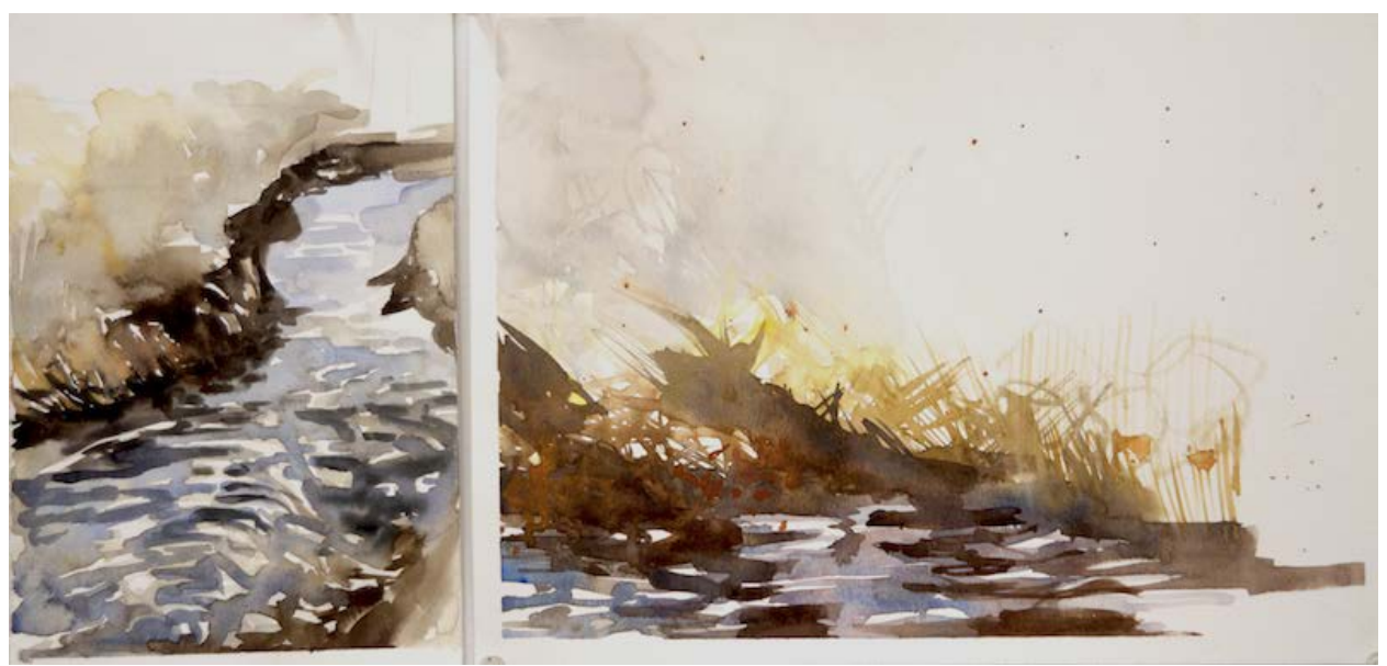
Reconstructed Place of Memory