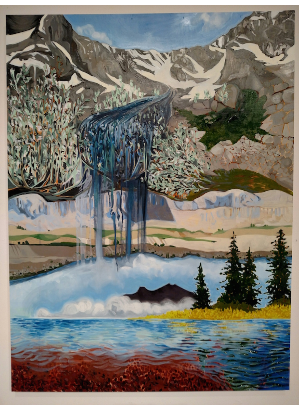
Places of Knowing