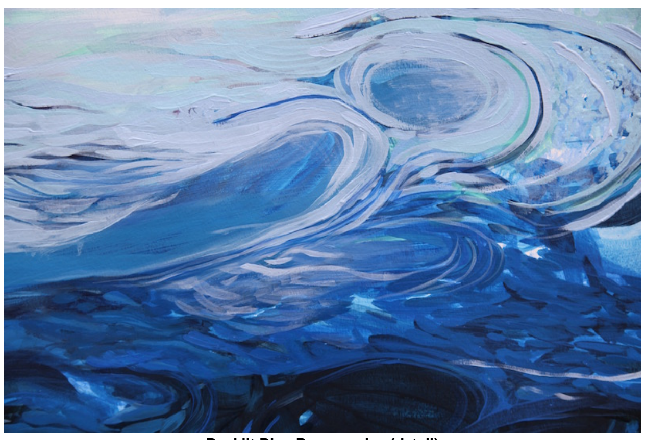
Backlit Blue Rememories (detail)