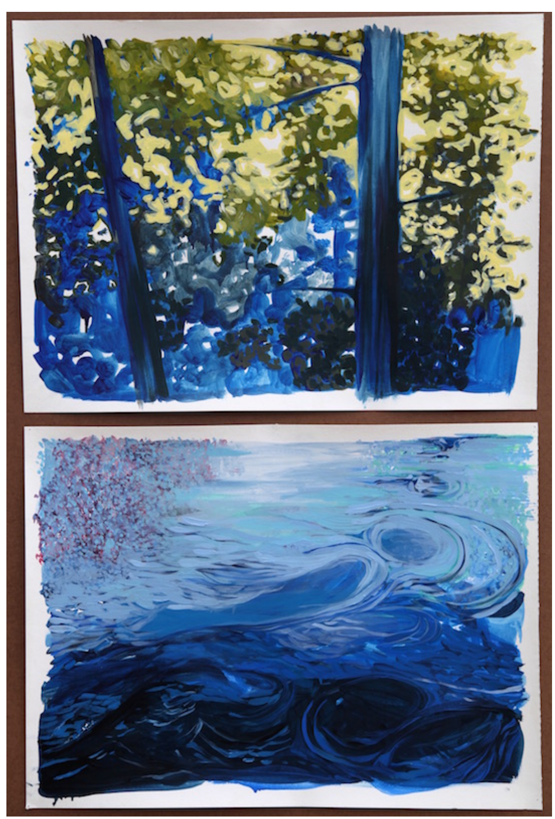
Backlit Blue Rememories