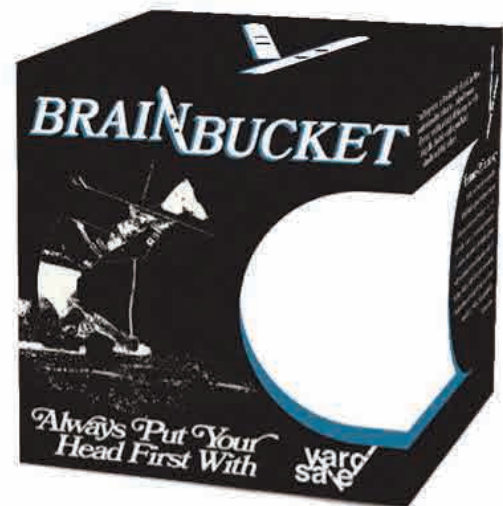
FIGURE 11: PACKAGING