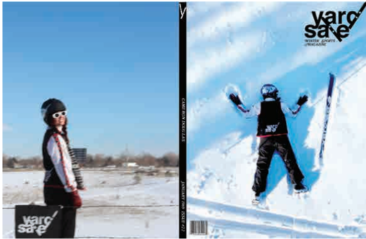
FIGURE 13: COVER/BACK MAGAZINE SPREAD