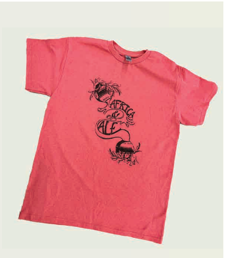
FIGURE 3: Africa & Ale Hand Printed T-Shirt