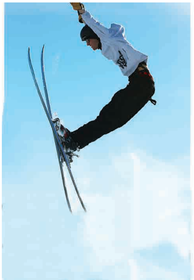
FIGURE 12: PERSONAL PHOTOGRAPHY/CLOTHING DOCUMENTATION