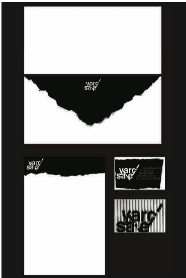
FIGURE 10: LETTERHEAD