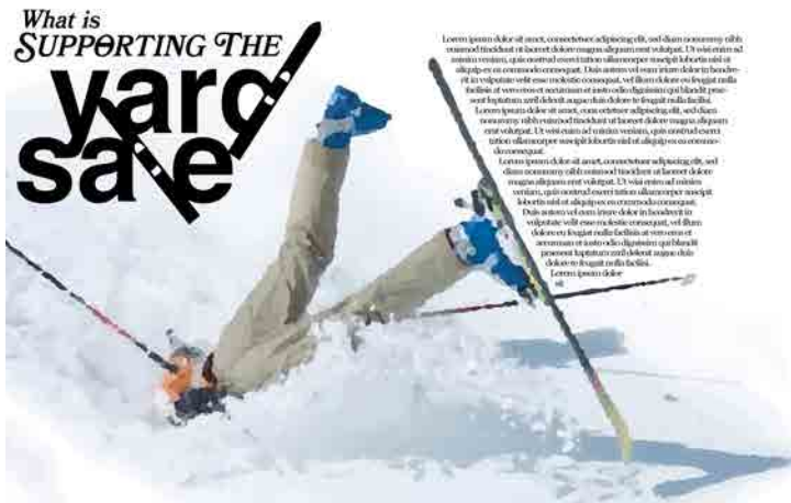
FIGURE 16: ARTICLE MAGAZINE SPREAD