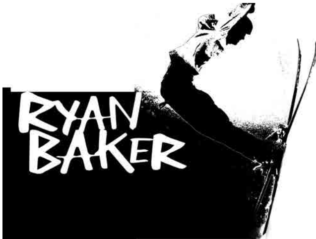
FIGURE 15: IMAGE MAGAZINE SPREAD