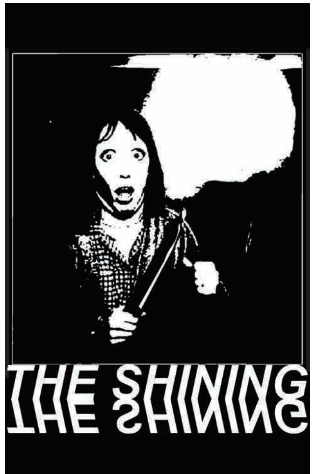
FIGURE 4: The Shining Posters