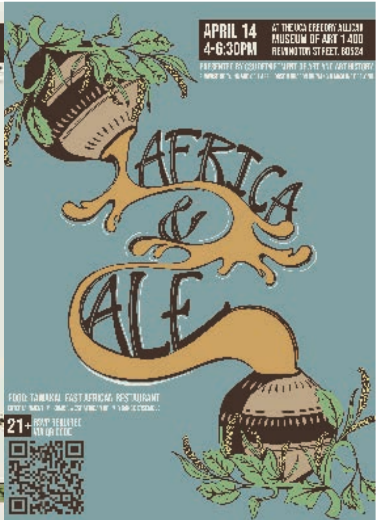
FIGURE 2: Africa & Ale Promotion Alternative