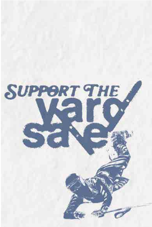
FIGURE 7: POSTER 1