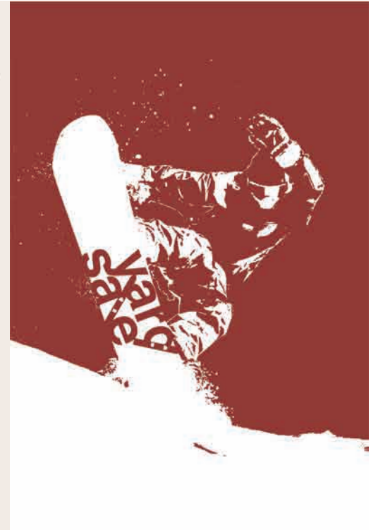
FIGURE 9: POSTER 3