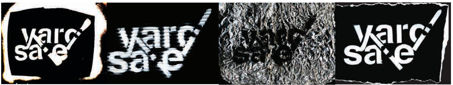
FIGURE 6: TEXTURE APPLICATIONS