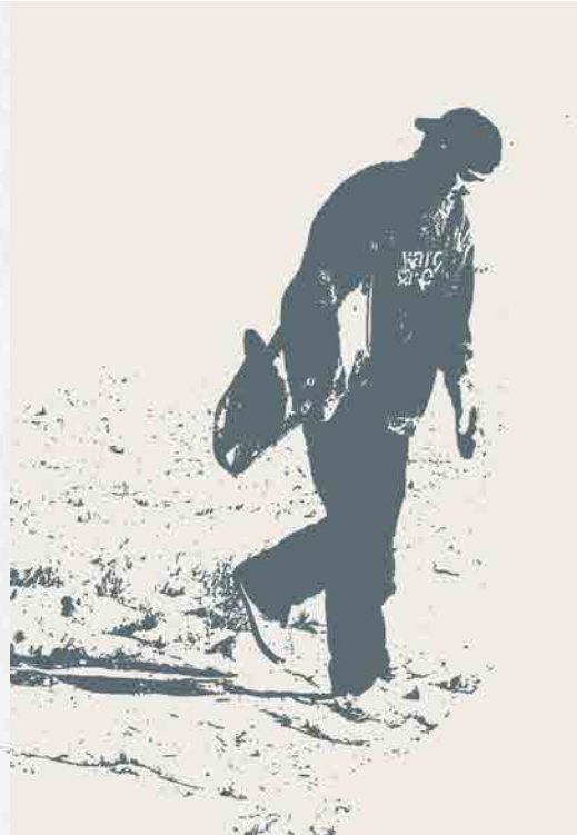
FIGURE 8: POSTER 2