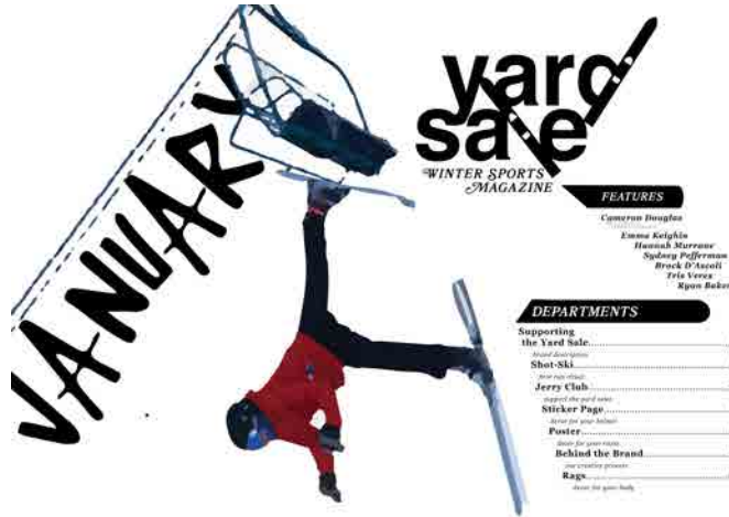
FIGURE 14: TABLE OF CONTENTS MAGAZINE SPREAD