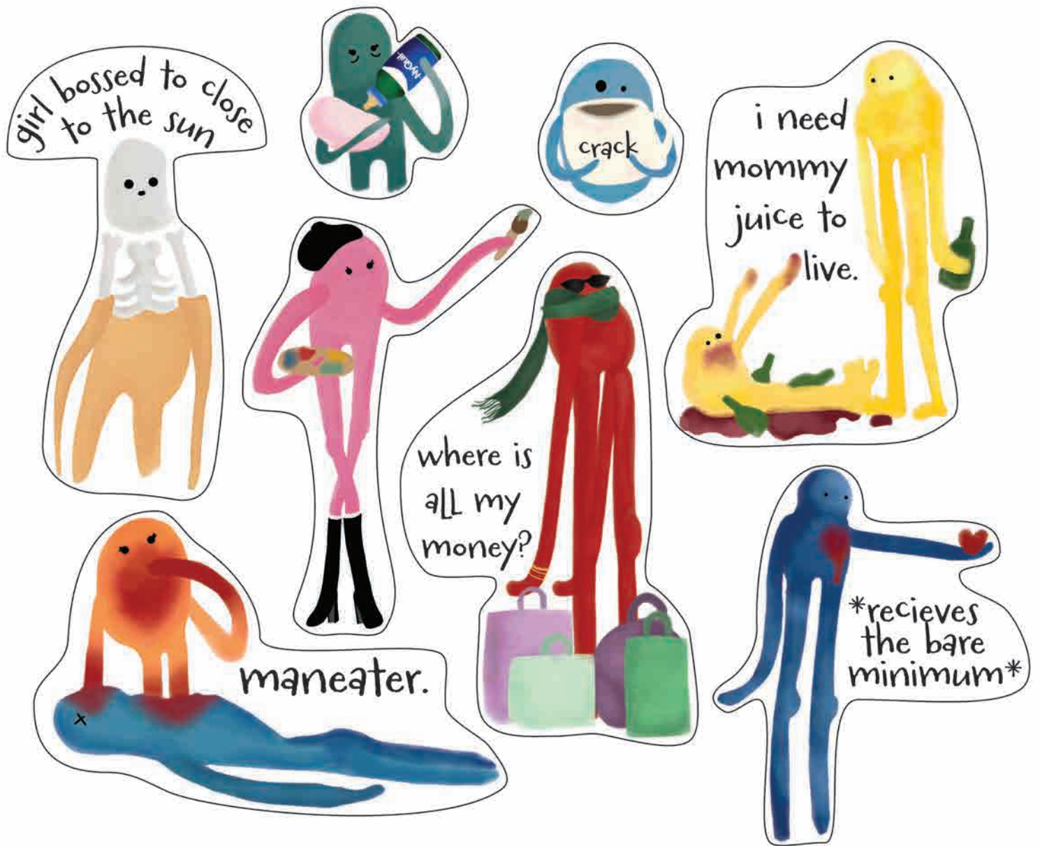
FIGURE 5: Stickers