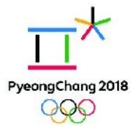
Figure 2: Winter Olympics Series (Snowboarding)