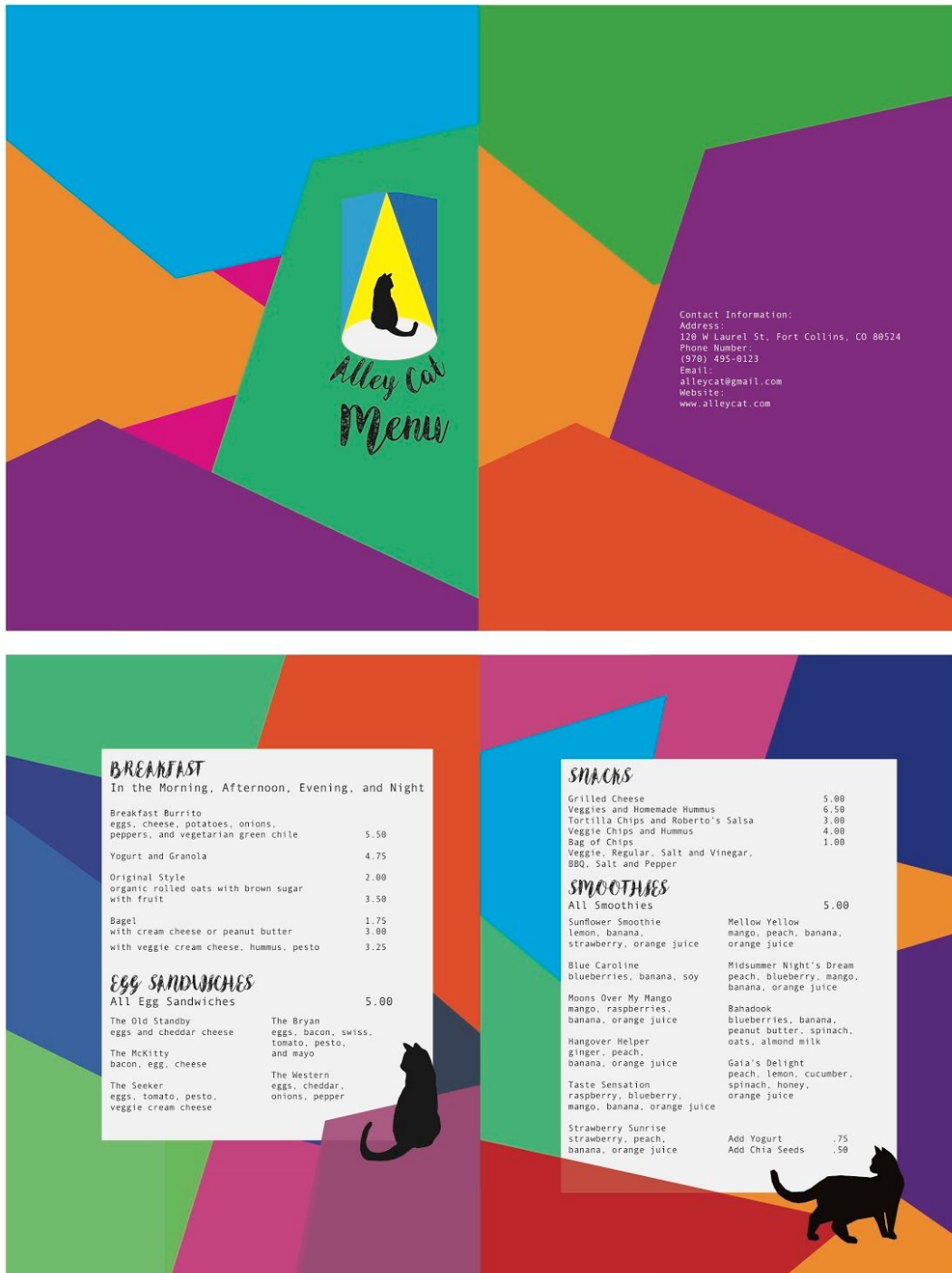
Figure 5: Menu (Pages 1-4)