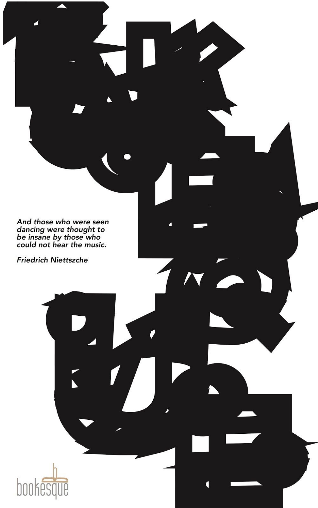
Figure 4: Final Poster Fantasia