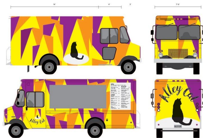
Figure 10: Food Truck Rebranding Project