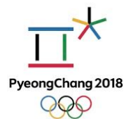
Figure 1: Winter Olympics Series (Skiing)