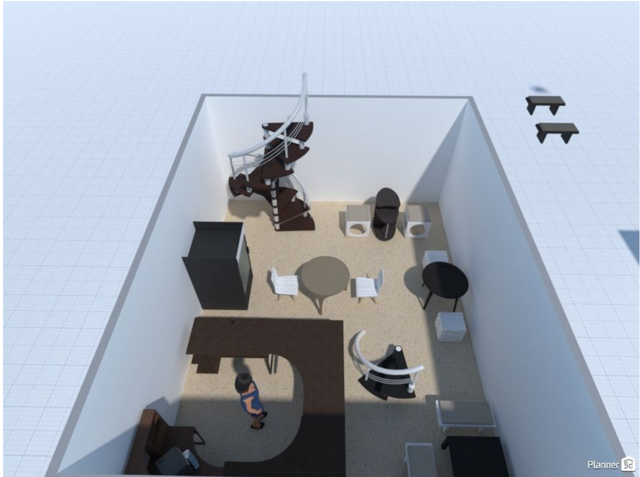
Figure 8: Retail Space