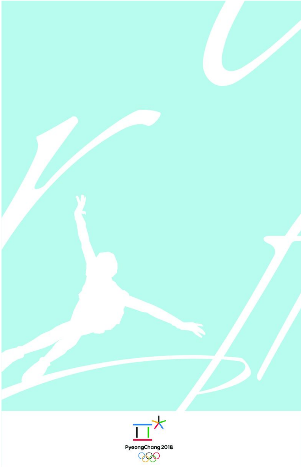
Figure 3: Winter Olympics Series (Figure Skating)