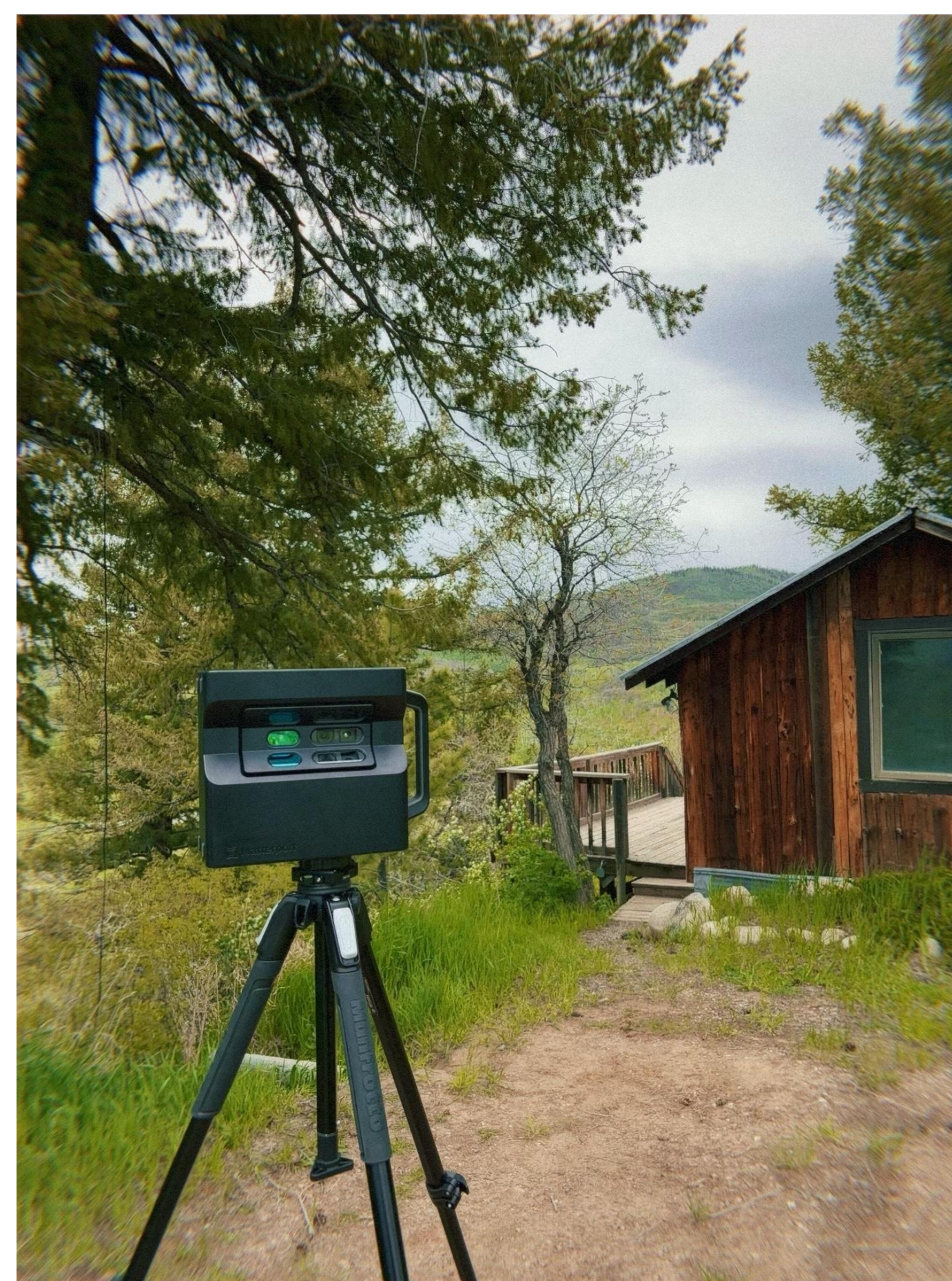
Figure 1. Matterport Pro 2 Camera in Action