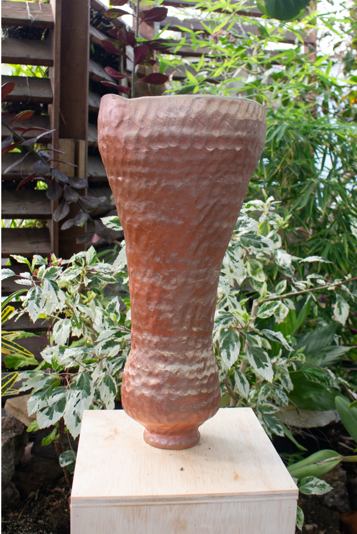
Figure 7: Seed I