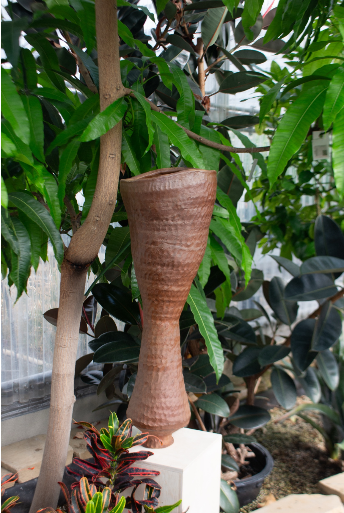
Figure 5: Seed III