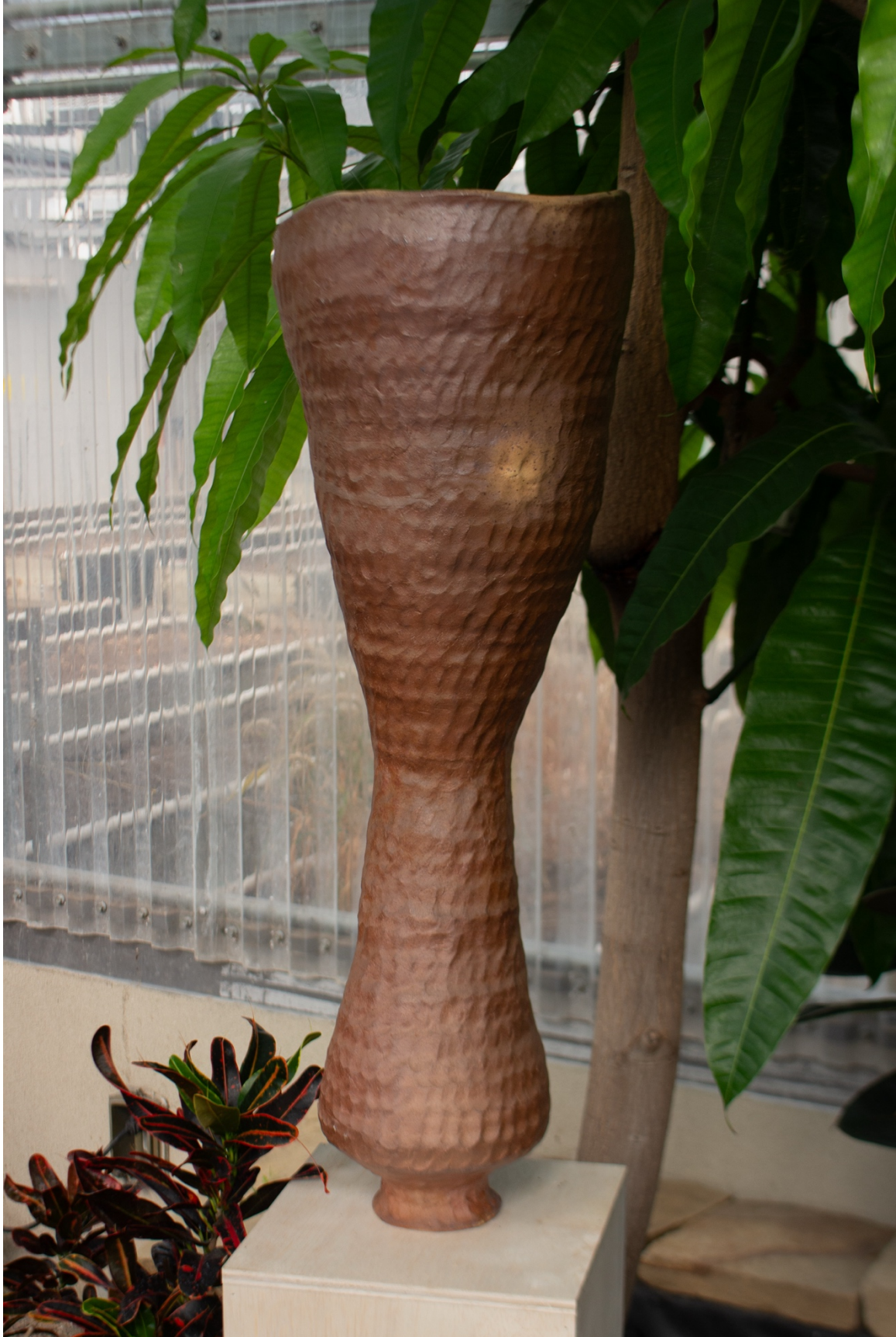
Figure 4: Seed III