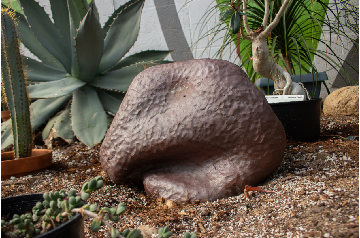
Figure 1: Fold