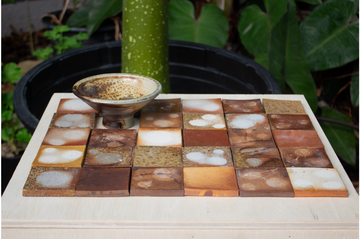
Figure 2: Flame Path