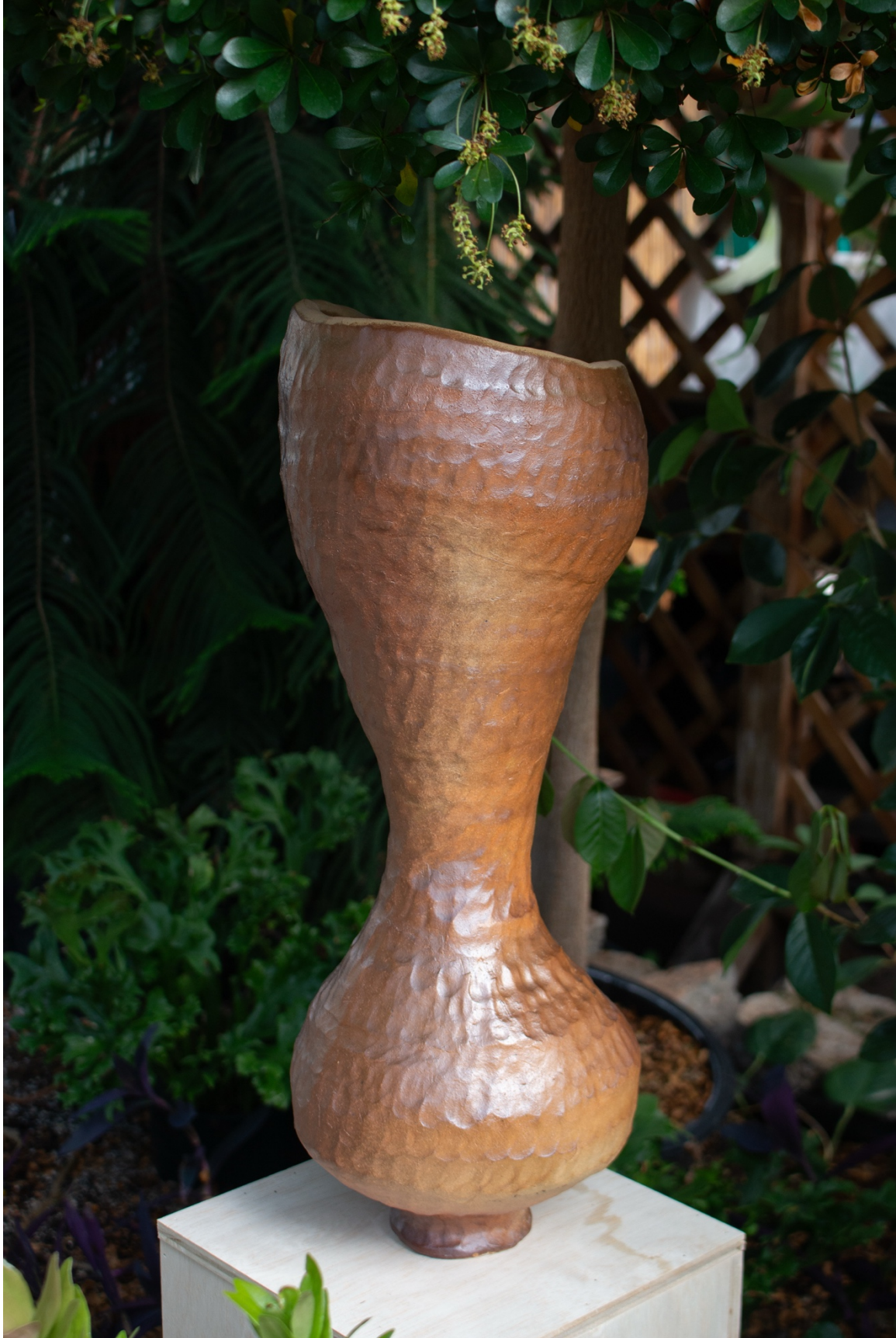
Figure 6: Seed II