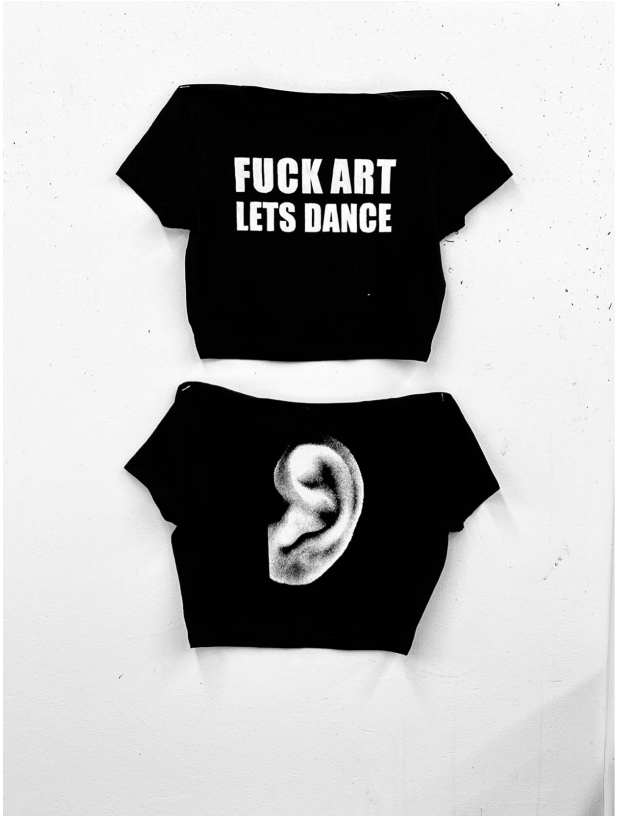
Figure 5: SHIRTS