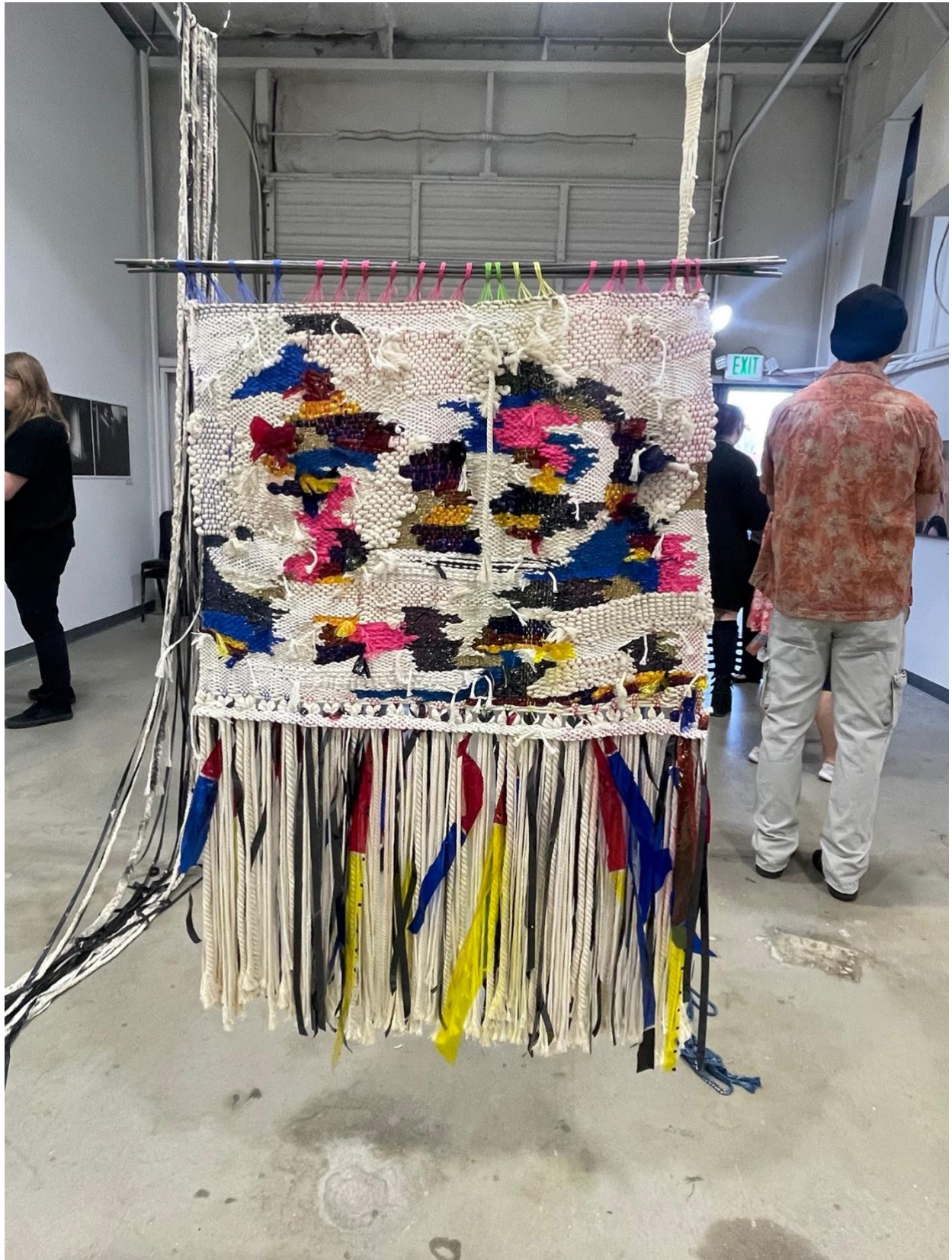
Figure 2: GLITCH (detail)