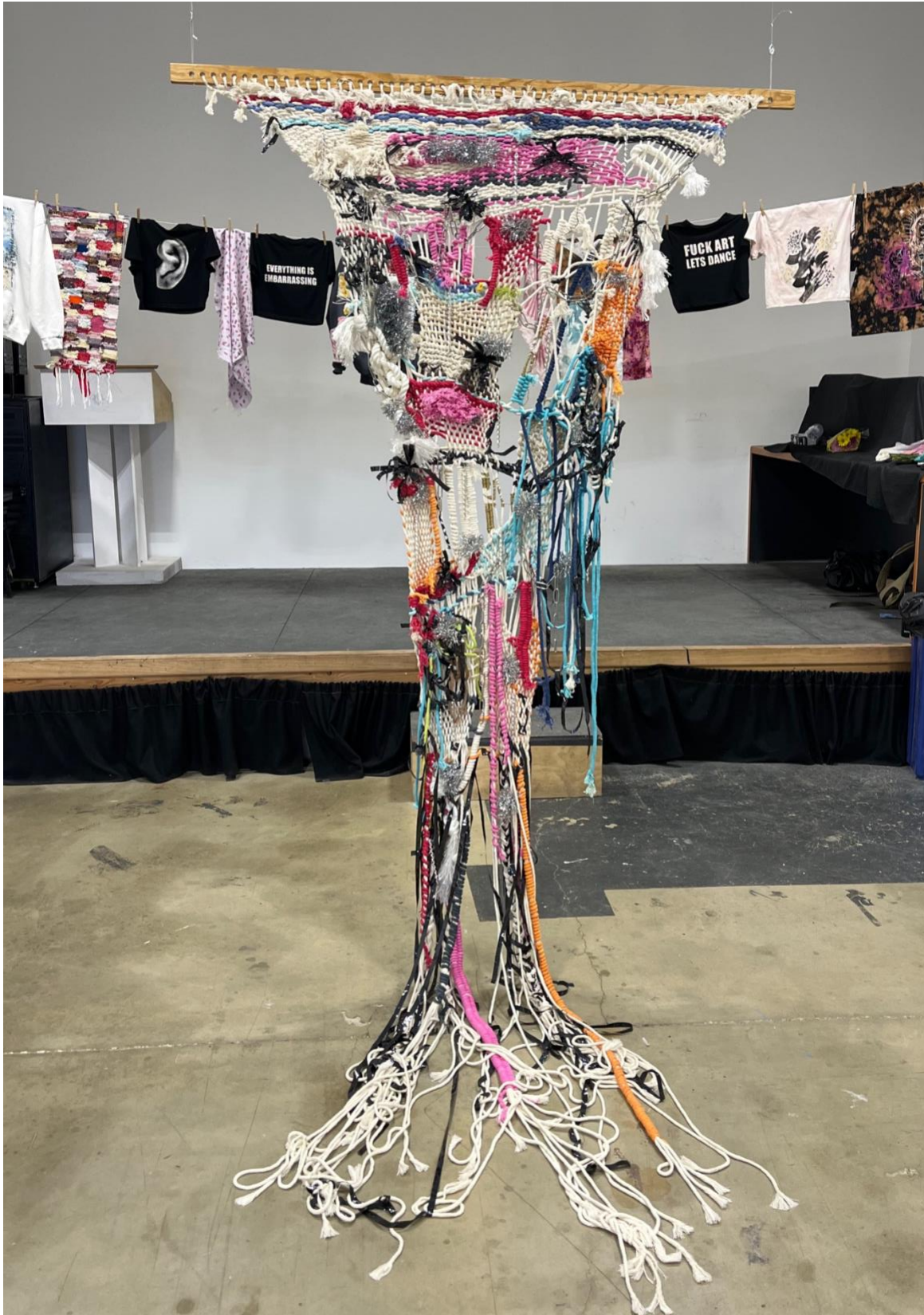
Figure 1: MY BRAIN ON STRING