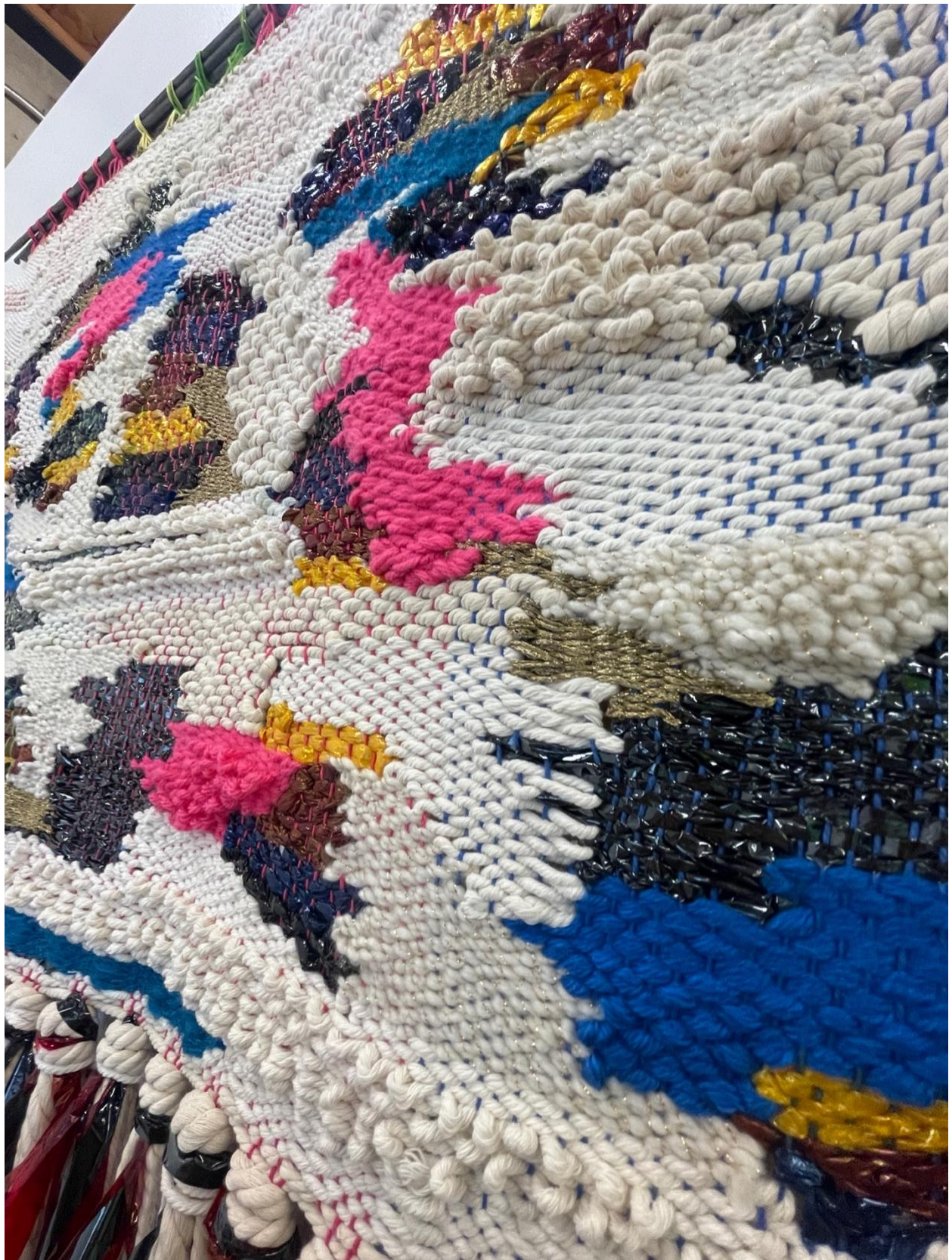
Figure 2: GLITCH (detail)