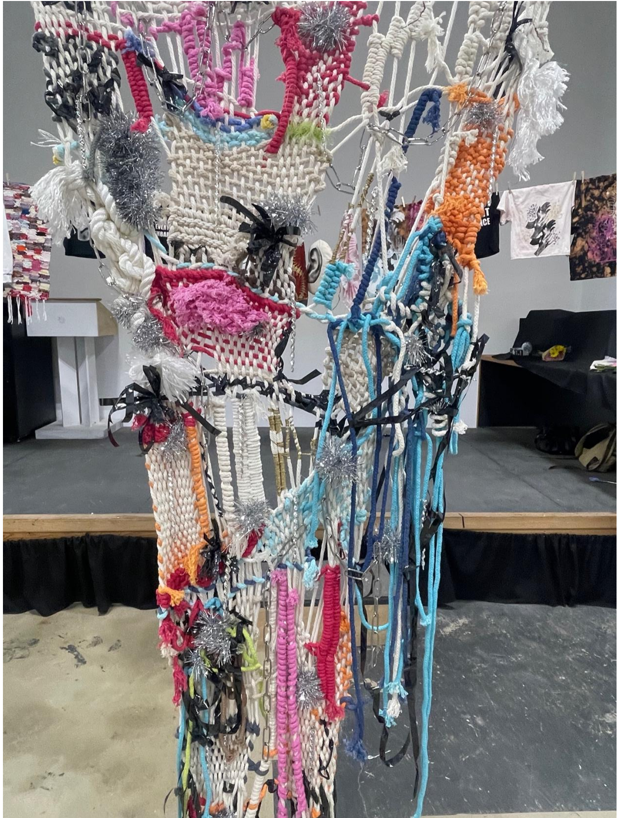
Figure 1: MY BRAIN ON STRING (detail)