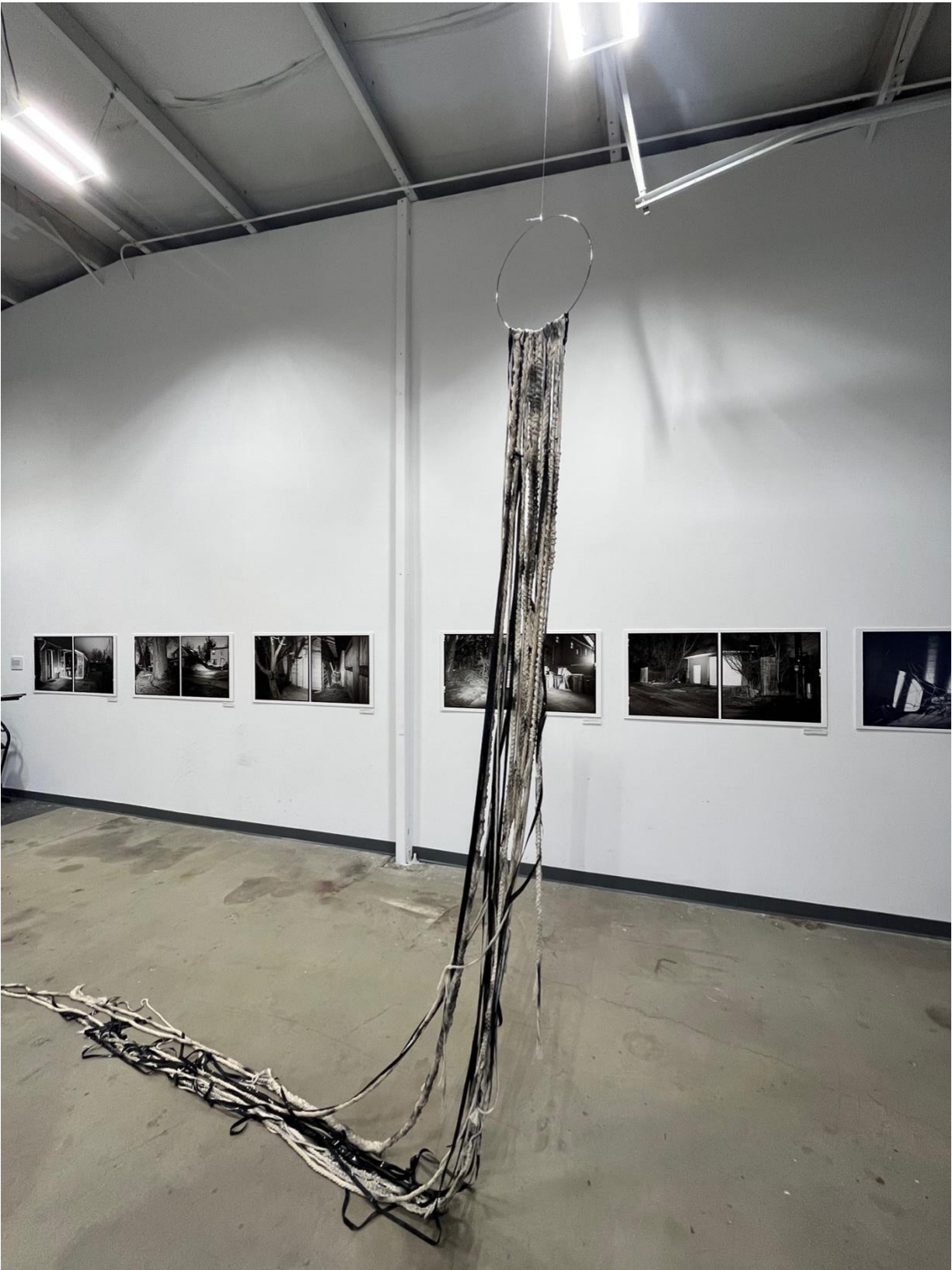
Figure 3: B.O.S. #2