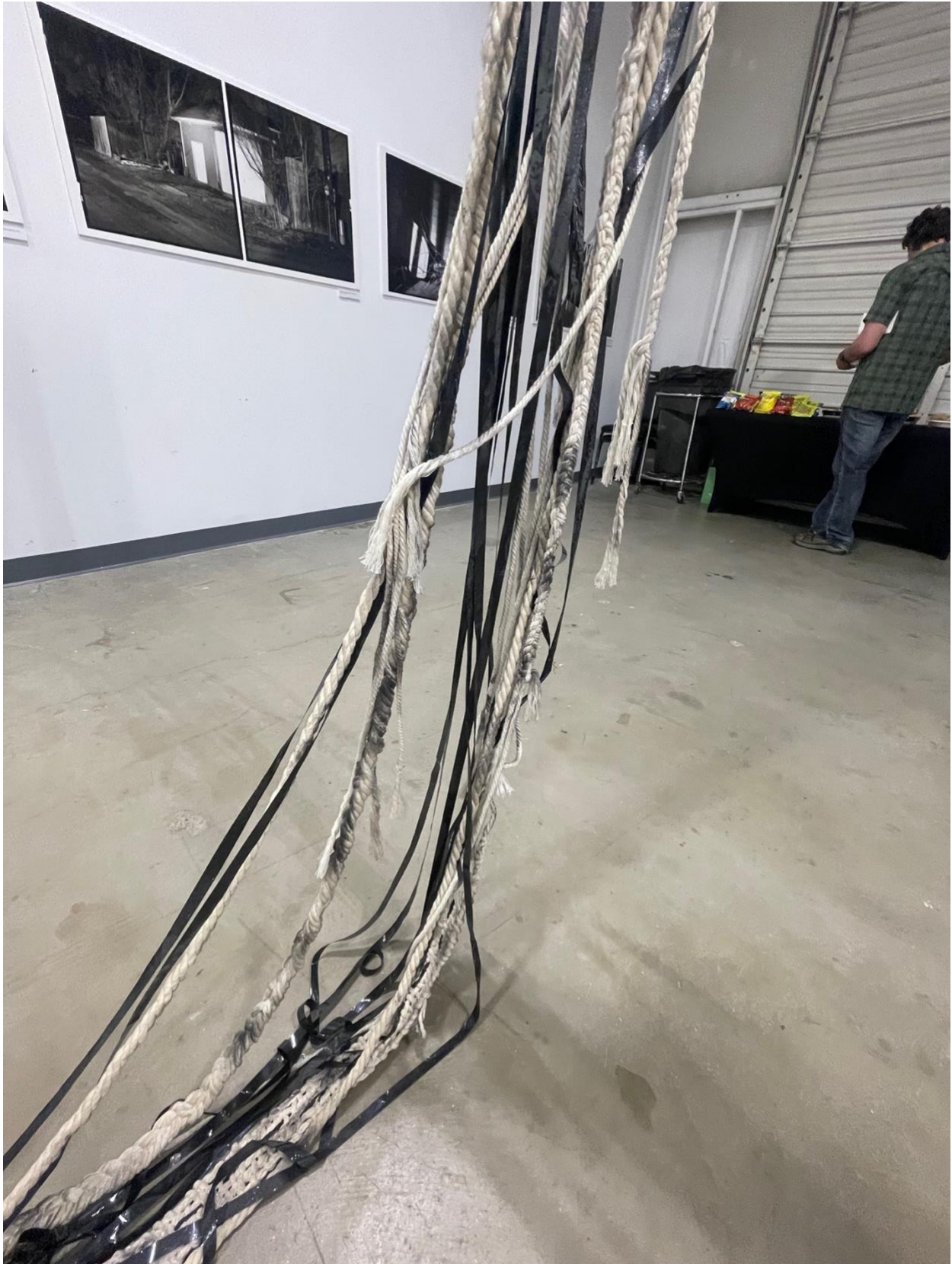
Figure 3: B.O.S. #2 (detail)