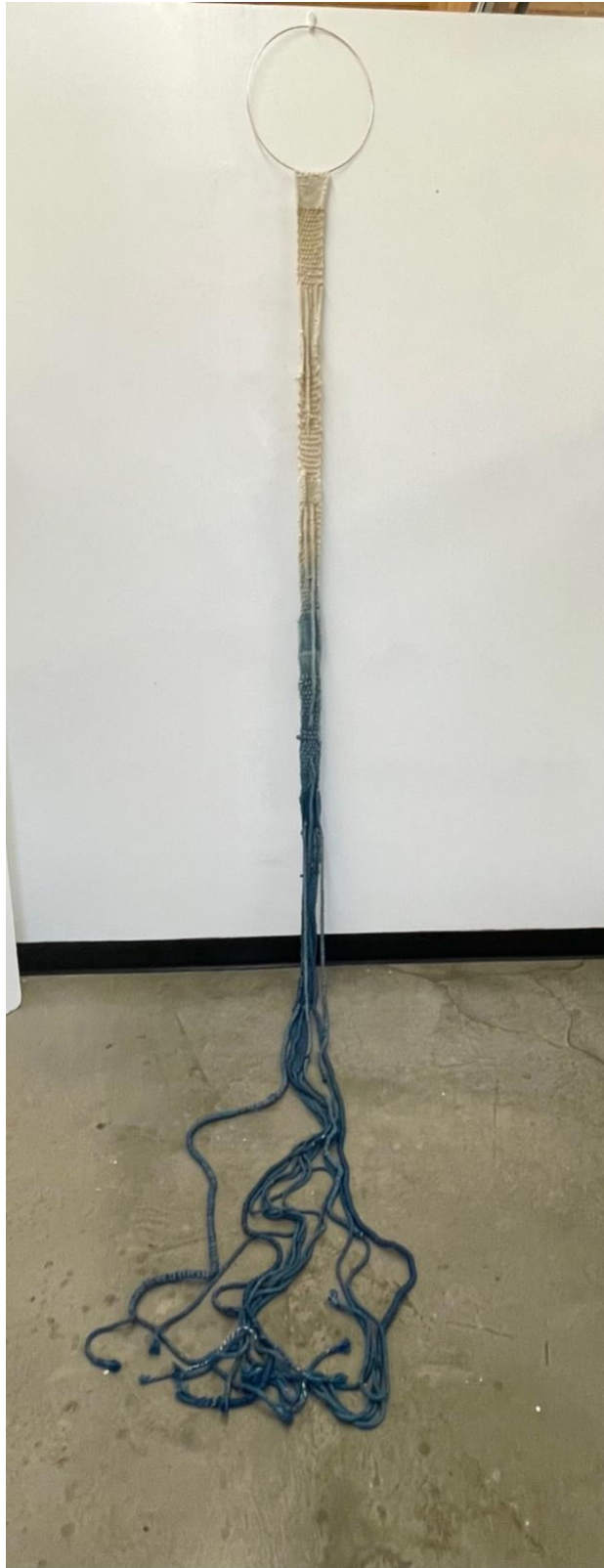
Figure 4: BLUE