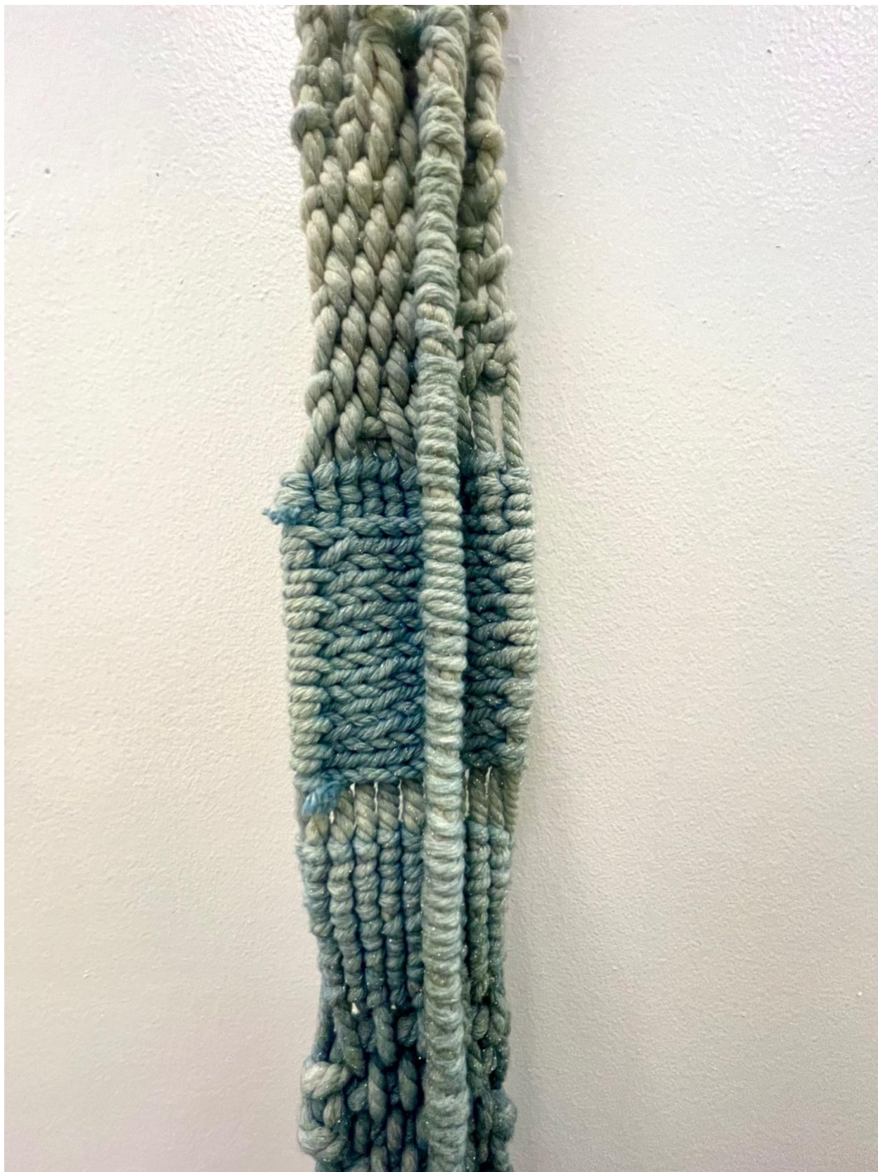
Figure 4: BLUE (detail)