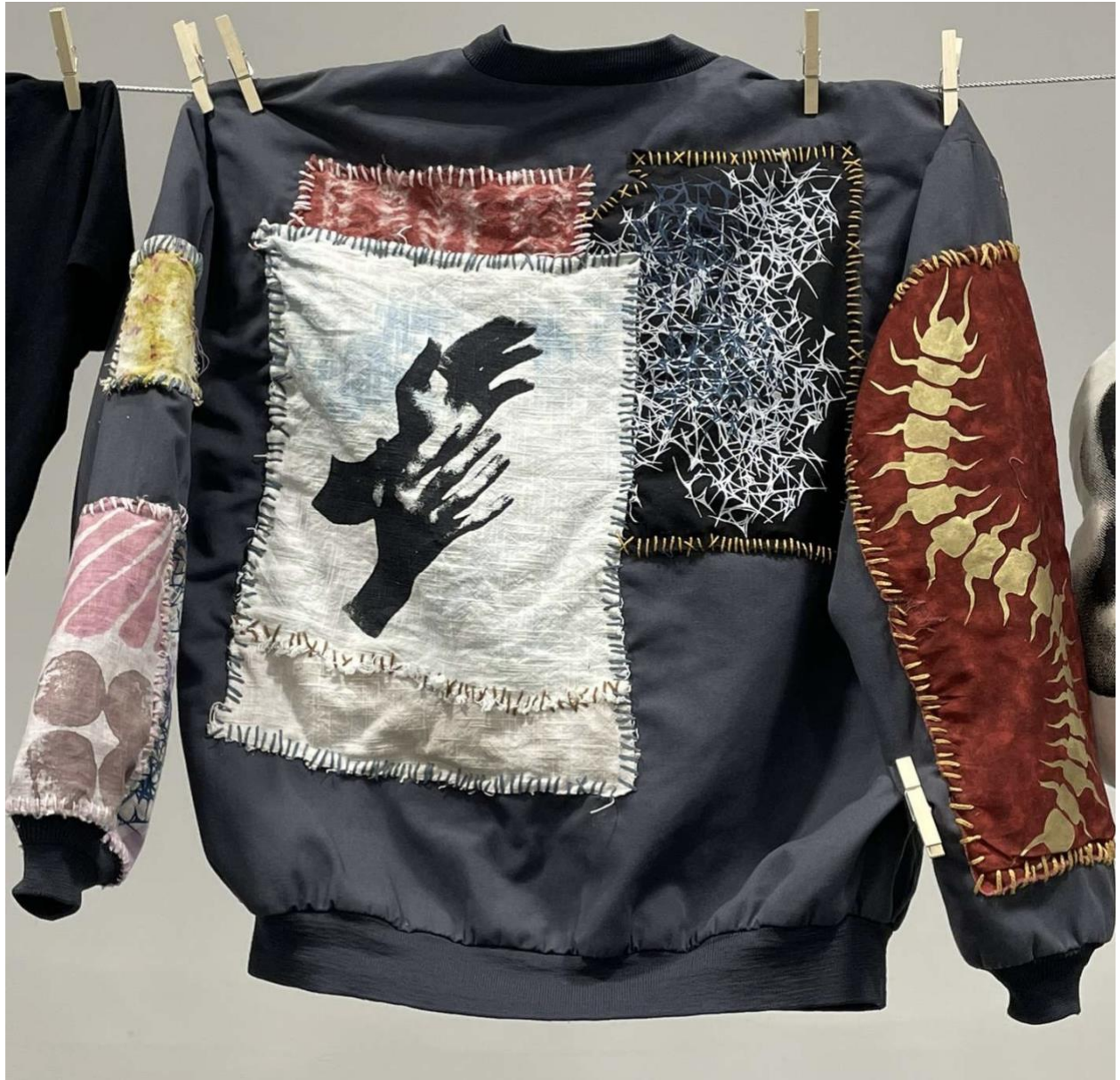
Figure 6: JACKET