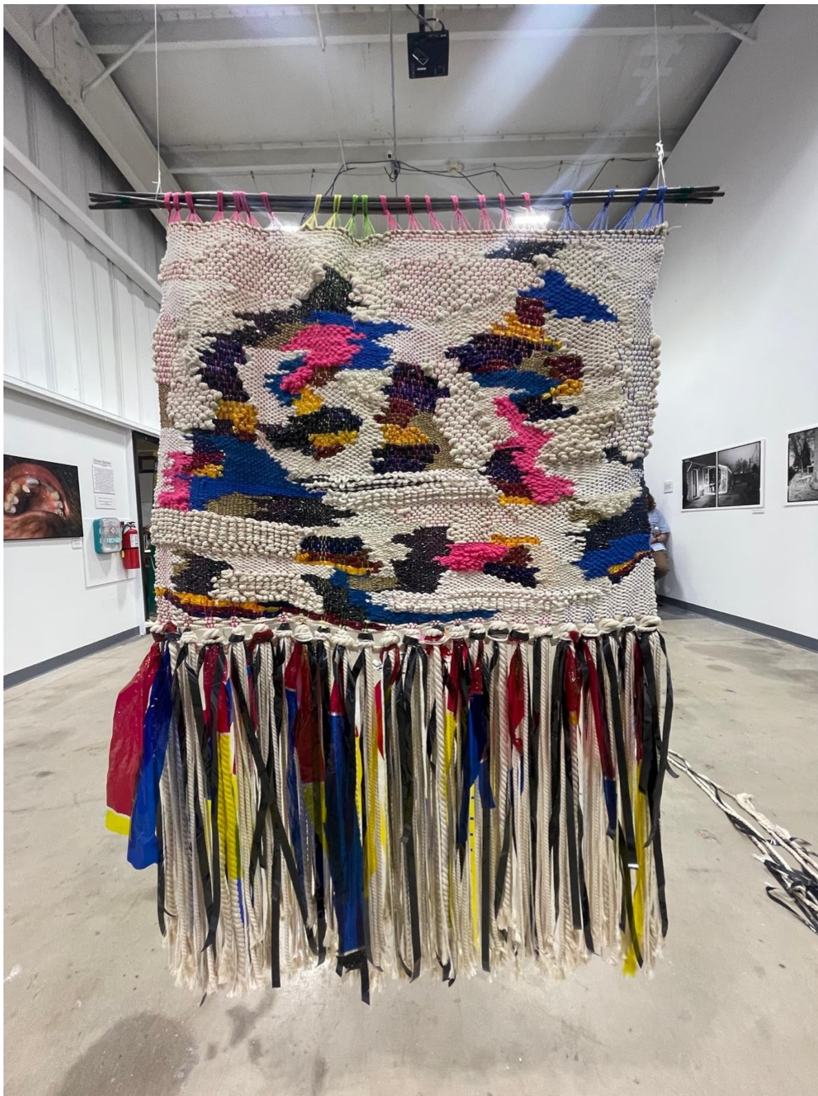
Figure 2: GLITCH