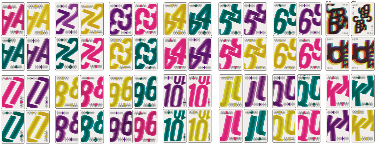
Figure 3: Deck of Cards