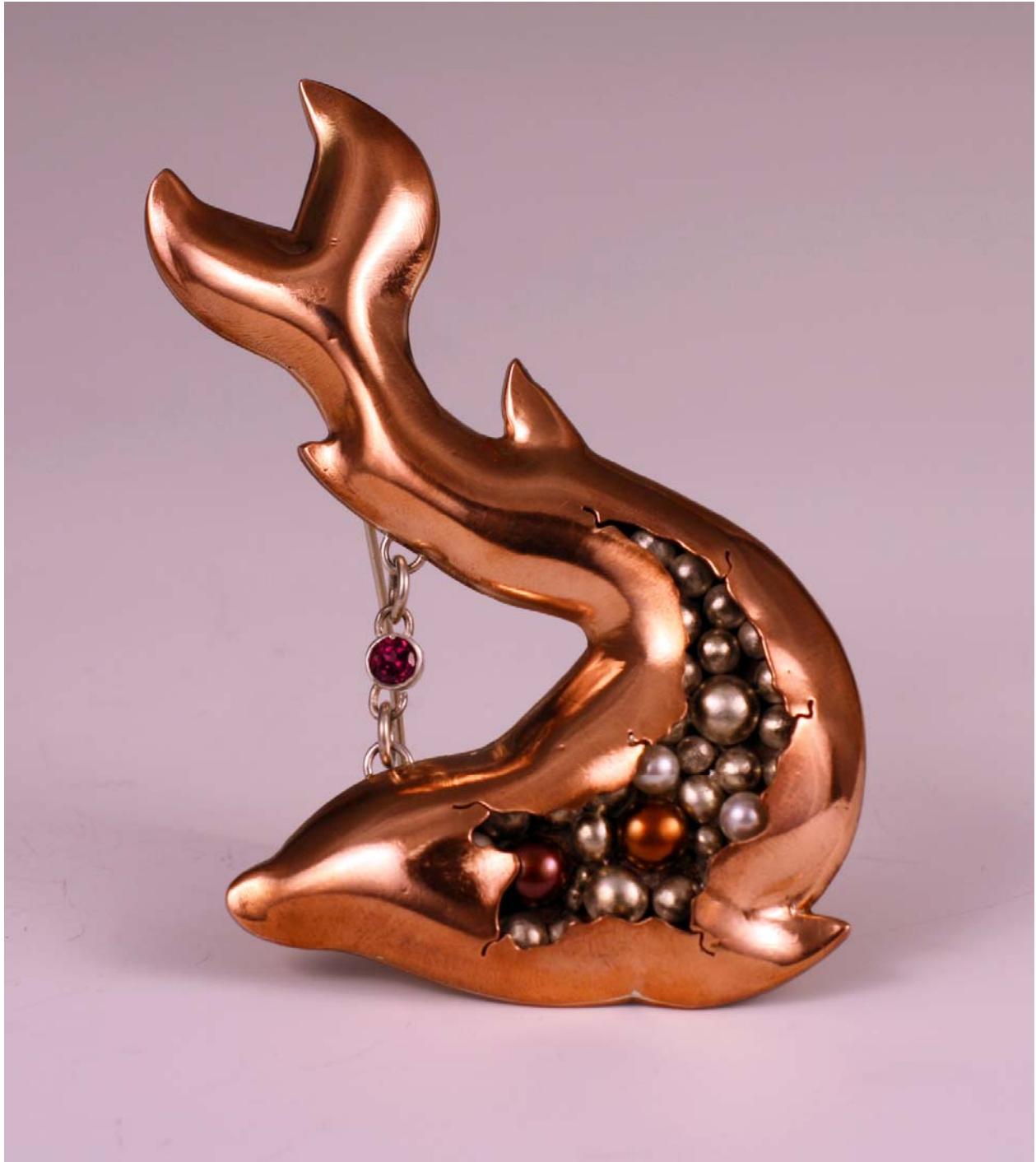
Figure 15: Birth.