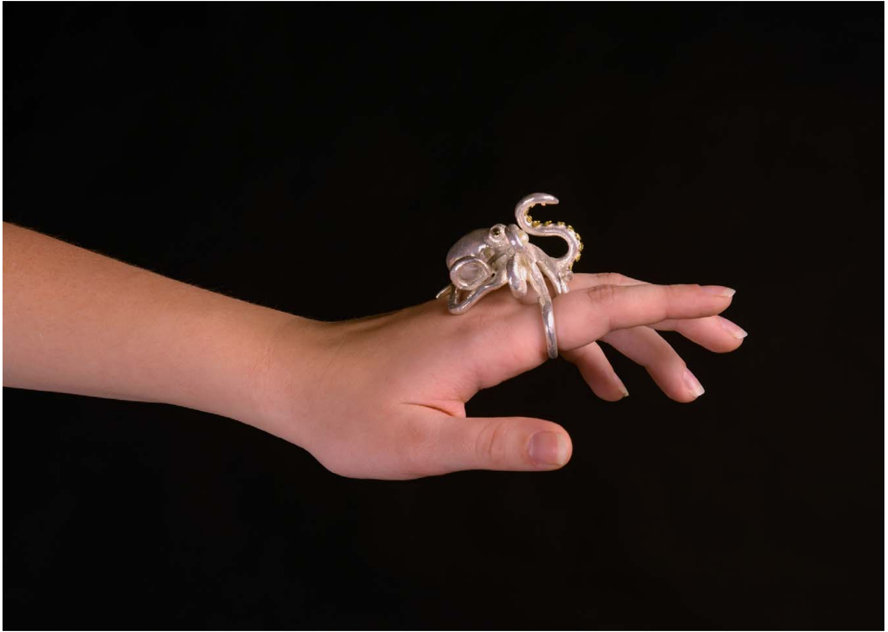
Figure 2: What We Hide Behind (right view).