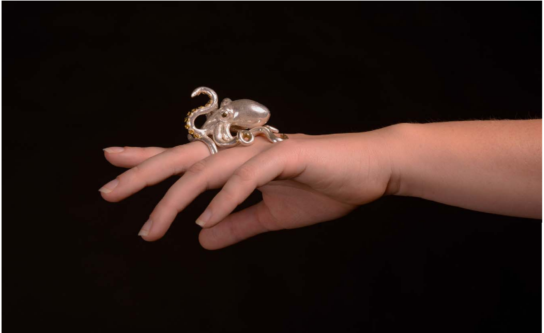
Figure 3: What We Hide Behind (left view).