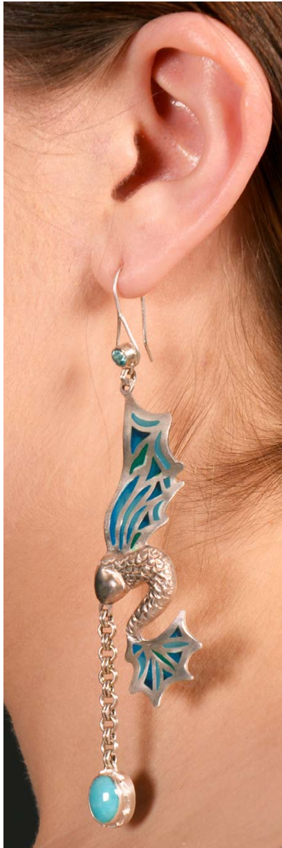
Figure 12: Aqueous Exchange (detail)