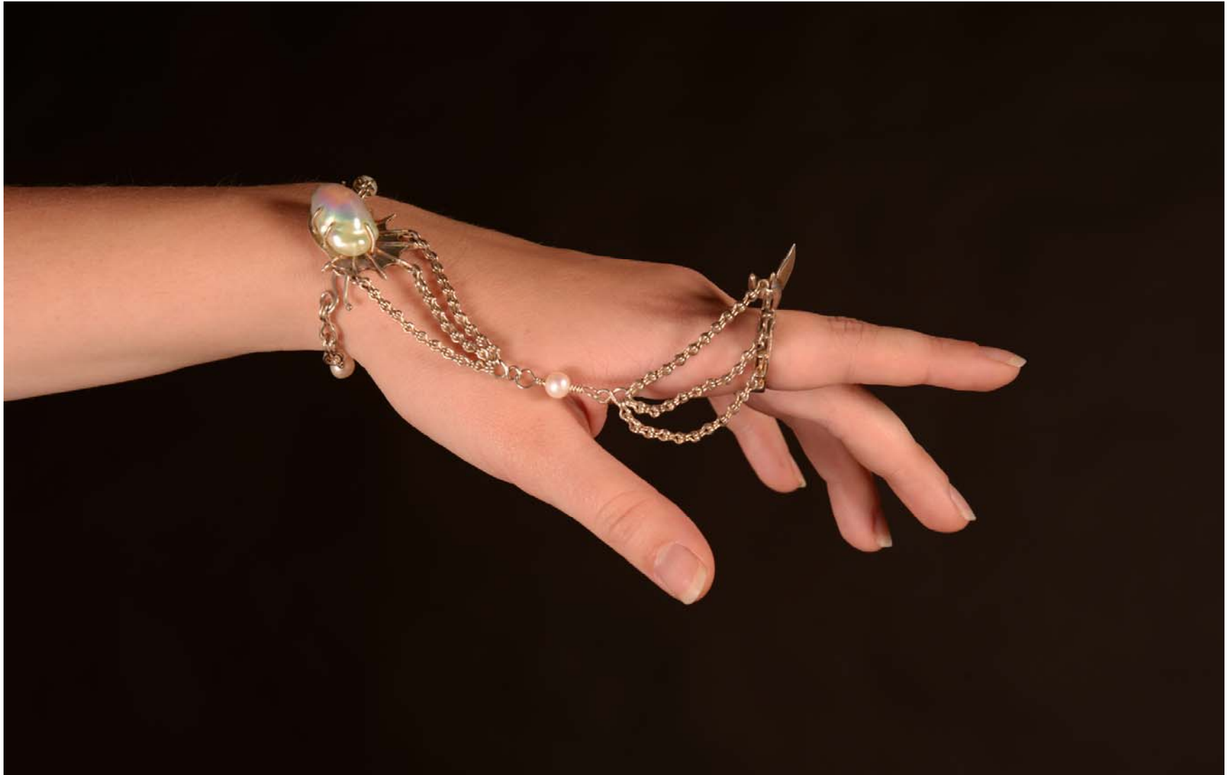
Figure 6: The Ties That Bind (side view).