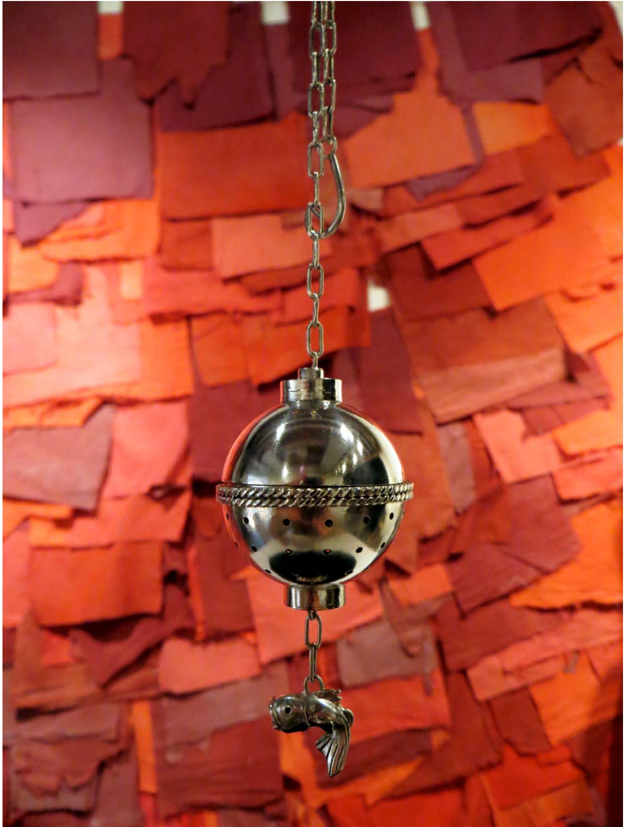
Figure 4: Gone Fishin'.