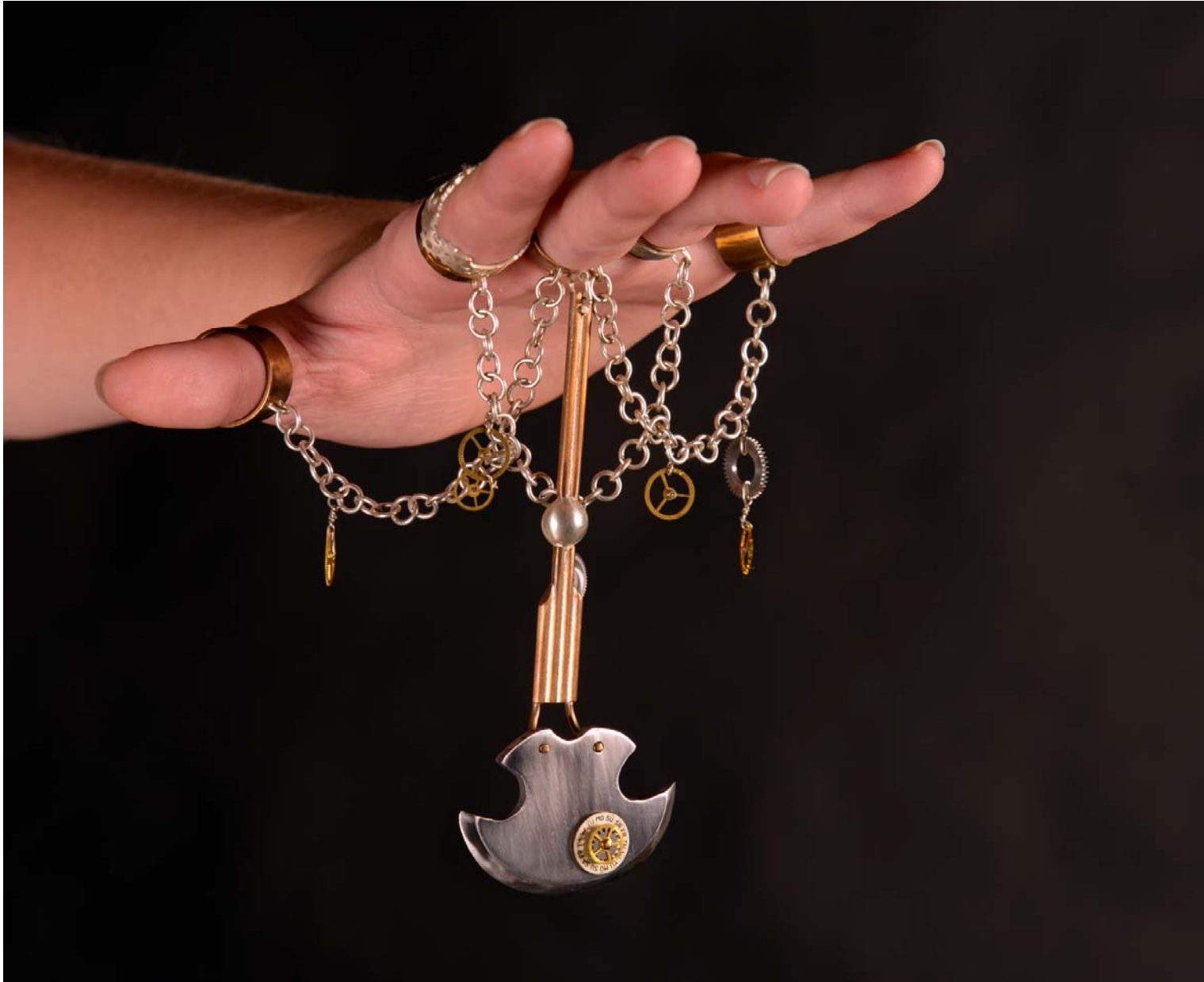
Figure 13: Passage.