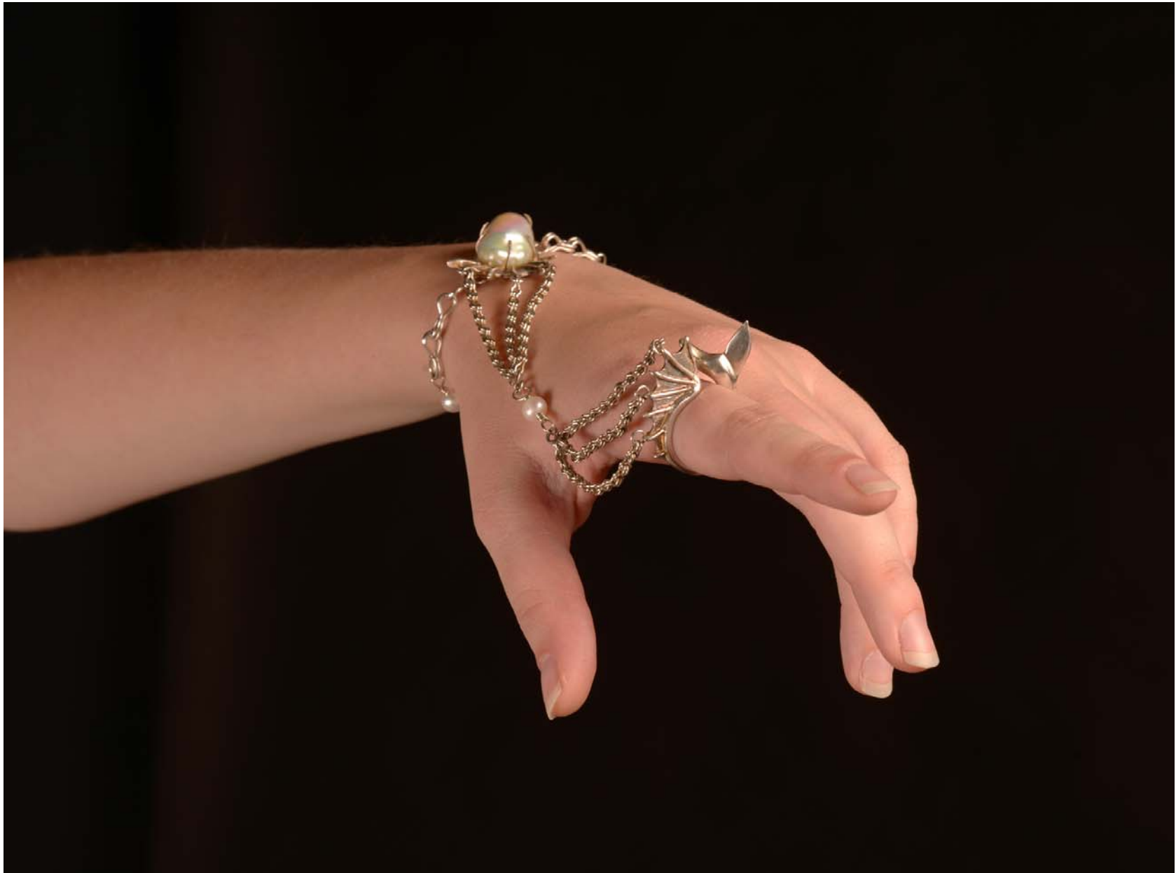
Figure 7: The Ties That Bind (front view).