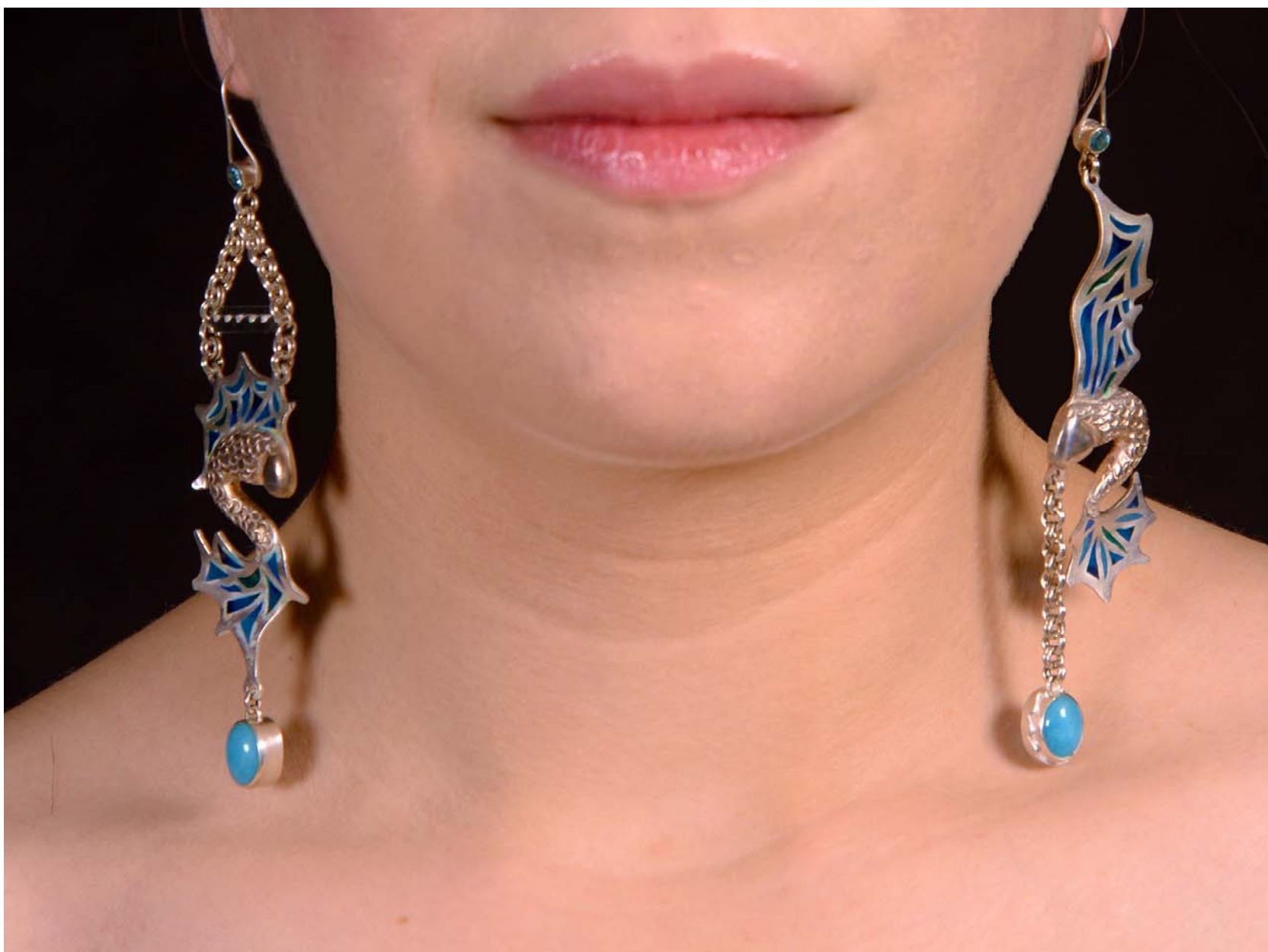
Figure 11: Aqueous Exchange (worn).