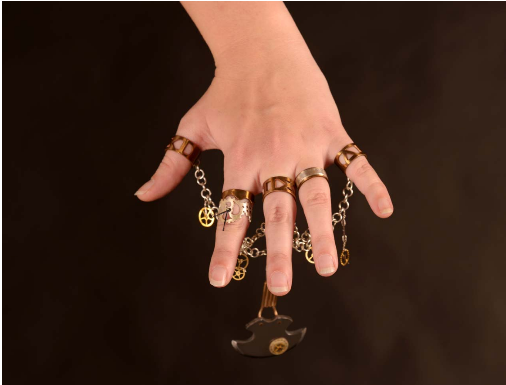
Figure 14: Passage (top view).