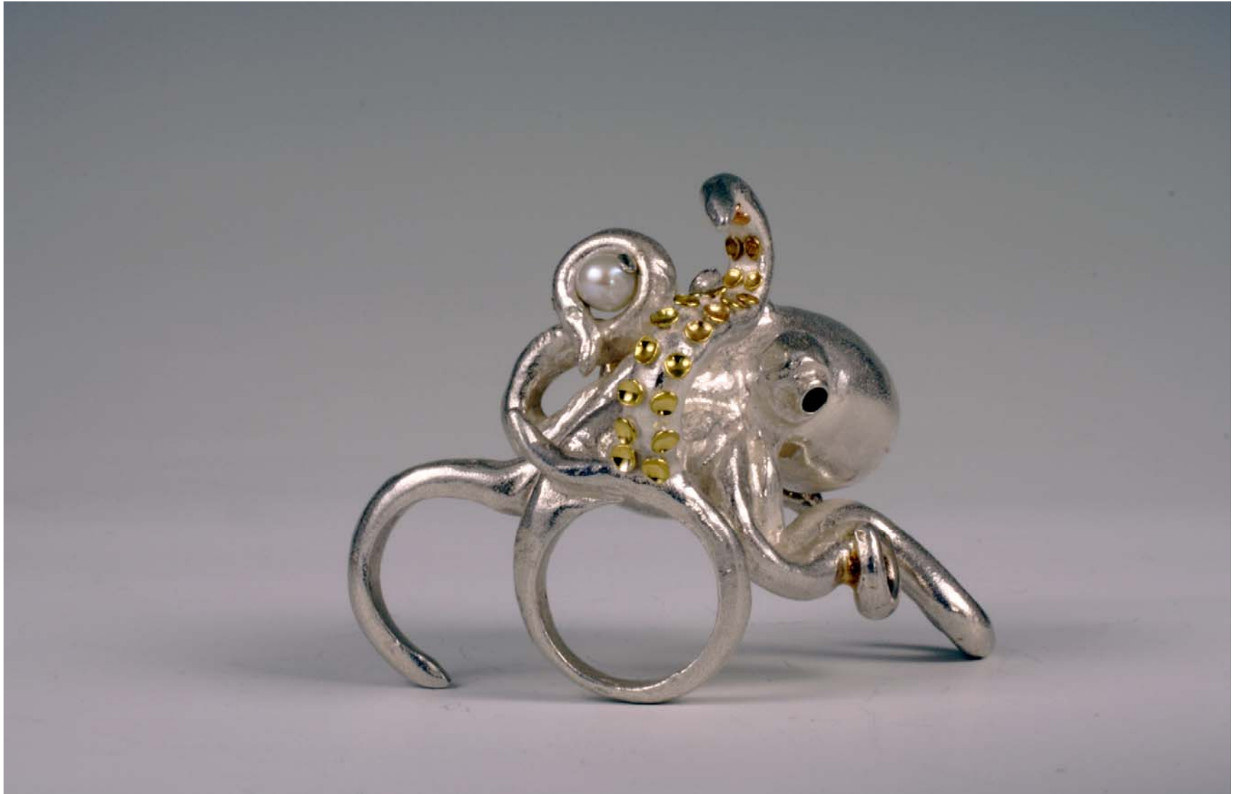
Figure 1: What We Hide Behind.