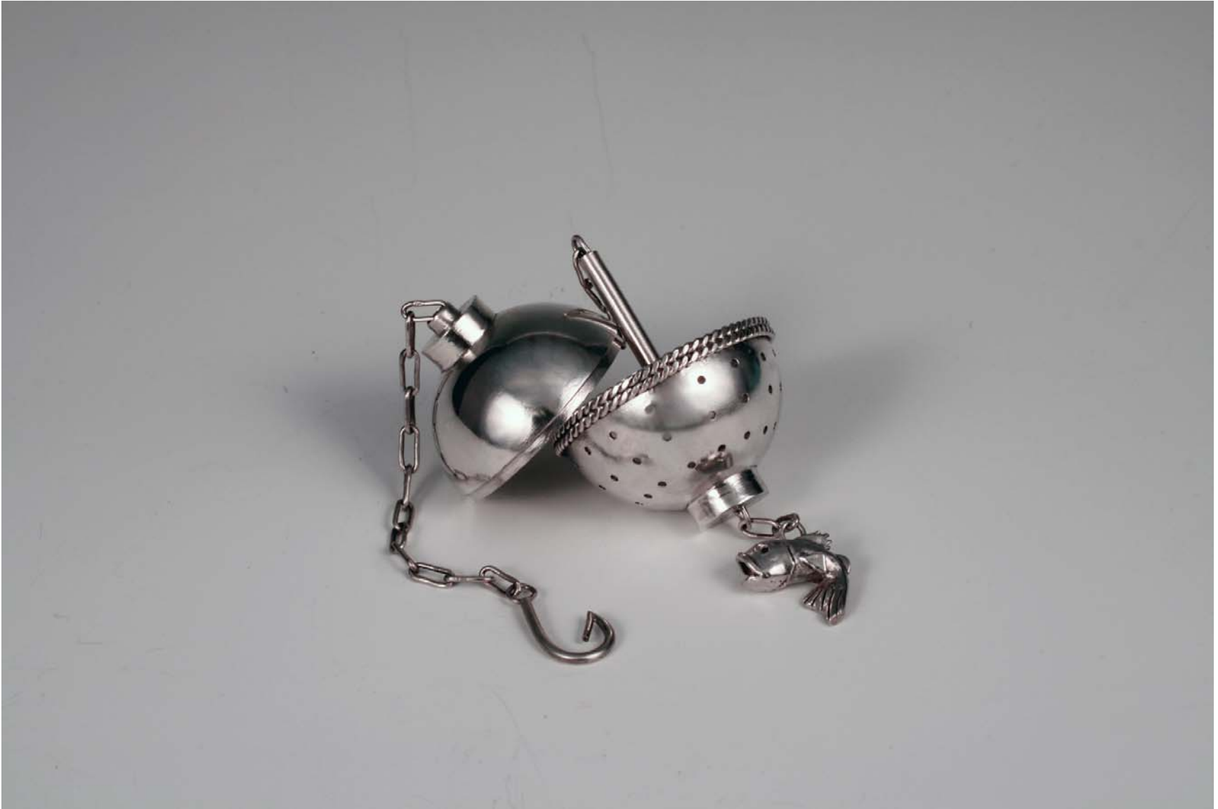
Figure 5: Gone Fishin' (open view).