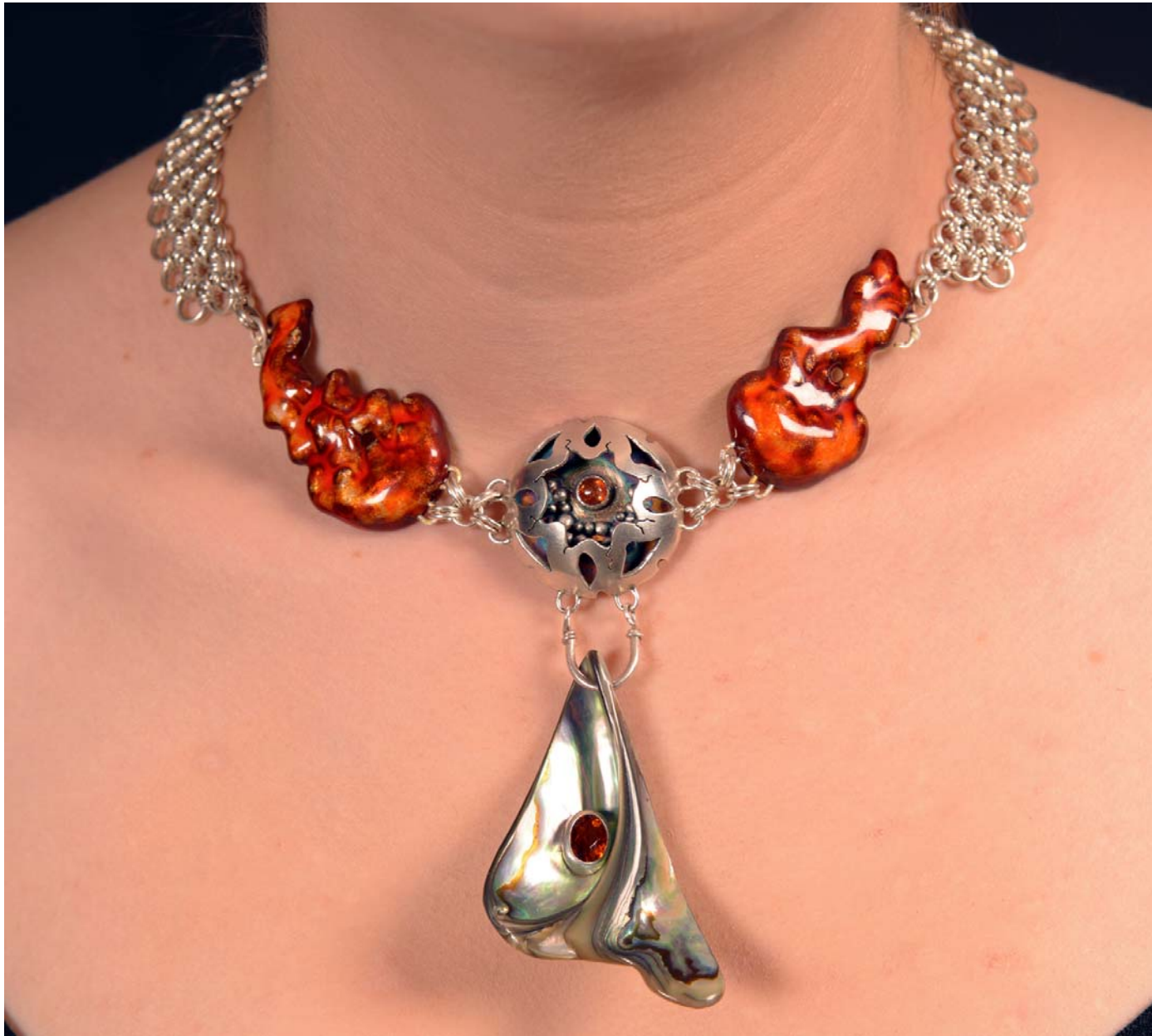
Figure 8: Paradoxical Paragon.