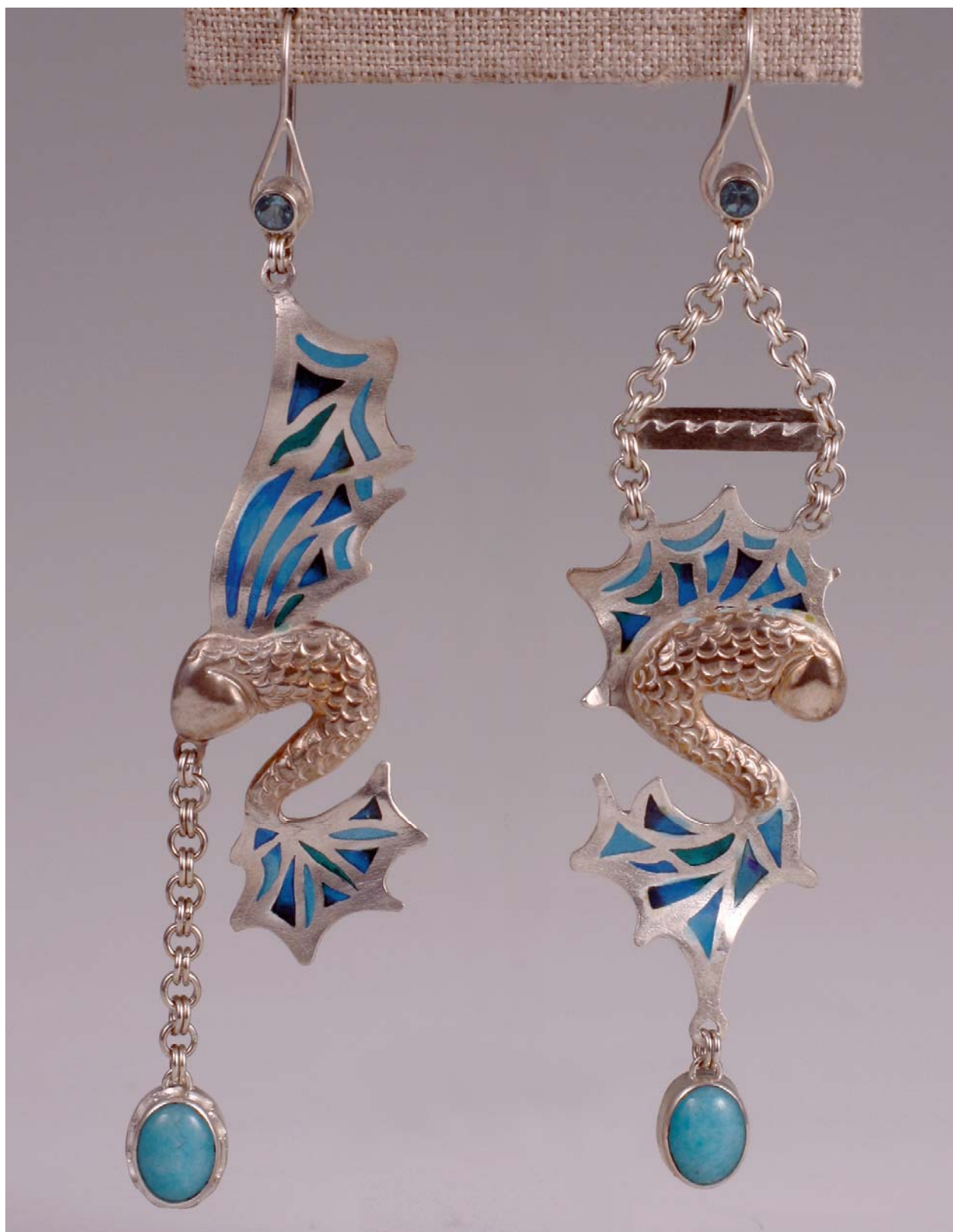
Figure 10: Aqueous Exchange.