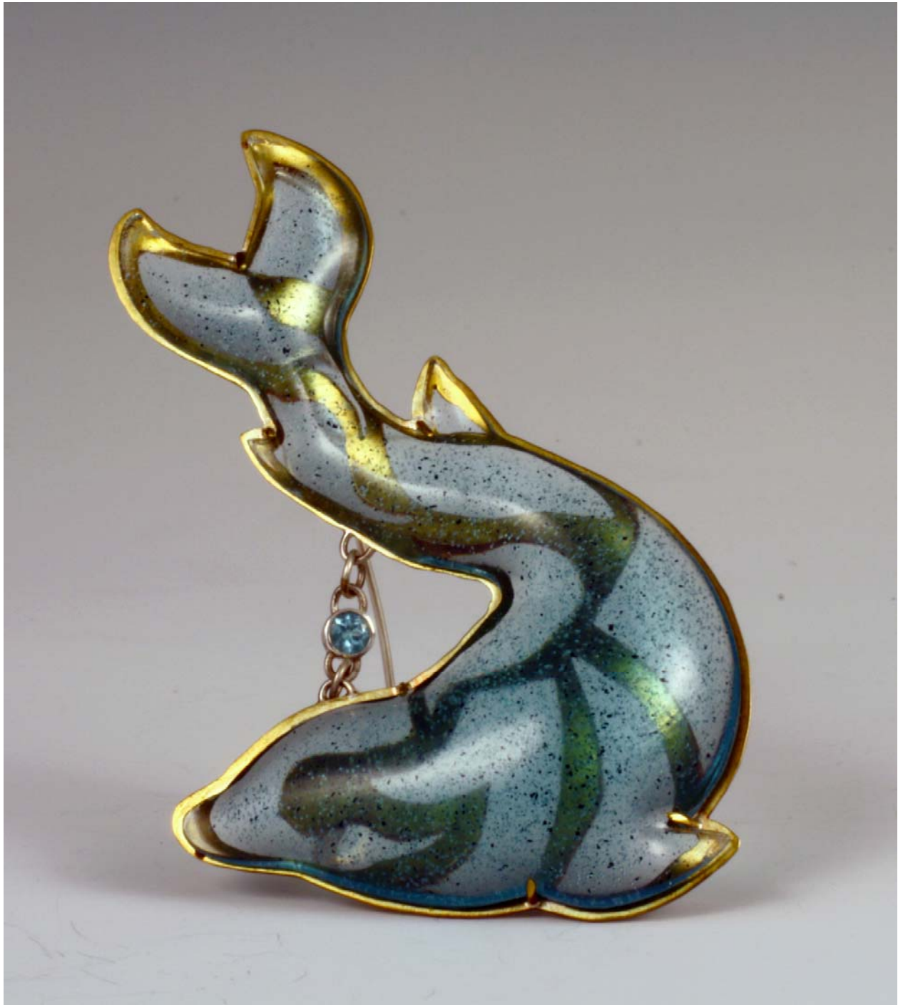
Figure 16: ReBirth.