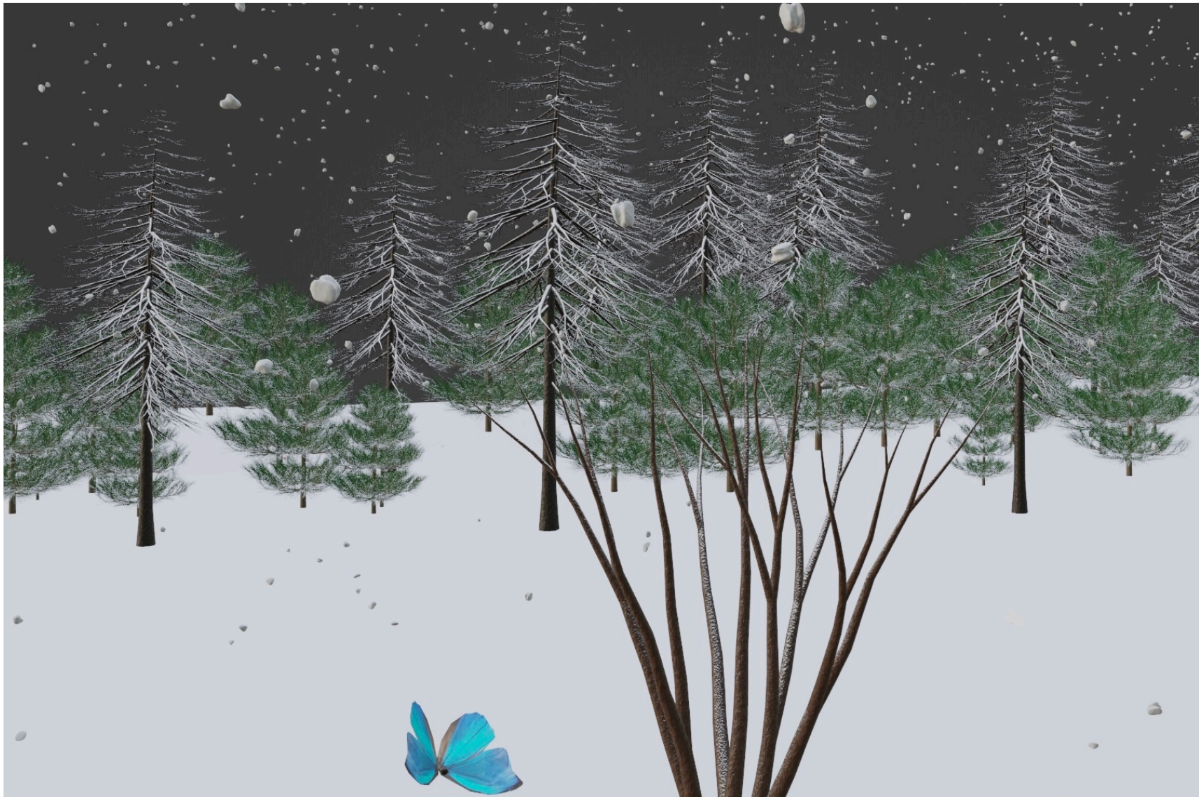
Video 1: Snow Butterfly: https://youtu.be/djp3C0l8JYI?si=o53kaoT9M4pnbi-g