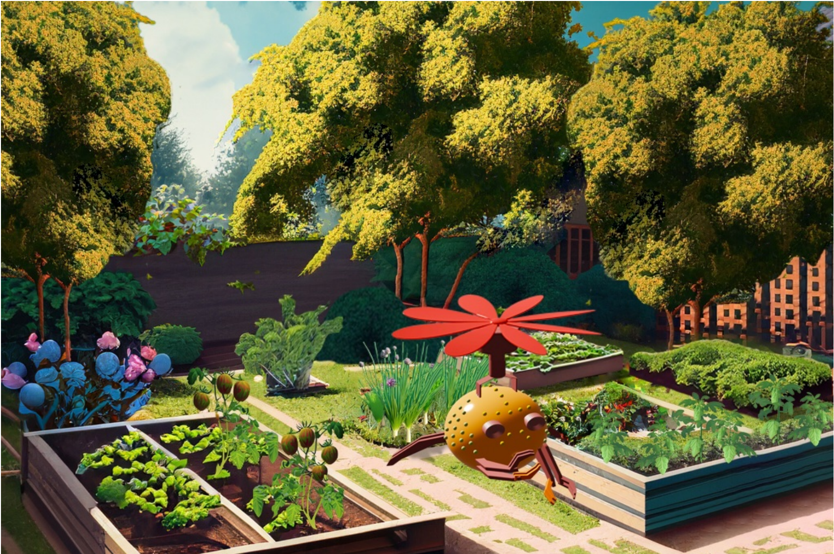
Figure 5: Clementine Garden