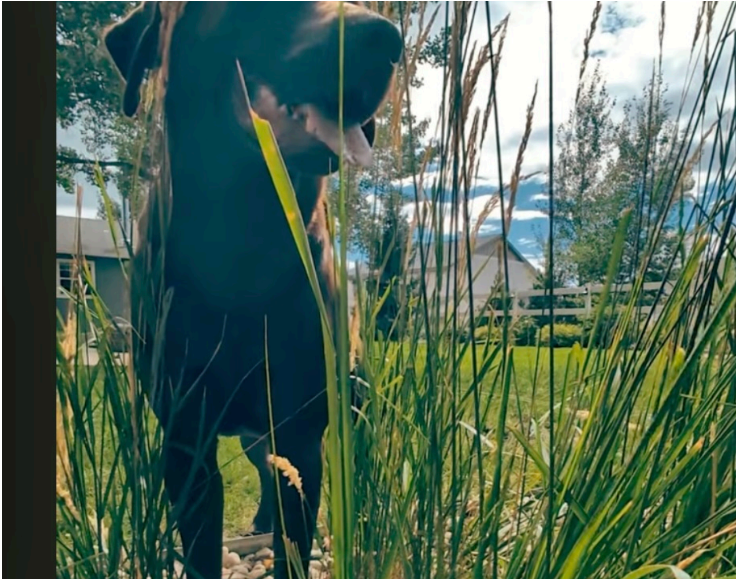
Video 2: The Hunt: https://youtube.com/shorts/qxu3_UR-ORk?si=krqz-sltle32_5JY