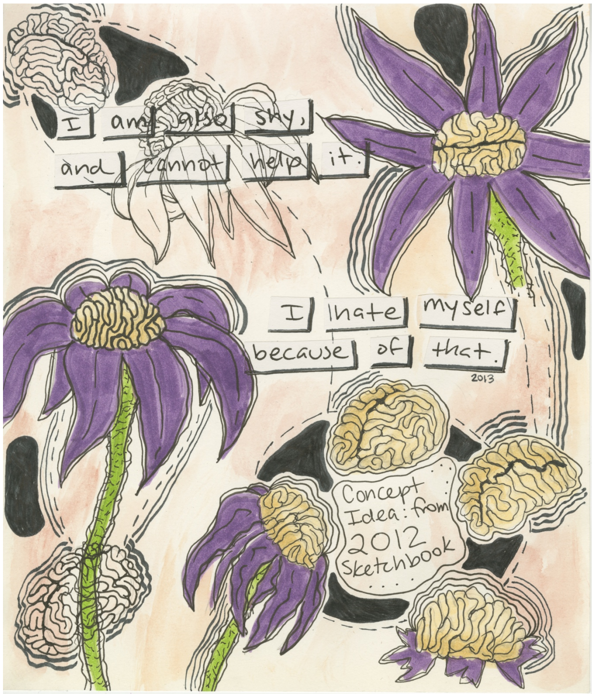
Figure 7: Illustration In "A Mental Sketchbook"