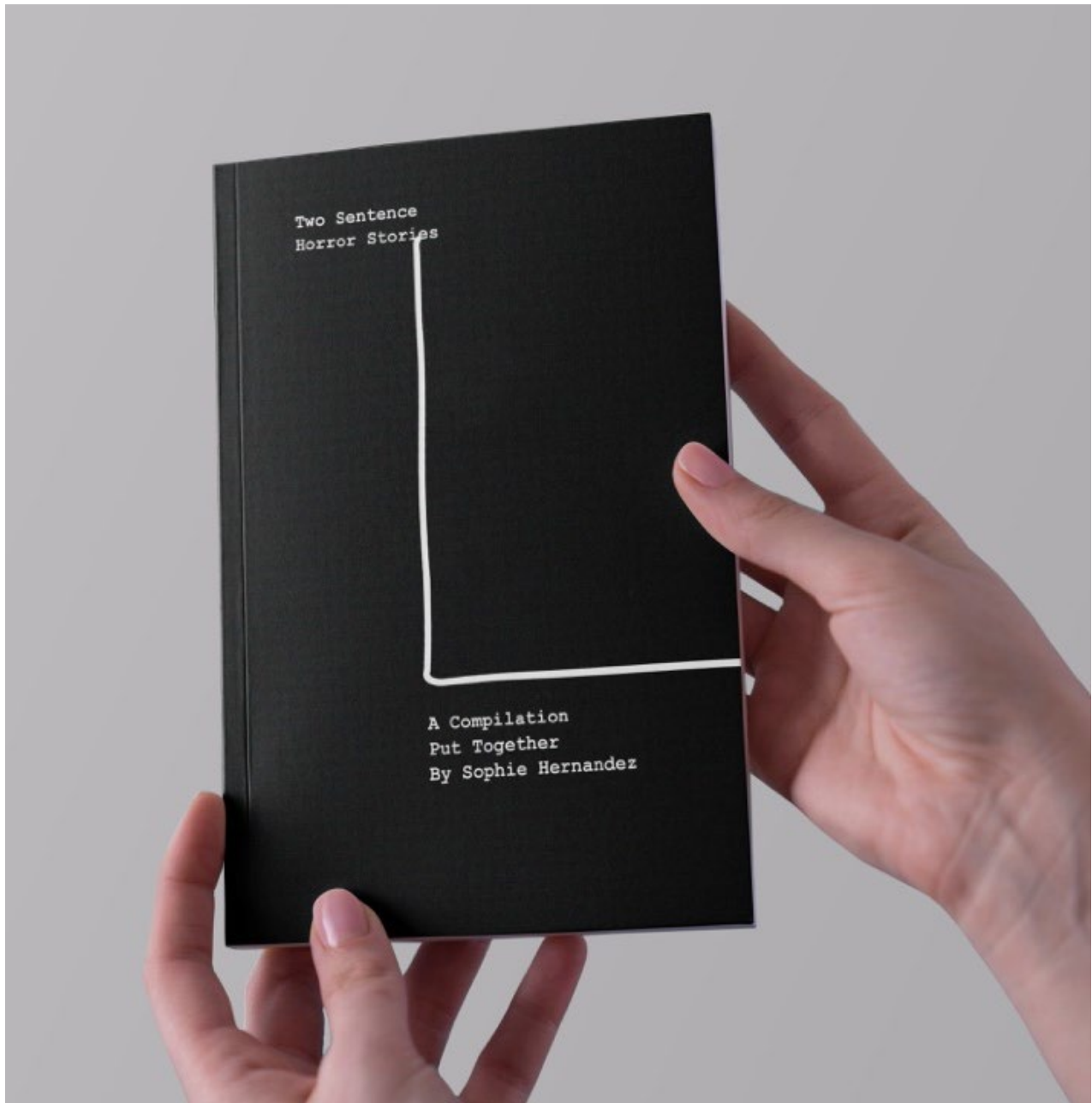
Figure 3: Two Sentence Horror Story Book Creation