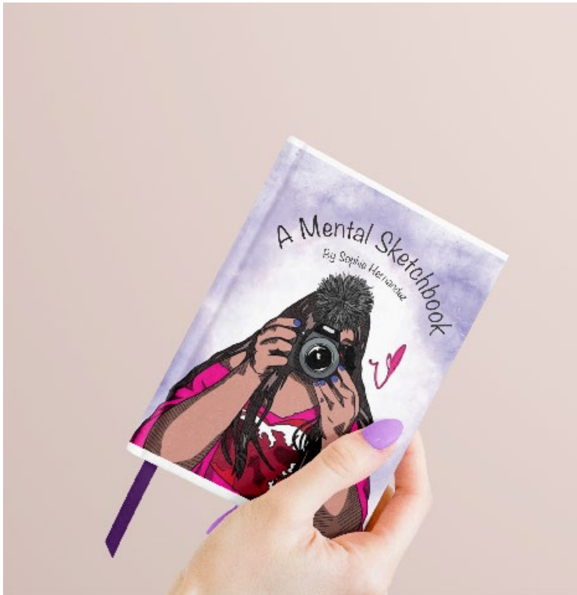
Figure 6: A Mental Sketchbook Book Creation