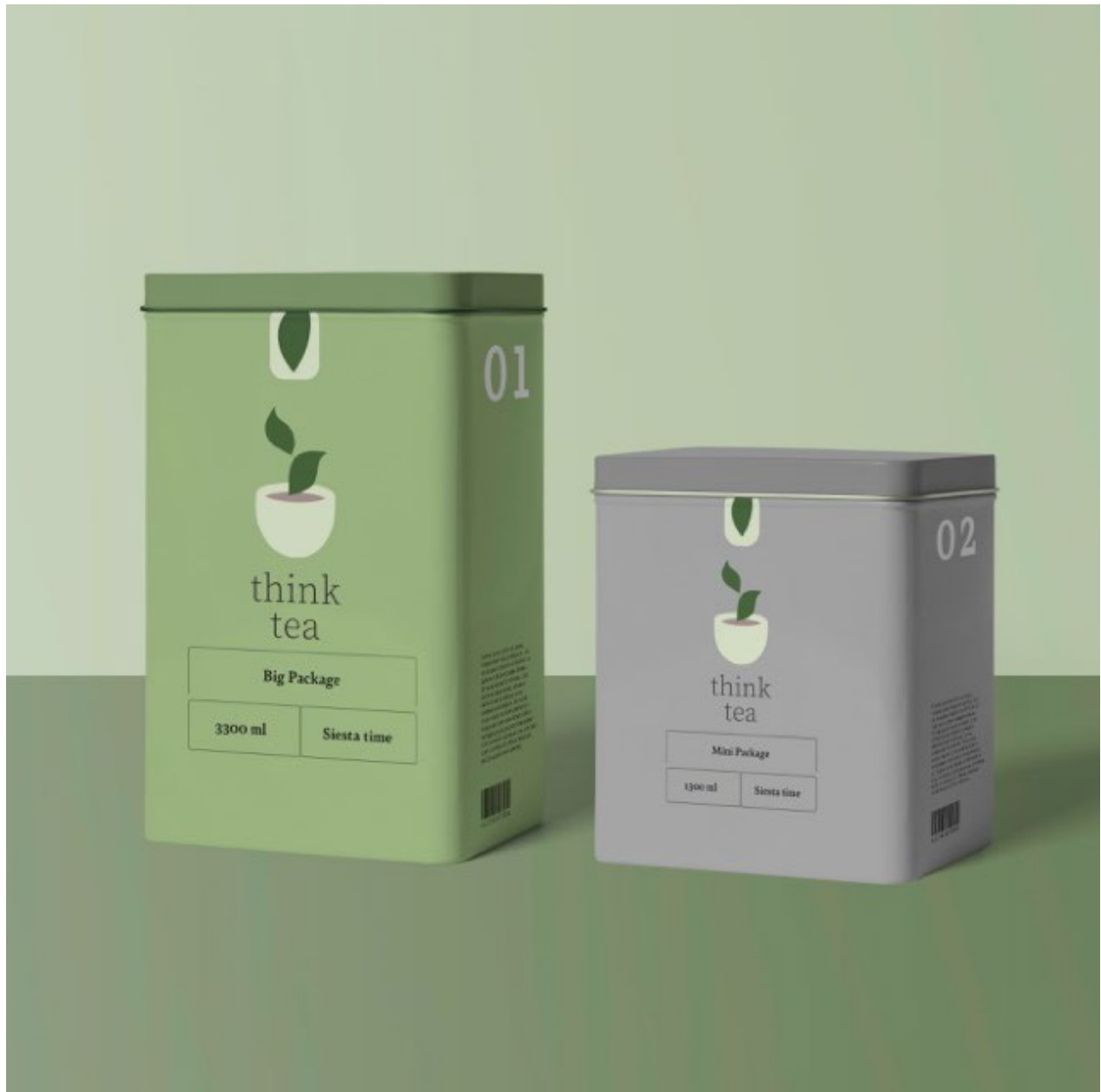
Figure 2: Think Tea Brand